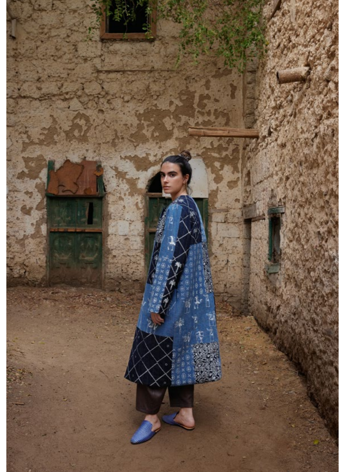
Patch Work Mix Denim Collarless Coat - Mix Prints