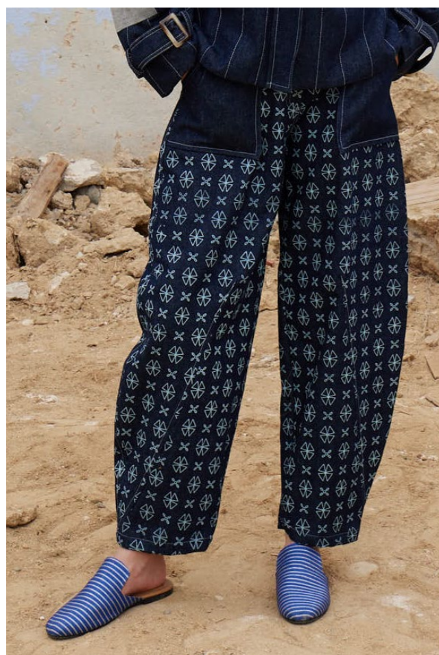
Navy Blue Balloon Denim - Stars Print