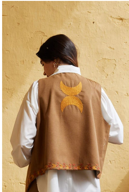
Havan Crescent Embroidered - Gilet