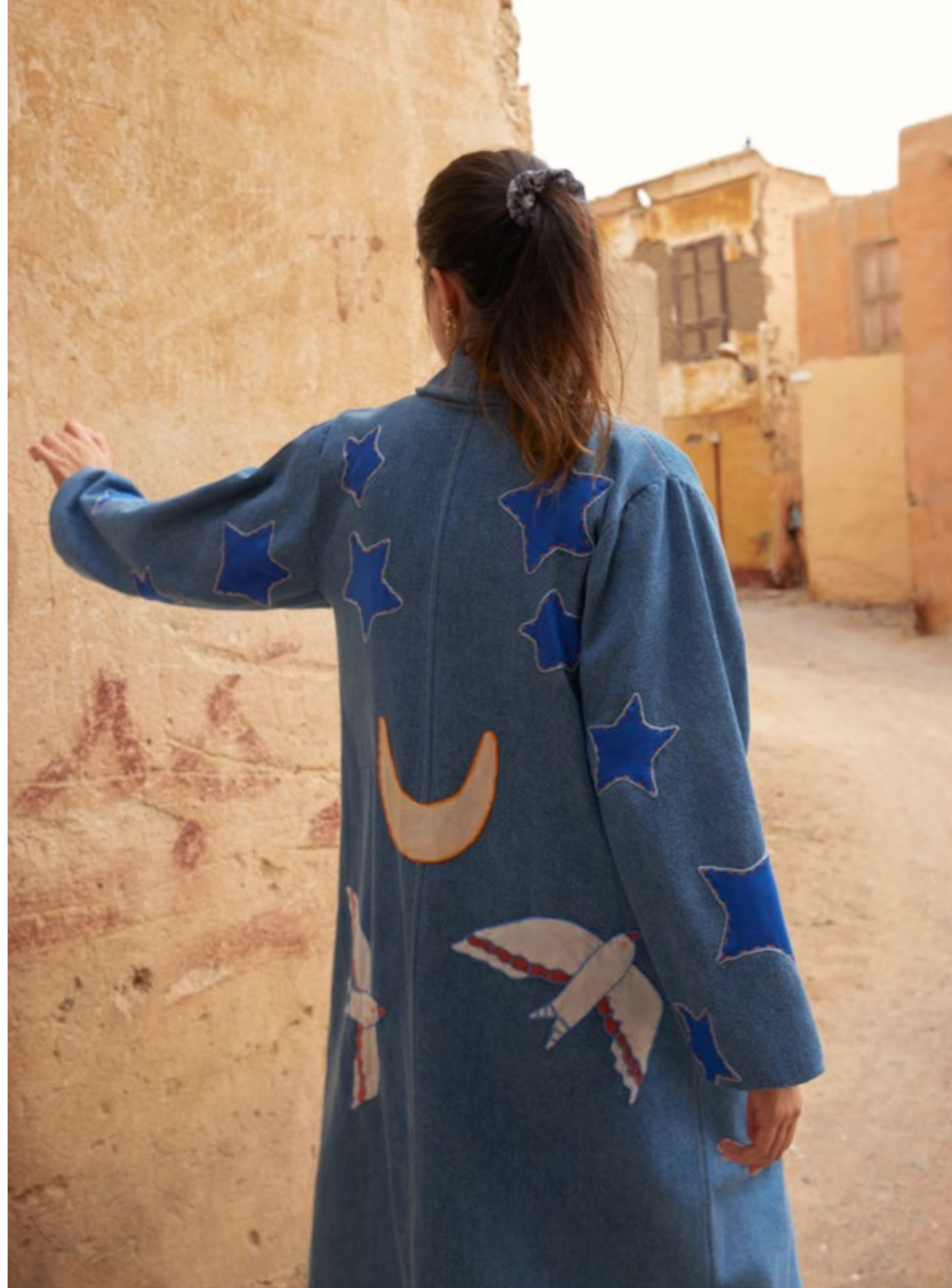
Blue Denim Shawl Collar Coat - Stars print