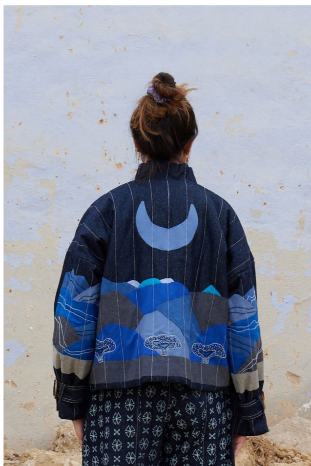
Navy Blue Denim Short Jacket - Mountains Fabric Applique