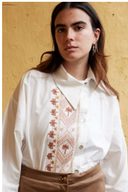
White Shifted Placket Shirt - Havan Bab Border Embroidered