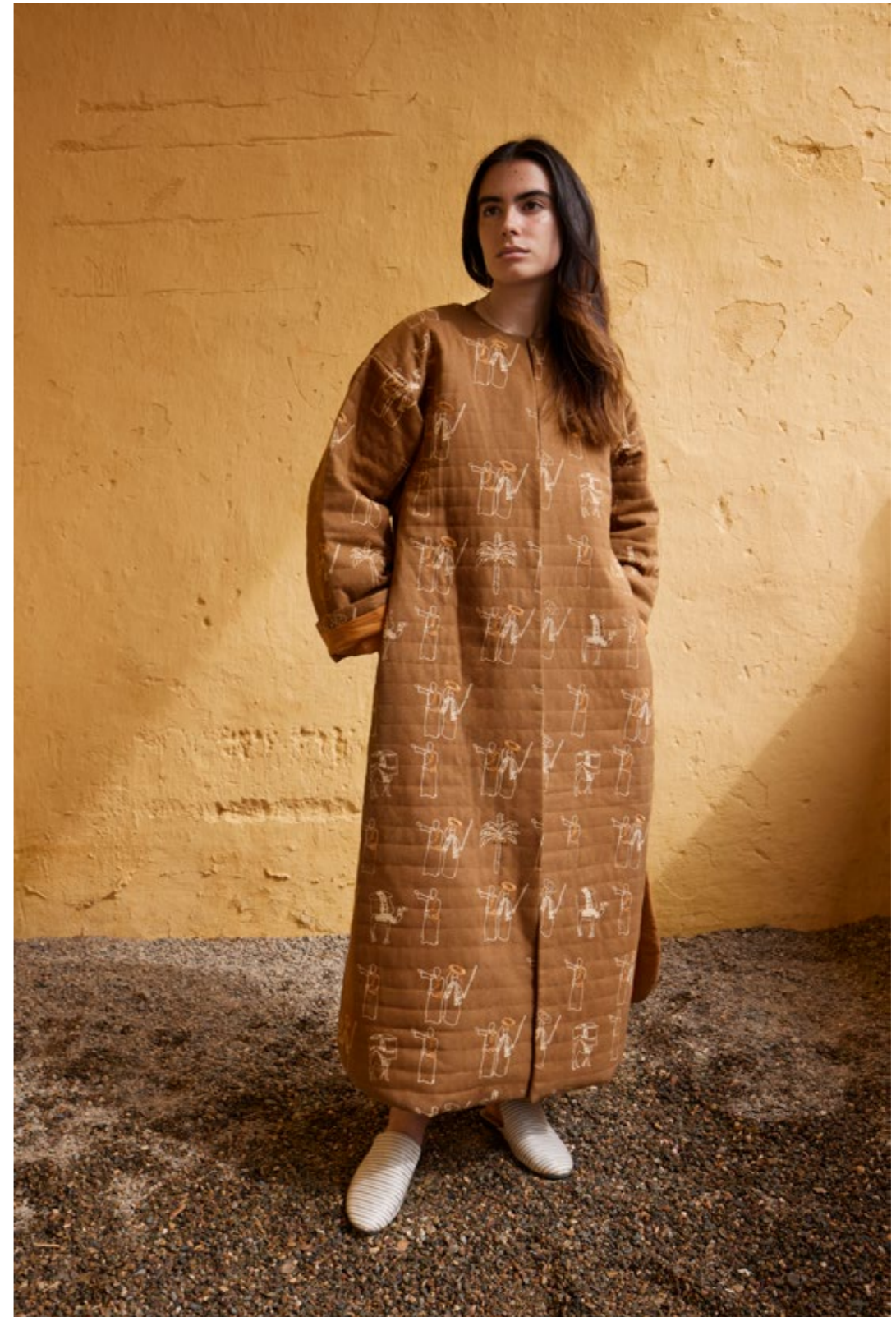
Havan Collarless Coat - Ababda Print