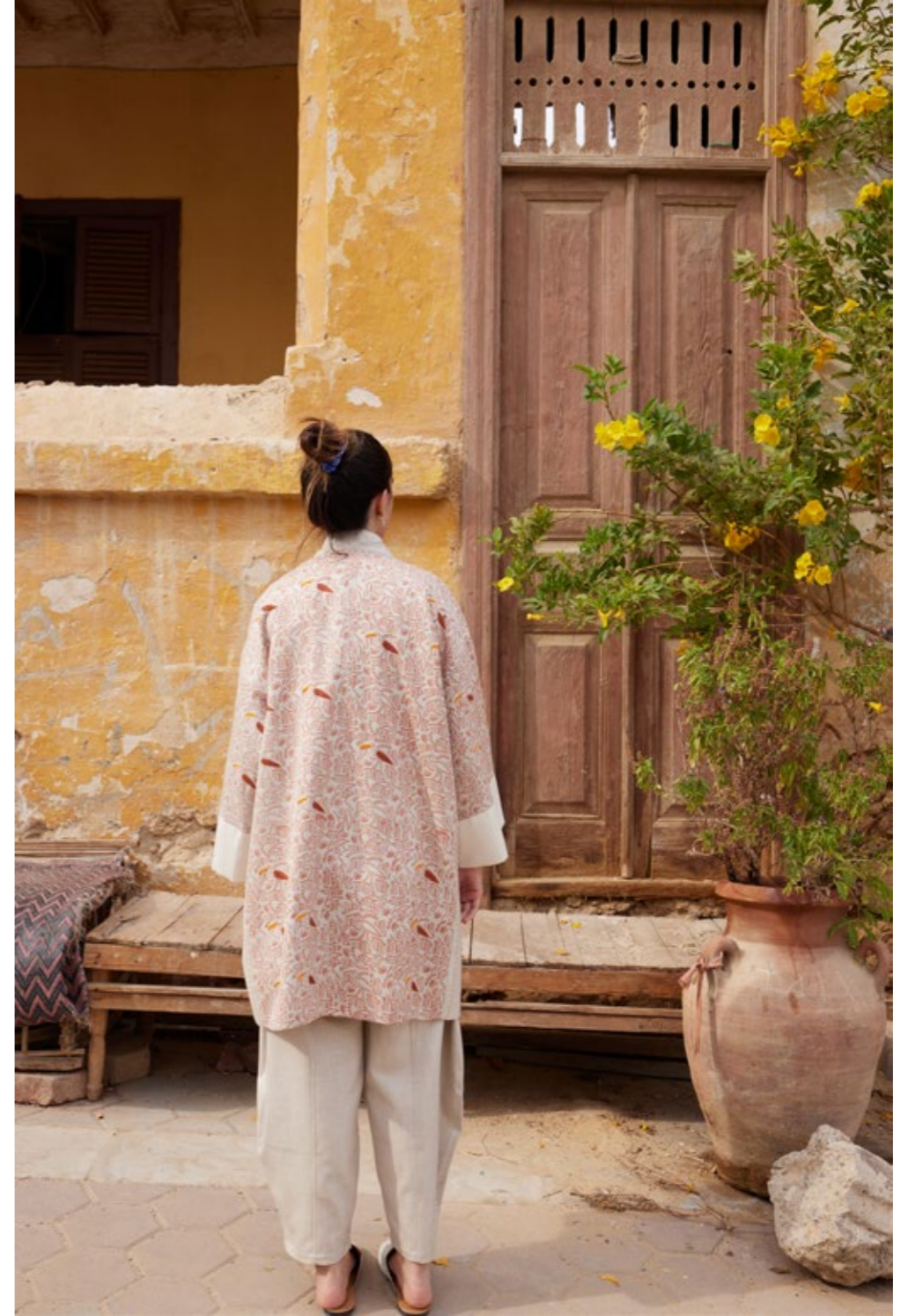
Beige Tank top - Egret Bird