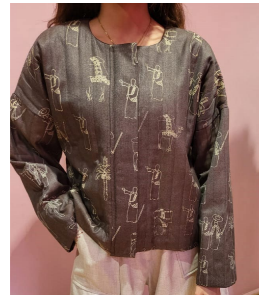
Brown Short Jacket - Ababda Print