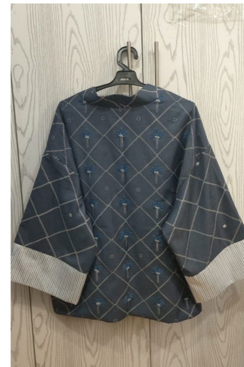
Short Navy Blue Kimono - Palm Tree Print