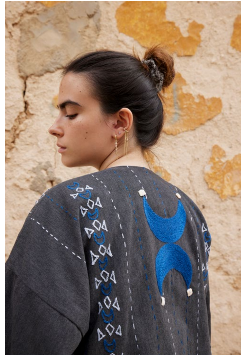
Grey Denim Short Jacket - Crescent Embroidered