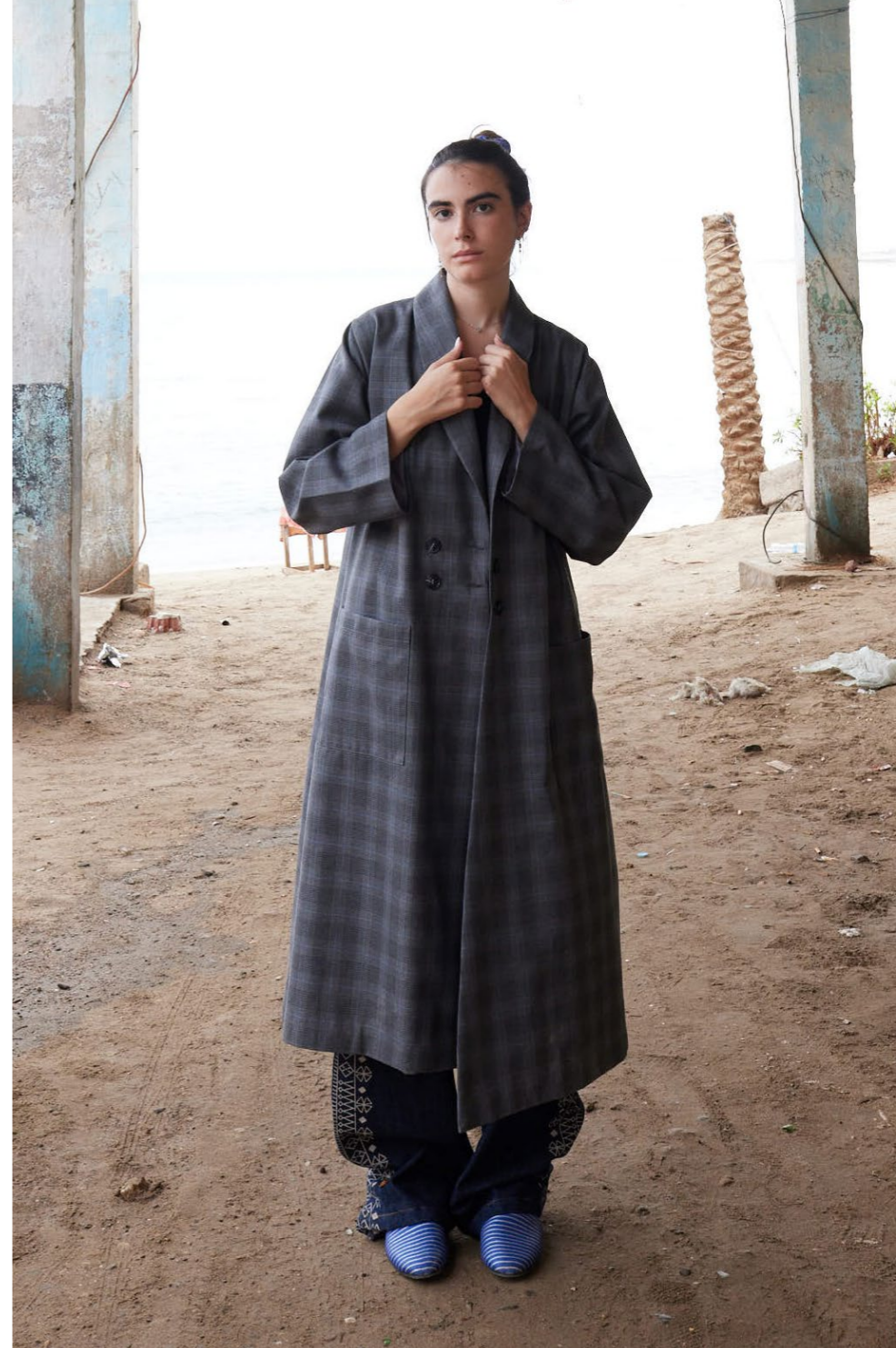
Grey Plaid Shawl Collar - Lobster Fabric Applique