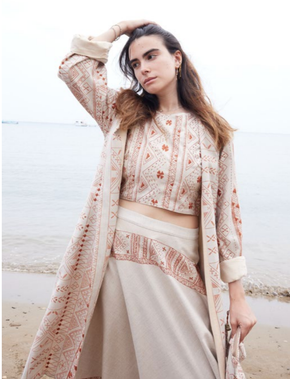
Beige Collarless Coat - Bab Print/Embroidery