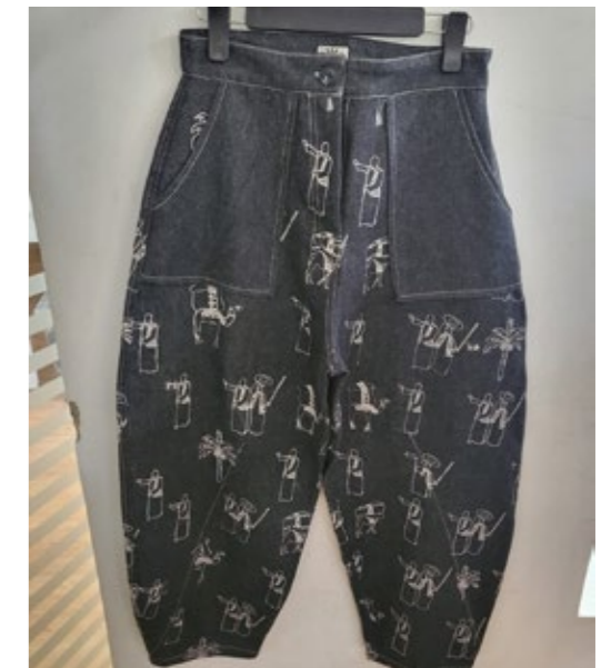
Grey Balloon Denim - Ababda Print