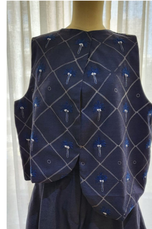
Navy Blue Palm tree printed & Embroidered - Gilet