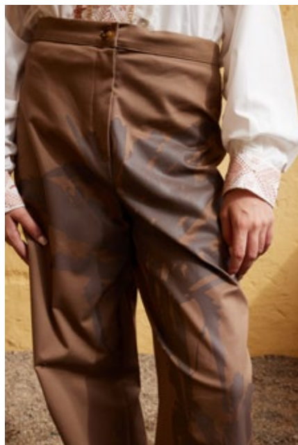
Brown Wide Leg Gaberdine - Palm Tree Print