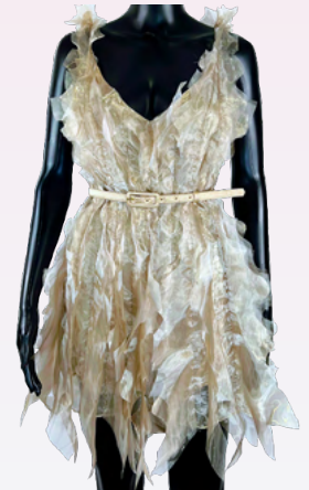
MEDUSA PLAYSUIT Luminescent champagne organza