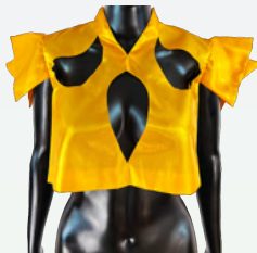
CROCUM CUT-OUT TOP