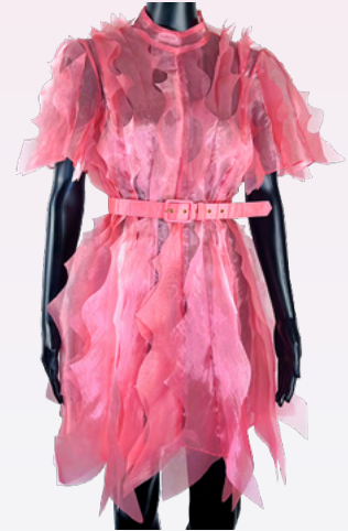
MEDUSA DRESS Coral organza