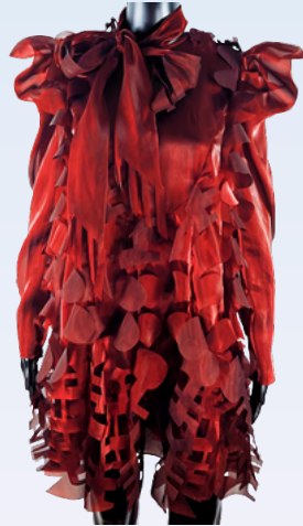
CLAVIS COCKTAIL DRESS Ruby organza