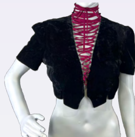
VELCOR CROPPED JACKET