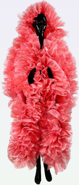
CHAUS CUT-OUT COAT Coral organza