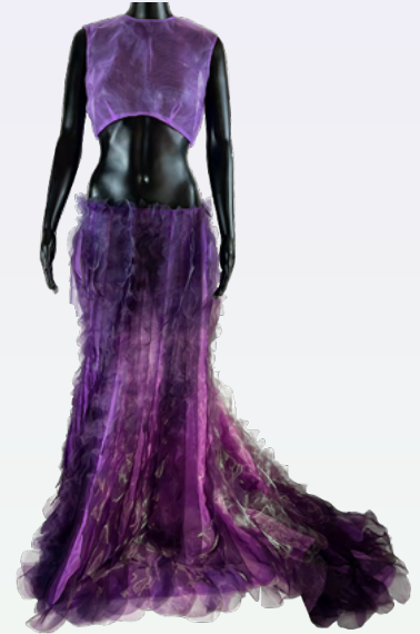
LIQUID SAPPHIRE DUO Purple glass organza