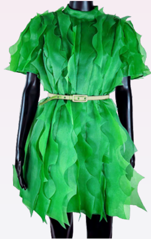
MEDUSA DRESS Grass green organza