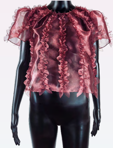
CIRRUS TOP Dusty rose organza