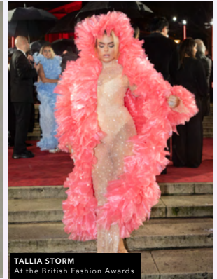
TALLIA STORM At the British Fashion Awards