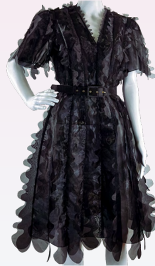
MOLLUSCUS MIDI DRESS