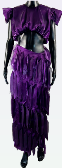
PURPURA DUO Dark purple organza