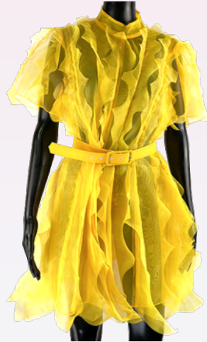
MEDUSA DRESS Sun yellow organza