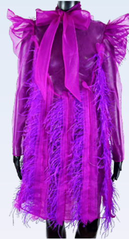
PLUMA COCKTAIL DRESS Purple organza