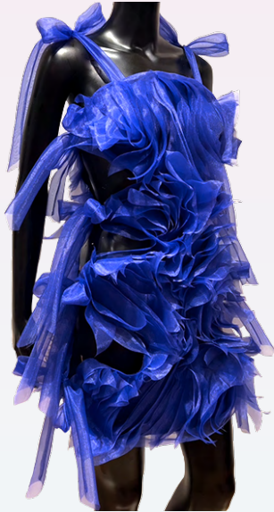
DUODEM MINI DRESS