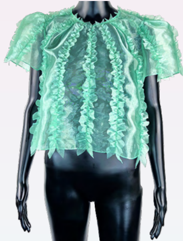
CIRRUS TOP Mint organza