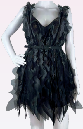
MEDUSA PLAYSUIT Black organza