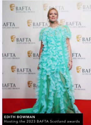
EDITH BOWMAN Hosting the 2023 BAFTA Scotland awards