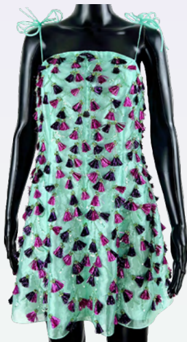
TELAM MINI DRESS

Lilac organza with yellow and black 3D embellishments