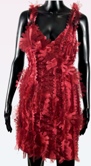
MINI DRACOMARIS DRESS