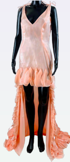
PERSI GOWN Peach organza