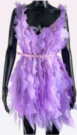
MEDUSA PLAYSUIT Lilac organza