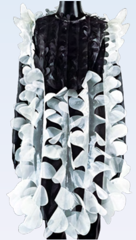
MERCURII COCKTAIL DRESS Black & cream organza