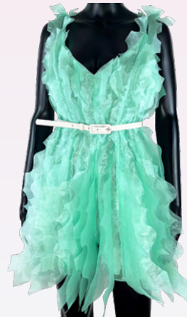
MEDUSA PLAYSUIT Mint organza