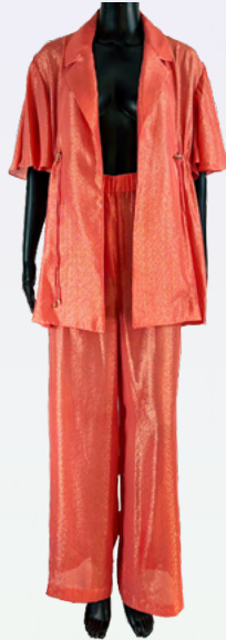
CORA LOUNGE SUIT