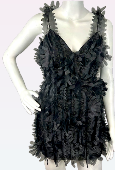
MINI DRACOMARIS DRESS