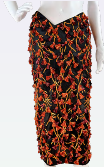
TELAM ASYMMETRIC WAIST SKIRT

Black satin with orange and gold hand beading