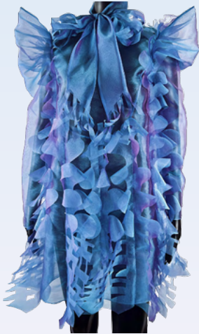
CLAVIS COCKTAIL DRESS Azure organza