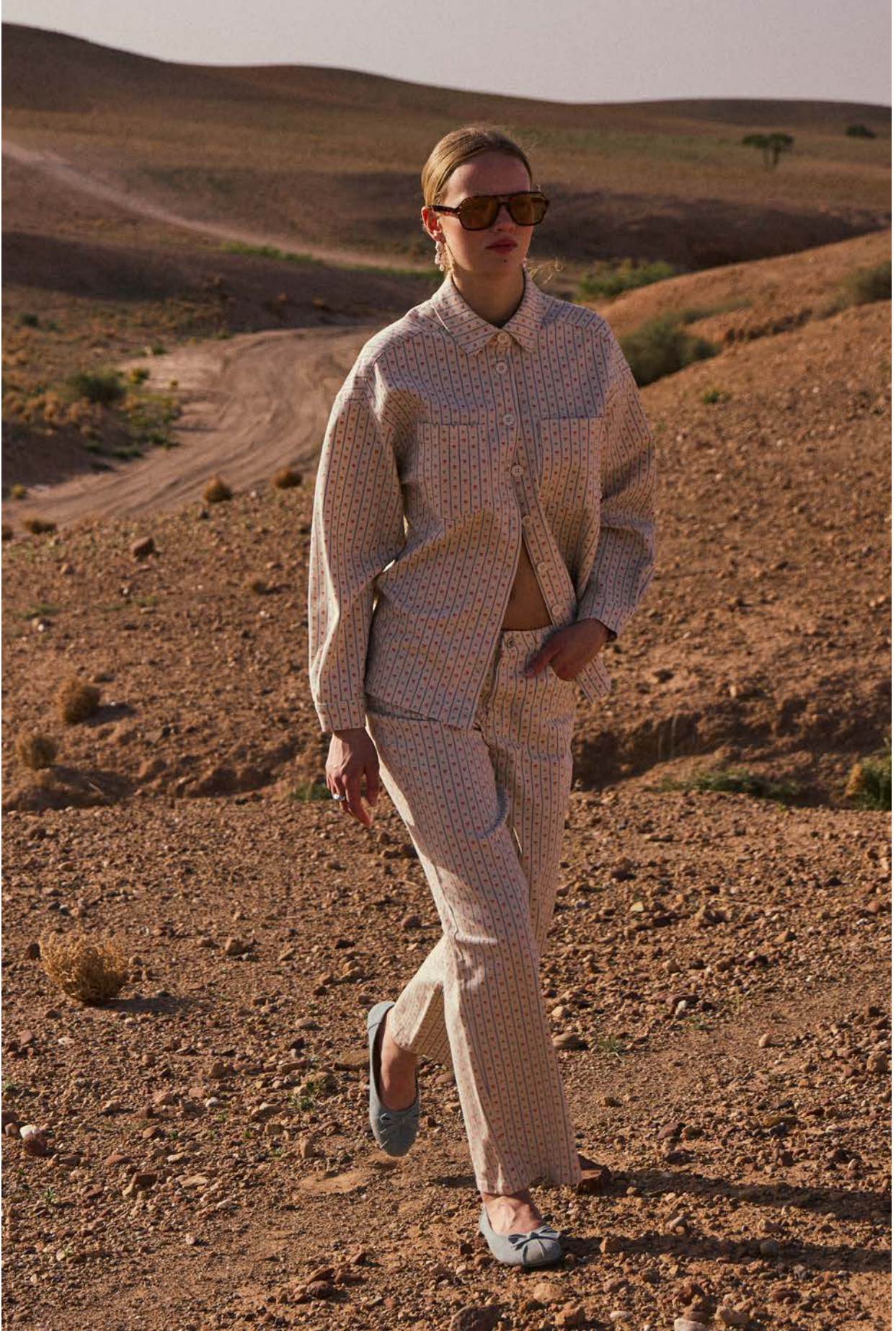
Jacket 20122442 / Pant 20122443