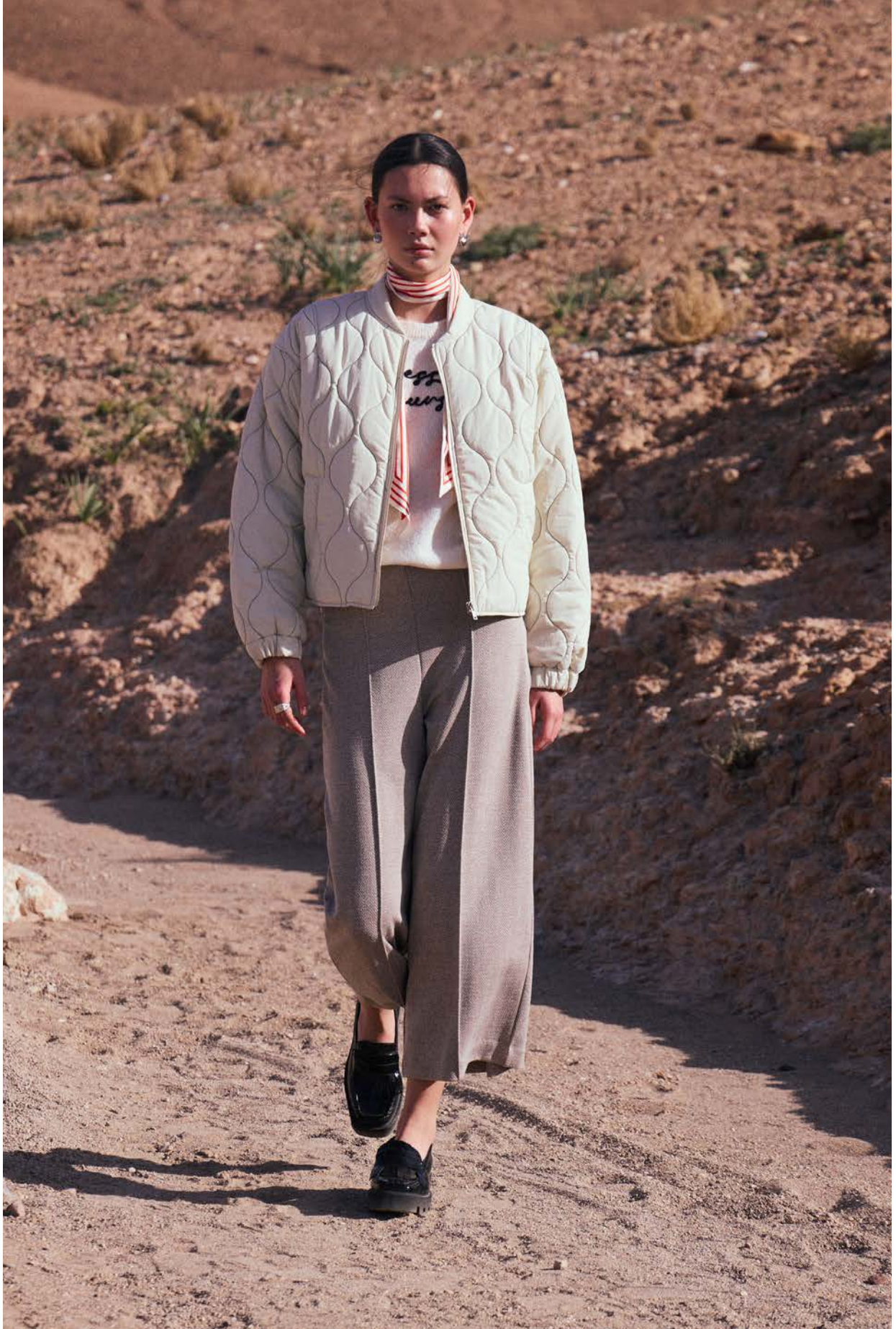
Jacket 20122218 / T-shirt 20122616 / Pant 20121602 / Scarf 20122647