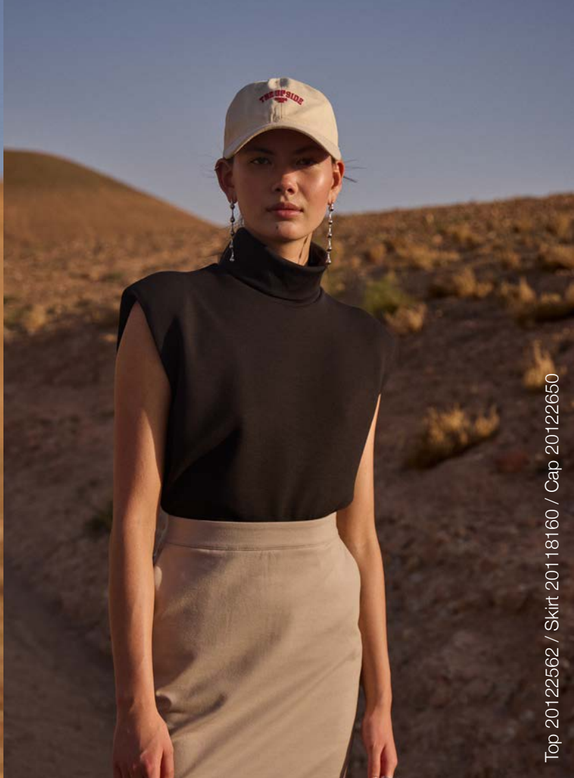
Top: 20122562 / Skirt: 20118160 / Cap: 20122650