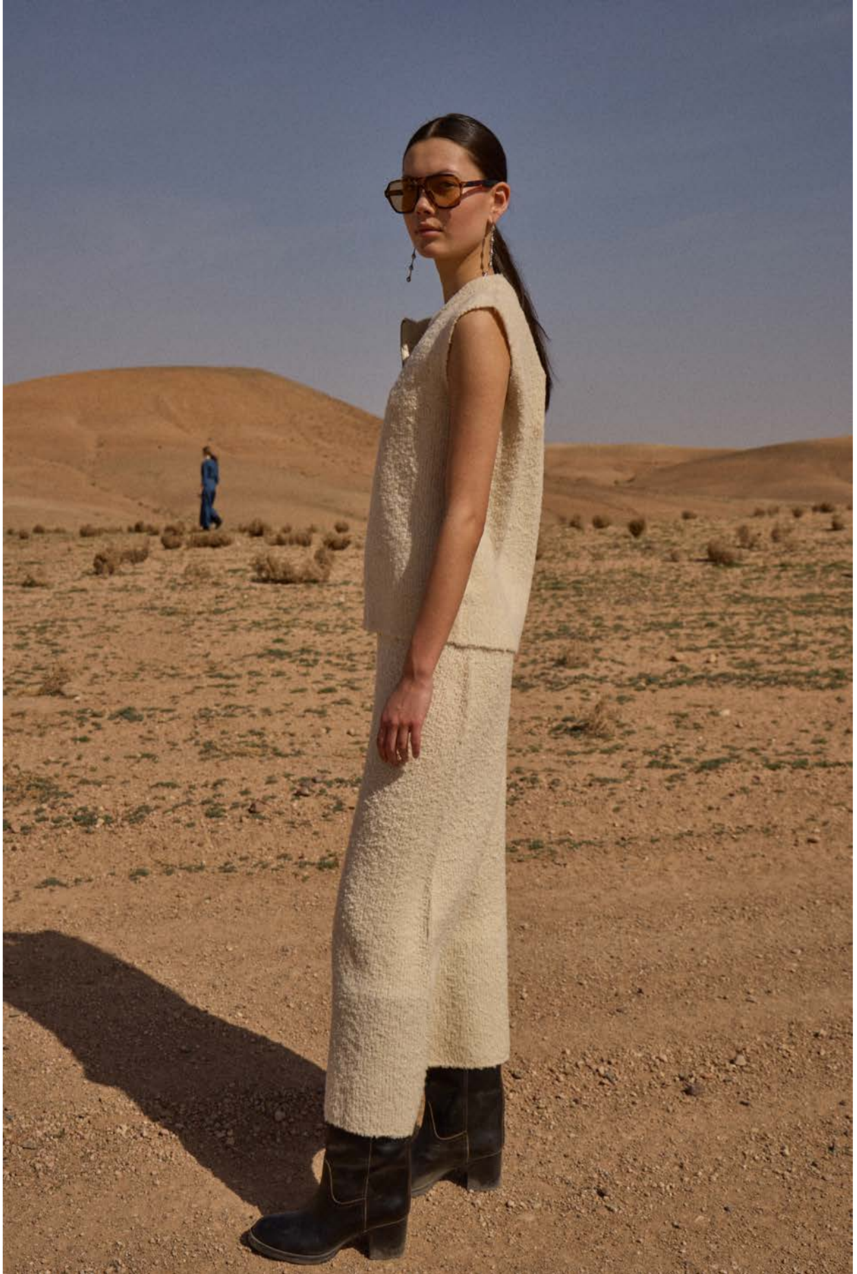
Vest 20122593 / Skirt 20122594