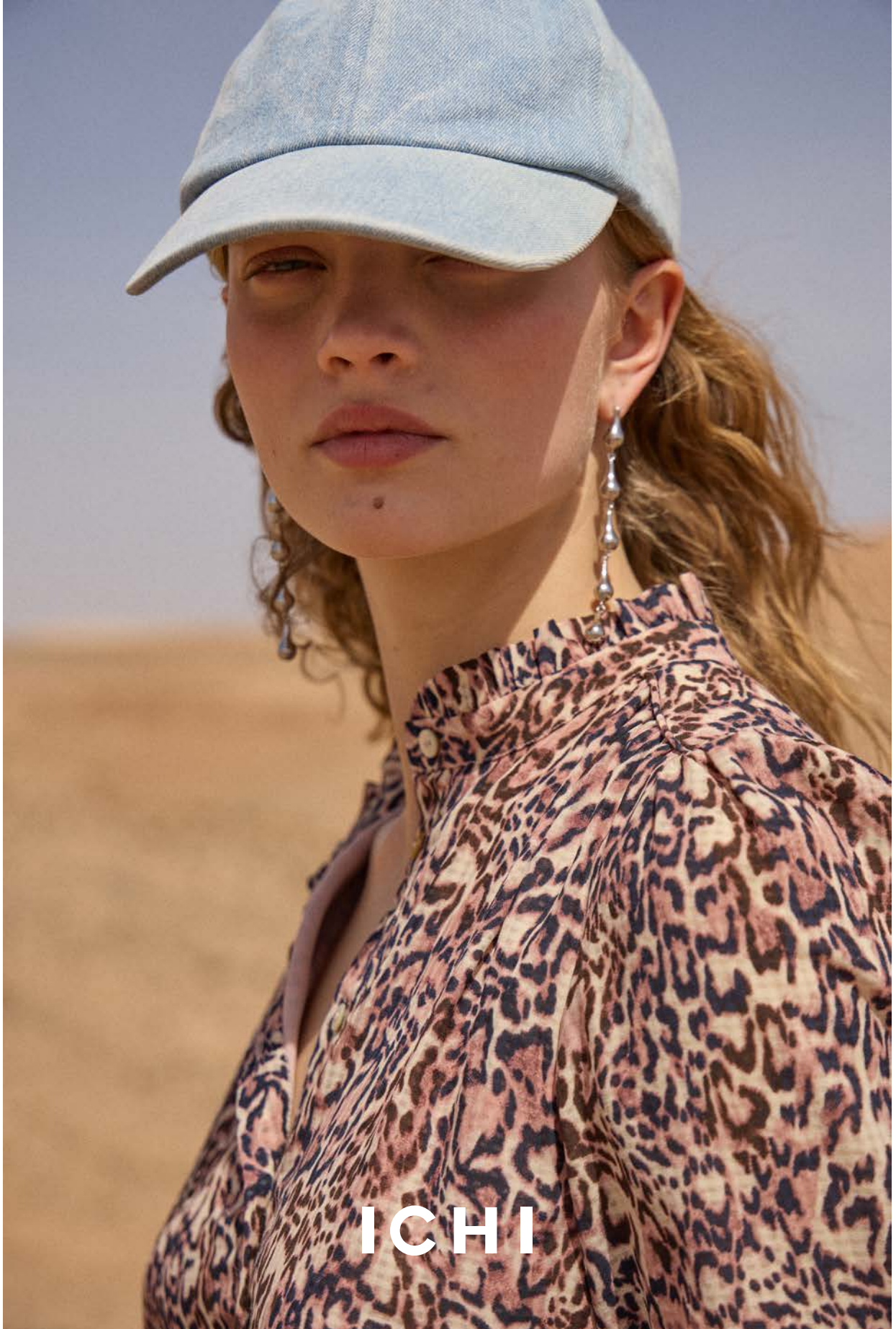
Dress 20122344 / Cap 20122750