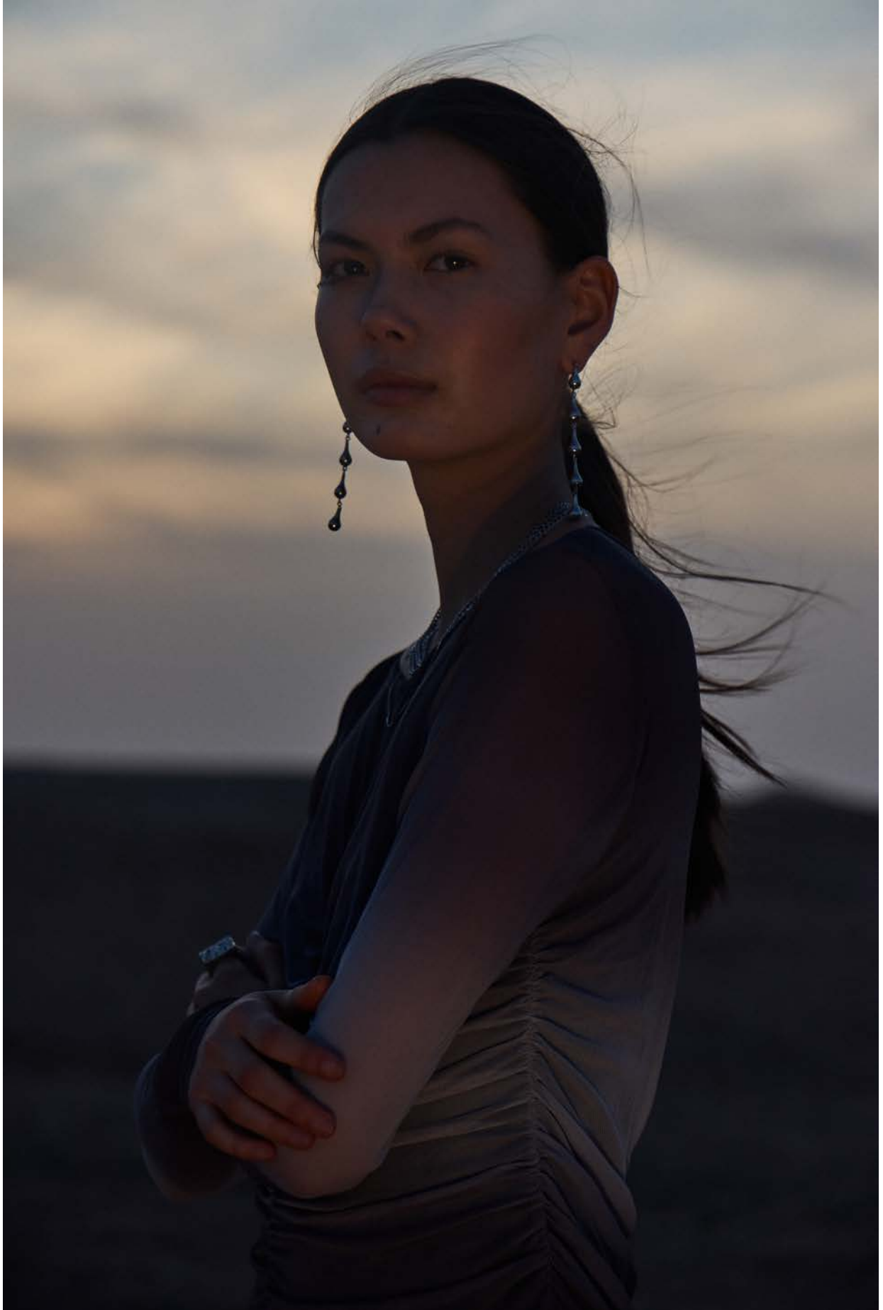
Dress 20122493 / Cap 20122749