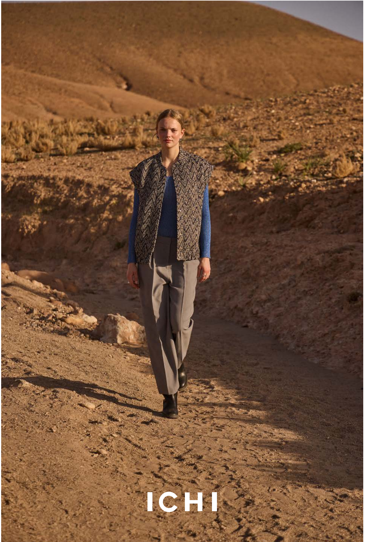
Vest 20122280 / Knit 20122542 / Pant 20121417