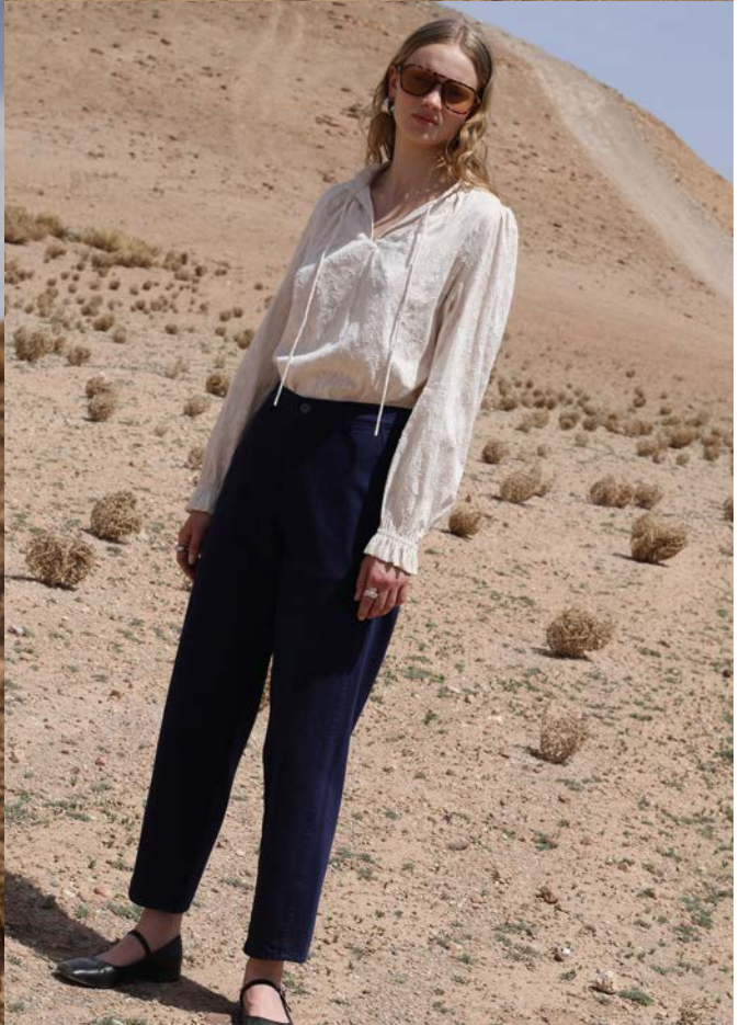
Jacket 20122215 Skirt 20122469