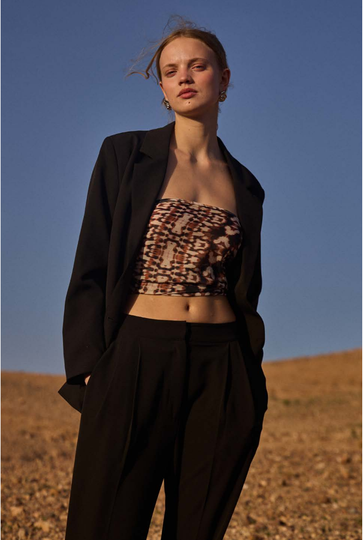
Blazer 20122499 / Pant 20122497 / Scarf (top) 20122738