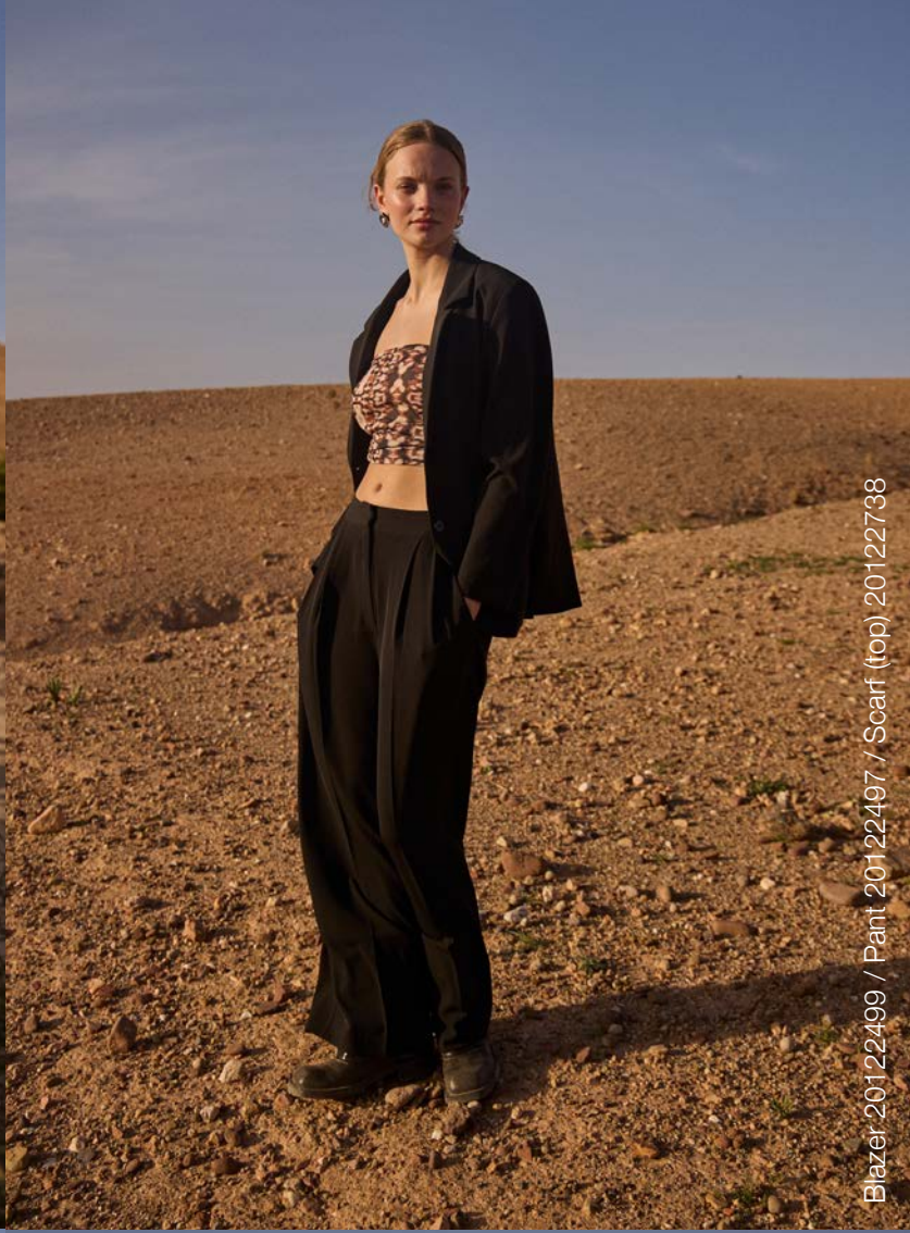
Blazer: 20122499 / Pant: 20122497 / Scarf (top): 20122738