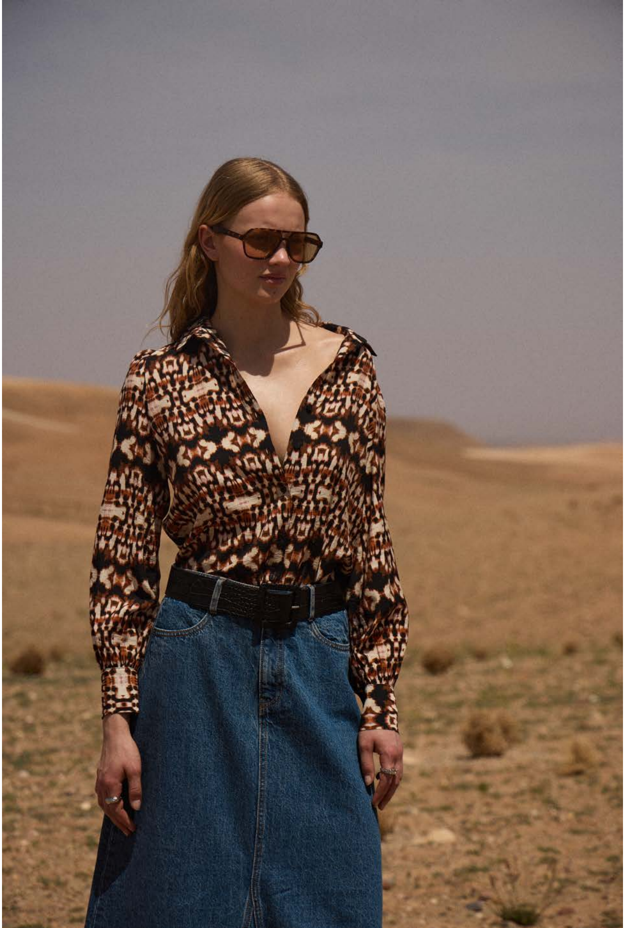
Shirt 20122351 / Skirt 20122274