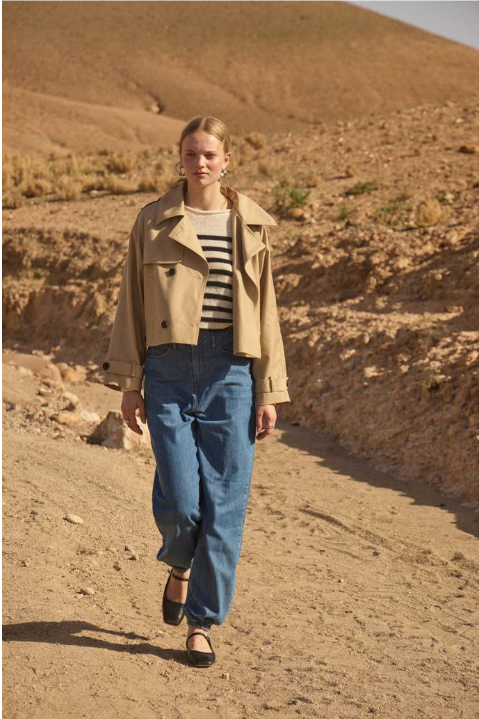
Jacket 20122214 / Blouse 20122546 / Shoes 20122713