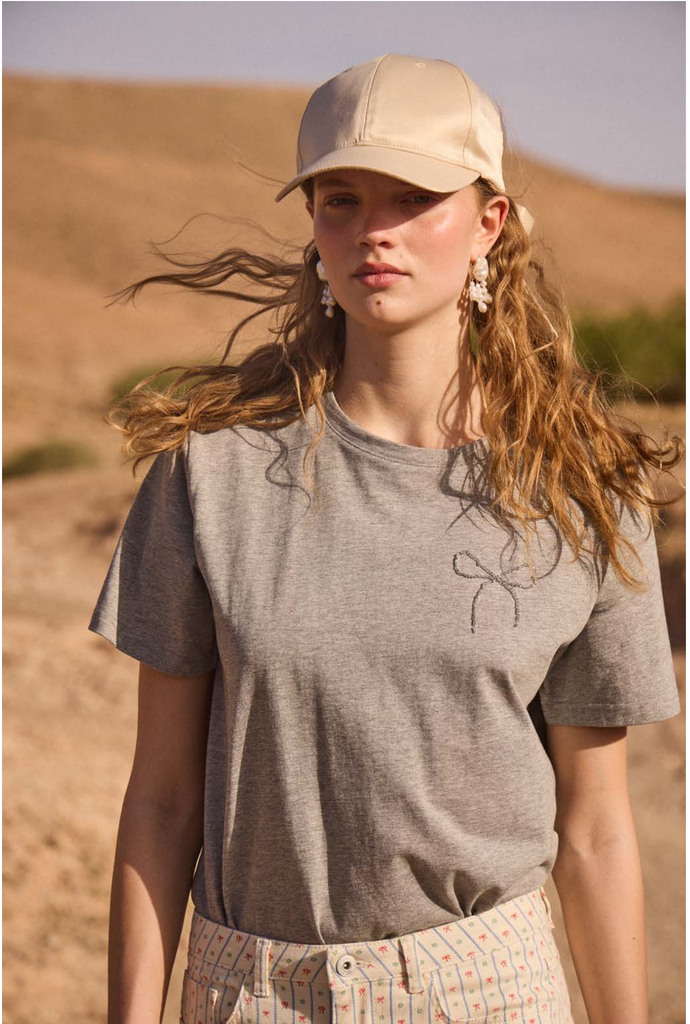
T-shirt 20122549 / Pant 20122443 / Cap 20122650