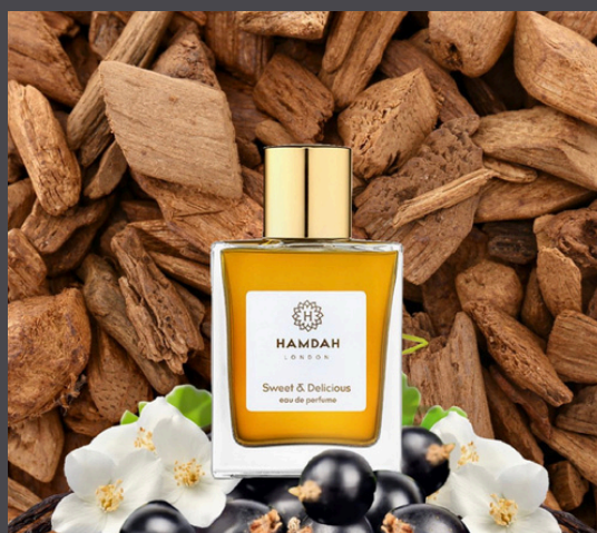
Oud & Woody