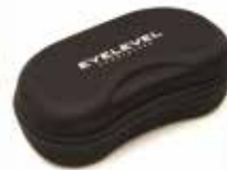
ZIP CASE MEDIUM