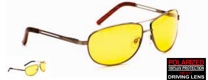
POLARIZED NIGHT DRIVER

POLARIZED 100%UV PROTECTION NIGHT DRIVING LENS