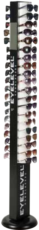
EYELEVEL FLOOR 40