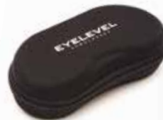
ZIP CASE LARGE