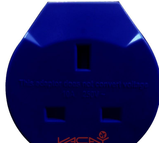
MV2021 – UK to Europe USB -Type-A USB -Type-C Inner – 12 units