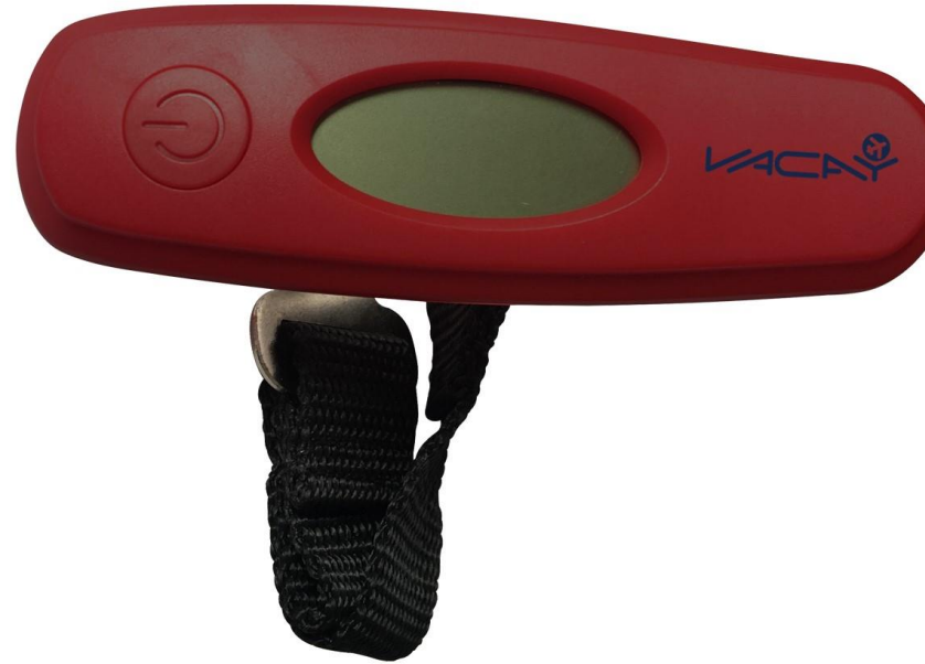
MV2011 – Digital Scale Inner – 5 units