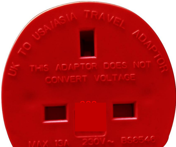
M2019 – UK to USA adaptor Inner – 12 units