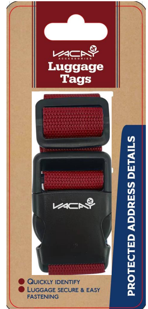
Carded pack Front