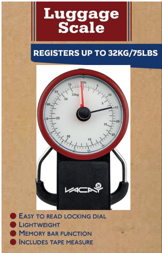
Boxed pack Front