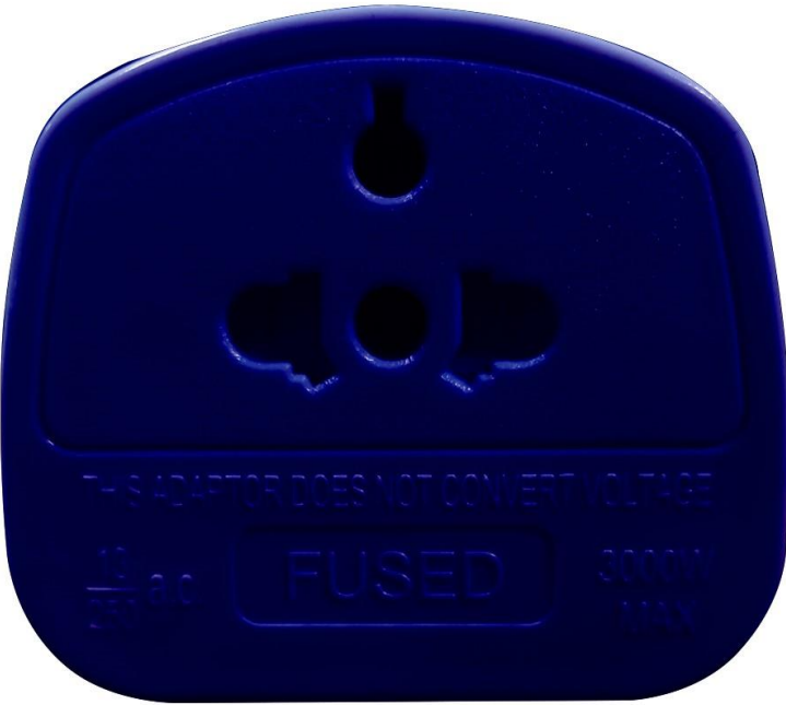
MV2020 – UK Visitor Inner – 12 units