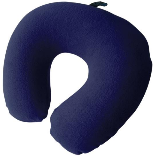
MV2013 – Neck Pillow Inner – 5 units