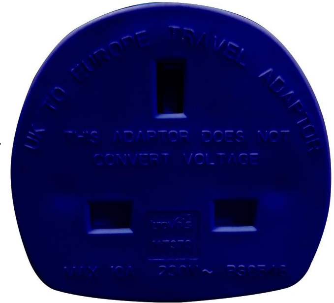
MV2018 – UK to Europe adaptor Inner – 12 units