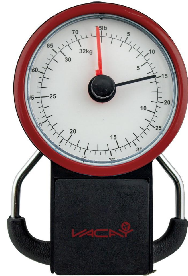
MV2010 - Luggage Scale Inner – 5 units Suggest Sell - £5.95