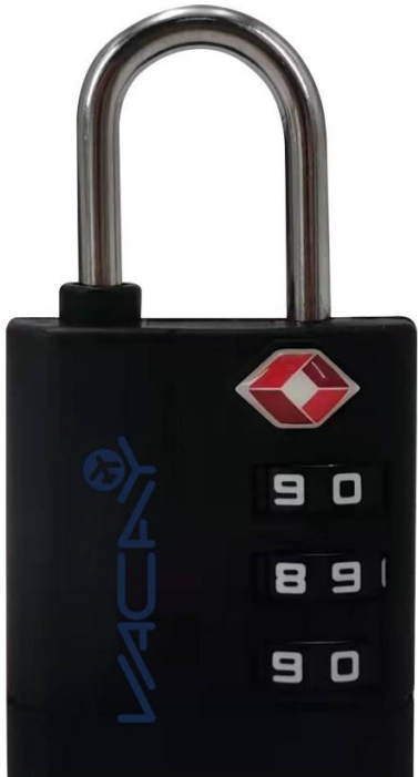
MV2005 – TSA Combi Lock Inner – 6 units