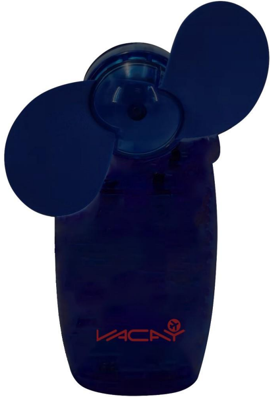
MV2017 – Mini Fan Inner – 8 units