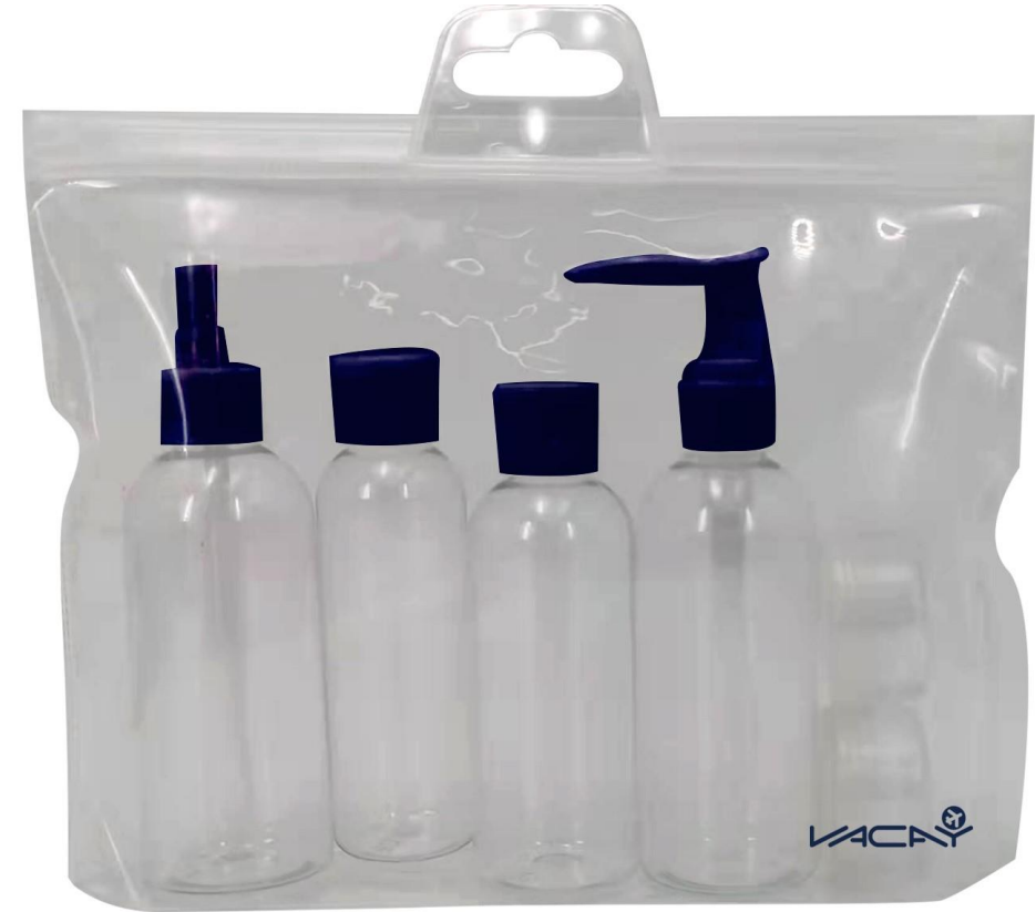
MV2014 – Travel Bottles Inner – 6 units