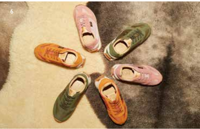
Shoes in photos left to right 1. Eddie Fur ankle-high hiking boots in tan burnished. 2. Peak snow boots in Atlantic blue. 3. Rosie T-bar shoes in cherry patent. 4. Smithy fur-lined hiking boots in chestnut brown. 5. Reggie Derby shoes in silver. 6. Keegan sneakers in old rose, olive and orange rust.