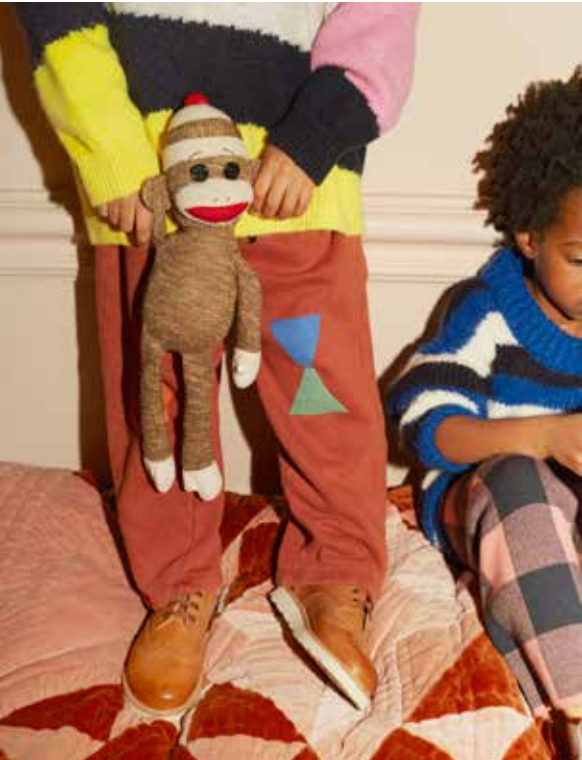
Shoes in photos left to right Cover: Eddie ankle-high hiking boots in chestnut brown. Main: Peak snow boots in atlantic blue, orange rust and warm taupe, Nova elasticated shoes in mink, navy and tan, Logan Chelsea boots in mink, Lark T-bar shoes in tan and navy, Holly Mary Jane shoes in Mink, Ricky snaffle loafers in tan and Keegan sneakers in orange rust. Top: Keegan sneakers in orange rust. Bottom: Brando brogue shoes in tan burnished.

The Autumn Winter 2022 collection continues the Young Sole mission to reinvent British heritage styles by bringing contemporary styling to children’s shoes. This collection stays true to the brand ethos of evoking childhood memories by wrapping up warm and bedding down for the Winter.