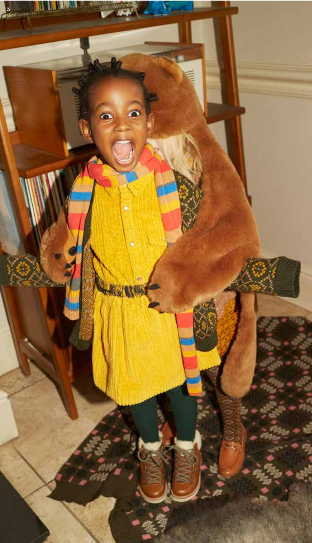
Shoes in photos left to right 1. Rosie T-bar shoes in rose gold. 2. Blossom T-bar shoes in tan burnished.. 3. Chester brogue boots in tan burnished. 4. Peak snow boots in warm taupe. 5. Eddie-Fur ankle-high hiking boots in tan burnished and Ricki snaffle loafers in tan burnished.