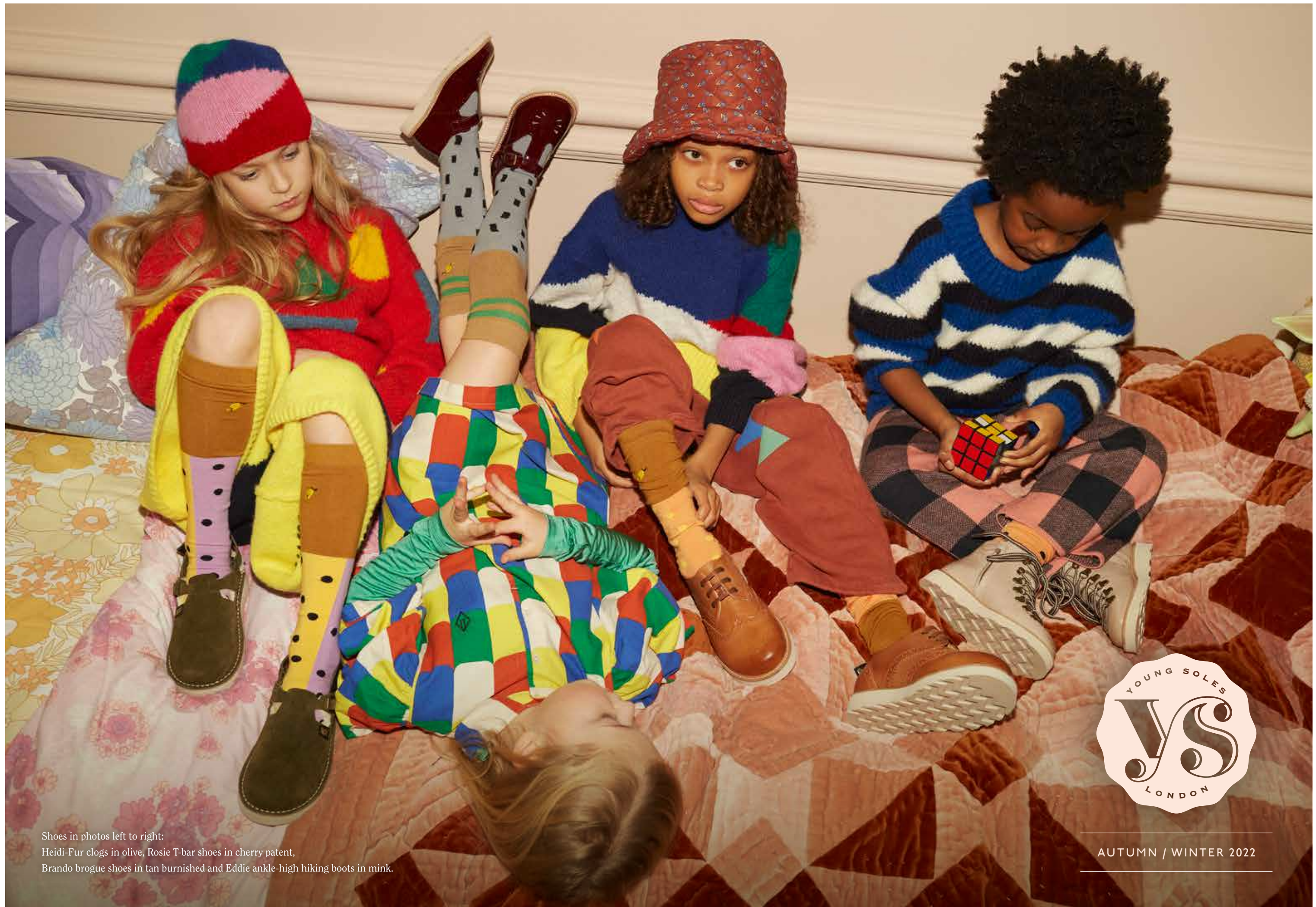
Shoes in photos left to right: Heidi-Fur clogs in olive, Rosie T-bar shoes in cherry patent, Brando brogue shoes in tan burnished and Eddie ankle-high hiking boots in mink.