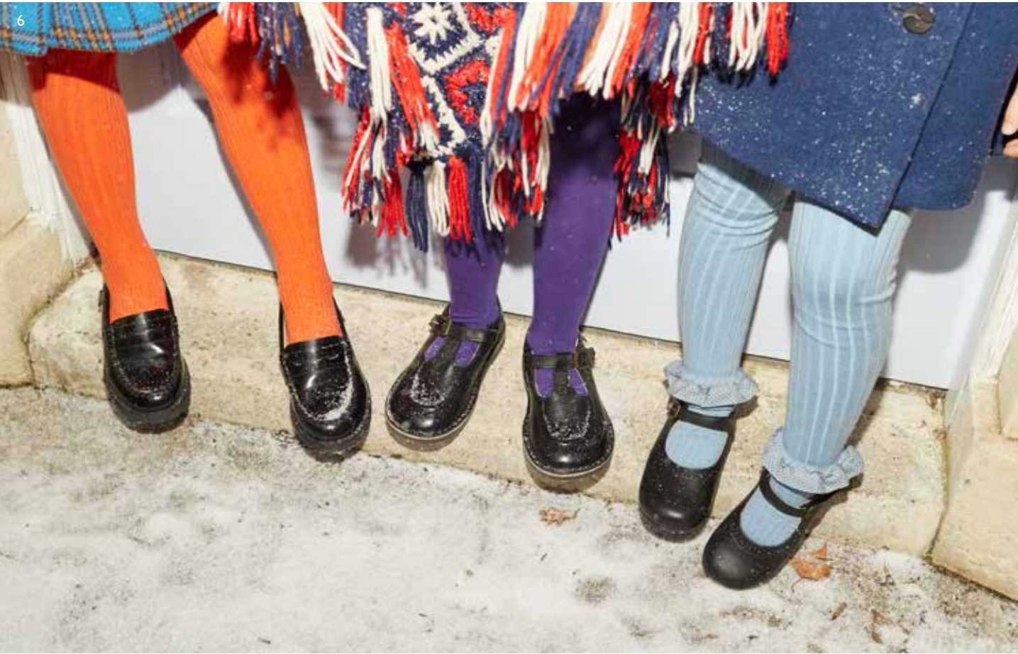
Shoes in photos left to right 1. Fletcher monkey boots in black. 2. Rodney Derby boots in black patent. 3. Nicki loafers in black. 4. Holly Mary Jane shoes in black and Oliver Velcro shoes in black. 5. Lark T-bar shoes in black. 6. Nicki loafers in black, Parker T-bar shoes in black and Diana T-bar shoes in black. Back Cover: Marlowe Chelsea boots in mushroom.