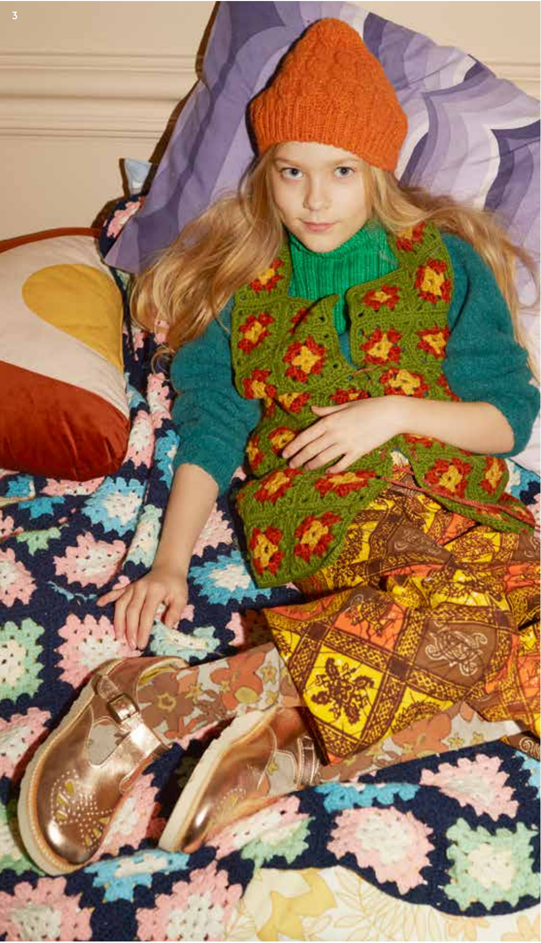
Shoes in photos left to right 1. Ricki snaffle loafer in tan burnished, Brando brogue shoes in silver, Reggie Derby shoes in silver, Chester brogue boots in tan burnished, Rosie T-bar shoes in rose gold and smokey sage, Eddie ankle-high hiking boots in chestnut brown and Penny T-bar shoes in tan burnished. 2. Peak snow boots in atlantic blue and warm taupe. 3. Rosie T bar shoes in rose gold.