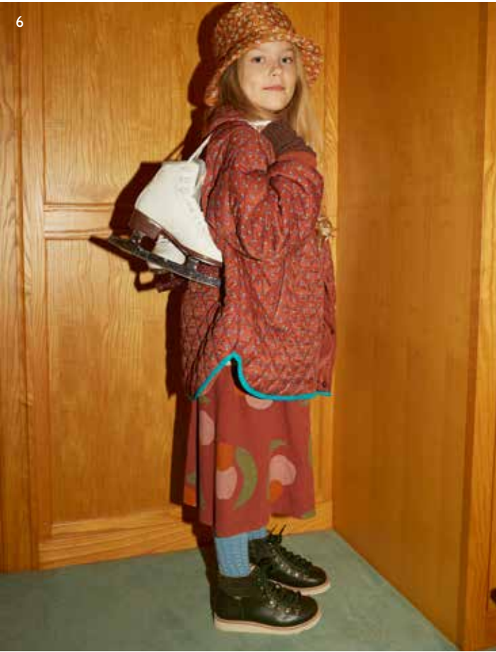
Shoes in photos left to right 1. Heidi-Fur clogs in stone. 2. Marlowe Chelsea boot in tan burnished. 3. Flecther monkey boot in tan burnished. 4. Parker T-bar in tan burnished and Keegan sneakers in old rose. 5. Keegan sneakers in orange rust, old rose and olive. 6. Eddie ankle-high hiking boots in black.