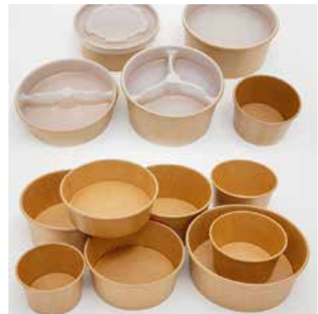
KRAFT PAPER BOWL