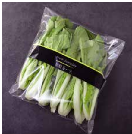
ANTI-FOGGY VEGETABLES BAG