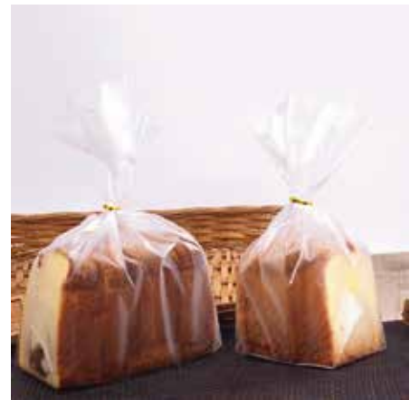
SIDE GUSSET BREAD BAG