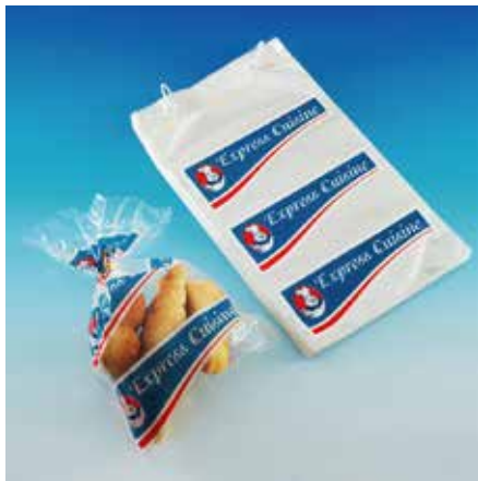
MICRO PERFORATED WICKET BAG