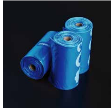
DOG POOP BAG