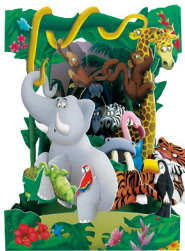
SC120 jungle animals