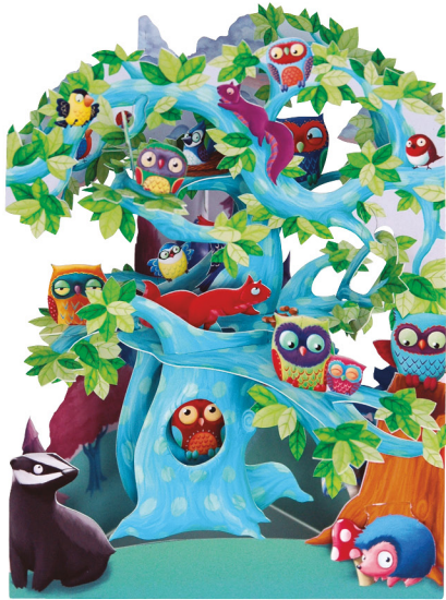
SC129 woodland tree of birds