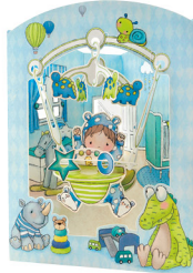
SC188 baby boy