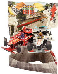
SC184 racing cars