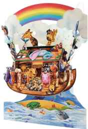
SC190 noah's ark