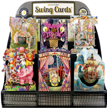
CDU-SC-SP03 counter-top display features: • 6 display cards • 38 stock cards (assortment across 6 designs) display: 49 x 56 x 26.5 cm

contact us for display offers & spinner pack options