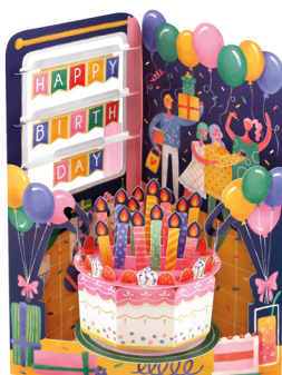
SC223 birthday celebration

approx card dimensions: 14.5 x 19.5 x 12 cm envelope included