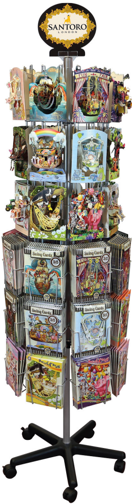
SC-SPIN-SP01 swing card spinner display spinner display features: • 24 display cards • 156 stock cards (assortment across 24 designs) display: 54 x 177 x 54 cm

contact us for display offers & spinner pack options