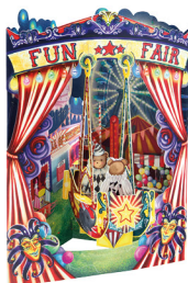
SC193 swing boat