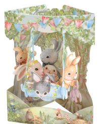
SC179 rabbits on a swing boat