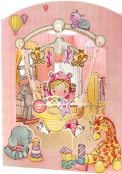
SC189 baby girl