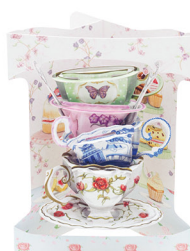
SC159 stack of teacups