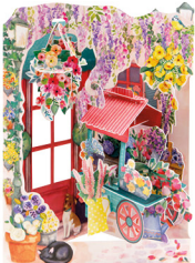
SC187 florist and flower cart