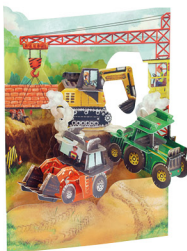
SC171 tractors & diggers