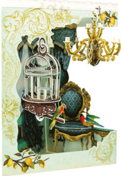
SC133 chandelier & bird cage