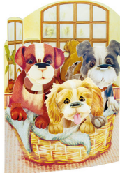
SC150 puppies in a basket