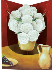
SC124 vase of roses