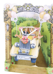
SC180 wedding car