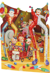
SC153 big top clowns