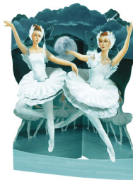
SC131 ballet swan lake