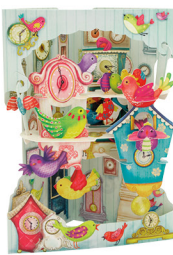
SC183 birds & clocks