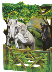
SC181 jumping horse