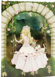
SC151 princess on a swing