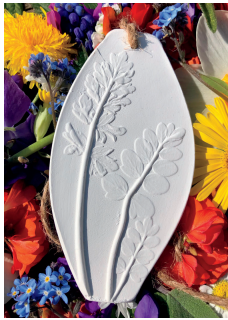
THREE LITTLE LEAVES