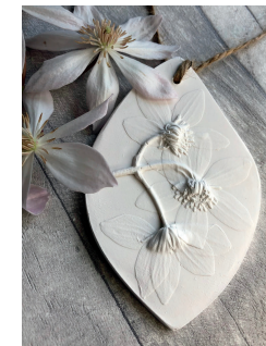
SPRING FLOWERING CLEMATIS