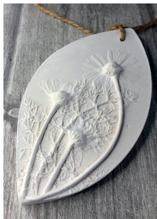
DAISIES & FENNEL