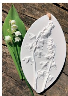
LILY OF THE VALLEY