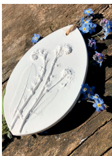
FORGET ME NOT