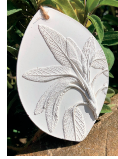
SPRIG OF SAGE