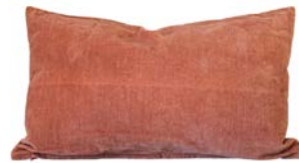
MISI VELVET CUSHION WASHED CORAL 30X50CM | AHCU247 100% COTTON VELVET & RECYCLED COTTON REVERSE £42