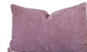
MISI VELVET CUSHION MAUVE 30X50CM | AHC246 100% COTTON VELVET & RECYCLED COTTON REVERSE £42