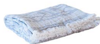
TIBBLE NATURAL GEO THROW 150X200CM | AHTH136 60% COTTON/40% LINEN £42

- All cushions and pillows are filled with a luxury feather pad -