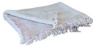
MIA GAUZE CHECK THROW REVERSIBLE 130X171 CM | ANTH135 100% COTTON £??