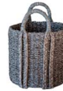
NOUSTA SEAGRASS & WATER HYACINTH PLANT BASKET SMALL 19X22CM | AHBS129 £33