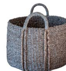
TILAA ROUND SEAGRASS & WATER HYACINTH STORAGE BASKET LARGE D46XH21X37CM | AHBS128 £28