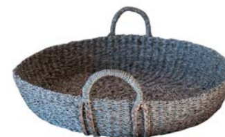
KUTEN ROUND SEAGRASS BASKET WITH WATER HYACINTH HANDLES LARGE 36X9CM | AHBS127 £52