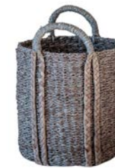
NOUSTA SEAGRASS & WATER HYACINTH PLANT BASKET LARGE 38X25CM | AHBS129 £45