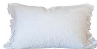
ALTA CUSHION WHITE 40X60CM | AHCU258 100% COTTON £68

- All cushions and pillows are filled with a luxury feather pad -