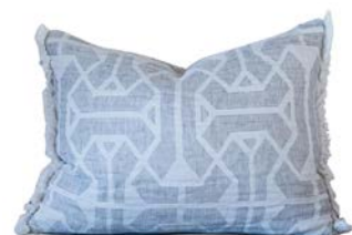
TIBBLE NATURAL GEO CUSHION 40X60CM | AHCU259 60% COTTON/40% LINEN £42