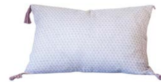
NATTI PRINT CUSHION MAUVE 30X50CM | AHC252 100% COTTON MUSLIN £45