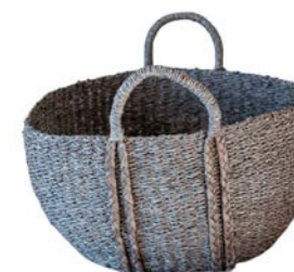
KURV OVAL SEAGRASS & WATER HYA- CINTH STORAGE BASKET LARGE D46XH21X37CM | AHBS125 £65