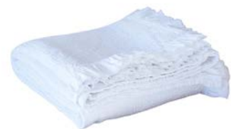
ALTA BEDPSREAD WHITE 220X230CM | AHBD112 100% COTTON £210