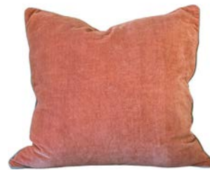
UNARI VELVET CUSHION WASHED CORAL 50X50CM | AHCU250 100% COTTON VELVET & RECYCLED COTTON PIPING £56

- All cushions and pillows are filled with a luxury feather pad -