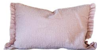
ALTA CUSHION BLUSH 40X60CM | AHCU257 100% COTTON £68