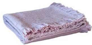
ALTA BEDPSREAD BLUSH 220X230CM | AHBD111 100% COTTON £210