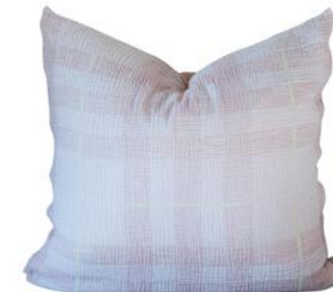
MIA GAUZE CHECK PILLOW PINK/OLIVE 65X65CM | AHC255 100% COTTON £86