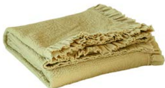
ALTA BEDPSREAD OLIVE 220X230CM | AHBD110 100% COTTON £210