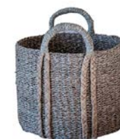
TILAA ROUND SEAGRASS & WATER HYACINTH STORAGE BASKET SMALL D46XH21X37CM | AHBS128 £42