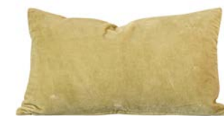
MISI VELVET CUSHION OLIVE 30X50CM | AHCU245 100% COTTON VELVET & RECYCLED COTTON REVERSE £42