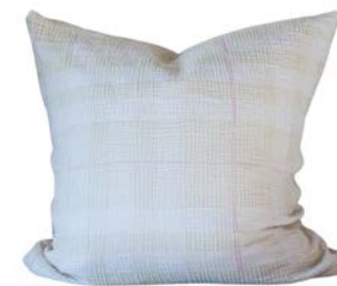
MIA GAUZE CHECK PILLOW OLIVE/PINK 65X65CM | AHC254 100% COTTON £86