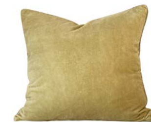
UNARI VELVET CUSHION OLIVE 50X50CM | AHCU248 100% COTTON VELVET & RECYCLED COTTON PIPING £56

- All cushions and pillows are filled with a luxury feather pad -