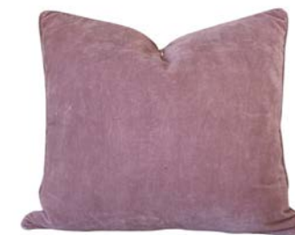
UNARI VELVET CUSHION MAUVE 50X50CM | AHC249 100% COTTON VELVET & RECYCLED COTTON PIPING £56

- All cushions and pillows are filled with a luxury feather pad -