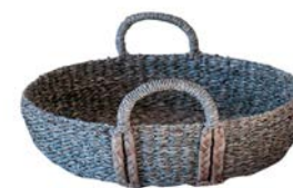
KUTEN ROUND SEAGRASS BASKET WITH WATER HYACINTH HANDLES SMALL 36X9CM | AHBS127 £38