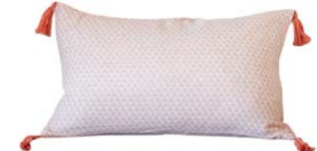
NATTI PRINT CUSHION CORAL 30X50CM | AHC253 100% COTTON MUSLIN £45