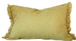
ALTA CUSHION OLIVE 40X60CM | AHCU256 100% COTTON £68