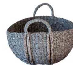
KURV OVAL SEAGRASS & WATER HYACINTH STORAGE BASKET SMALL D41XH18X32CM | AHBS129 £45