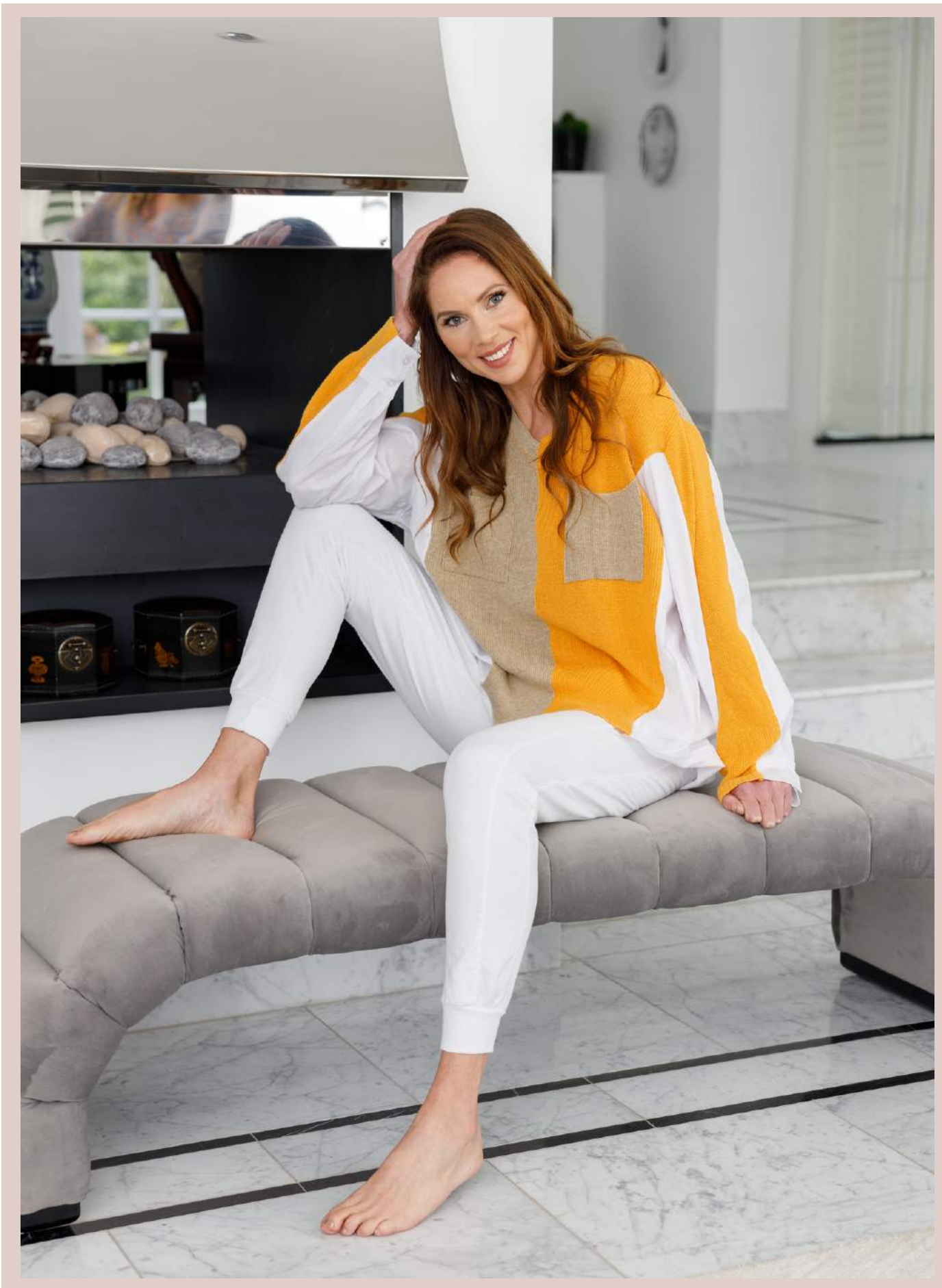
Kyndall Patch Pocket Sweater (Orange)