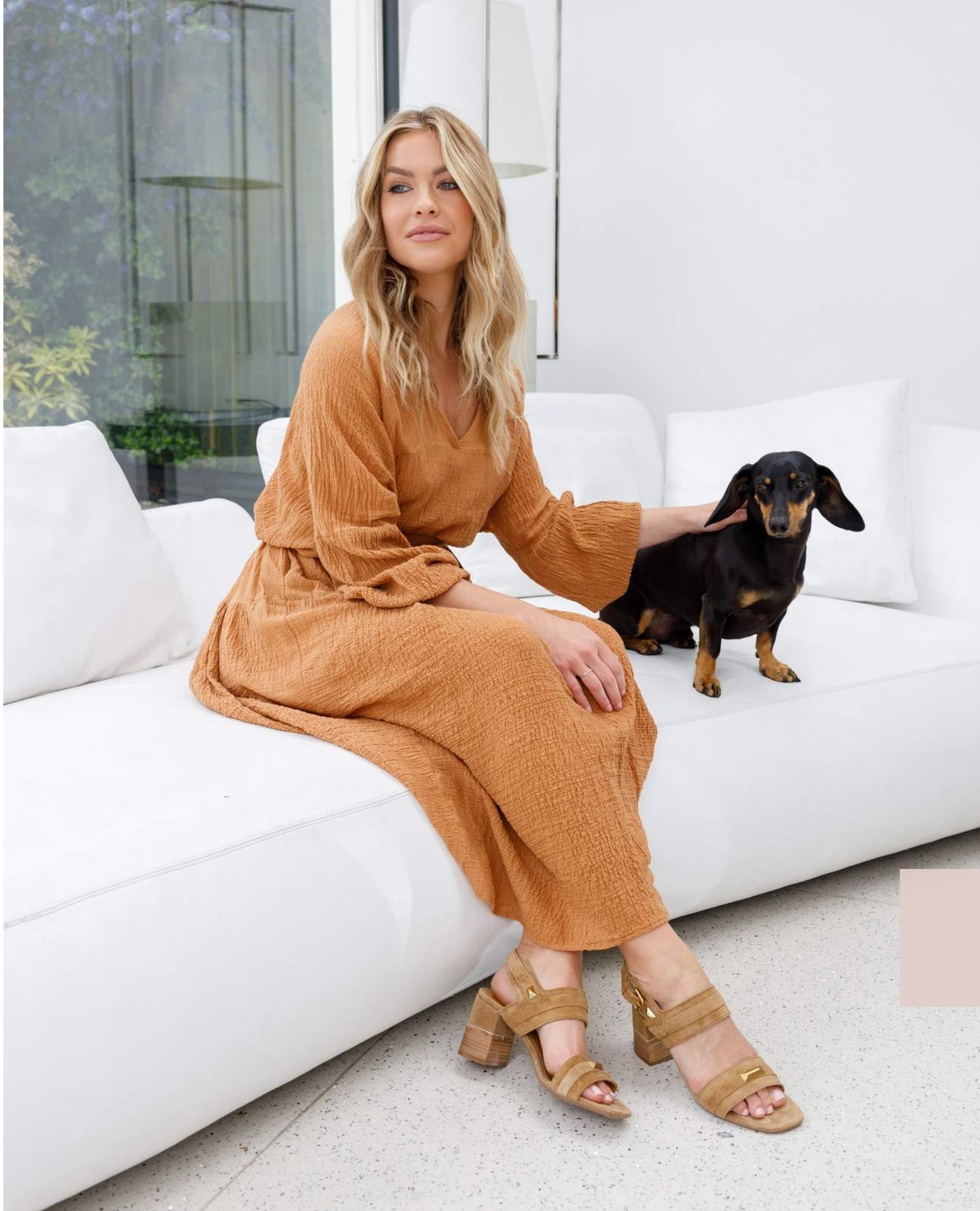
Stevie Crinkle V Neck Maxi Dress (Tobacco)