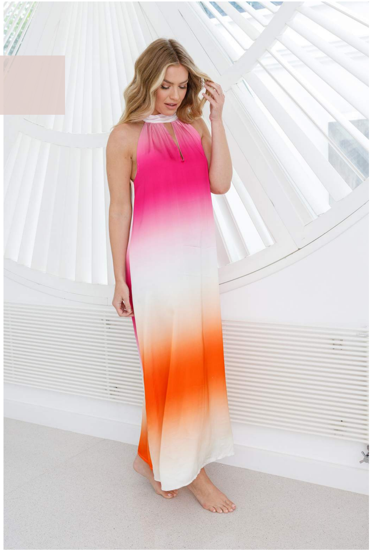
Gilly Dress (Fuchsia)