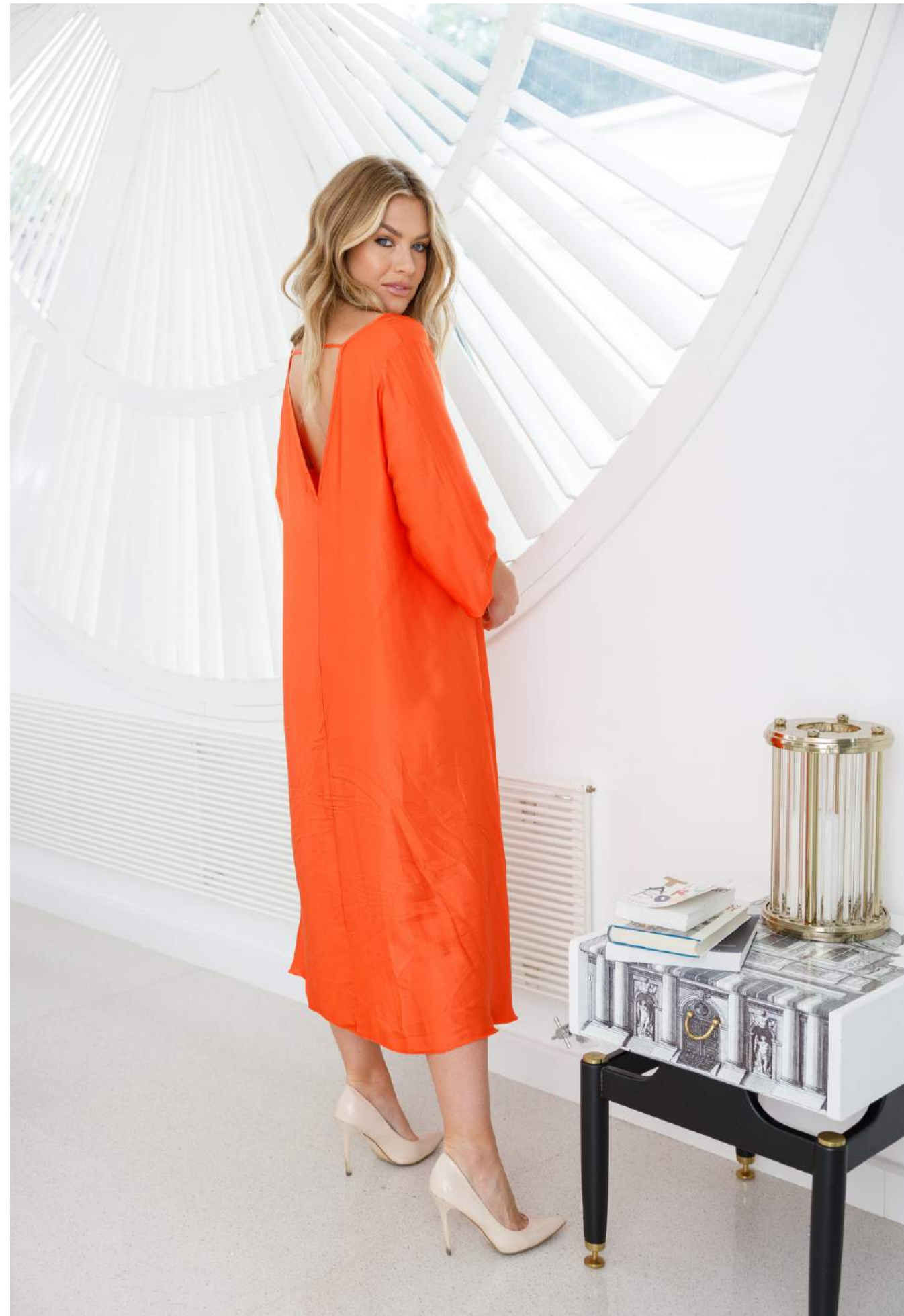
Walker Satin Dress (Orange)