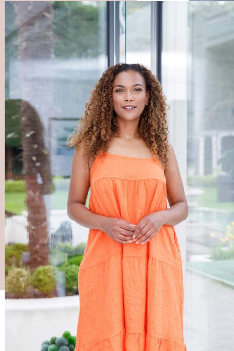
Sapphire Baby Doll Dress (Orange)