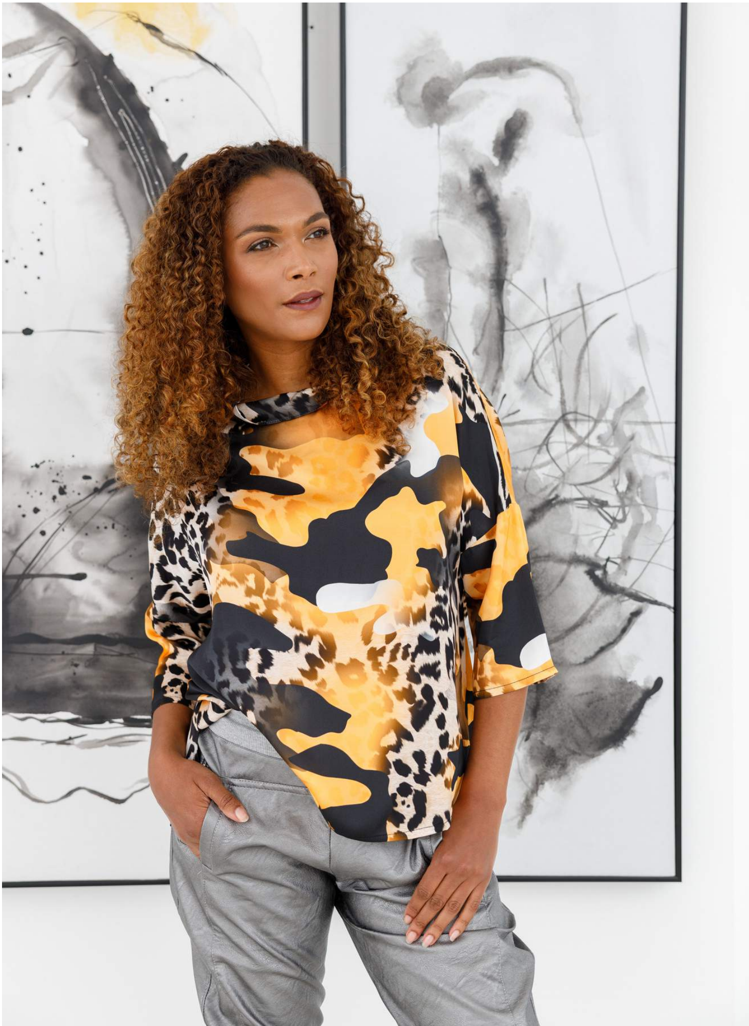
Kristian Printed Top (Mandarin)