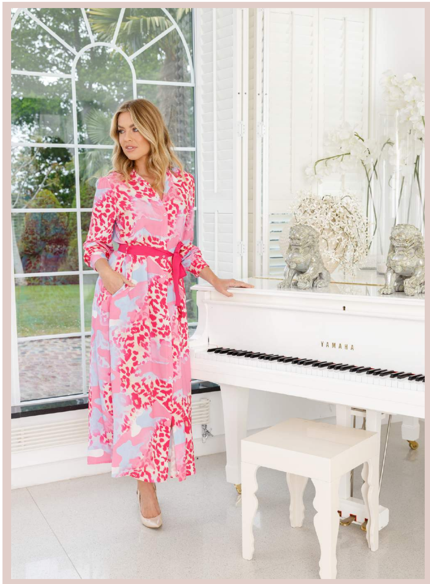
Kena Dress (Fuchsia)