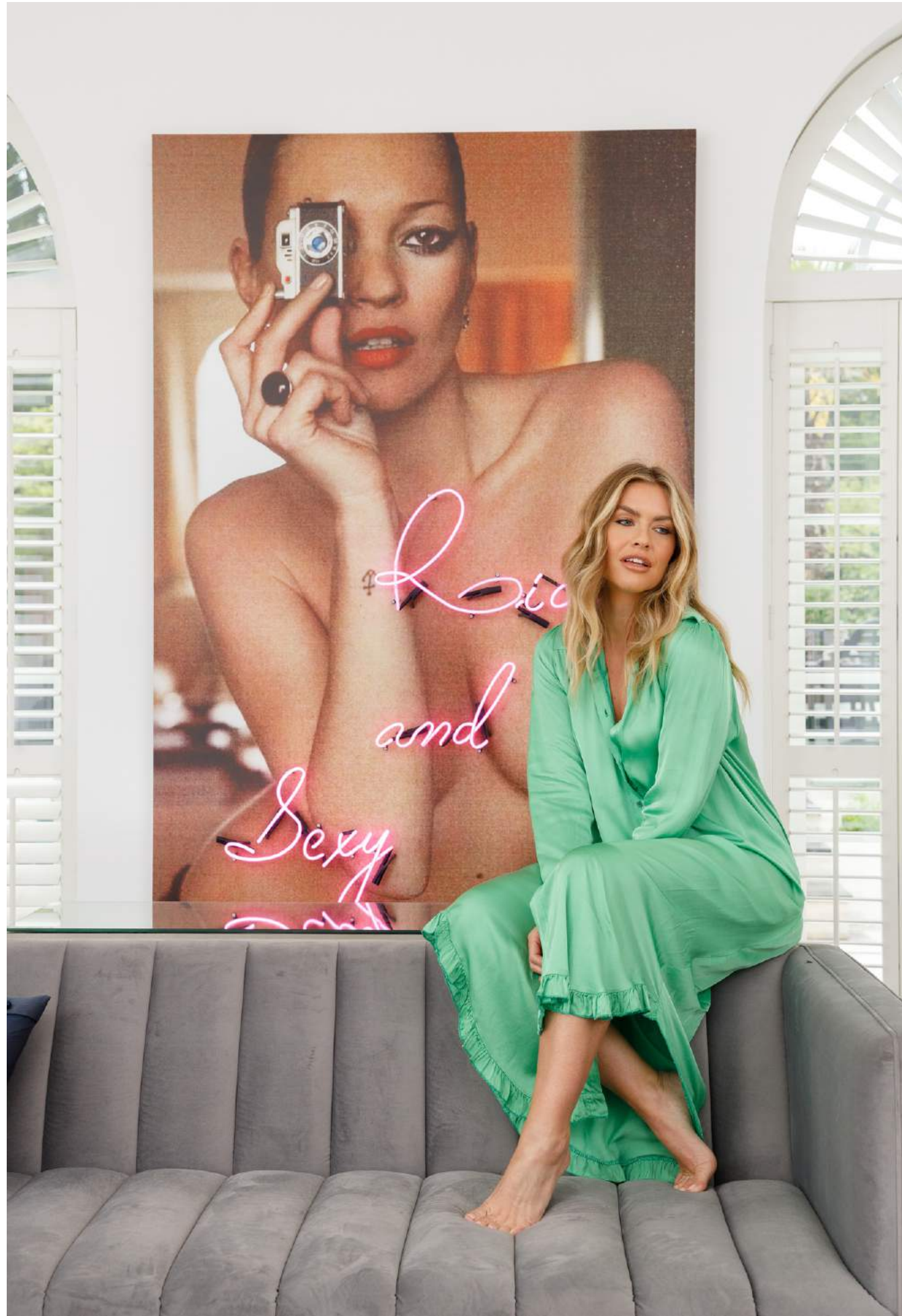
Katarina Dress (Apple)