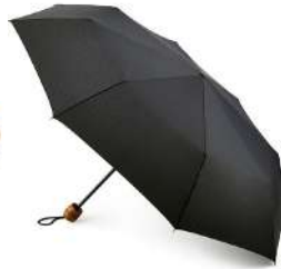
2. Gingham - 50 20815 035269