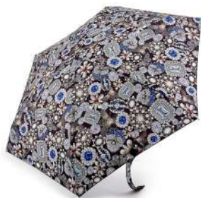
11. The Crown Jewels - 50 20815 039731