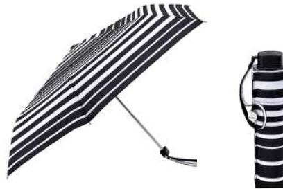
1. Bold Stripe - 50 20815 040591