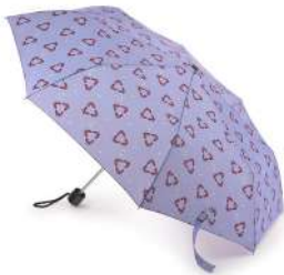
4. Trio Butterflies - 50 20815 040928