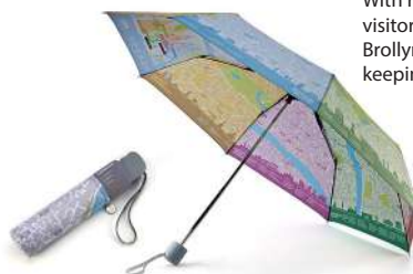
1. London Map - 50 20815 022498