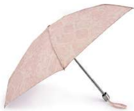
1. Snake - 50 20815 040843