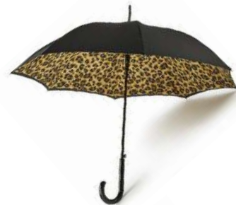
6. Lynx - 50 20815 034941