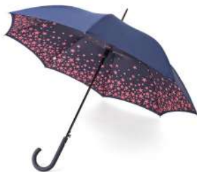
10. Scatter Star Navy & Pink - 50 20815 036464