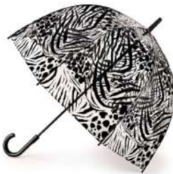
2. Animal Mix - 50 20815 040973