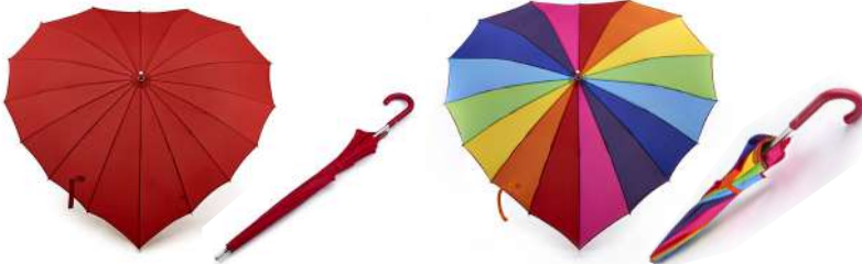
1. Red(UV) - 50 20815 039618 2. Red(NonUV) - 50 20815 039625