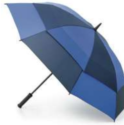
2. Blue/ Navy - 50 20815 019221