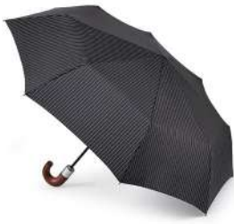
1. City Stripe Black - 50 20815 019214