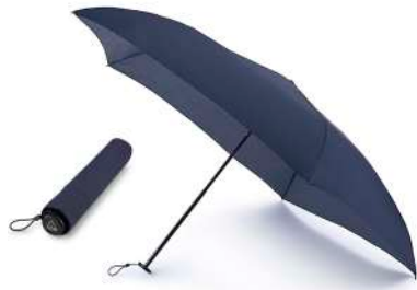
3. Navy - 50 20815 037256