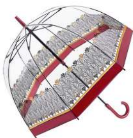
5. Art Deco - 50 20815 040539