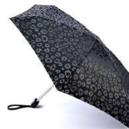
8. Luxury Leopard - 50 20815 040645