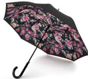
8. English Garden - 50 20815 039762