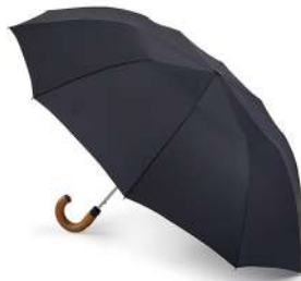
2. Gingham - 50 20815 032916