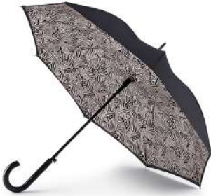
1. Animal Mix - 50 20815 041000