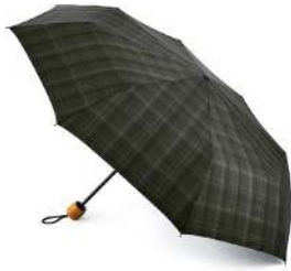
1. Charcoal Check - 50 20815 035276