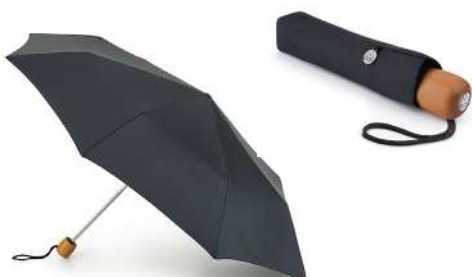
1. Black 50 20815 000274