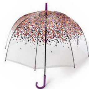
9. Hippie Scatter - 50 20815 038864