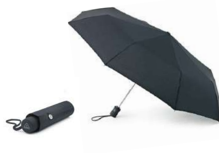
2. Black - 50 20815 012994