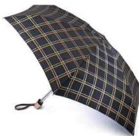
14. Golden Check - 50 20815 036747