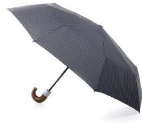
3. City Stripe Grey - 50 20815 014936