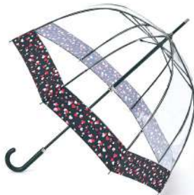
1. Love Hearts - 50 20815 040027