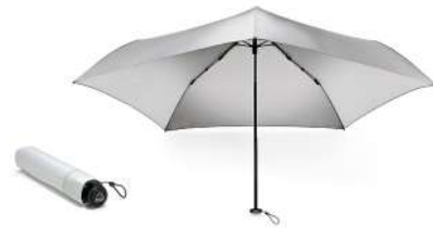
4. Grey - 50 20815 040072