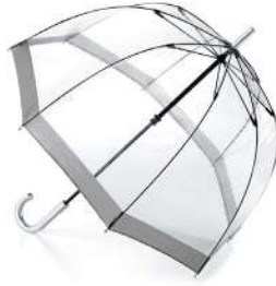
2. Silver - 50 20815 015599