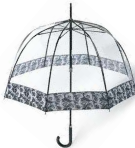
2. Photo Rose - 50 20815 034514