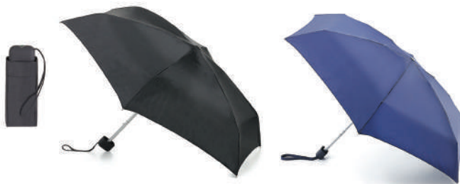
1. Black - 50 20815 008904