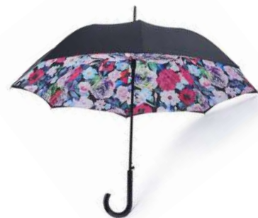
9. Vibrant Floral - 50 20815 039328