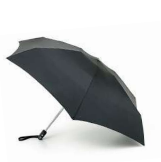
1. Black - 50 20815 007952