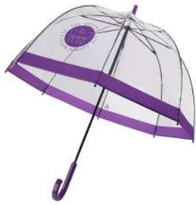
12. Jubilee - 50 20815 040409