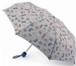
1. London Day Out - 50 20815 035535