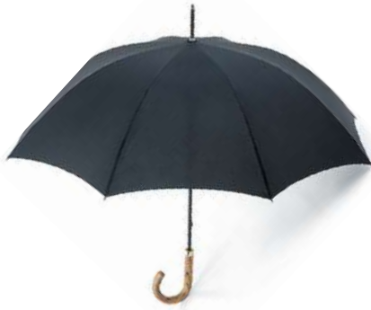
1. Black - 50 20815 001622