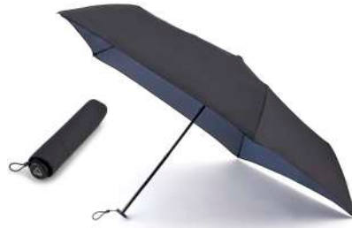
2. Black - 50 20815 037249