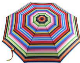
8. Retro Stripe - 50 20815 040577