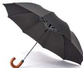
1. Black - 50 20815 000632