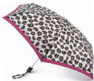
16. Leopard Border - 50 20815 039359