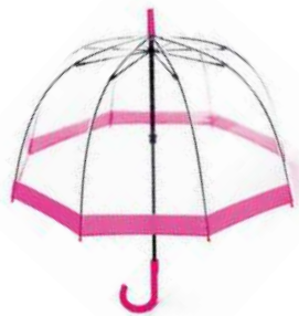
5. Pink - 50 20815 015889