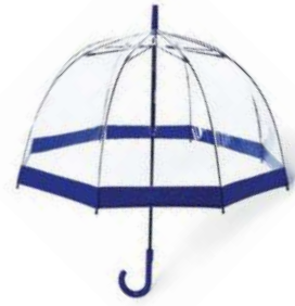
3. Navy - 50 20815 024157