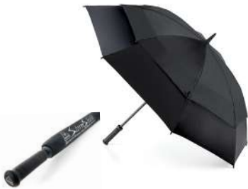
1. Black - 50 20815 005576