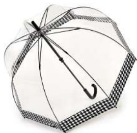
7. Houndstooth Border - 50 20815 039694