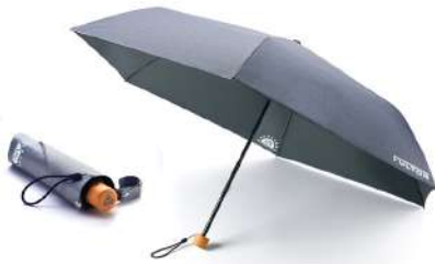
1. Blue Chambray - 50 20815 040065