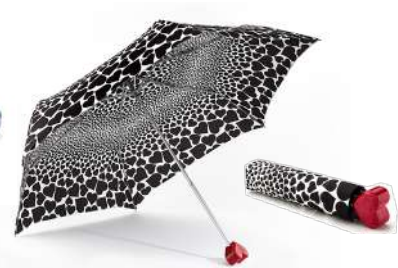
3. Falling Hearts - 50 20815 040003