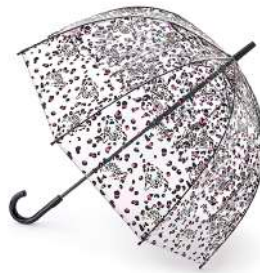
13. Leopard Camo - 50 20815 036549