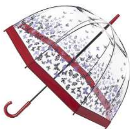
4. Butterfly Dream - 50 20815 040546