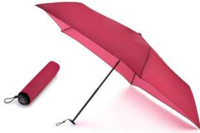
1. Dark Red - 50 20815 037263