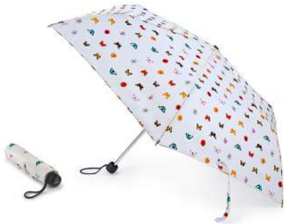
1. Butterflies & Flowers - 50 20815 040959