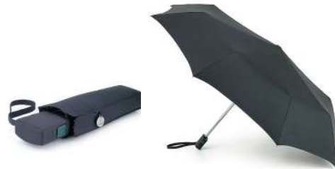
1. Black - 50 20815 003152