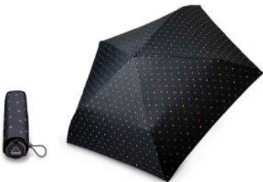
1. Spotty Spot - 50 20815 039793