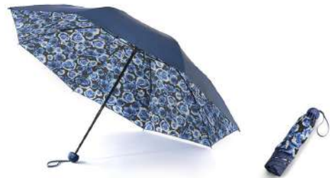
1. China Rose - 50 20815 040102