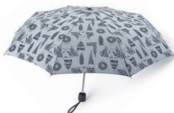
2. London Landmarks - 50 20815 035542