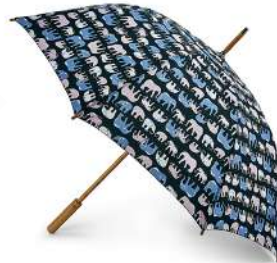
1. March Elephants - 50 20815 039847