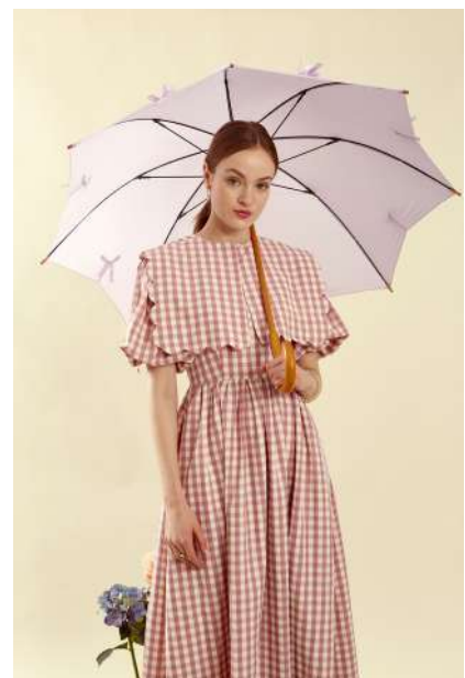
L908-Kensington-Star Lilac Open-2