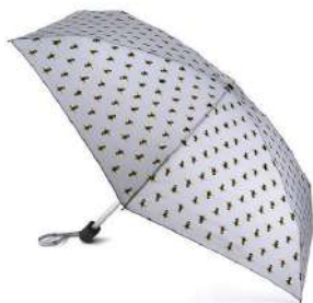
13. Bees - 50 20815 032572