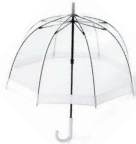
8. White - 50 20815 015582