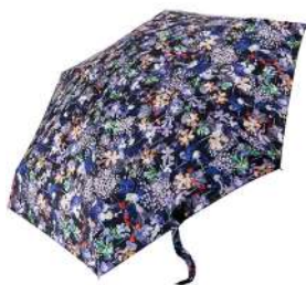
7. Digital Nature - 50 20815 040621