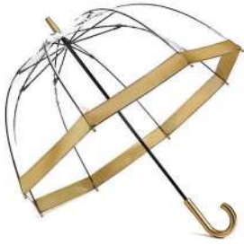
1. Gold - 50 20815 005804