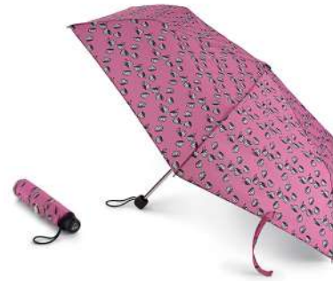
2. Tea Lovers - 50 20815 040942