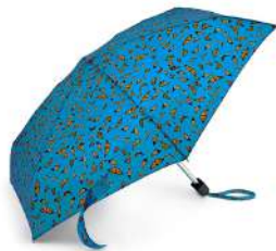
2. Monarch Butterflies - 50 20815 040836