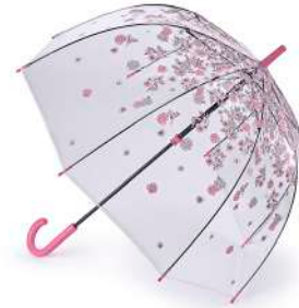
14. Sketchy Sprigs - 50 20815 037614