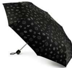
5. Zodiac - 50 20815 040935