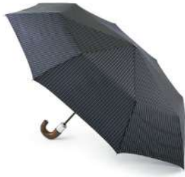
2. City Stripe Navy/Cloud - 50 20815 024188