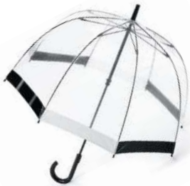
7. Black and White - 50 20815 015865