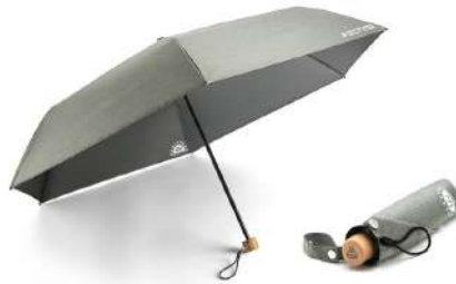
2. Charcoal Chambray - 50 20815 040058