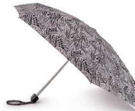
3. Animal Mix - 50 20815 040874