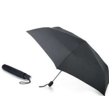
1. Black - 50 20815 013274