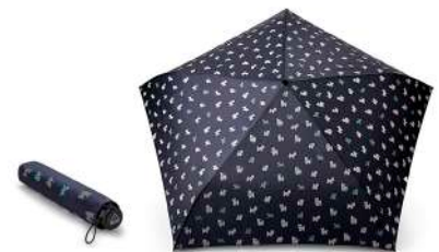
3. Furry Friends - 50 20815 039816