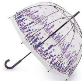
3. Flower Field - 50 20815 039311