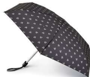
12. Sidney Squirrel - 50 20815 038697