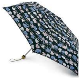
1. Marching Elephants - 50 20815 039830