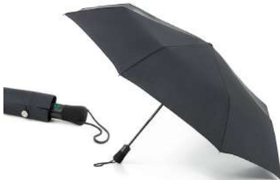
1. Black - 50 20815 010259