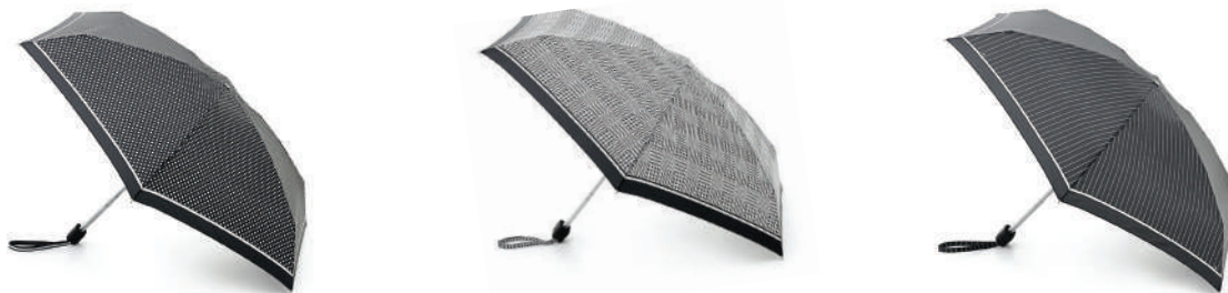
1. Tiny Classics Black (Set of 3) - 50 20815 020449