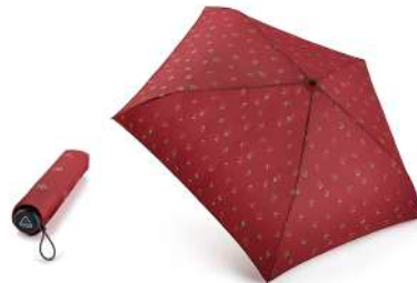
2. Rose Bud - 50 20815 039809