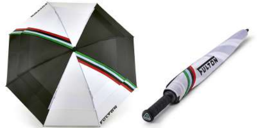
1. Stripe - 50 20815 039861