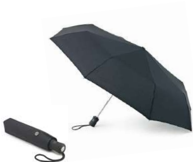
1. Black - 50 20815 000175