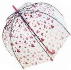
1. All-Over Butterflies - 50 20815 040966