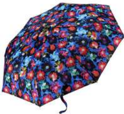
7. Trippy Bloom- 50 20815 040584