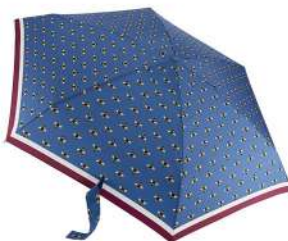
6. Bee Border - 50 20815 040614