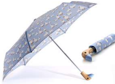
2. Duck Curio - 50 20815 039984