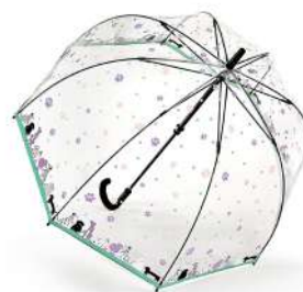
6. Dog & Bone - 50 20815 039717