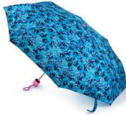
2. Cool Pansy - 50 20815 040911