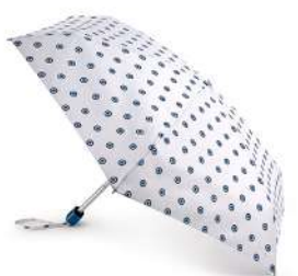
4. Evil Eye - 50 20815 040850