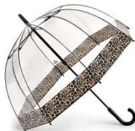
8. Puma Border - 50 20815 039687