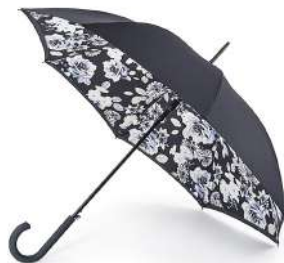
5. Mono Floral - 50 20815 028148