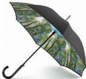
7. Sunburst - 50 20815 036600