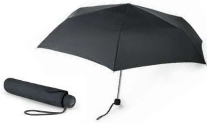
1. Black - 50 20815 011171