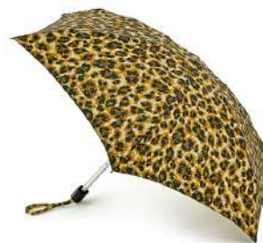
15. Bling Leopard - 50 20815 037621