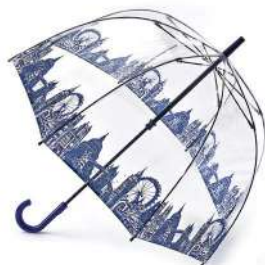
10. London Icons - 50 20815 028292