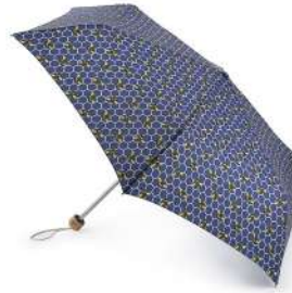
2. Beehive - 50 20815 040522