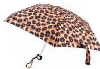
9. Ocelot - 50 20815 040638