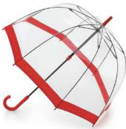
4. Red - 50 20815 020517