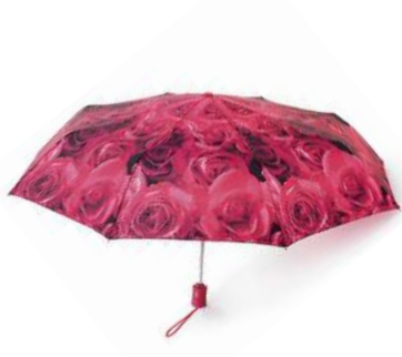
1. Photo Rose Red - 50 20815 020388