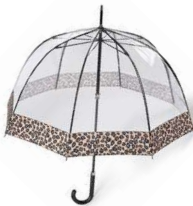
4. Natural Leopard - 50 20815 037775