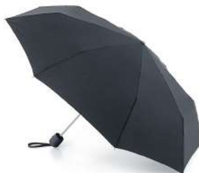
1. Black - 50 20815 000656