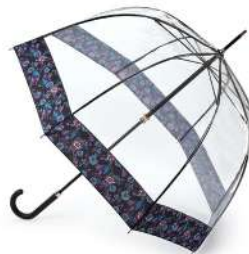
5. Luminous Floral - 50 20815 034507