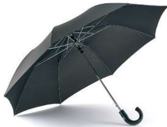
1. Black - 50 20815 000649