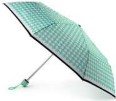
1. Minty Houndstooth - 50 20815 040898