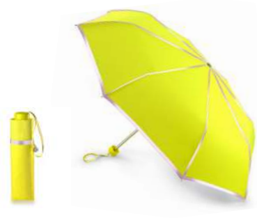
1. Neon - 50 20815 040881