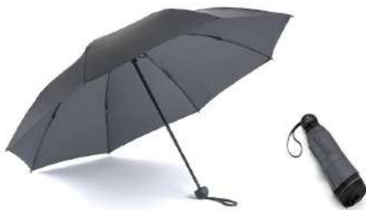
1. Black & Charcoal - 50 20815 040096