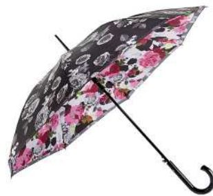
3. Garden Party - 50 20815 040553