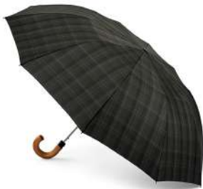
1. Charcoal Check - 50 20815 032909