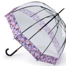
3. Digital Blossom - 50 20815 037768