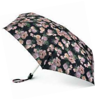
10. Rococo Rose - 50 20815 039724