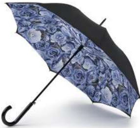
4. Liquid Rose - 50 20815 038796