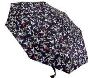
6. Butterfly Burst - 50 20815 040560