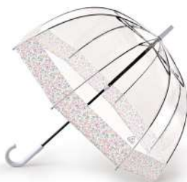
11. Wedding Floral Border - 50 20815 039700