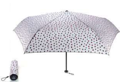
4. Funky Leopard - 50 20815 040089