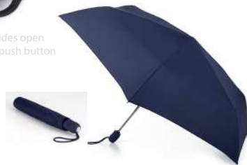
2. Navy - 50 20815 037386

Handle slides open to reveal push button