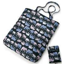
1. March Elephants - 50 20815 039854