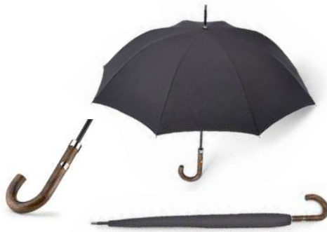
1. Black - 50 20815 037577