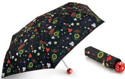
1. Trippy Casino - 50 20815 040751