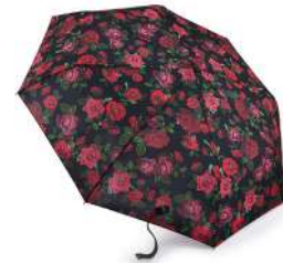
9. Dark Romance - 50 20815 039755