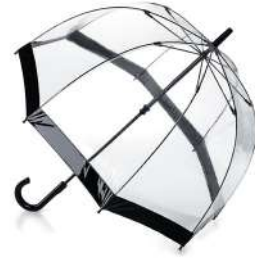
6. Black - 50 20815 015605