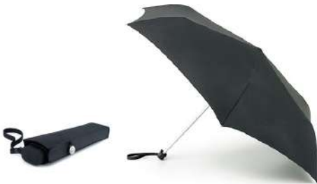
1. Black - 50 20815 000076