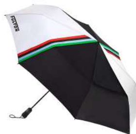
1. Stripe - 50 20815 040607