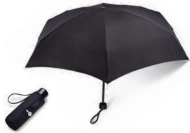
1. Black - 50 20815 031094