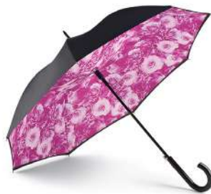
2. Neon Floral - 50 20815 041017