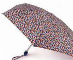
5. Ditsy Pop - 50 20815 040867