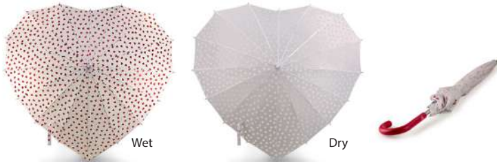
1. Red Hearts Colour change print - 50 20815 041031