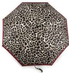
10. Lustrous Leopard - 50 20815 039748