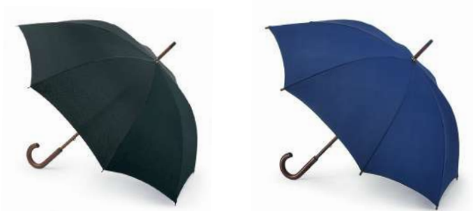
1. Black - 50 20815 025147