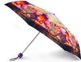
3. Flamingo Sunset - 50 20815 040904