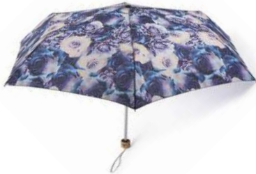
1. Natural Bloom - 50 20815 039540