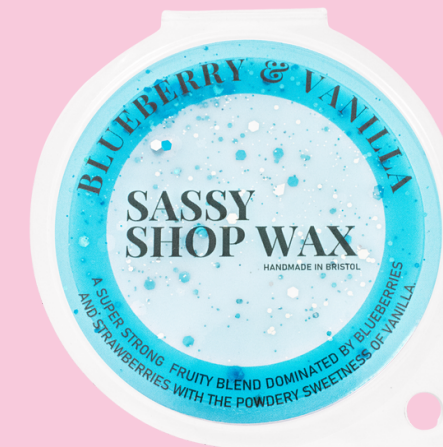
BLUEBERRY & VANILLA