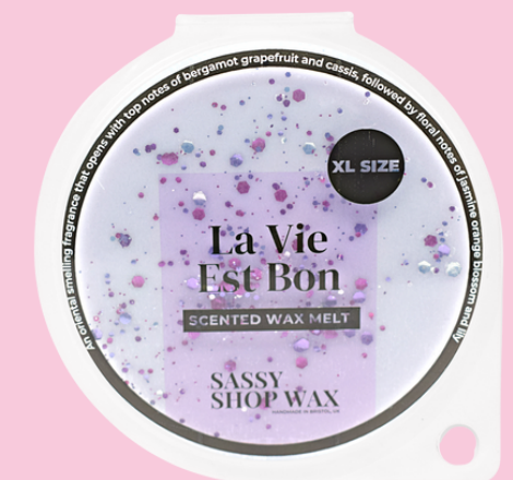
LA VIE EST BON