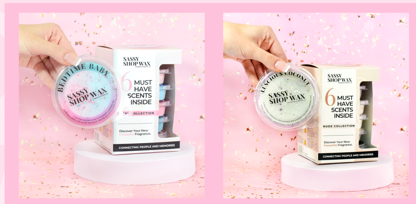
COLLECTION GIFT BOXES