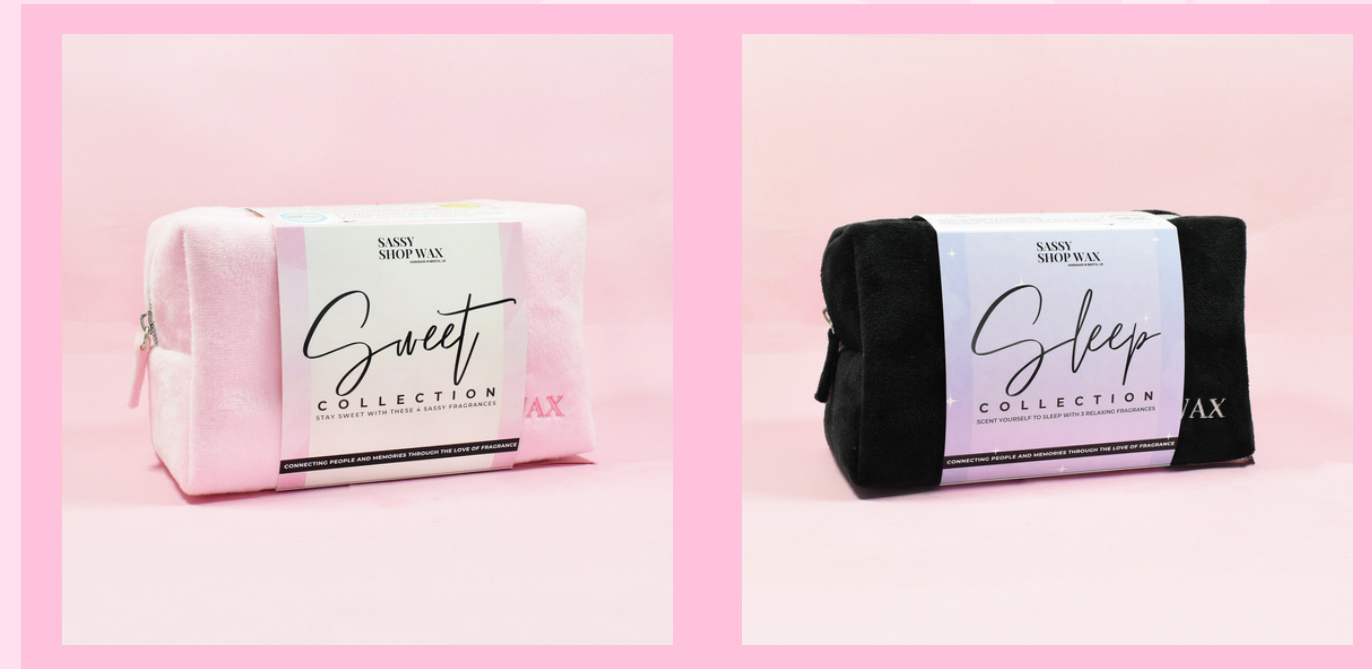
SWEET AND SLEEP COLLECTION BAGS