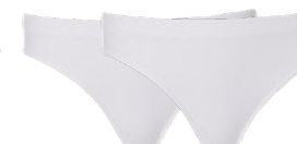
Bikini Brief white