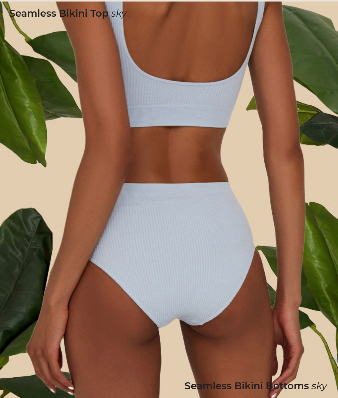
Seamless Bikini Top sky