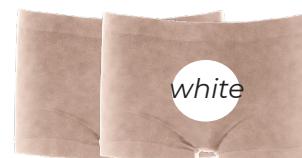
Boy Short white