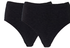
High-rise Brief black