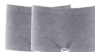
Boy Short grey