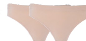
Bikini Brief nude