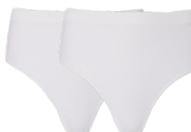
High-rise Brief white