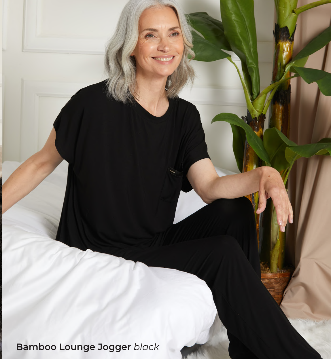
Bamboo Lounge Jogger black