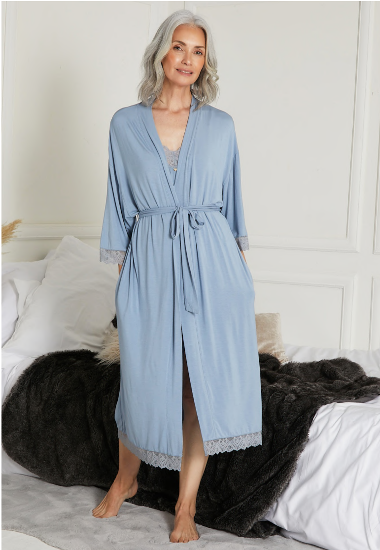
Bamboo Lace Kimono blue mist

By combining our best-selling Bamboo nightwear with a delicate lace trim for the fiercely desirable BAMBOO LACE collection. Adding a glamorous touch to sophisticated silhouettes for the most elegant of nightwear styles. Arriving Spring 2023.