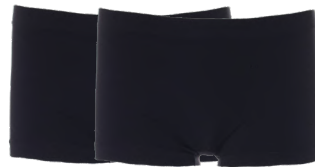
Boy Short black