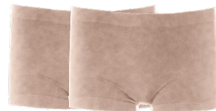
Boy Short nude