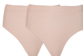
High-rise Brief nude