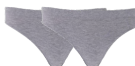
Bikini Brief grey