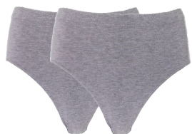
High-rise Brief grey