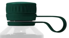
Hyde Park Green