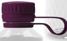
Notting Hill Violet