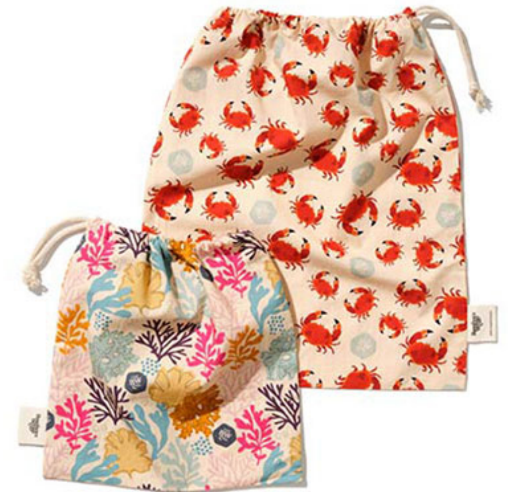
Two Reusable Cotton Bags

1 x Large (33 x 40cm) 1 x Medium (28 x 28cm)