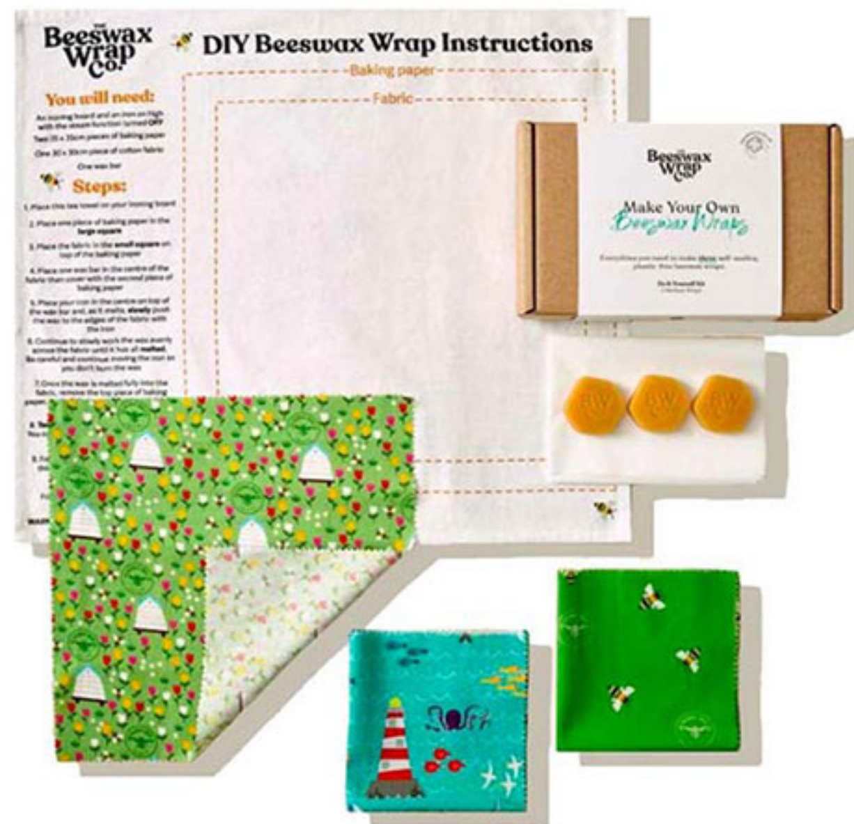
DIY Beeswax Wrap Kit available in Meadow/Mixed/Sea Vegan option available

Includes: Three Fabric Squares, Printed Tea Towel, 3 Beeswax Rewax Bars and 3 Baking Paper Sheets