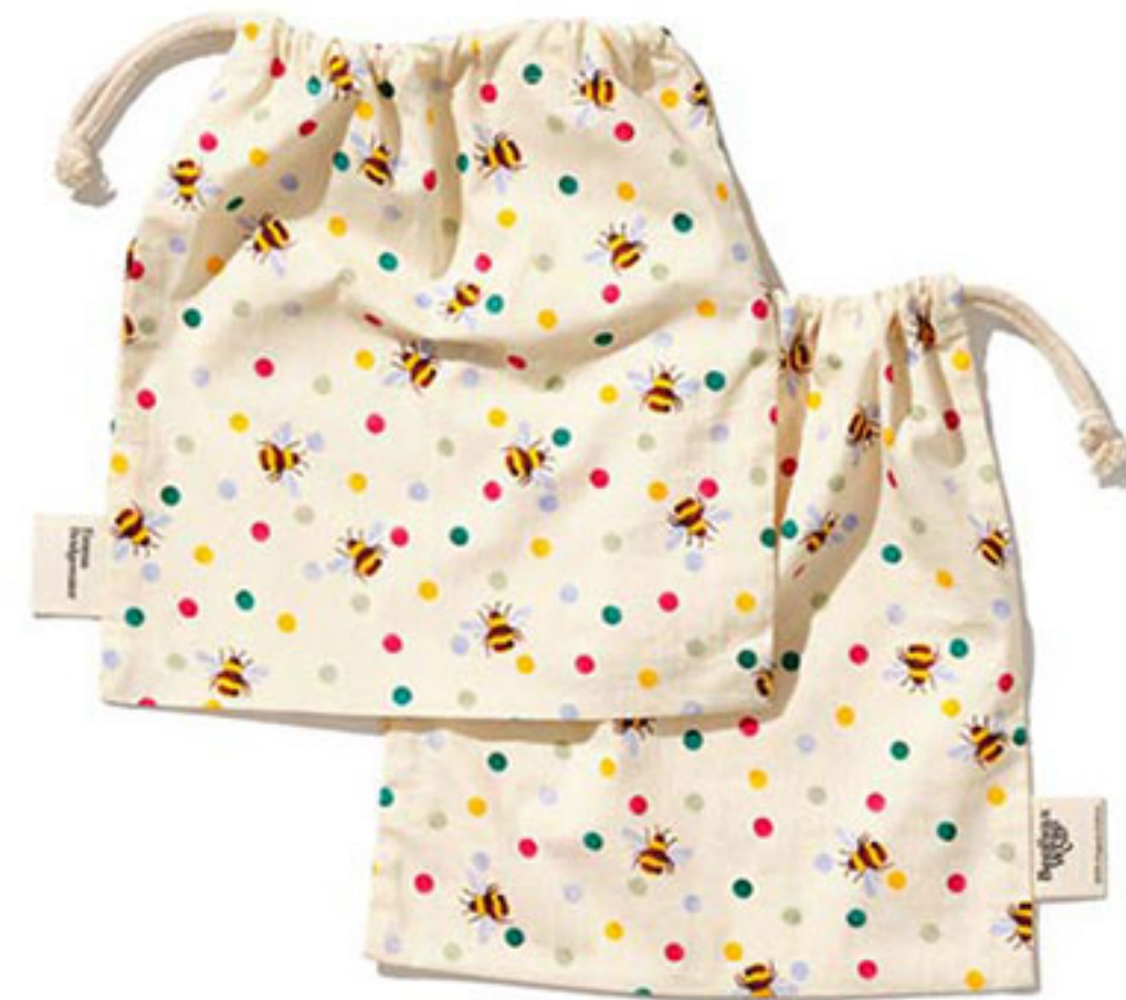
Polka Dot & Bee Reusable Cotton Bags 2 x Medium Bags (28 x 28cm)

We have a beautiful collection of Emma Bridgewater products. Our newest additions include a Set Of Two Reusable Cotton Bags in our best-selling Polka Dot & Bee print and a One Metre Roll. Just as popular as we thought it would be, our Emma Bridgewater 1m Rolls are the latest bestseller in our range.