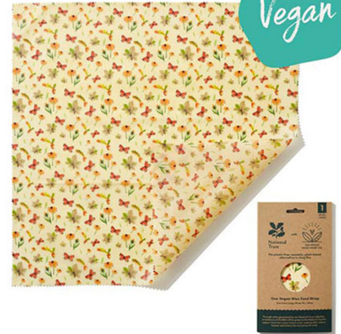
National Trust Autumn Leaves Vegan Wax Wraps in our full range of pack sizes

2 Combo, RRP £12.00 3 Combo, RRP £20.00 5 Combo, RRP £30.00 1 XL, RRP £16.00