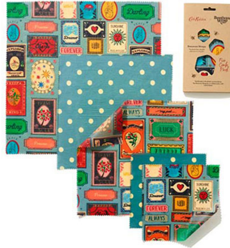
Cath Kidston Affirmations Beeswax Wraps in our full range of pack sizes

Our new Cath Kidston Affirmation print is full of the timeless Cath Kidston design we all know and love . Beautiful handpainted positive messages with a fun modern twist. Partnered with their classic Denim Spot.