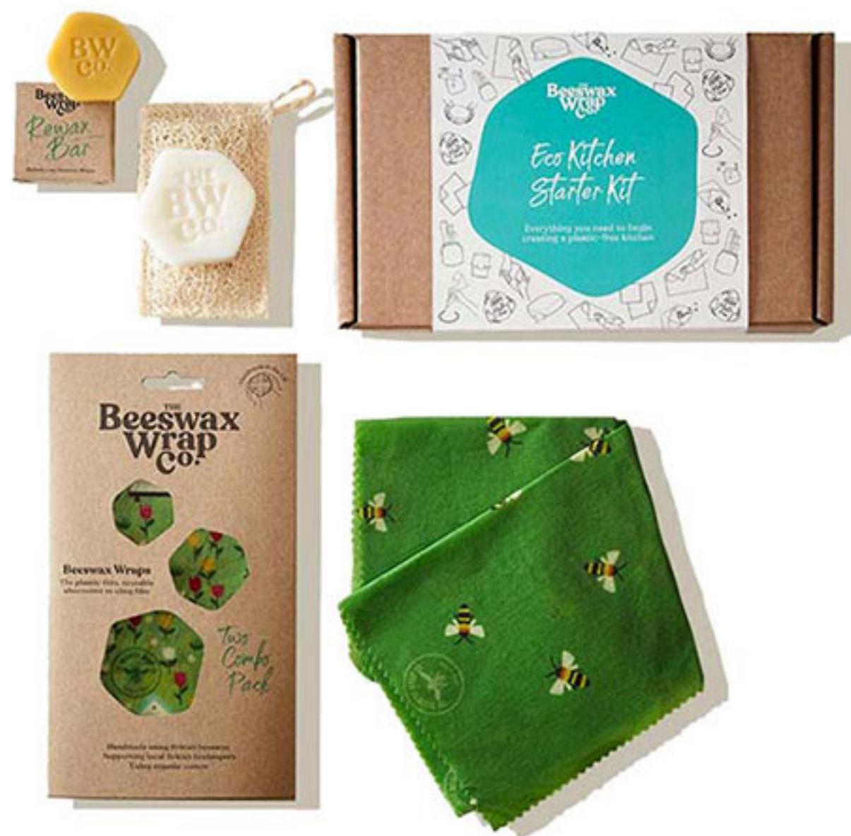
Eco Kitchen Starter Kit available in Land/Sea/Floral Vegan option available

Inspired by our own search for eco friendly gifts , our collection of sustainable gift bundles include our bestselling products and our clever DIY wax wrap kits, packaged in shelf ready kraft gift boxes.