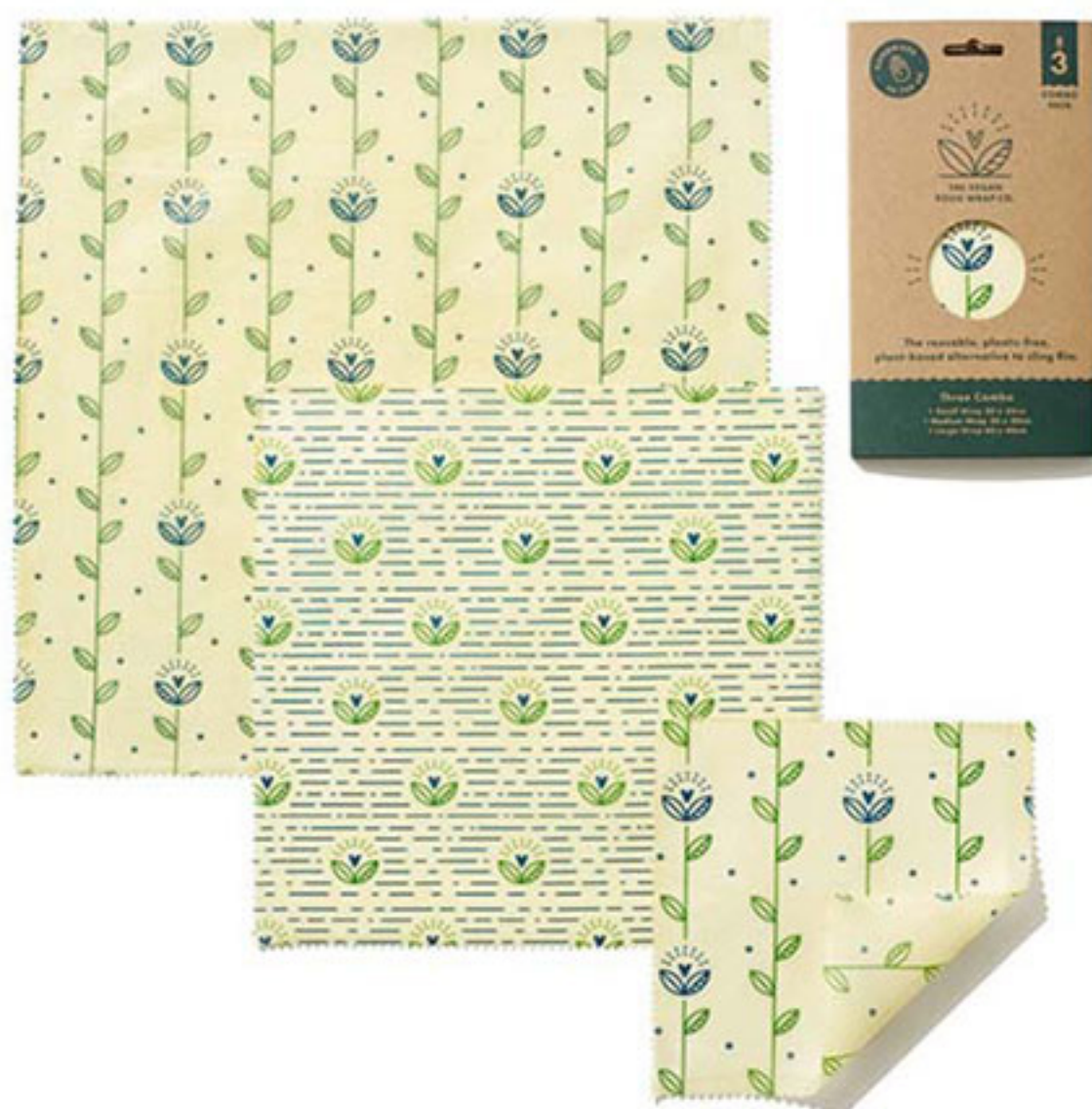
Harvest Print Vegan Wax Wraps in our full range of pack sizes

Our plant-based wax wraps are proudly vegan society certified and both soy and palm oil free . Each wrap is handmade by us from organic jojoba oil, pine resin and GMO free sumac, sunflower and rice bran wax.