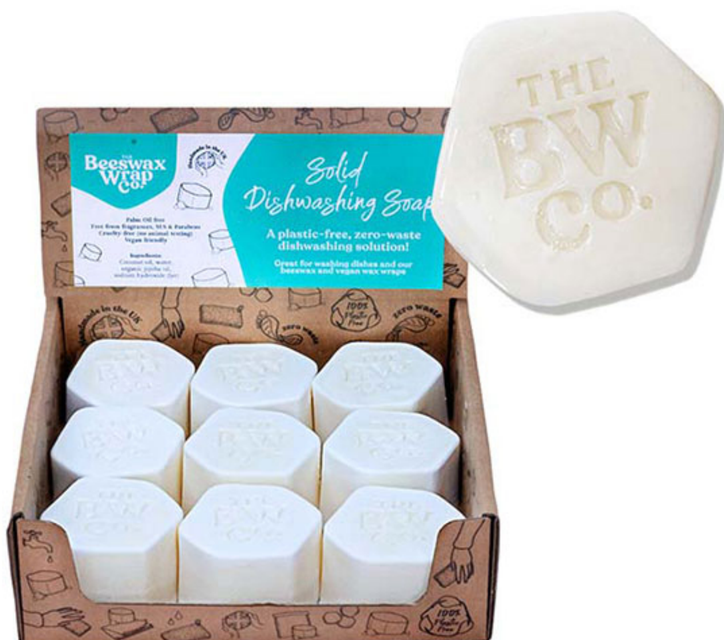
Solid Dishwashing Soap supplied in shelf ready box of 9

As we grow our range of simple plastic-free swaps we want to ensure we are always offering the highest quality . We proudly hand make all of our soaps here in our solar-powered workshop in the Cotswolds.