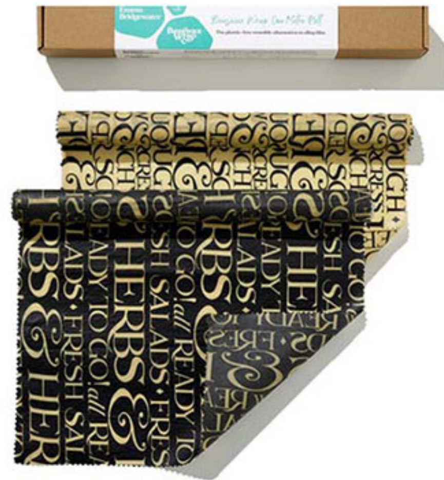
Emma Bridgewater Beeswax Wrap One Metre Roll in White or Black Toast