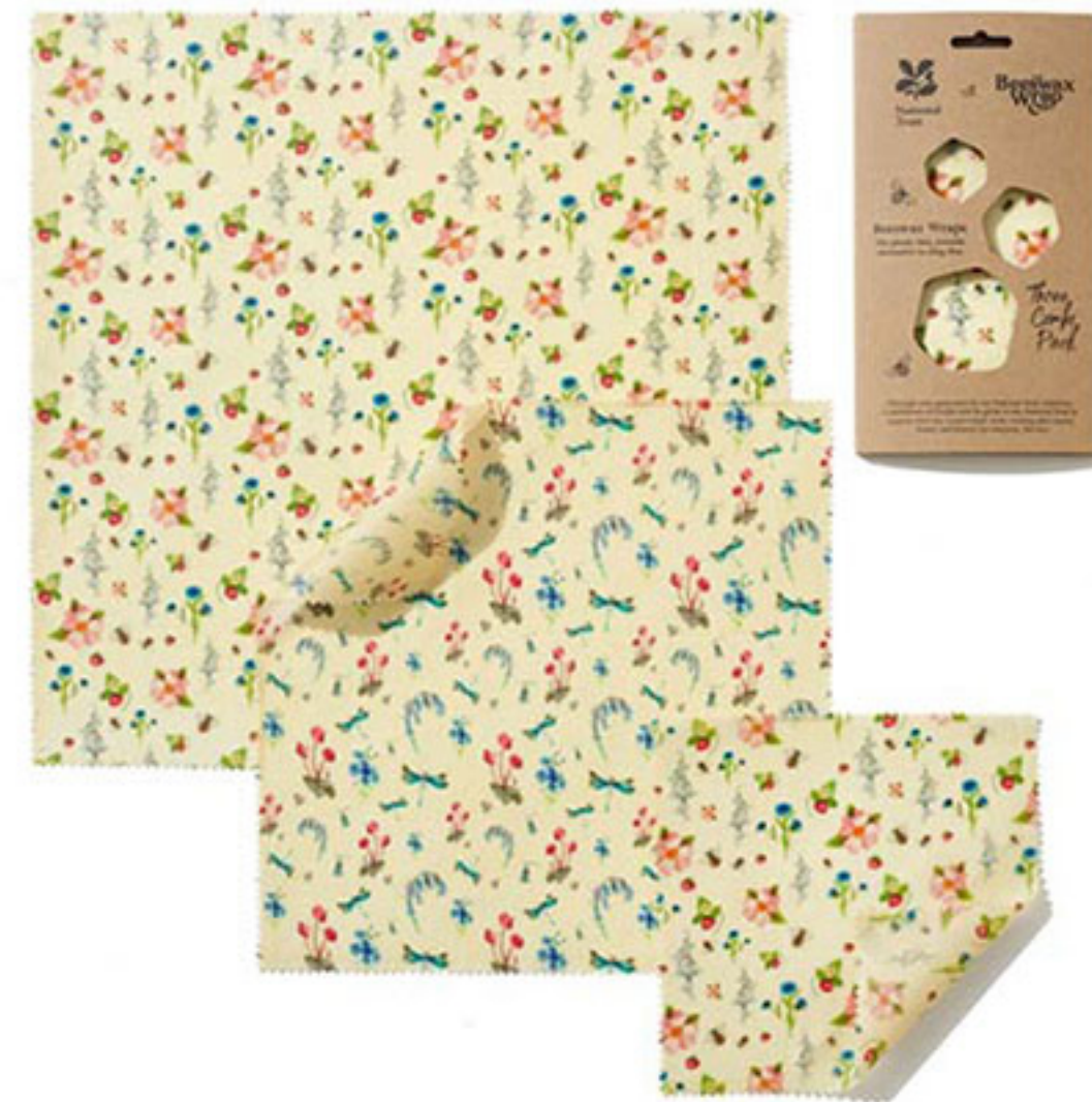
National Trust Summer Blooms Beeswax Wraps in our full range of pack sizes

The collection celebrates the wildflowers and pollinators found in our much loved countryside throughout the spring and summer months. A proportion of sales from every pack goes directly to the National Trust, supporting their bee conservation work.