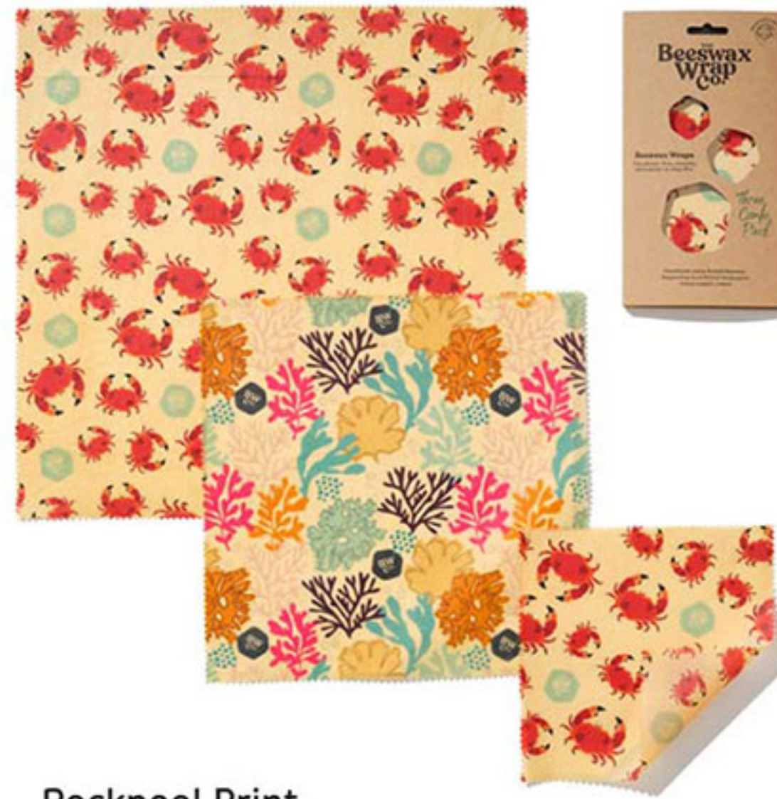
Rockpool Print Beeswax Wraps 3 Combo Pack