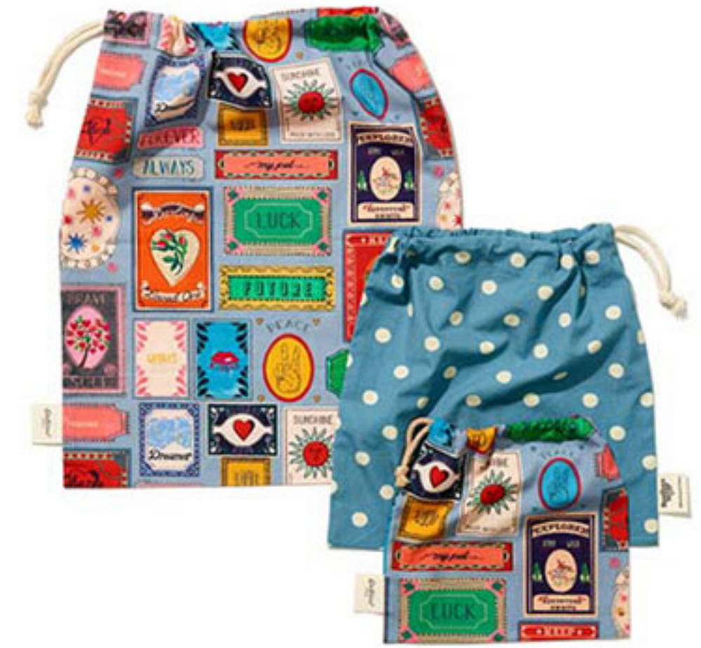
Cath Kidston Affirmations Set Of 3 Cotton Bags

2 Combo, RRP £12.00 3 Combo, RRP £20.00 5 Combo, RRP £30.00 1 XL, RRP £16.00