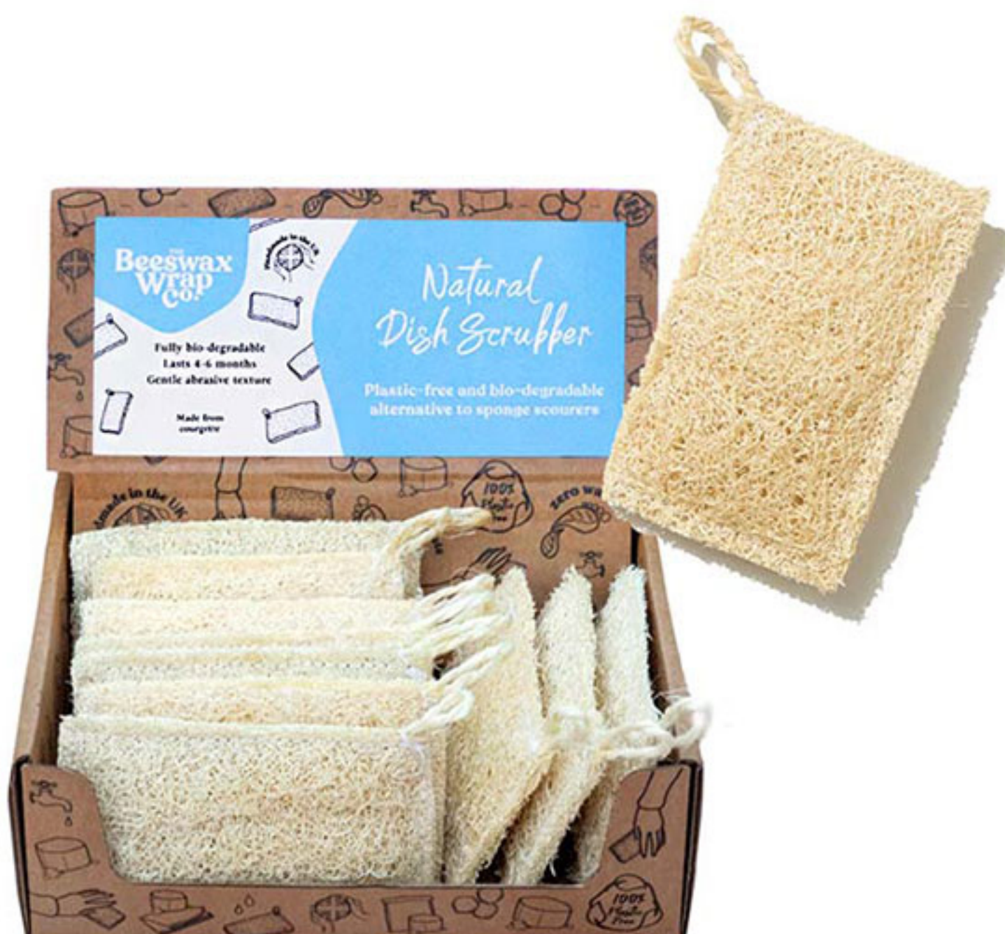
Natural Dish Scrubber supplied in shelf ready box of 10