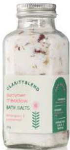
Bath Salts 335g Epsom and Himalayan salts, dried flowers