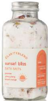
Bath Salts 335g Epsom and Himalayan salts, dried flowers