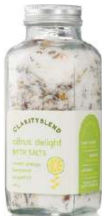
Bath Salts 335g Epsom and Himalayan salts, dried flowers