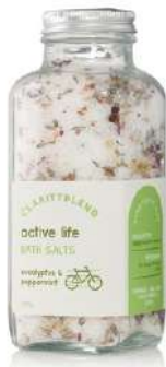
Bath Salts 335g Epsom and Himalayan salts, dried flowers