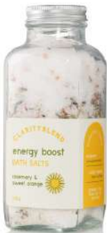
Bath Salts 335g Epsom and Himalayan salts, dried flowers