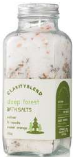
Bath Salts 335g Epsom and Himalayan salts, dried flowers