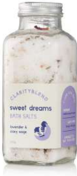
Bath Salts 335g Epsom and Himalayan salts, dried flowers