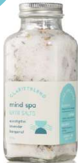
Bath Salts 335g Epsom and Himalayan salts, dried flowers