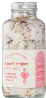
Bath Salts 335g Epsom and Himalayan salts, dried flowers