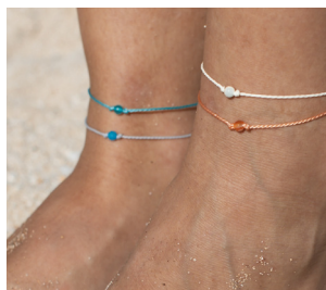
Soma Beach Anklet RRP £4.50