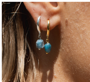
Asri Natural Stone Huggie Hoop Earrings RRP £11-12.00