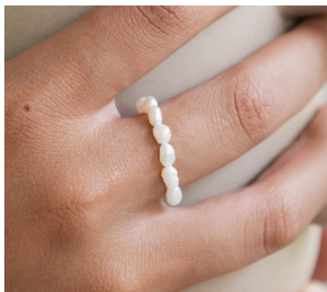
Pdang Pearl Elastic Ring RRP £8.00