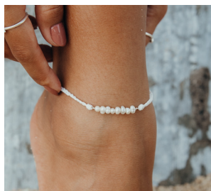
Lahaina Pearl Anklet RRP £6.50