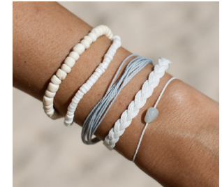
Pemuteran Handmade Bracelet Set RRP £19.00