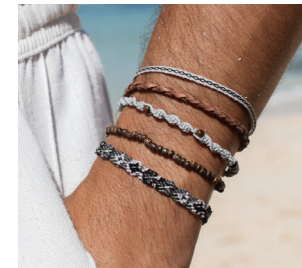
Sundara Bracelet Set RRP £18.50