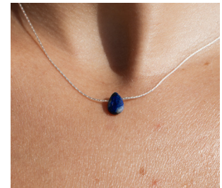
Samudra Lapis Lazuli Stone Necklace RRP £11.00

Necklaces designed with the ocean in mind. Celebrating the coast and surf culture, these products are the ideal choice for those who always crave the sand between their toes.