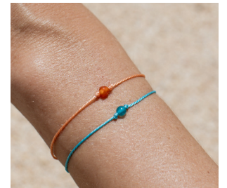
Soma Beach Bracelet RRP £4.00

Gender neutral friendship bracelets, created to mix'n'match into your own unique and stylish combinations.