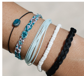
Ayana Handmade Bracelet Set RRP £22.00