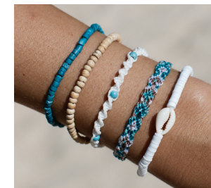
La Brisa Handmade Bracelet Set RRP £19.00

The seasons are finally changing, and we've got the perfect bracelet sets for it! We've put together combinations of new and bestselling bracelets that are the ideal addition to your beach-ready outfits this summer.