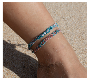
Leme Surf Anklet RRP £5.00