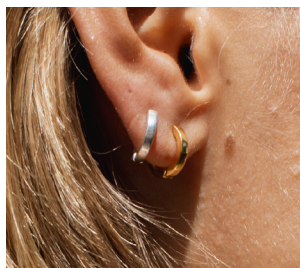
Balian Beach Huggie Hoops RRP £11-12.00