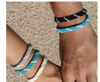
Catur Woven Bracelet RRP £4.00