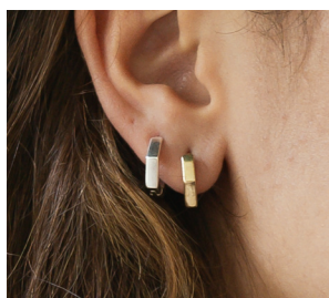
Padma Hexagon Hoop Earrings VRRP £11-12.00