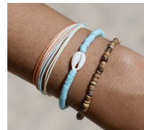
Balian Beach Bracelet Set RRP £10.50