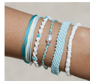
Crystal Bay Bracelet Set RRP £18.50