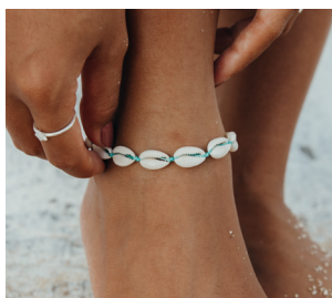
Livadi Cowrie Shell Anklet RRP £5.00