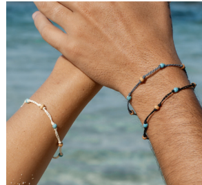
Oberoi Beach Bracelet RRP £4.50