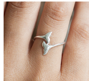
Whale Tail Wrap Ring RRP £6.50

Affordable and ethically created rings, inspired by the coast and plated in either silver or 18k gold.