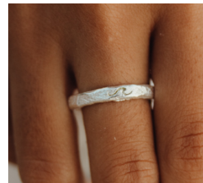
Flow With It Engraved Wave Ring RRP £6.50