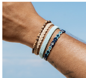
Cattamaran Bracelet Set RRP £14.00