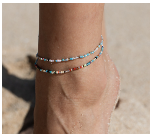
Alila Dainty Beaded Anklet RRP £4.50