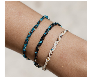
Sofitel Beaded Bracelet RRP £4.00