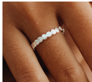
Dainty Dot Ring RRP £5.50