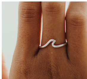
Surfer Girl Wave Ring RRP £5.00