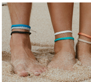
Medewi Handmade Surf Anklet RRP £4.50