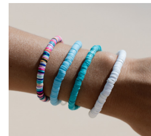
Leke Clay Beaded Bracelet RRP £4.00