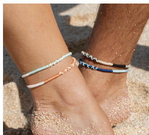
Rapture Woven Anklet RRP £4.50