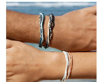
Malibu Lagoon Bracelet RRP £4.00

Add some excitement to your beach look this summer with our fun, sunshine-inspired handmade bracelets.