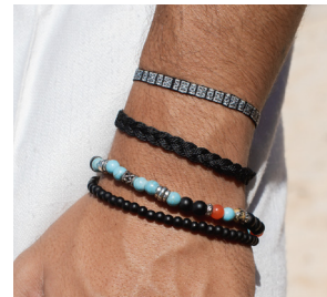
Savaya Handmade Bracelet Set RRP £21.00