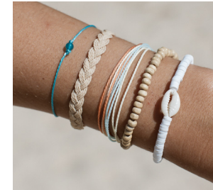
Palmilla Bracelet Set RRP £17.50