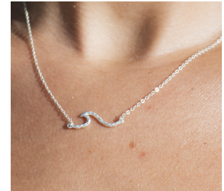
Asri Hammered Wave Necklace RRP £13.00