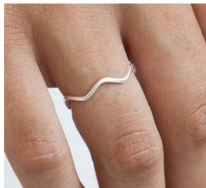
Deep Wave Ring RRP £6.00