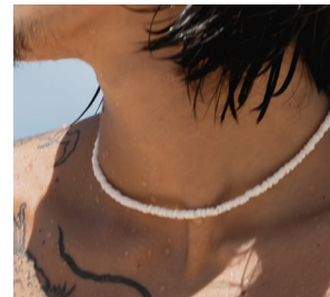
Padangbai Puka Shell Necklace RRP £12.00