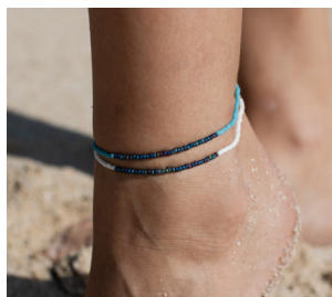
Puri Beaded Anklet RRP £4.50