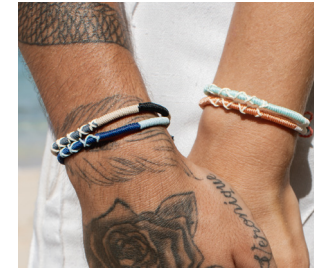
Rapture Woven Bracelet RRP £4.00