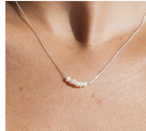
Asri Pearl Row Necklace RRP £16.00