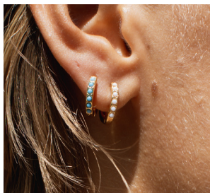
Surya Huggie Hoop Earring RRP £11.50