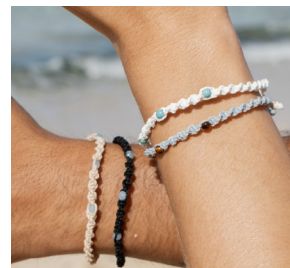
La Serena Bracelet RRP £5.00