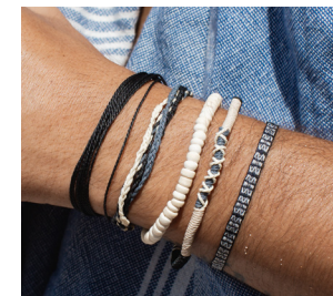
Berawa Bracelet Set RRP £18.00