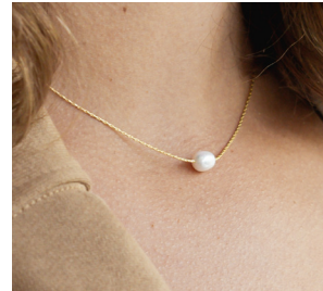
Ana Freshwater Pearl Necklace RRP £18.00