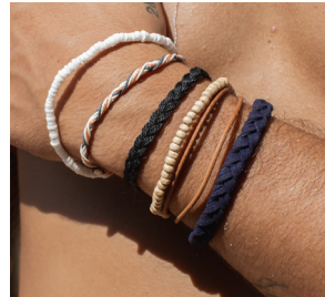
Mari Bracelet Set RRP £17.00