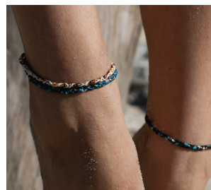
Sofitel Beaded Anklet RRP £4.50