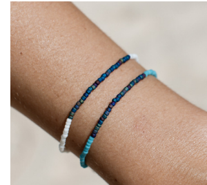
Puri Beaded Bracelet RRP £4.00