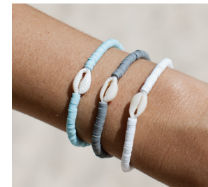
Baturiti Clay Beaded Bracelet RRP £4.00