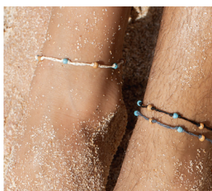
Oberoi Beach Anklet RRP £5.00

Designed to remind you of the sunshine and bring a smile to your face all year round. Featuring natural materials and vibrant ocean colours, these woven anklets are the perfect pairing for your bare ankles this summer!