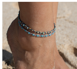
Vermelha Surf Anklet RRP £5.00