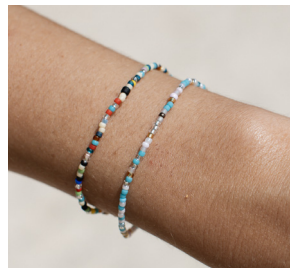
Alila Dainty Beaded Bracelet RRP £4.00