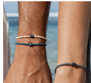
Samsara Letter Bracelet RRP £4.00