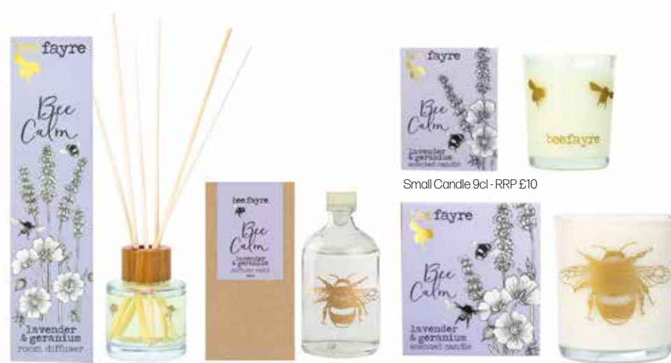
Room Diffuser 50ml - RRP £18

Fresh juicy orange and heavenly neroli blossom famed for its balance of bitterness and sweetness. An uplifting fragrance to boost your mind and mood.