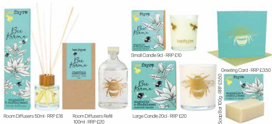
Room Diffusers 50ml - RRP £18