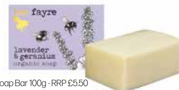
Soap Bar 100g - RRP £5.50