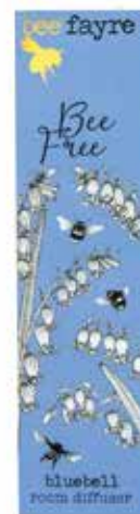
Room Diffuser 50ml - RRP £18