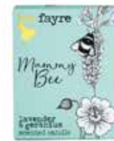
Small Candle 9cl - RRP £10