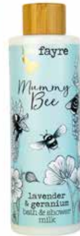
Bath & Shower Milk & Body Lotion 250ml - RRP £16 each