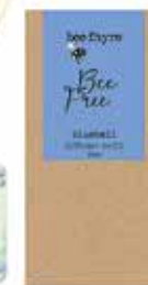
Room Diffuser Refill 100ml - RRP £20