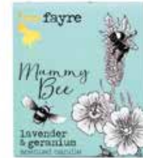
Large Candle 20cl - RRP £20