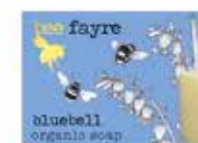
Soap Bar 100g - RRP £5.50