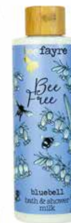
Bath & Shower Milk & Body Lotion 250ml - RRP £16 each