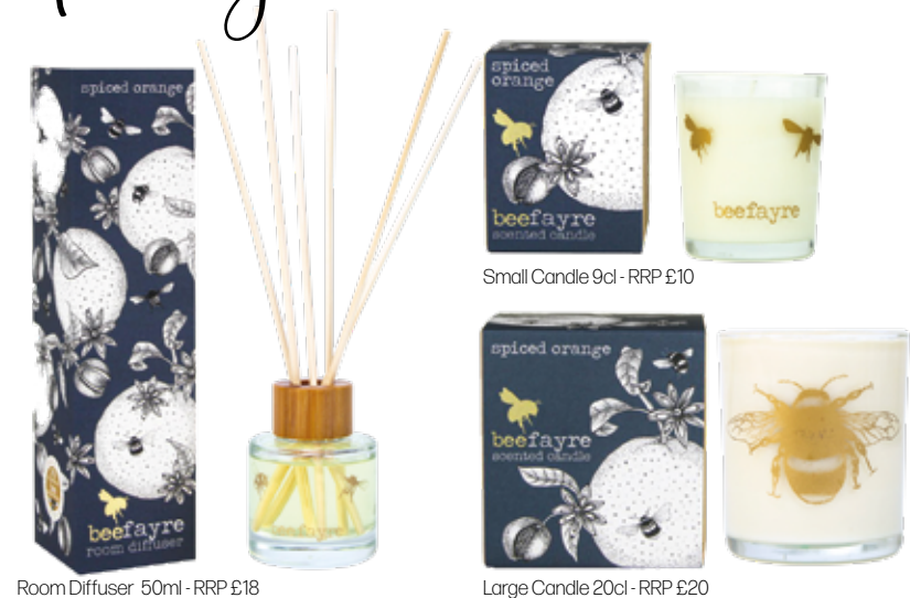
Room Diffuser 50ml - RRP £18

Bursting berries full of flavour with the sparkling fruity delight of nutmeg, orange and cinnamon giving a spicy elegant festive scent..