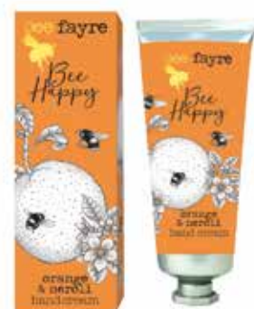
Hand Cream 60ml - RRP £10