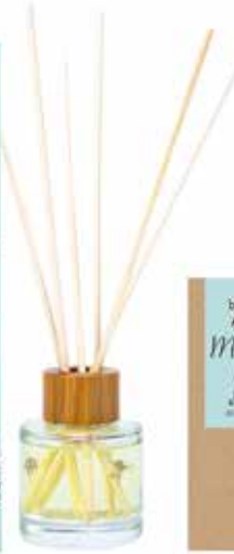
Room Diffuser Refill 100ml - RRP £20