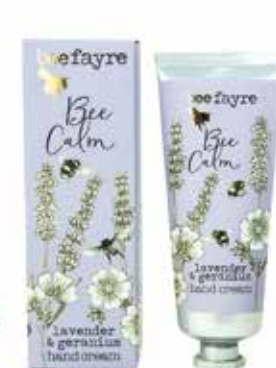
Hand Cream 60ml - RRP £10