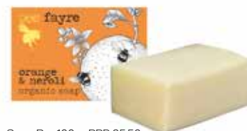
Soap Bar 100g - RRP £5.50