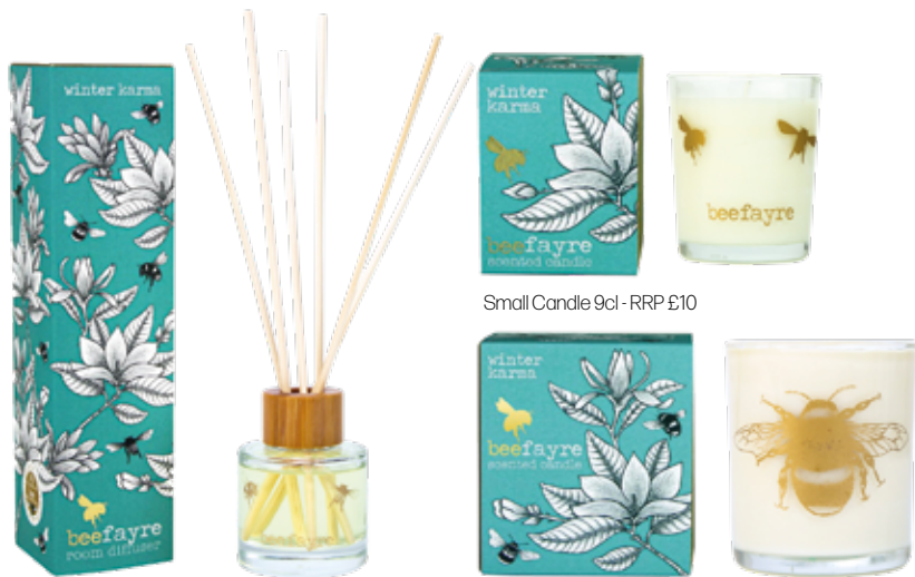
Room Diffuser 50ml - RRP £18