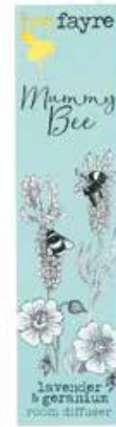
Room Diffuser 50ml - RRP £18