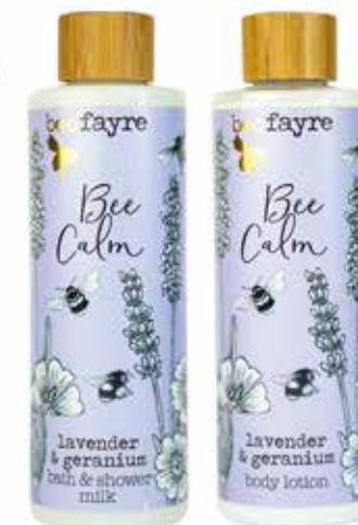
Bath & Shower Milk & Body Lotion 250ml - RRP £16 each