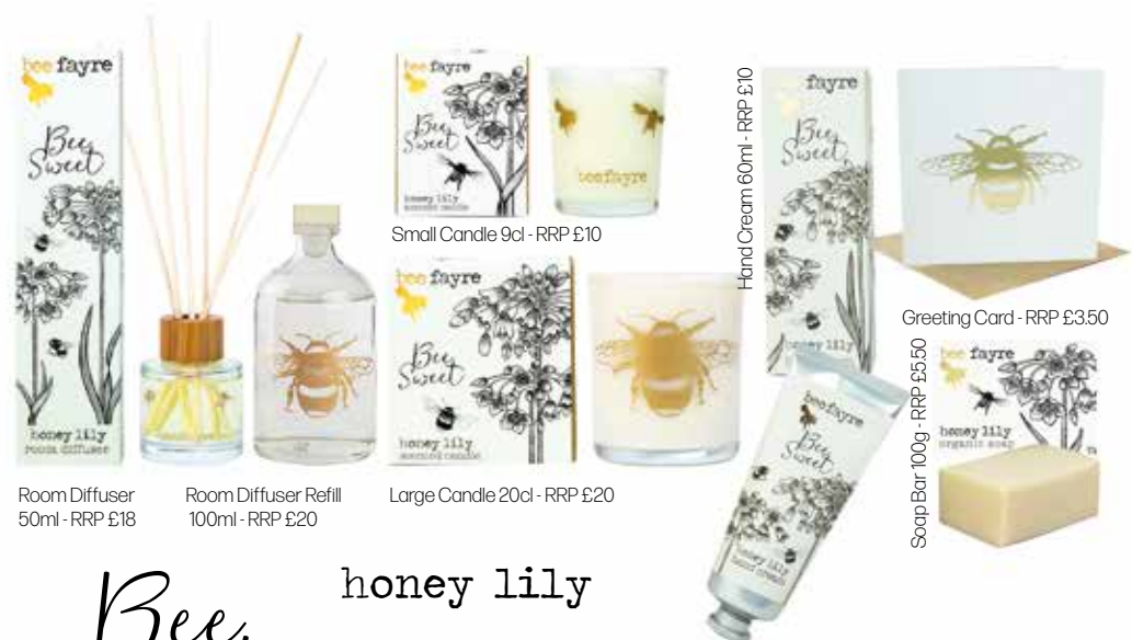
Room Diffuser 50ml - RRP £18

The sweet earthy aroma of mediterranean fresh ripe figs. Exotically intoxicating.