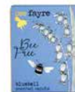
Small Candle 9cl - RRP £10