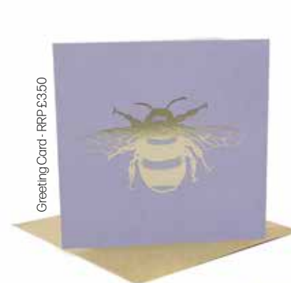
Greeting Card - RRP £3.50