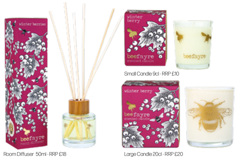
Room Diffuser 50ml - RRP £18

Bees act as a barometer of the health of our planet, if we look after them they will look after us!