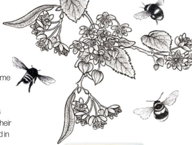
Artist & Founder