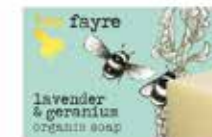
Soap Bar 100g - RRP £5.50