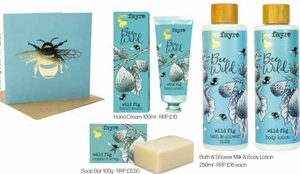
Hand Cream 100ml - RRP £10