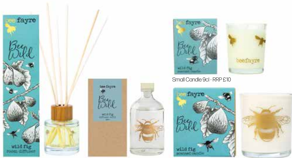
Room Diffuser 50ml - RRP £18