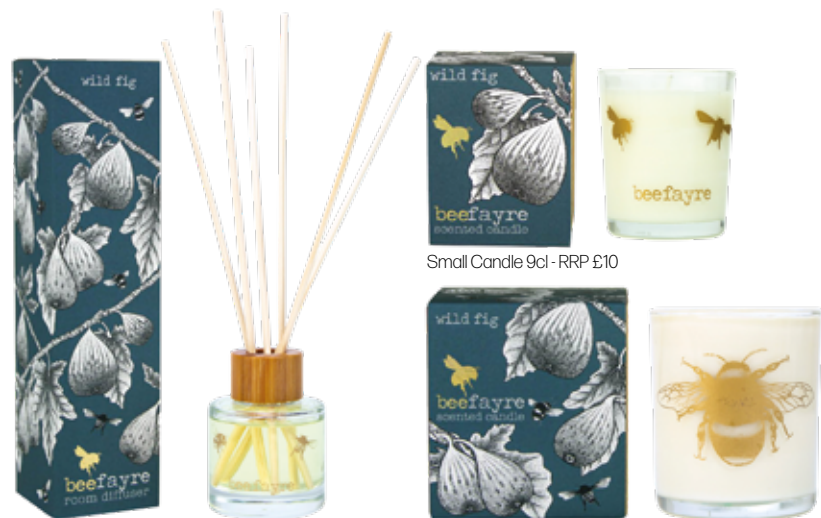
Room Diffuser 50ml - RRP £18

A deep woody scent with perfectly balanced top notes of magnolia and rich base notes of sandalwood. Bee karma creates a calming ambience in which to unwind.