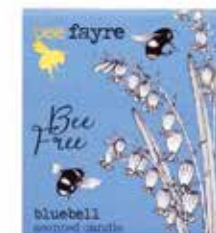
Large Candle 20cl - RRP £20