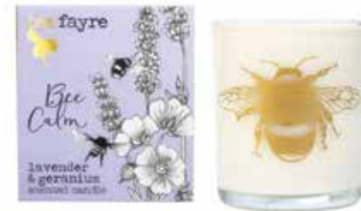
Large Candle 20cl - RRP £20