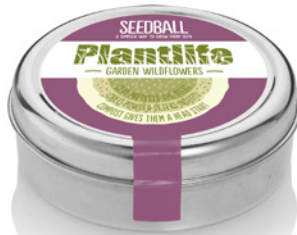
Plantlife Mix (supporting Plantlife)