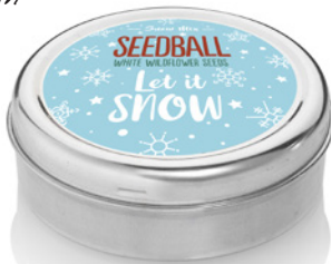
Let it Snow