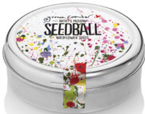
Artist's Meadow (supporting the Wildlife Trust)