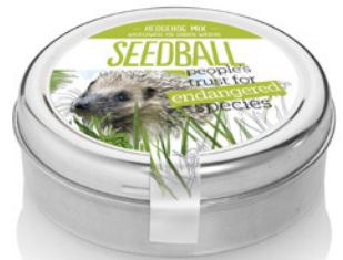
Hedgehog Mix (supporting the PTES)