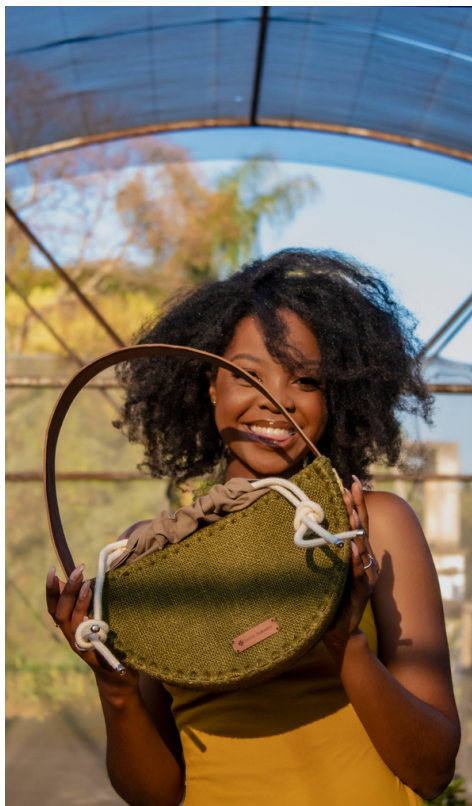
Mwedzi Shoulder Bag