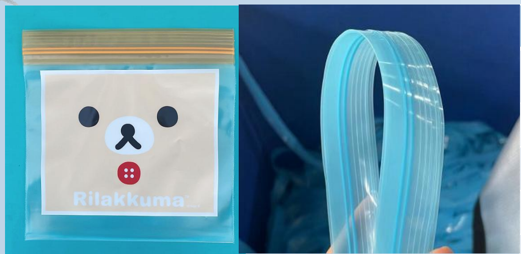
8.5g/m attached zipper