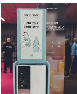
Hydration area sponsorships