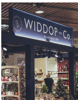
Rigged banner above your stand

Discover Autumn Fair's bespoke brand exposure, lead generation and thought leadership sponsorship packages! Prices start from just £100, these opportunities enhance your brand presence and help you to make a significant impact before and at the show: