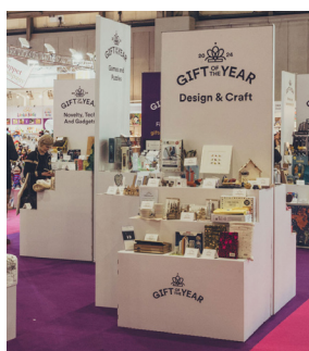
Product promotion in feature areas

Learn more about these and many more opportunities to help you make the most of your presence at Autumn Fair! If you would like to explore additional options or discuss any of these opportunities, please contact our team.