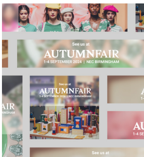
Sectorised webpage adverts