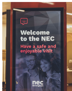
Digital screens around the NEC