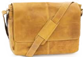
Columbia Messenger Bag - 1806 40 × 10 × 35 cm