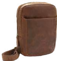
Sling Bag - 1037 19 x 7.5 x 25 cm