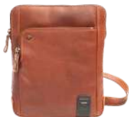
Crossbody Bag – 7353 21 × 4 × 24 cm