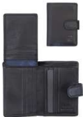
Card Holder Wallet - 3104 11 x 8 cm