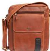
Flight / Crossbody Bag – 7354 21 × 4 × 24 cm