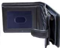
Bifold RFID Tab Wallet - 3144 11 X 9 cm