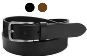
Belt 007 width 35mm