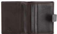
Bifold Wallet - 2217 10 × 8 cm