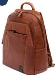
Large Rucksack – 7377 30 × 11 × 35 cm