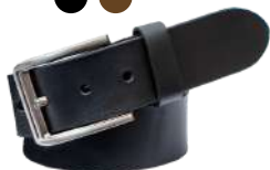
Belt style 10 width 40mm