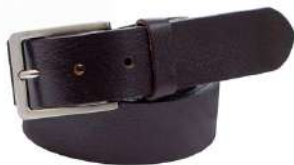
Belt 210 width 35mm