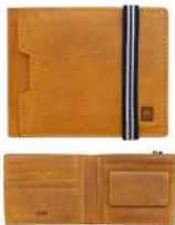
Columbia Bifold Wallet - 1807 12 × 2 × 9 cm