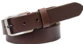
Belt 20 width 30mm