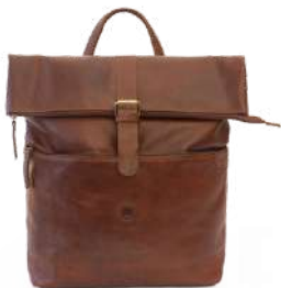
Rolltop Rucksack - 2001 41 × 9 × 41 cm