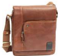
Flapover Messenger Bag – 7357 21 × 4 × 24 cm