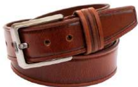
Belt style 300 width 35mm