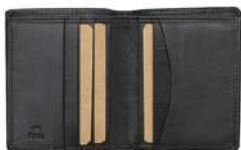
Trifold Credit Card Holder - 2334 10.5 × 9.5 cm