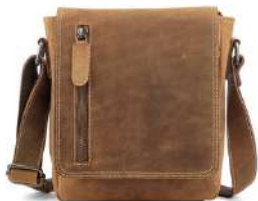
Small Messenger - 1046 22 x 6 x 18 cm