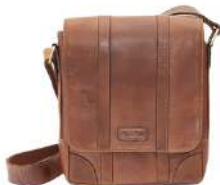
Small Messenger - 673 25 × 7 × 29 cm