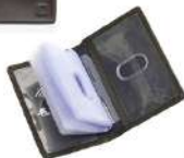
Credit Card Holder - 3100 11 x 7.5 cm