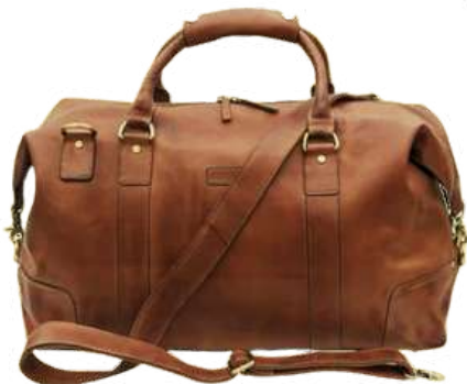
Vintage Holdall - 670 51 × 28 × 25 cm