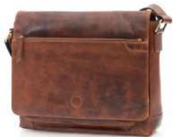
Messenger Bag - 2004 35 × 13 × 29 cm