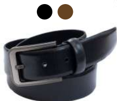
Belt 320 width 35mm