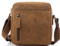
Flight Bag - 1045 20 x 6 x 19 cm