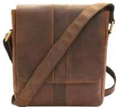
Small Messenger - 1042 23 x 7 x 27 cm