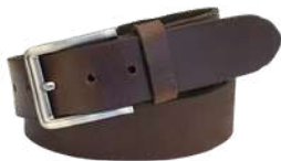
Belt 008 width 35mm