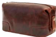
Washbag - 7507 28 x 16 x 12 cm