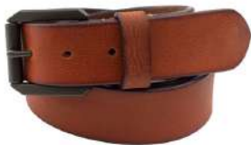
Belt 400 width 40mm