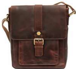
Large Crossbody Bag - 7508 22.5 x 27.5 x 7 cm