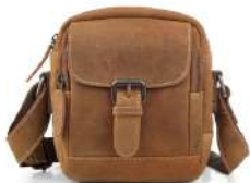
Flight Bag - 1044 18 x 6 x 15 cm