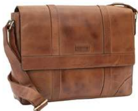
Large Messenger - 672 40 × 9 × 29 cm