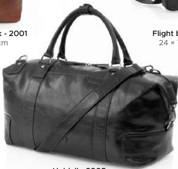
Holdall - 2005 51 × 22 × 24 cm