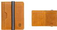
Columbia Card Holder - 1810 10 × 1 × 8 cm