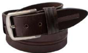
Belt 310 width 40mm