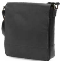
Rica Small Messenger Bag - 1565 28.5 × 7.5 × 26.5 cm