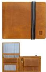
Columbia Bifold Wallet - 1809 12 × 2 × 11 cm