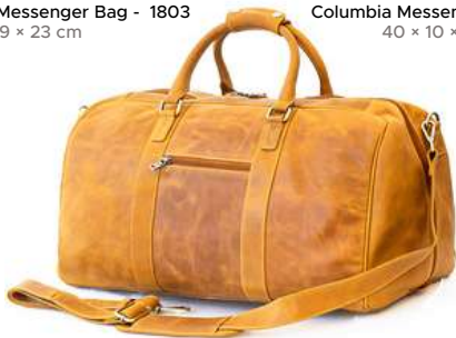
Columbia Large Holdall - 1804 57 × 30 × 31 cm