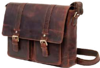
Messenger Laptop Bag - 7509