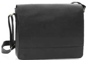
Rica Large Messenger Bag - 1566 43 × 12 × 33 cm