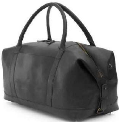
Rica Large Holdall - 1560 52 × 23 × 24 cm