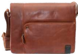
Large Messenger Bag – 7359 21 × 4 × 24 cm