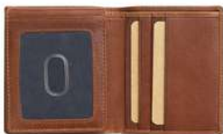
Trifold Credit Card Holder - 2219 10.5 × 9 cm