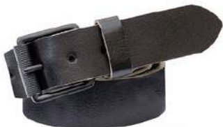
Belt 200 width 40mm