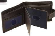
Classic Wallet - 3088 11.5 x 10 cm