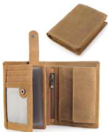
Vertical Trifold Wallet - 1001 12.5 x 9.5 cm