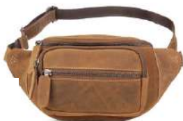
Bumbag - 1043 30 x 12 cm