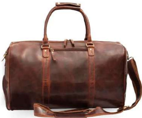
Large Holdall with Shoe Section - 7503 53 x 26 x 30 cm