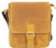
Columbia Buckle Messenger Bag - 1803 20 × 9 × 23 cm