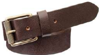
Belt style 201 width 40mm