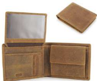
Trifold Wallet - 1003 10 x 12.5 cm