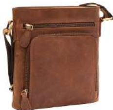
Crossbody/Flight Bag - 1040 24 x 5 x 25 cm