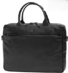
Business Case - 2003 40 × 9 × 29 cm