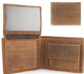
Trifold Wallet - 1002 9.5 x 12.5 cm