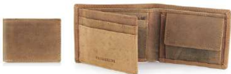
Trifold Wallet - 1006 8 x 10.5 cm