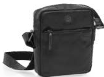
Flight bag - 2002 24 × 7 × 21 cm