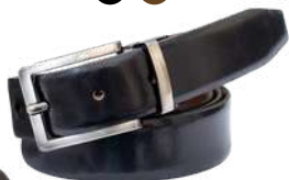
Belt 30 (reversible) width 30mm