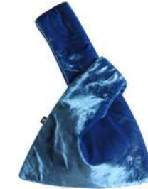
Blue Silk Velvet Japanese Knot Bag SV24KNBLU