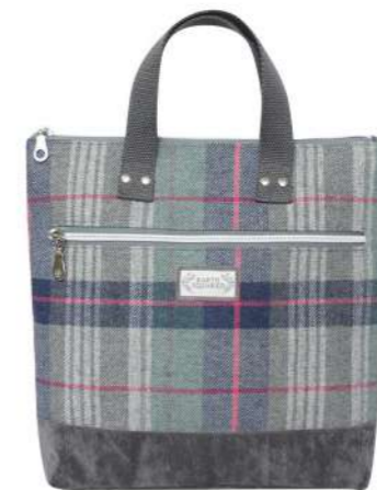
Drem Tweed Lois Backpack T24BKDRM