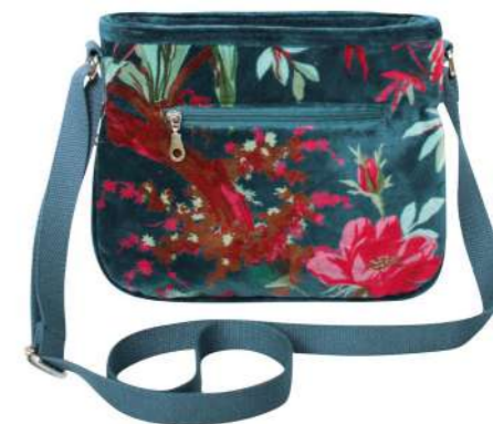
Teal Eden Velvet Rosy Messenger Bag VV24MBTL