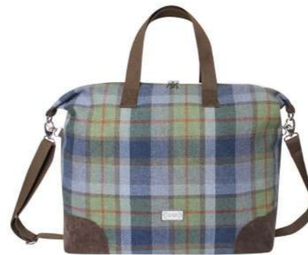
Inveresk Tweed Weekend Bag T24WKINV