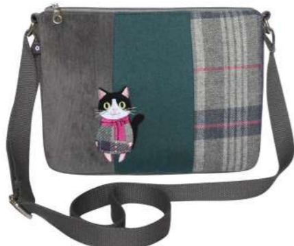
Cat Tweed Applique Messenger Bag APP24MBCAT