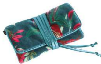
Teal Eden Velvet Jewellery Roll VV24JRTL