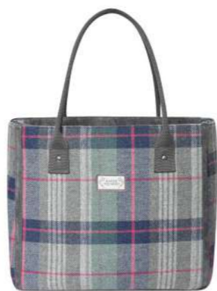
Drem Tweed Tote Bag T24TTDRM