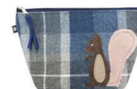
Squirrel Tweed Applique Makeup Bag APP24MUSQ