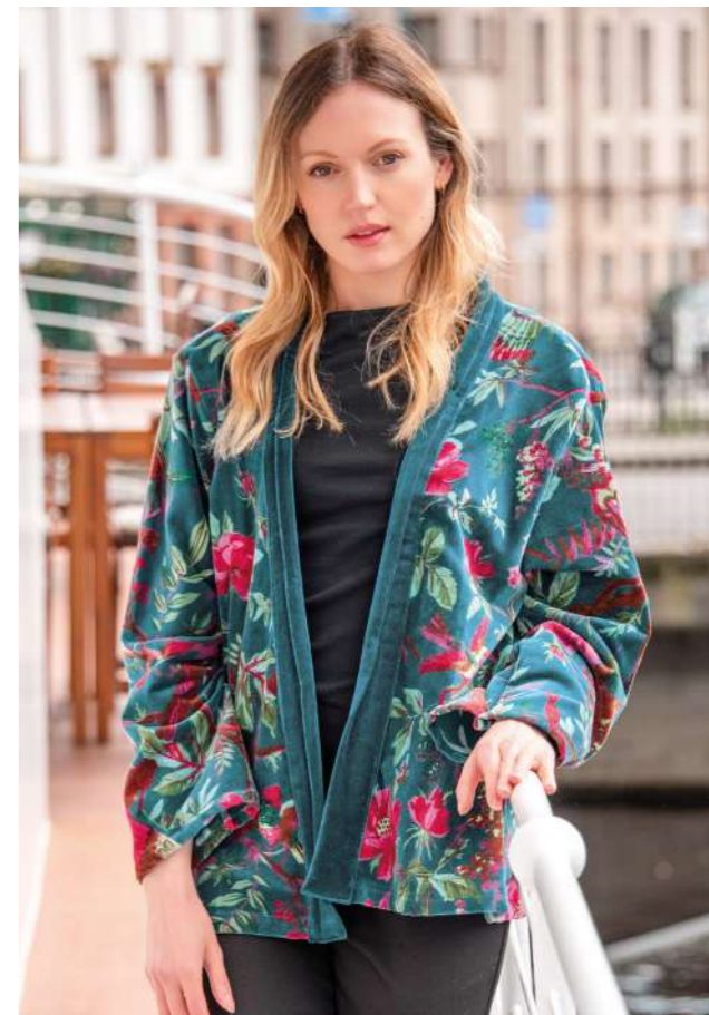
Teal Eden Velvet Jacket VV24JKTTL