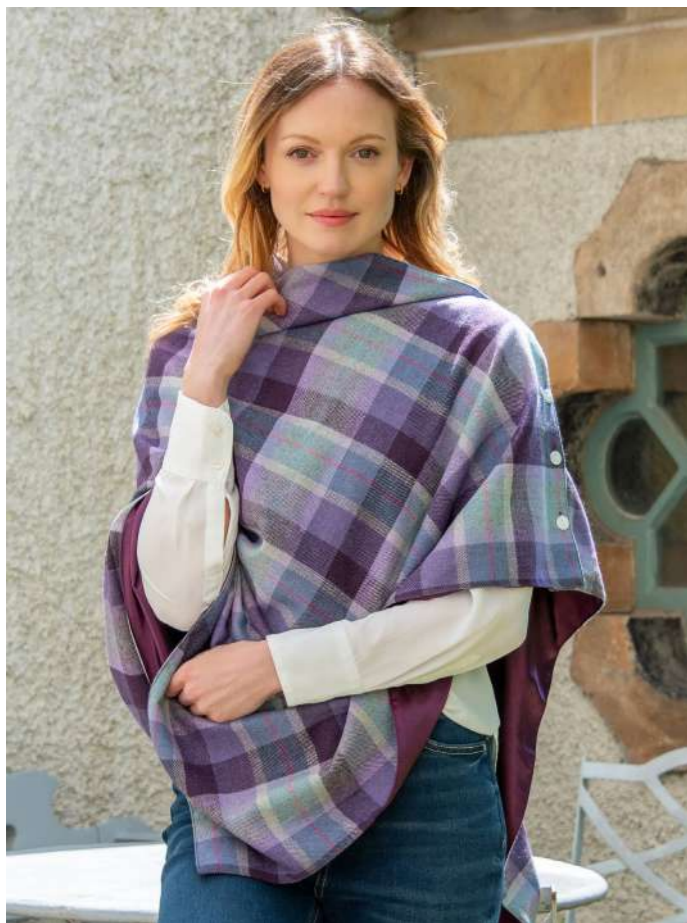
Carberry Tweed Wrap T24WPCAR