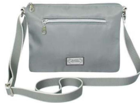
Grey Voyage Messenger Bag VOY24MBGY