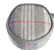
Drem Tweed Jewellery Pouch T24JEWDRM