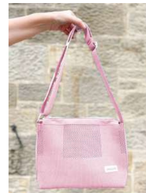
Pink Weave Messenger Bag WEMBPBK