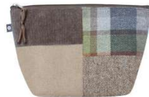
Inveresk Tweed Makeup Bag T24MUBINV