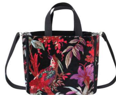
Black Eden Velvet Tote Bag VV24TTBK