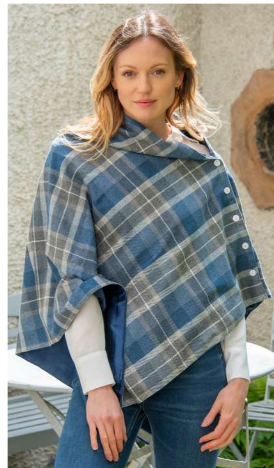
Humbie Tweed Wrap T24WPHUM