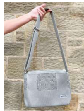
Grey Weave Messenger Bag WEMBGY