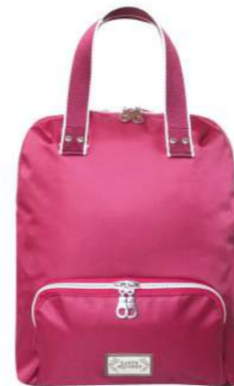
Berry Voyage Alice Backpack VOY24BKBER