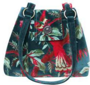
Teal Eden Velvet Ava Bag VV24AVATL