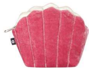
Pink Silk Velvet Clam Purse SV24CLPK