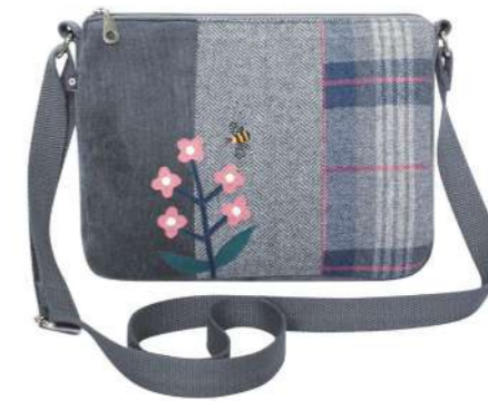
Flower Tweed Applique Messenger Bag APP24MBFLW