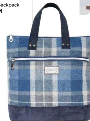
Humbie Tweed Lois Backpack T24BKHUM