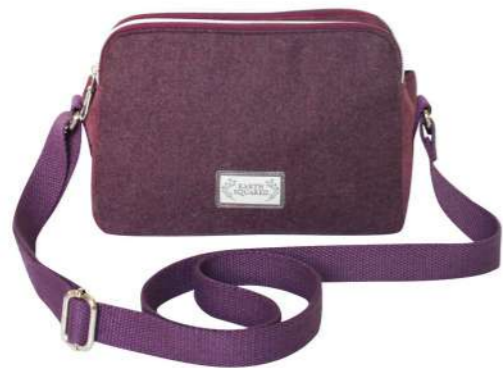
Purple Juniper Anna Bag HB24ANNPV

23.5 x 17 x 5cm Adjustable strap 74 -134cm £42.99