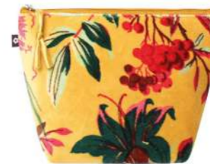
Mustard Eden Velvet Make Up Bag VV24MUMU