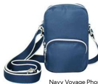
Navy Voyage Phone Pouch VOY24PCHNV