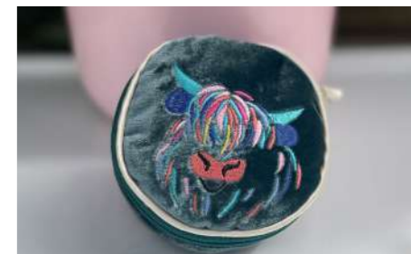
Silk Velvet 74-78