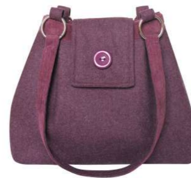
Purple Juniper Ava Bag HB24AVAPU