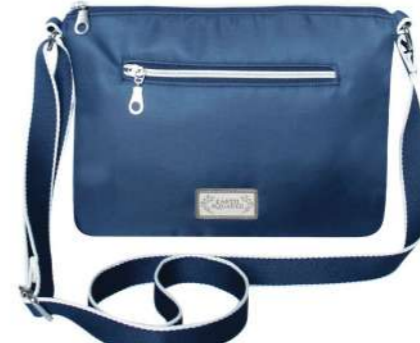
Navy Voyage Messenger Bag VOY24MBNV