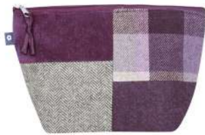
Carberry Tweed Makeup Bag T24MUBCAR