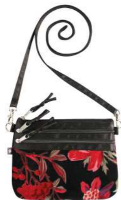
Black Eden Velvet 3 Zip Pouch VV24PCHBK