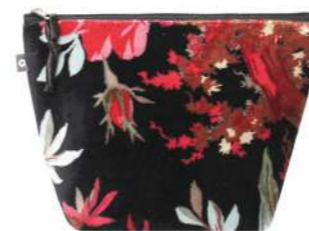
Black Eden Velvet Make Up Bag VV24MUBK