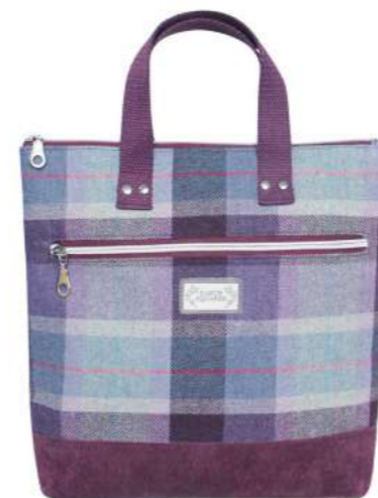
Carberry Tweed Lois Backpack T24BKCAR

27 x 31 x 18cm Adjustable strap 42 - 78cm £49.99