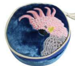
Parrot Silk Velvet Jewellery Pouch SV24JEWPAR