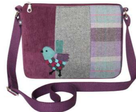
Bird Tweed Applique Messenger Bag APP24MBBD