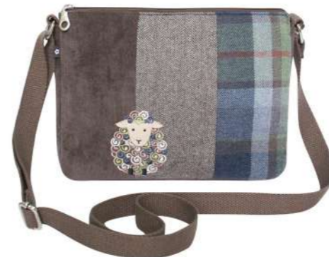
Sheep Tweed Applique Messenger Bag APP24MBSHP