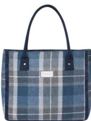
Humbie Tweed Tote Bag T24TTTHUM