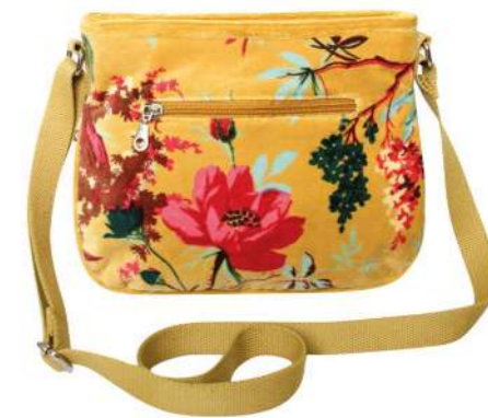
Mustard Eden Velvet Rosy Messenger Bag VV24MBMU