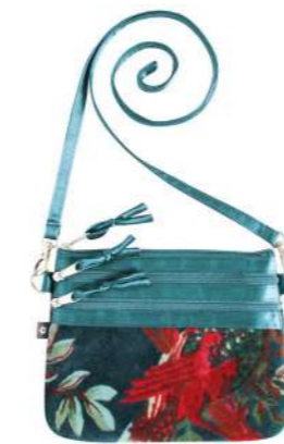
Teal Eden Velvet 3 Zip Pouch VV24PCHTL