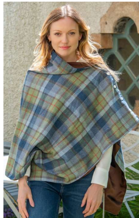
Inveresk Tweed Wrap T24WPINV