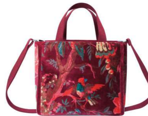
Red Eden Velvet Tote Bag VV24TTRD