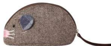
Brown Juniper Mouse Purse HB24MOUBN