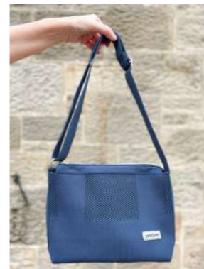
Navy Weave Messenger Bag WEMBNAV