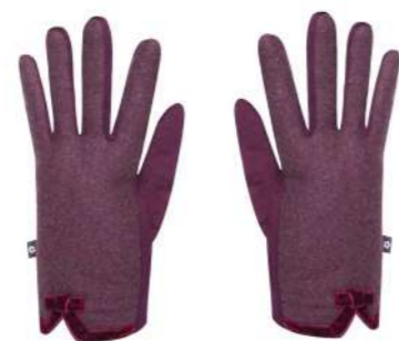
Purple Juniper Gloves HB24GLPU