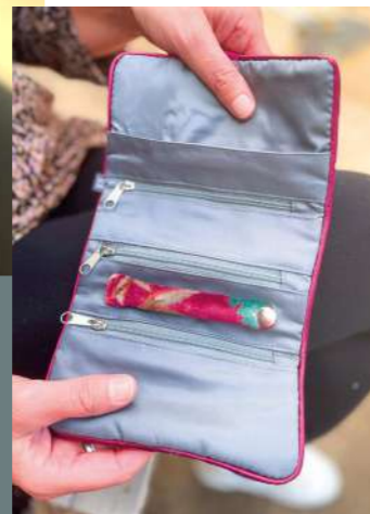
Black Eden Velvet Jewellery Roll VV24JRBK