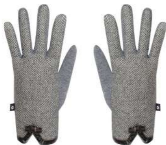
Grey Juniper Gloves HB24GLGY