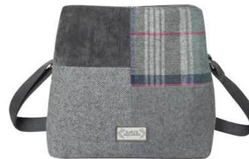
Drem Tweed Logan Bag T24LOGDRM