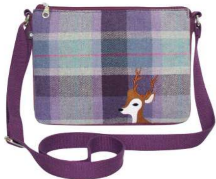
Deer Tweed Applique Messenger Bag APP24MBDEE