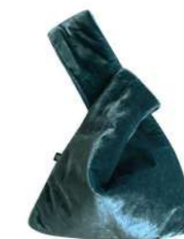
Teal Silk Velvet Japanese Knot Bag SV24KNTL