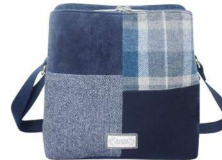
Humbie Tweed Logan Bag T24LOGHUM