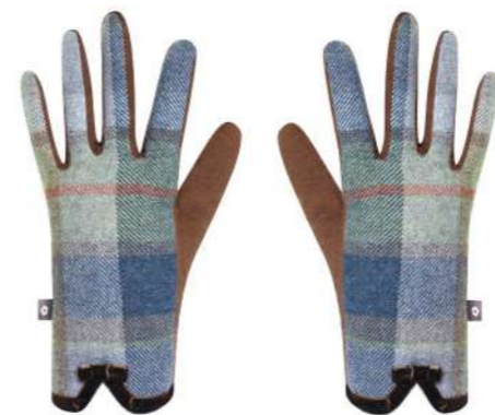
Inveresk Tweed Gloves T24GLIN