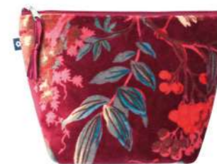
Red Eden Velvet Make Up Bag VV24MURD