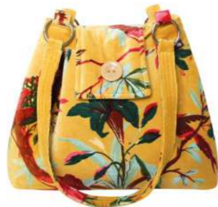
Mustard Eden Velvet Ava Bag VV24AVAMU