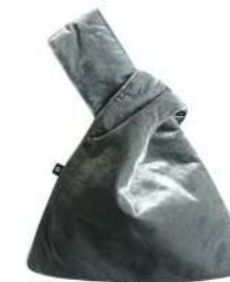
Grey Silk Velvet Japanese Knot Bag SV24KNGRY