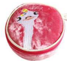
Ostrich Silk Velvet Jewellery Pouch SV24JEWOST