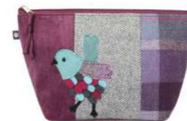
Bird Tweed Applique Makeup Bag APP24MUBD