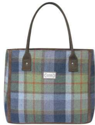
Inveresk Tweed Tote Bag T24TTINV