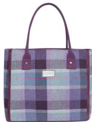
Carberry Tweed Tote Bag T24TTCAR