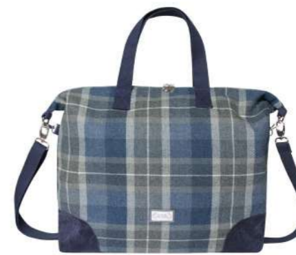
Humbie Tweed Weekend Bag T24WKHUM