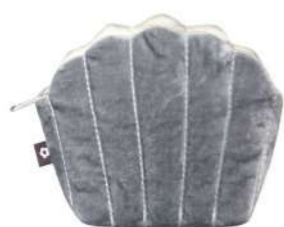
Grey Silk Velvet Clam Purse SV24CLGRY