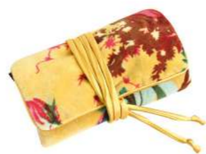
Mustard Eden Velvet Jewellery Roll VV24JRMU