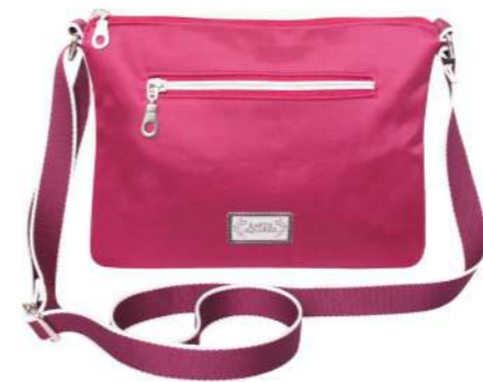
Berry Voyage Messenger Bag VOY24MBBER