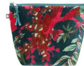
Teal Eden Velvet Make Up Bag VV24MUTL