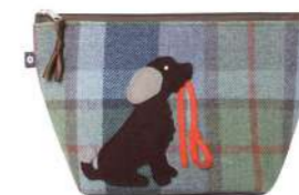
Dog Tweed Applique Makeup Bag APP24MUDOG