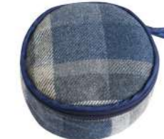
Humbie Tweed Jewellery Pouch T24JEWHUM