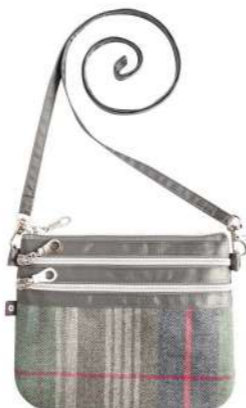
Drem Tweed 3 Zip Pouch T24ZIPDRM