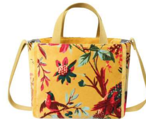
Mustard Eden Velvet Tote Bag VV24TTMU