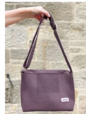
Plum Weave Messenger Bag WEMBPLM