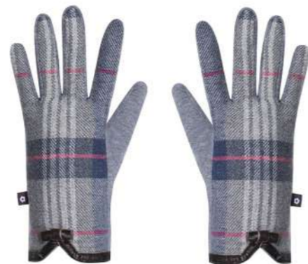
Drem Tweed Gloves T24GLDRM