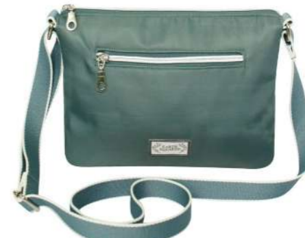
Green Voyage Messenger Bag VOY24MBGRN