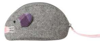
Grey Juniper Mouse Purse HB24MOUGY