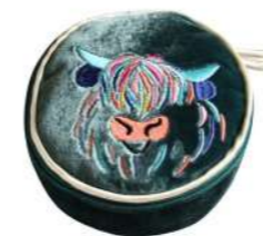
Highland Cow Silk Velvet Jewellery Pouch SV24JEW COW