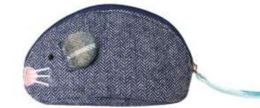
Navy Juniper Mouse Purse HB24MOUNV