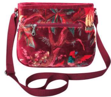
Red Eden Velvet Rosy Messenger Bag VV24MBRD