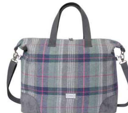
Drem Tweed Weekend Bag T24WKDRM