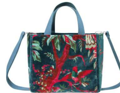
Teal Eden Velvet Tote Bag VV24TTTL