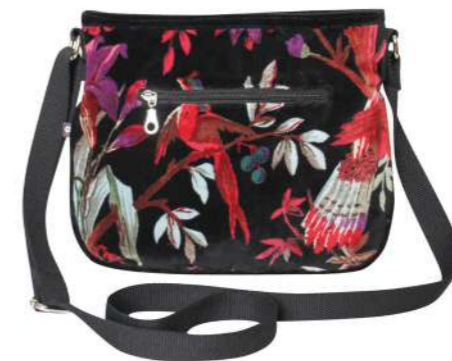
Black Eden Velvet Rosy Messenger Bag VV24MBBK

Eden Velvet Rosy Messenger Bag This cross body messenger bag is a great everyday style, looking fabulous in beautiful printed velvets. With a long adjustable strap, single zipped main compartment with zipped security pocket on the back and two integrated pockets inside. 26 x 22 x 6cm Adjustable strap 71 - 133cm £39.99