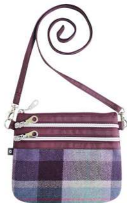
Carberry Tweed 3 Zip Pouch T24ZIPCAR