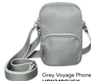
Grey Voyage Phone Pouch VOY24PCHGY