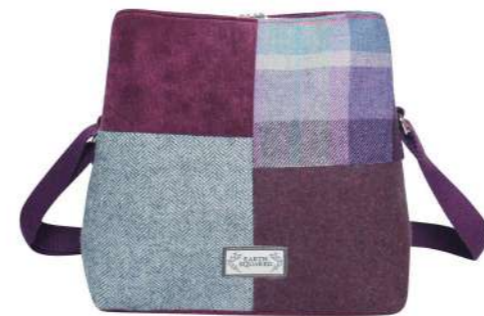
Carberry Tweed Logan Bag T24LOGCAR