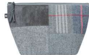
Drem Tweed Makeup Bag T24MUBDRM