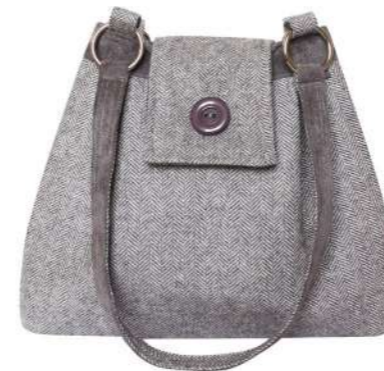
Grey Juniper Ava Bag HB24AVAGY