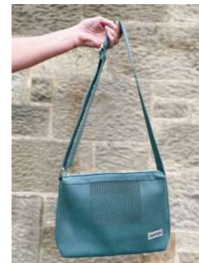
Green Weave Messenger Bag WEMBGRN