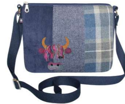
Highland Cow Tweed Applique Messenger Bag APP24MBCOW