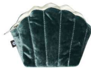
Teal Silk Velvet Clam Purse S24CLTL