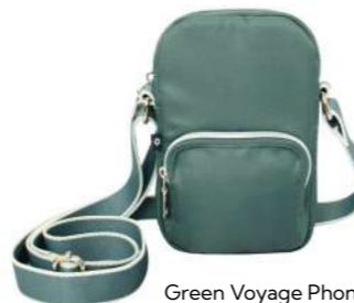
Green Voyage Phone Pouch VOY24PCHGRN