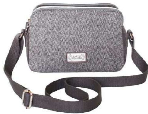
Grey Juniper Anna Bag HB24ANNGY