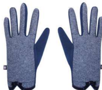
Navy Juniper Gloves HB24GLNV