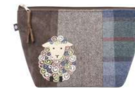
Sheep Tweed Applique Makeup Bag APP24MUSHP