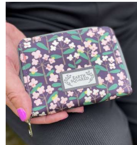
Briar Oilcloth 80-83