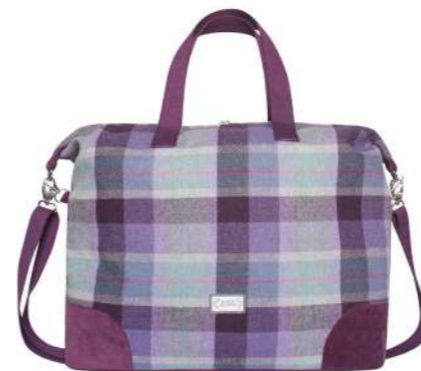
Carberry Tweed Weekend Bag T24WKCAR