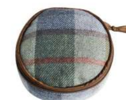
Inveresk Tweed Jewellery Pouch T24JEWINV