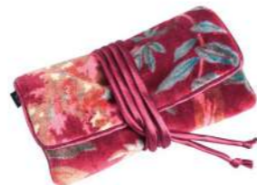
Red Eden Velvet Jewellery Roll VV24JRRD