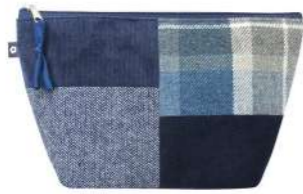
Humbie Tweed Makeup Bag T24MUBHUM