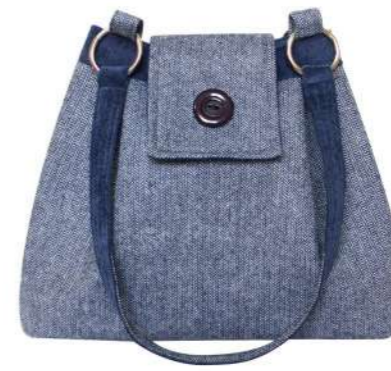
Navy Juniper Ava Bag HB24AVANV