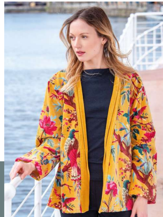
Mustard Eden Velvet Jacket VV24JKTMU