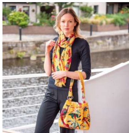
Eden Velvet 16-29