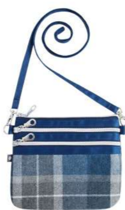
Humbie Tweed 3 Zip Pouch T24ZIPHUM