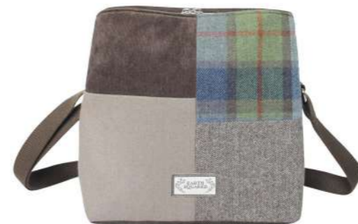
Inveresk Tweed Logan Bag T24LOGINV