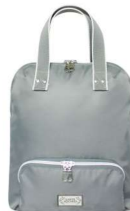
Grey Voyage Alice Backpack VOY24BKGY