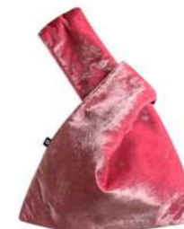
Pink Silk Velvet Japanese Knot Bag SV24KNPK