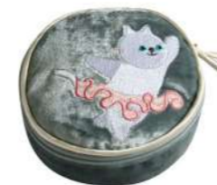
Cat Silk Velvet Jewellery Pouch SV24JEWCAT