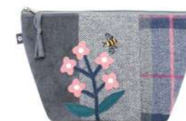
Flower Tweed Applique Makeup Bag APP24MUFLW