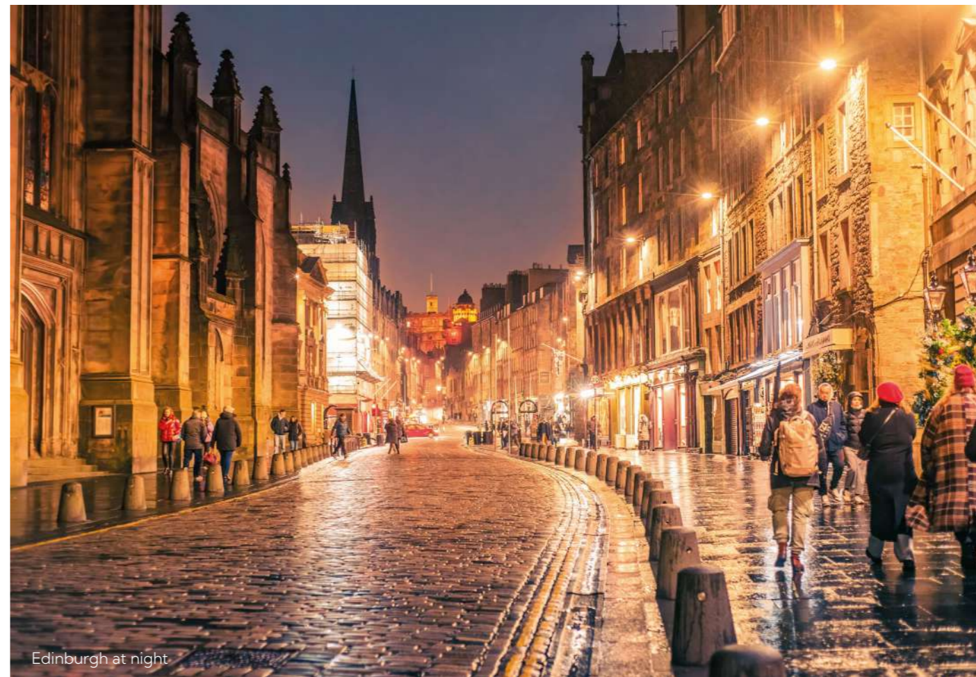
Edinburgh at night