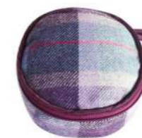
Carberry Tweed Jewellery Pouch T24JEWCAR