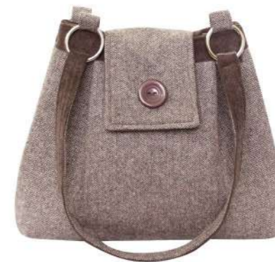
Brown Juniper Ava Bag HB24AVABN