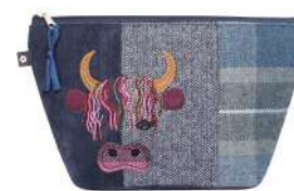
Highland Cow Tweed Applique Makeup Bag APP24MUCOW