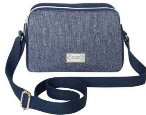
Navy Juniper Anna Bag HB24ANNV