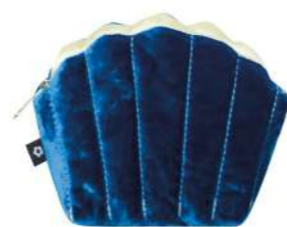
Blue Silk Velvet Clam Purse SV24CLBLU