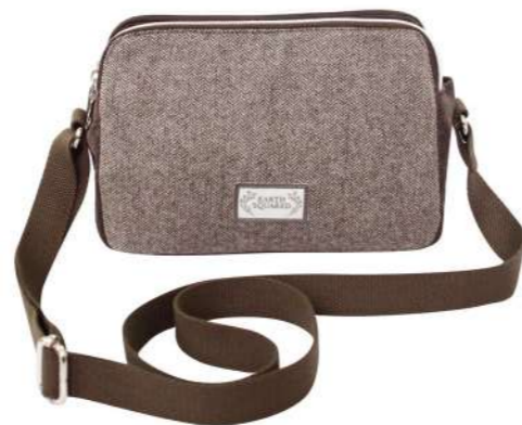
Brown Juniper Anna Bag HB24ANNBN