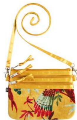
Mustard Eden Velvet 3 Zip Pouch VV24PCHMU