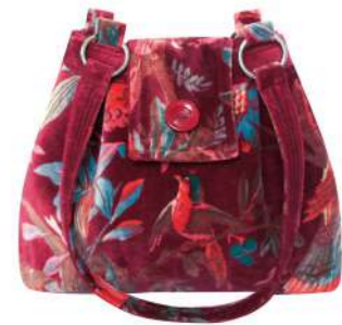
Red Eden Velvet Ava Bag VV24AVARD