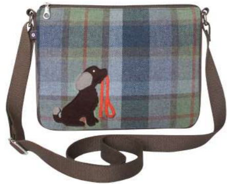
Dog Tweed Applique Messenger Bag APP24MBDOG