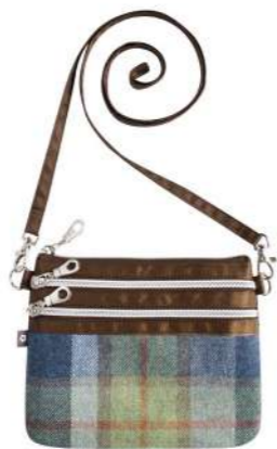
Inveresk Tweed 3 Zip Pouch T24ZIPINV