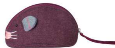
Purple Juniper Mouse Purse HB24MOUPU