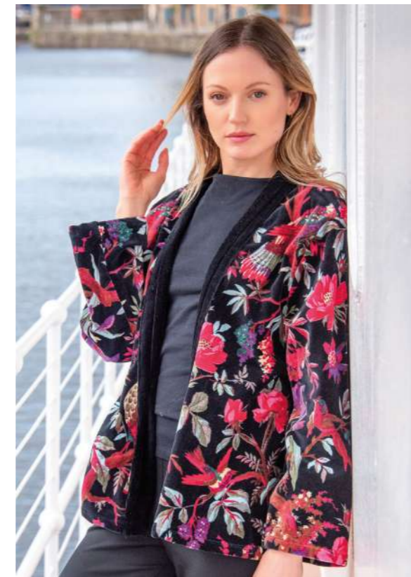
Black Eden Velvet Jacket VVJKTBK