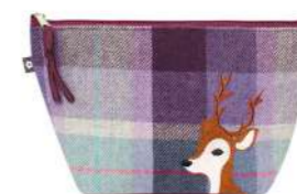
Deer Tweed Applique Makeup Bag APP24MUDEE