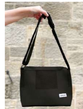
Black Weave Messenger Bag WEMBBLK