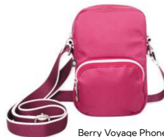
Berry Voyage Phone Pouch VOY24PCHBER