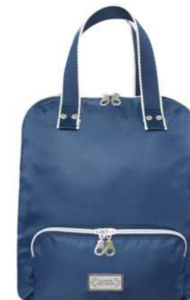
Navy Voyage Alice Backpack VOY24BKNV