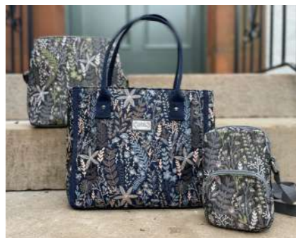
Autumn Jacquard 8-15