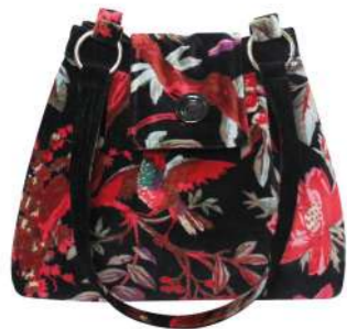
Black Eden Velvet Ava Bag VV24AVABK