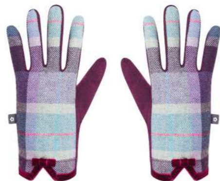
Carberry Tweed Gloves T24GLCAR