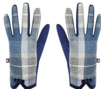
Humbie Tweed Gloves T24GLHUM