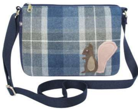
Squirrel Tweed Applique Messenger Bag APP24MBSQ