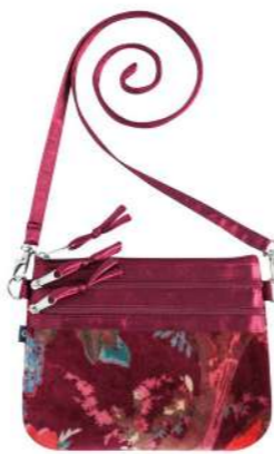
Red Eden Velvet 3 Zip Pouch VV24PCHRD