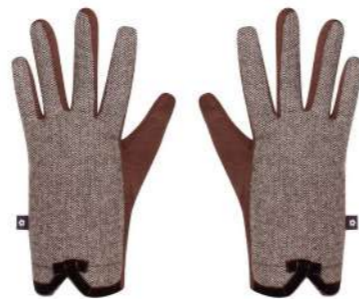
Brown Juniper Gloves HB24GLBN