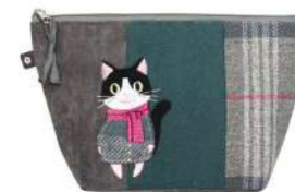
Cat Tweed Applique Makeup Bag APP24MUCAT