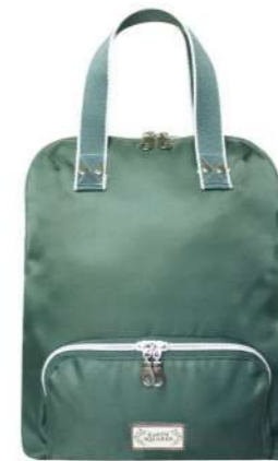
Green Voyage Alice Backpack VOY24BKGRN