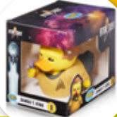
JAMES T KIRK BOXED PACKAGING