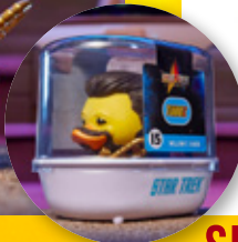
WILLIAM T RIKER FIRST EDITION BATHTUB PACKAGING