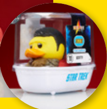
SCOTTY FIRST EDITION BATHTUB PACKAGING