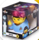
SPOCK BOXED PACKAGING