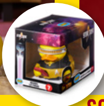
GEORDI LA FORGE BOXED PACKAGING