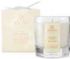
Grasse Candle - Bouquet Blanc & Bergamot Product code: ML006 Capacity: 400ml Dimensions: 95mm x 95mm x 105mm Weight: 0.78kg