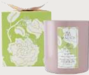
English Garden Candle - freshly Cut Roses Product code: ML022 Capacity: 400ml Dimensions: 95mm x 95mm x 105mm Weight: 0.78kg