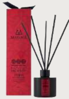
Nomad Diffuser - Amber & Musk Mirage Product code: ML009 Capacity: 100ml Dimensions: 75mm x 75mm x 26mm Weight: 0.45kg