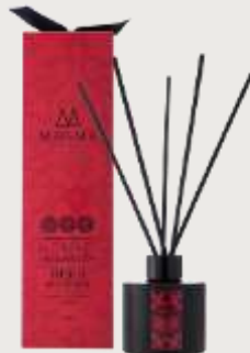
Nomad Diffuser - Fig & Sea Salt Product code: ML008 Capacity: 100ml Dimensions: 75mm x 75mm x 26mm Weight: 0.45kg