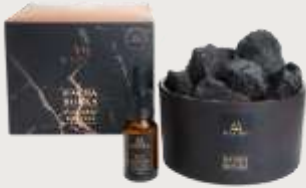
Rock Diffuser - Wild Gardens Product code: ML027 Capacity: 550ml Dimensions: 132mm x 125mm x 125mm Weight: 1.00kg