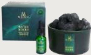
Rock Diffuser - Morning Dew Product code: ML037 Capacity: 550ml Dimensions: 132mm x 125mm x 125mm Weight: 1.00kg