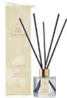
Grasse Diffuser - Bouquet Blanc & Bergamot Product code: ML003 Capacity: 100ml Dimensions: 75mm x 75mm x 26mm Weight: 0.45kg