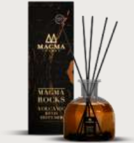
Rock Reed Diffuser - Smokey Velvet Product code: ML072 Capacity: 200ml Dimensions: 95mm x 95mm x 250mm Weight: 0.60kg