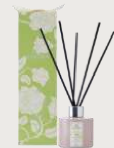
English Garden Diffuser - White Tea Sage & Lemongrass Product code: ML020 Capacity: 100ml Dimensions: 75mm x 75mm x 26mm Weight: 0.45kg