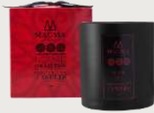
Nomad Candle - Amber & Musk Mirage Product code: ML012 Capacity: 400ml Dimensions: 95mm x 95mm x 105mm Weight: 0.78kg