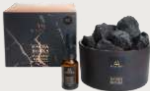
Rock Diffuser - Smokey Velvet Product code: ML026 Capacity: 550ml Dimensions: 132mm x 125mm x 125mm Weight: 1.00kg