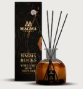
Rock Reed Diffuser - Cool Woods Product code: ML073 Capacity: 200ml Dimensions: 95mm x 95mm x 250mm Weight: 0.60kg