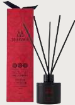
Nomad Diffuser - Black Oud Product code: ML007 Capacity: 100ml Dimensions: 75mm x 75mm x 26mm Weight: 0.45kg