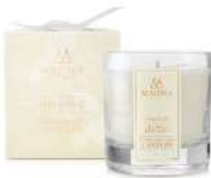
Grasse Candle - Cognac & Blond Tobacco Product code: ML005 Capacity: 400ml Dimensions: 95mm x 95mm x 105mm Weight: 0.78kg