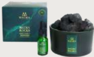
Rock Diffuser - Nuru's Forest Product code: ML036 Capacity: 550ml Dimensions: 132mm x 125mm x 125mm Weight: 1.00kg