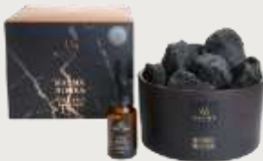
Rock Diffuser - Cool Woods Product code: ML025 Capacity: 550ml Dimensions: 132mm x 125mm x 125mm Weight: 1.00kg