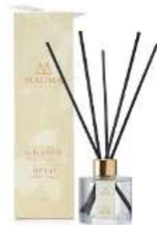
Grasse Diffuser - Cognac & Blond Tobacco Product code: ML002 Capacity: 100ml Dimensions: 75mm x 75mm x 26mm Weight: 0.45kg