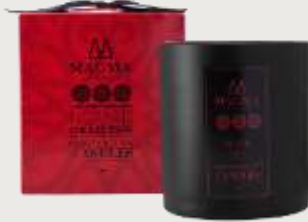
Nomad Candle - Black Oud Product code: ML010 Capacity: 400ml Dimensions: 95mm x 95mm x 105mm Weight: 0.78kg