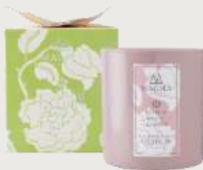
English Garden Candle - Poppy & White Blossom Product code: ML024 Capacity: 400ml Dimensions: 95mm x 95mm x 105mm Weight: 0.78kg