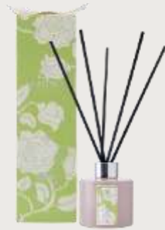
English Garden Diffuser - Freshly cut Roses Product code: ML019 Capacity: 100ml Dimensions: 75mm x 75mm x 26mm Weight: 0.45kg