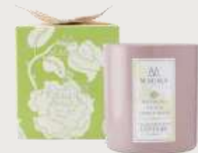
English Garden Candle - White Tea Sage & Lemongrass Product code: ML023 Capacity: 400ml Dimensions: 95mm x 95mm x 105mm Weight: 0.78kg