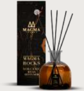
Rock Reed Diffuser - Wild Gardens Product code: ML071 Capacity: 200ml Dimensions: 95mm x 95mm x 250mm Weight: 0.60kg