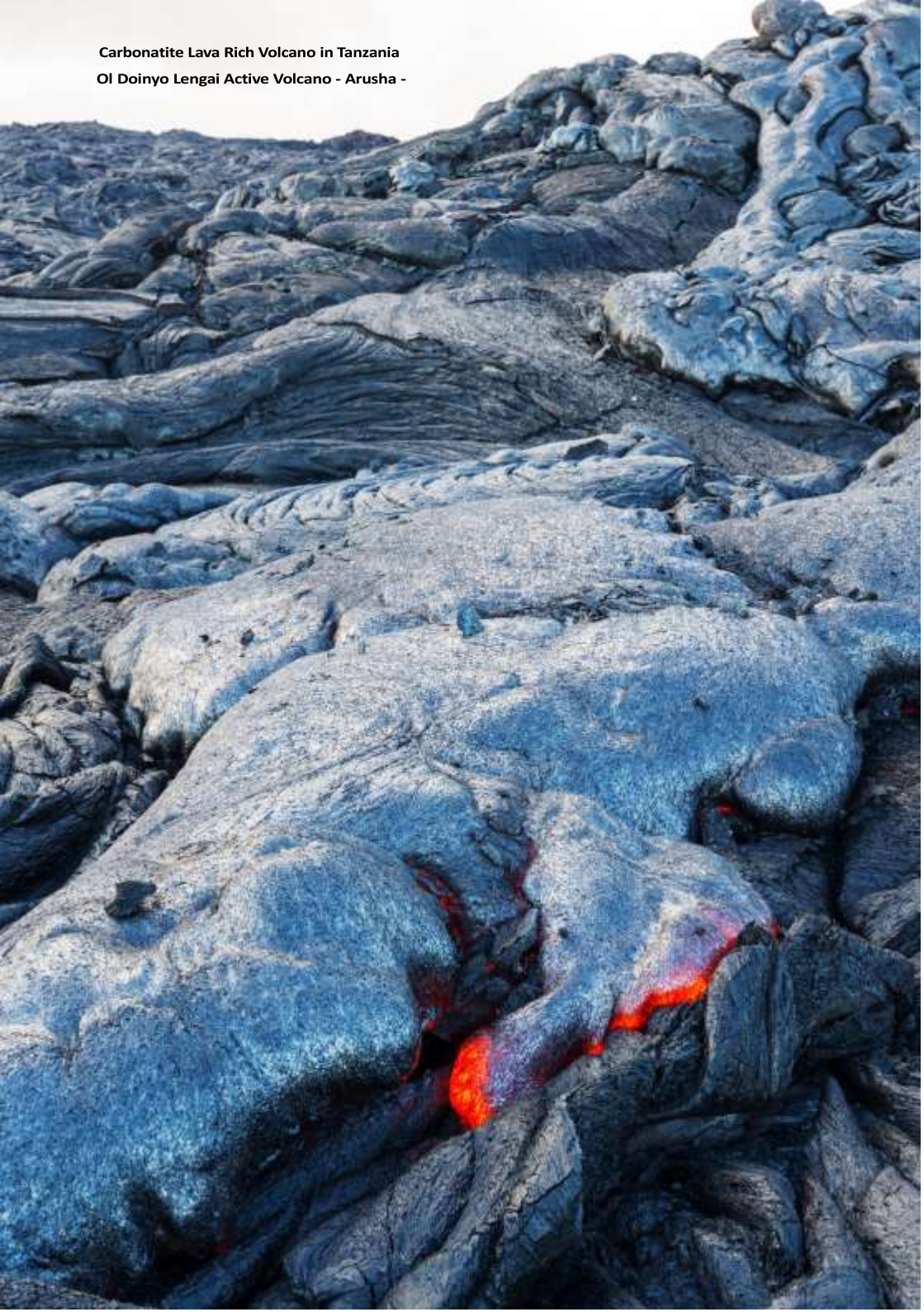
Carbonatite Lava Rich Volcano in Tanzania Ol Doinyo Lengai Active Volcano - Arusha -