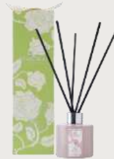
English Garden Diffuser - Poppy & White Blossom Product code: ML021 Capacity: 100ml Dimensions: 75mm x 75mm x 26mm Weight: 0.45kg