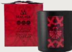
Nomad Candle - Fig & Sea Salt Product code: ML011 Capacity: 400ml Dimensions: 95mm x 95mm x 105mm Weight: 0.78kg