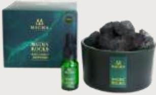
Rock Diffuser - Pampas Grass & Pomelo Product code: ML035 Capacity: 550ml Dimensions: 132mm x 125mm x 125mm Weight: 1.00kg