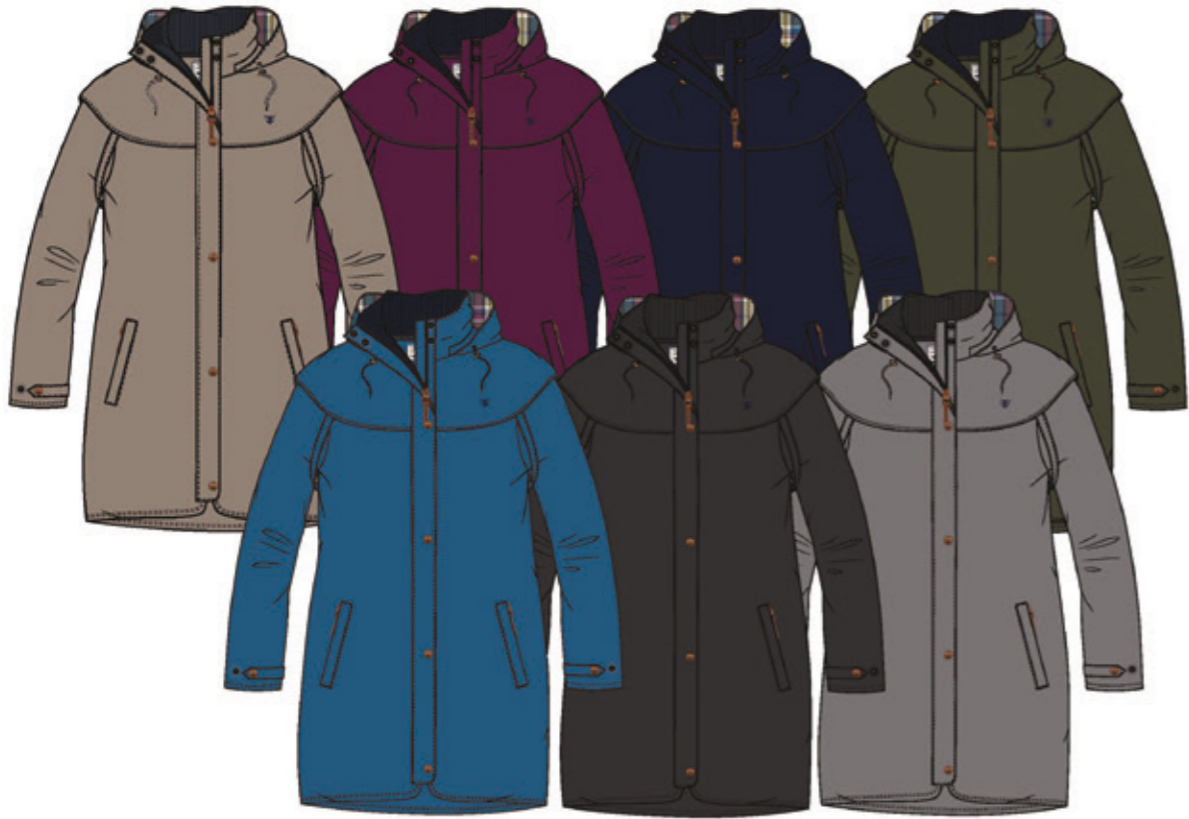
Outback Full Length | Outrider 3/4 Length

Polyester Pongee | Woven Check Lining | 10,000 WP Colours: Fawn | Plum | Nightshade | Fern | Deep Sea | Black | Urban Grey Sizes: 6 -24