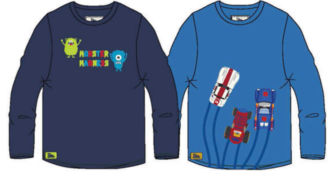
Oliver Long Sleeve

100% Acrylic Colour: Navy / Red / Blue Stripes Sizes: 2-4yrs & 5-10yrs