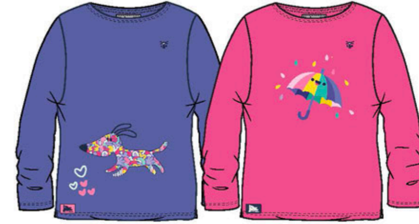
Causeway Long Sleeve

Cotton Stretch Jersey | 95% Cotton 5% Spandex | 200g Colour: Navy Stripe Sizes: 1/2yrs - 7/8yrs