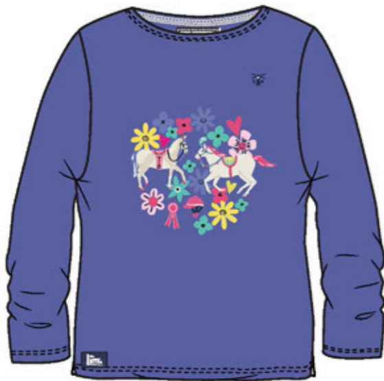
Causeway Long Sleeve

100% Cotton Brushed Jersey | 320g Colours: Pink Tractor | Purple Tractor Sizes: 1/2yrs - 7/8yrs