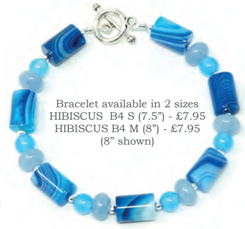
Bracelet available in 2 sizes HIBISCUS B4 S (7.5") - £7.95 HIBISCUS B4 M (8") - £7.95 (8" shown)