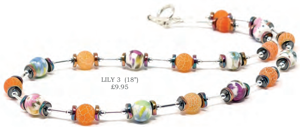
LILY 3 (18") £9.95