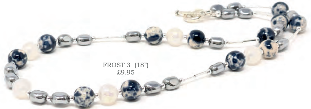
FROST 3 (18") £9.95