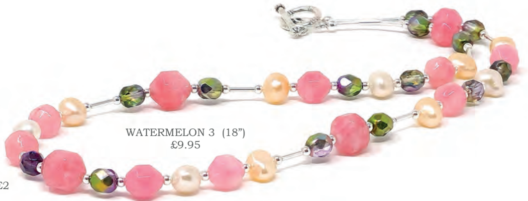
WATERMELON 3 (18") £9.95