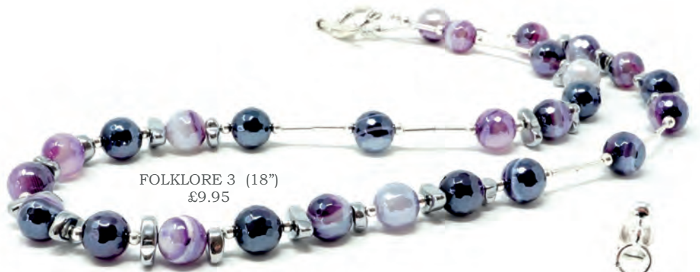
FOLKLORE 3 (18") £9.95