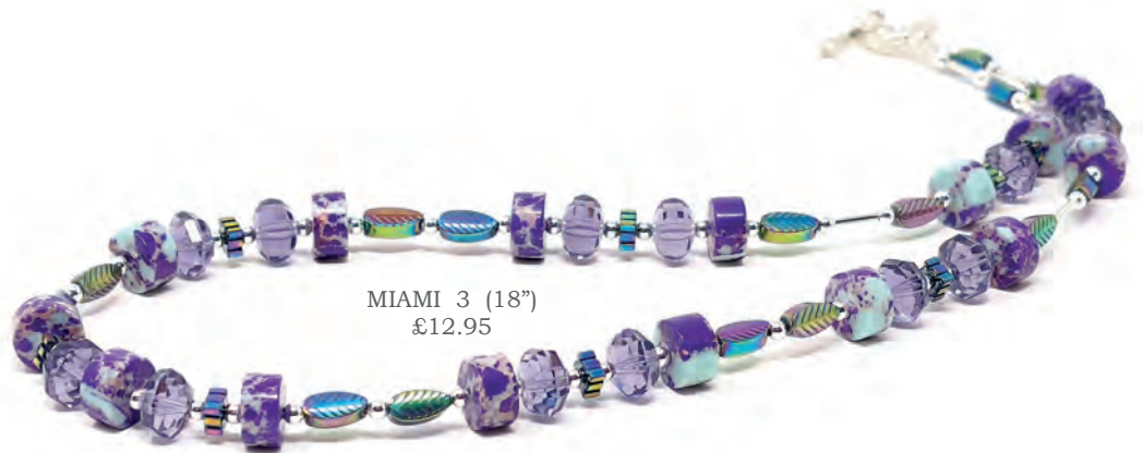
MIAMI 3 (18") £12.95