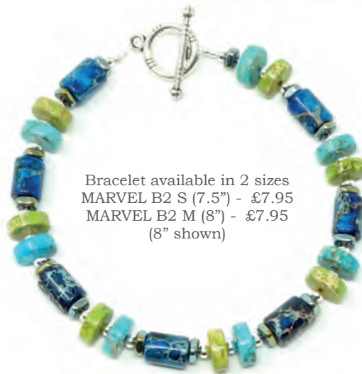
Bracelet available in 2 sizes MARVEL B2 S (7.5") - £7.95 MARVEL B2 M (8") - £7.95 (8" shown)