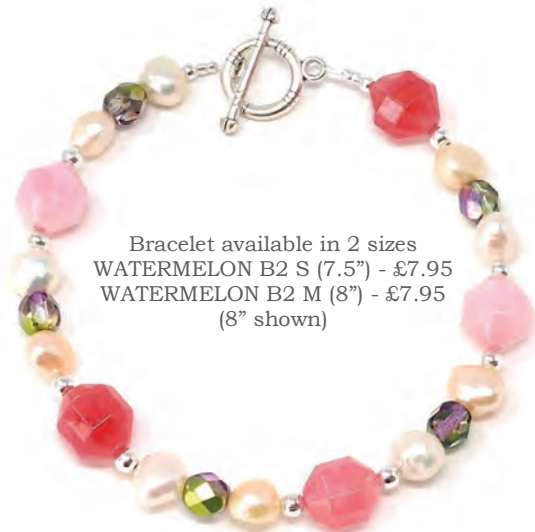
Bracelet available in 2 sizes WATERMELON B2 S (7.5") - £7.95 WATERMELON B2 M (8") - £7.95 (8" shown)