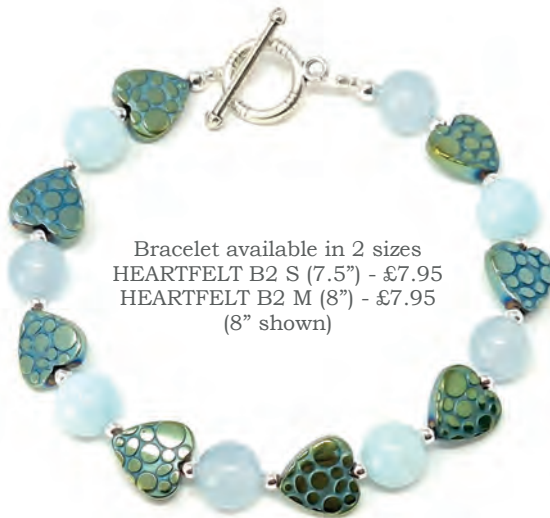
Bracelet available in 2 sizes HEARTFELT B2 S (7.5") - £7.95 HEARTFELT B2 M (8") - £7.95 (8" shown)