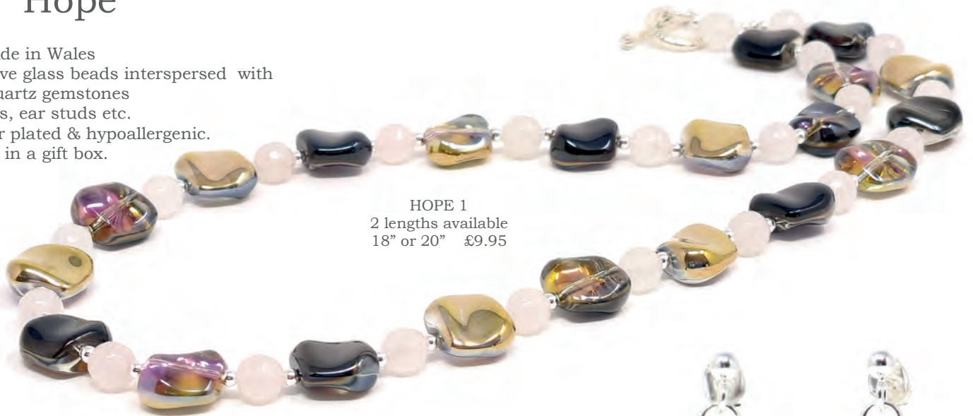
HOPE 1 2 lengths available 18" or 20" £9.95

Handmade in Wales Distinctive glass beads interspersed with small Quartz gemstones All clasps, ear studs etc. are silver plated & hypoallergenic. All come in a gift box.