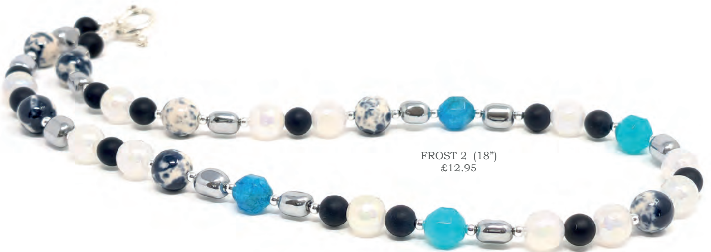
FROST 2 (18") £12.95