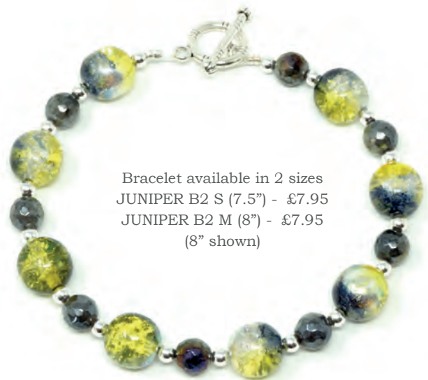
Bracelet available in 2 sizes JUNIPER B2 S (7.5") - £7.95 JUNIPER B2 M (8") - £7.95 (8" shown)