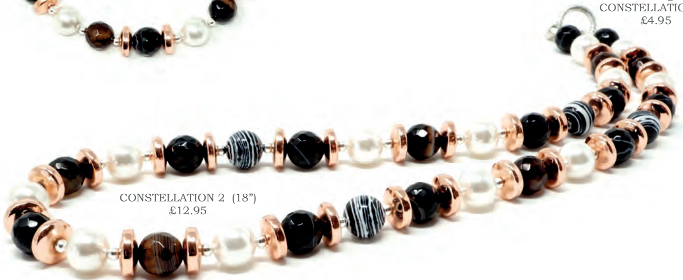
CONSTELLATION 2 (18") £12.95