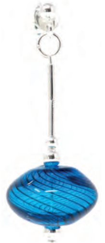
Earrings MYRIAD E3 £4.95