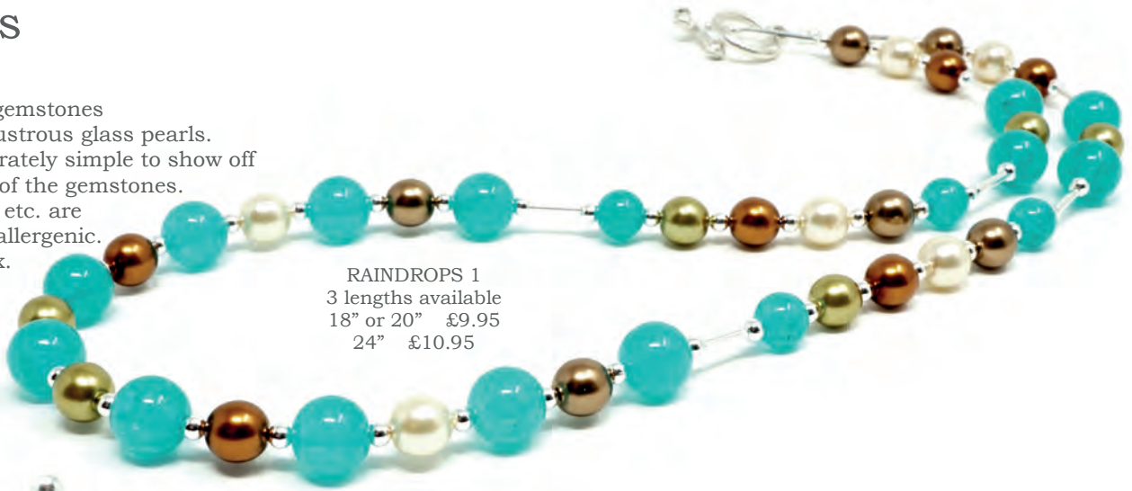
RAINDROPS 1 3 lengths available 18" or 20" £9.95 24" £10.95

Handmade in Wales Vibrant dyed Agate gemstones are combined with lustrous glass pearls. Necklace 3 is deliberately simple to show off the beautiful colour of the gemstones. All clasps, ear studs etc. are silver plated & hypoallergenic. All come in a gift box.