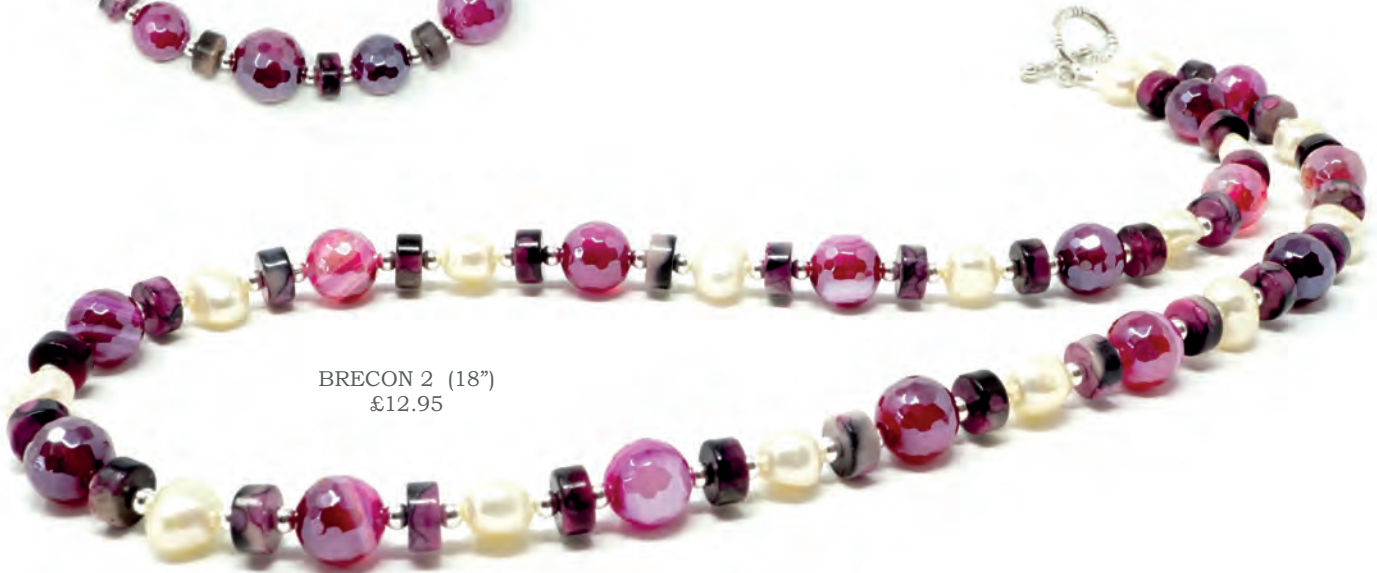
BRECON 2 (18") £12.95