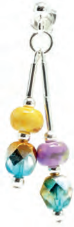
Earrings SKETCHBOOK E3 £4.95