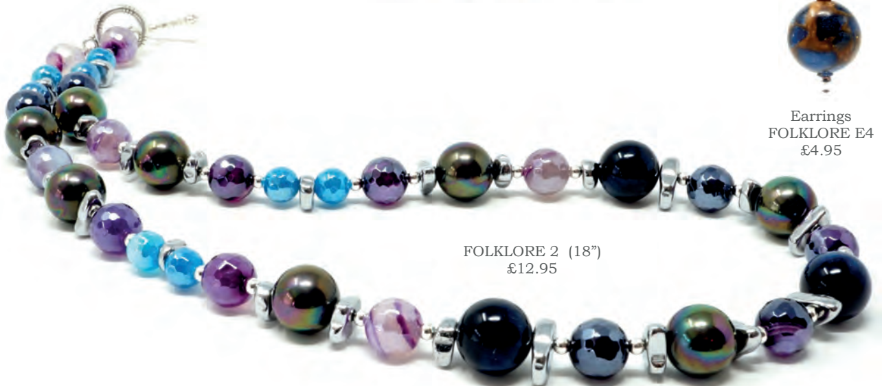
FOLKLORE 2 (18") £12.95