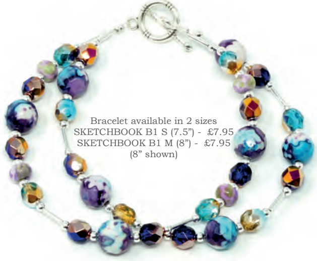
Bracelet available in 2 sizes SKETCHBOOK B1 S (7.5") - £7.95 SKETCHBOOK B1 M (8") - £7.95 (8" shown)