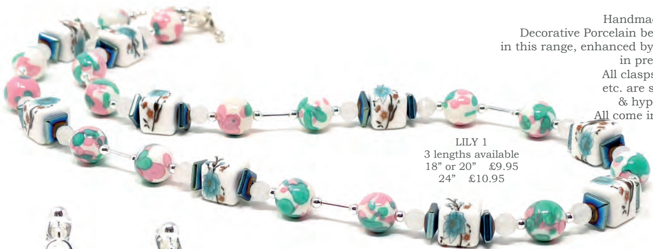
LILY 1 3 lengths available 18" or 20" £9.95 24" £10.95

Handmade in Wales Decorative Porcelain beads feature in this range, enhanced by gemstones in pretty colours. All clasps, ear studs etc. are silver plated & hypoallergenic. All come in a gift box.