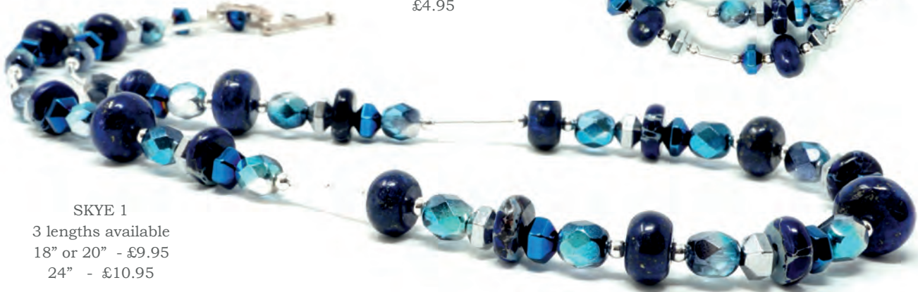
SKYE 1 3 lengths available 18" or 20" - £9.95 24" - £10.95