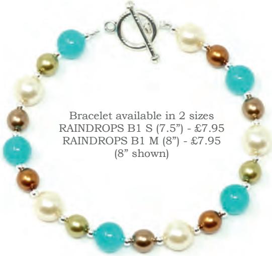
Bracelet available in 2 sizes RAINDROPS B1 S (7.5") - £7.95 RAINDROPS B1 M (8") - £7.95 (8" shown)