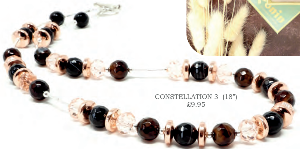
CONSTELLATION 3 (18") £9.95