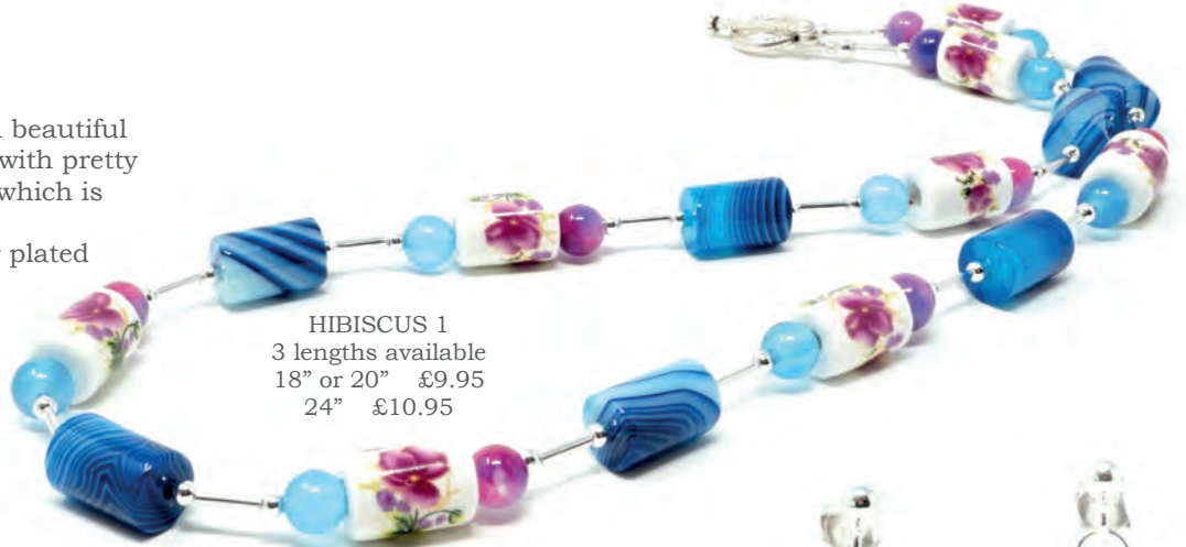
HIBISCUS 1 3 lengths available 18" or 20" £9.95 24" £10.95