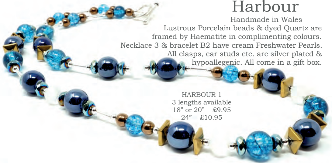
HARBOUR 1 3 lengths available 18" or 20" £9.95 24" £10.95