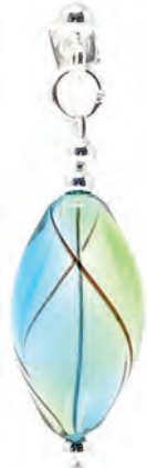
Earrings MIAMI E2 £4.95