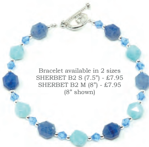
Bracelet available in 2 sizes SHERBET B2 S (7.5") - £7.95 SHERBET B2 M (8") - £7.95 (8" shown)