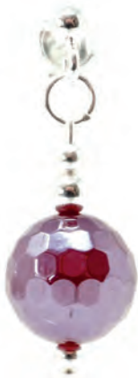
Earrings BRECON E1 £4.95