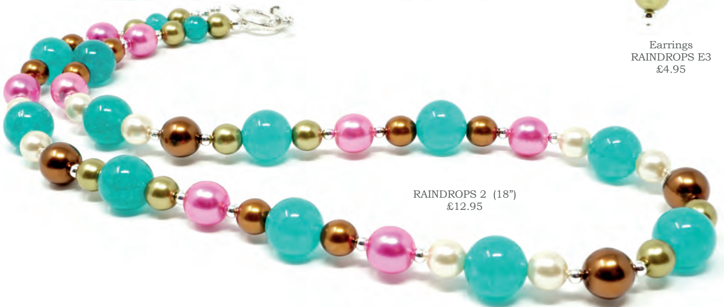
RAINDROPS 2 (18") £12.95