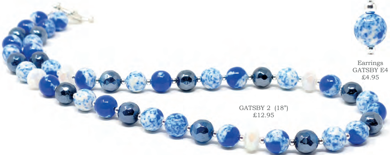
GATSBY 2 (18") £12.95