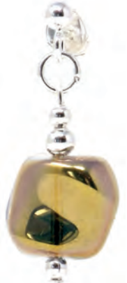
Earrings HOPE E2 £4.95