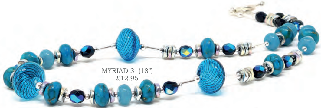
MYRIAD 3 (18") £12.95