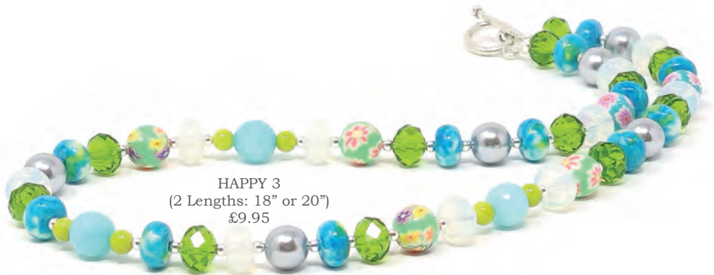
HAPPY 3 (2 Lengths: 18" or 20") £9.95