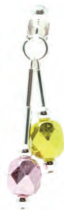
Earrings HUMMINGBIRD E3 £4.95