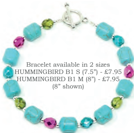
Bracelet available in 2 sizes HUMMINGBIRD B1 S (7.5") - £7.95 HUMMINGBIRD B1 M (8") - £7.95 (8" shown)