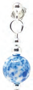
Earrings GATSBY E4 £4.95