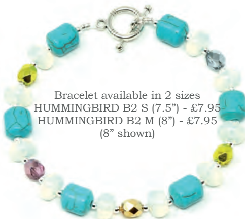
Bracelet available in 2 sizes HUMMINGBIRD B2 S (7.5") - £7.95 HUMMINGBIRD B2 M (8") - £7.95 (8" shown)