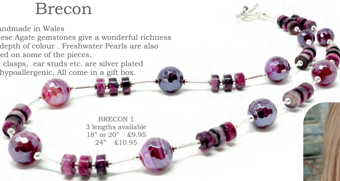
BRECON 1 3 lengths available 18" or 20" £9.95 24" £10.95

All clasps, ear studs etc. are silver plated & hypoallergenic. All come in a gift box.