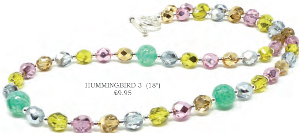
HUMMINGBIRD 3 (18") £9.95