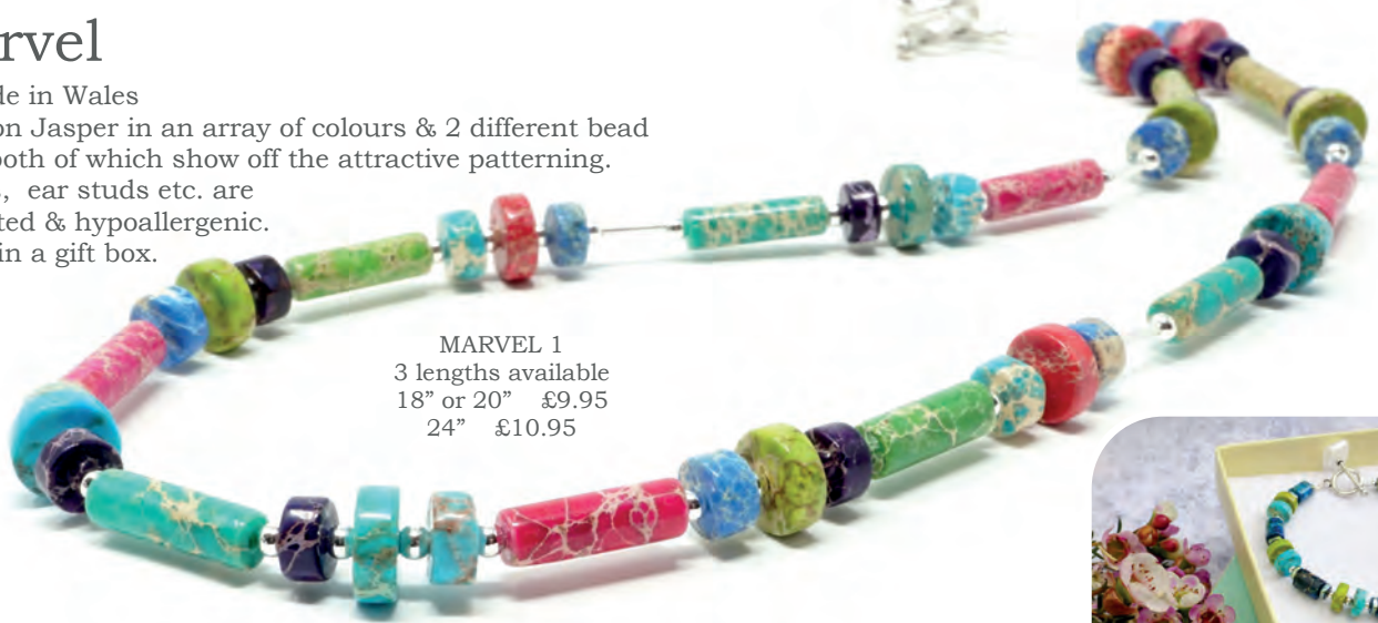
MARVEL 1 3 lengths available 18" or 20" £9.95 24" £10.95