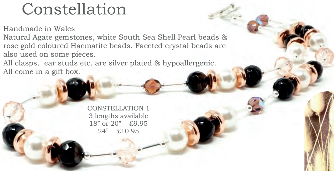
CONSTELLATION 1 3 lengths available 18" or 20" £9.95 24" £10.95