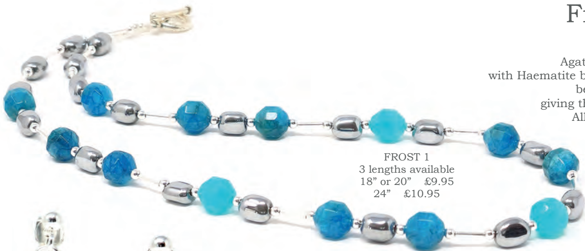
FROST 1 3 lengths available 18" or 20" £9.95 24" £10.95

Handmade in Wales Agate & Jasper gemstones with Haematite beads. The white Agate beads are electroplated, giving them a lovely shimmer. All clasps, ear studs etc. are silver plated & hypoallergenic. All come in a gift box.