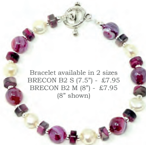
Bracelet available in 2 sizes BRECON B2 S (7.5") - £7.95 BRECON B2 M (8") - £7.95 (8" shown)