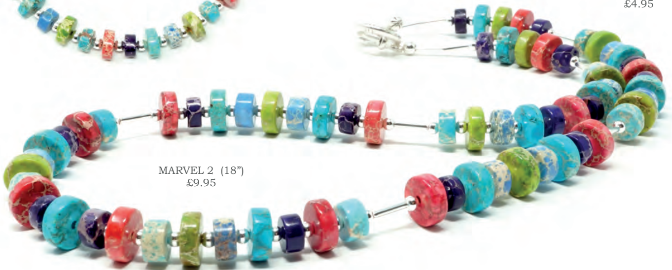
MARVEL 2 (18") £9.95