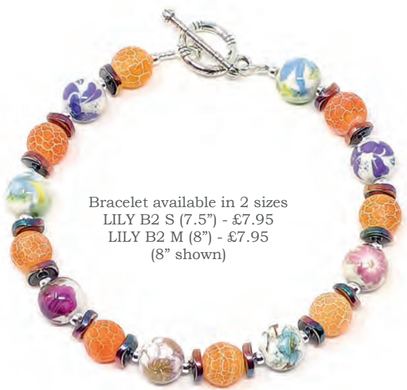
Bracelet available in 2 sizes LILY B2 S (7.5") - £7.95 LILY B2 M (8") - £7.95 (8" shown)