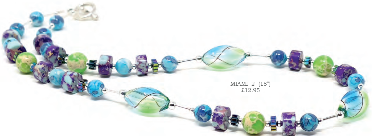
MIAMI 2 (18") £12.95