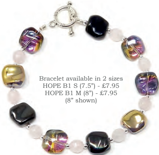
Bracelet available in 2 sizes HOPE B1 S (7.5") - £7.95 HOPE B1 M (8") - £7.95 (8" shown)