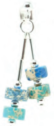
Earrings MARVEL E3 £4.95