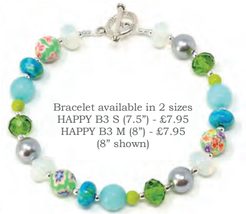
Bracelet available in 2 sizes HAPPY B3 S (7.5") - £7.95 HAPPY B3 M (8") - £7.95 (8" shown)