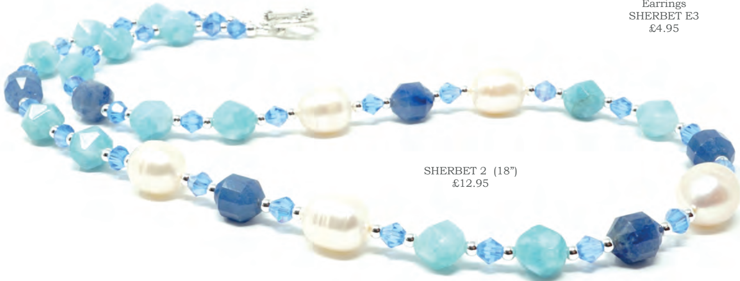
SHERBET 2 (18") £12.95