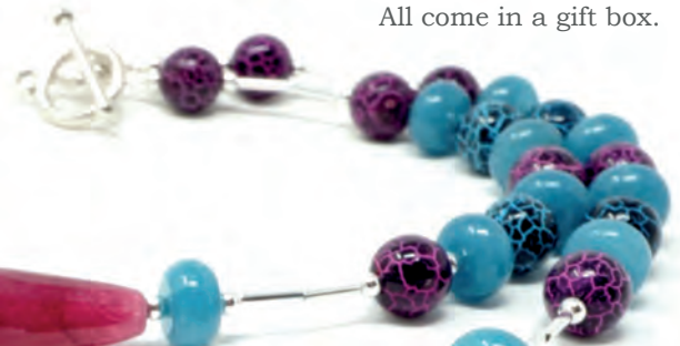
KEEPER 2 2 lengths available 18" or 20" £12.95