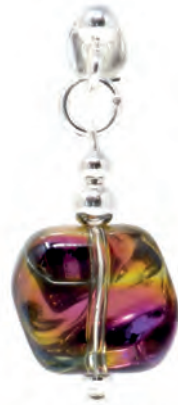
Earrings HOPE E1 £4.95