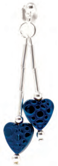
Earrings HEARTFELT E3 £4.95