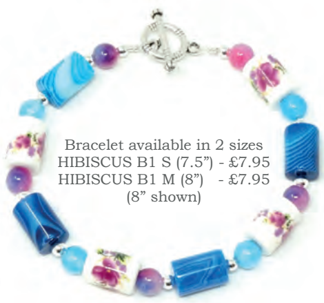
Bracelet available in 2 sizes HIBISCUS B1 S (7.5") - £7.95 HIBISCUS B1 M (8") - £7.95 (8" shown)