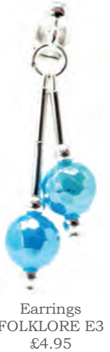
Earrings FOLKLORE E3 £4.95