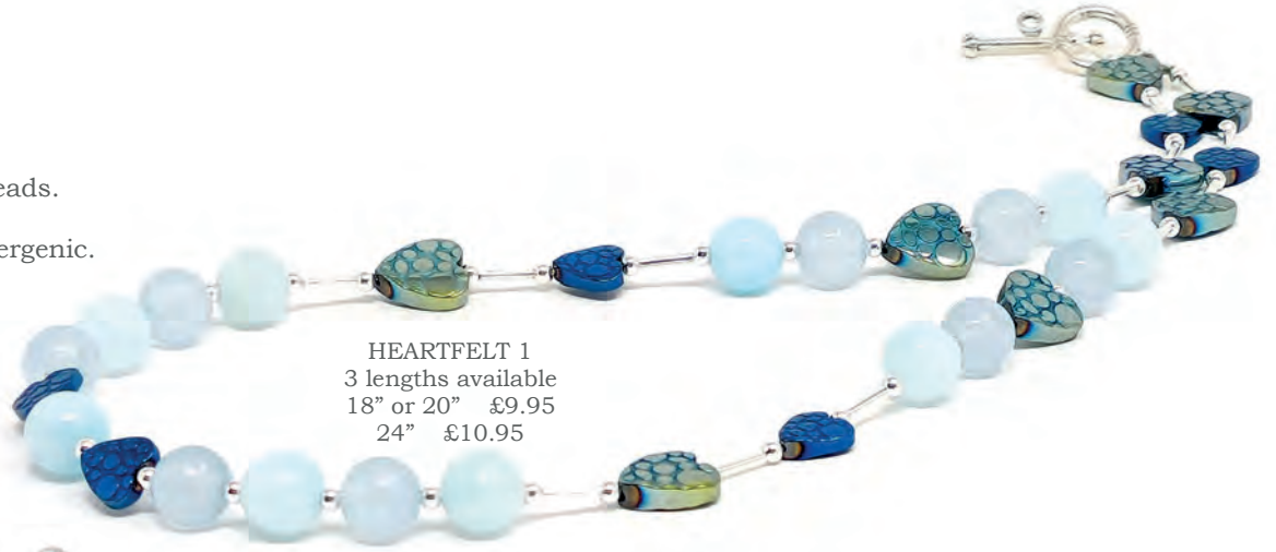
HEARTFELT 1 3 lengths available 18" or 20" £9.95 24" £10.95

Handmade in Wales Agate gemstones and heart shaped Haematite beads. All clasps, ear studs etc. are silver plated & hypoallergenic. All come in a gift box.