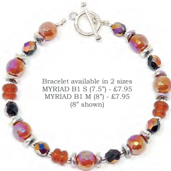
Bracelet available in 2 sizes MYRIAD B1 S (7.5") - £7.95 MYRIAD B1 M (8") - £7.95 (8" shown)