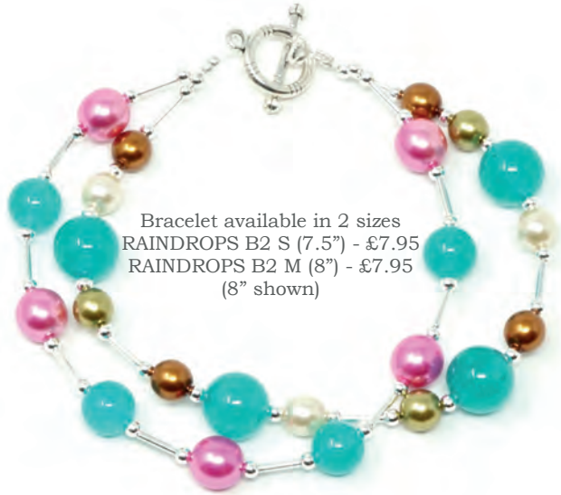
Bracelet available in 2 sizes RAINDROPS B2 S (7.5") - £7.95 RAINDROPS B2 M (8") - £7.95 (8" shown)