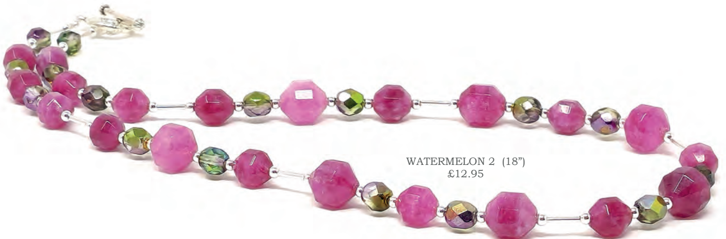
WATERMELON 2 (18") £12.95