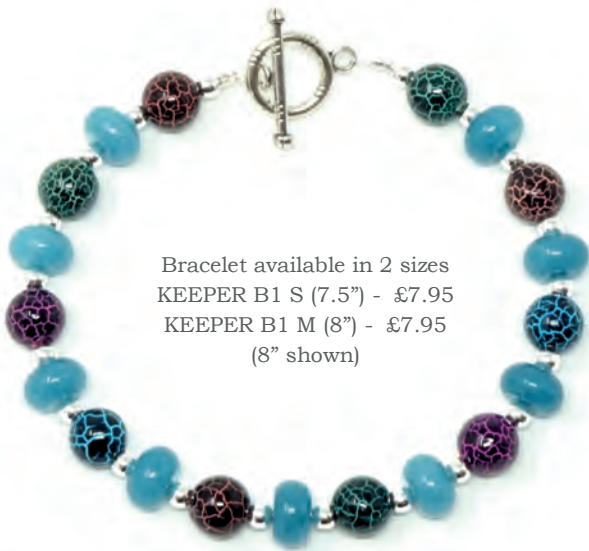
Bracelet available in 2 sizes KEEPER B1 S (7.5") - £7.95 KEEPER B1 M (8") - £7.95 (8" shown)