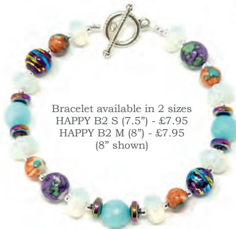
Bracelet available in 2 sizes HAPPY B2 S (7.5") - £7.95 HAPPY B2 M (8") - £7.95 (8" shown)