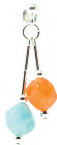
Earrings SHERBET E3 £4.95