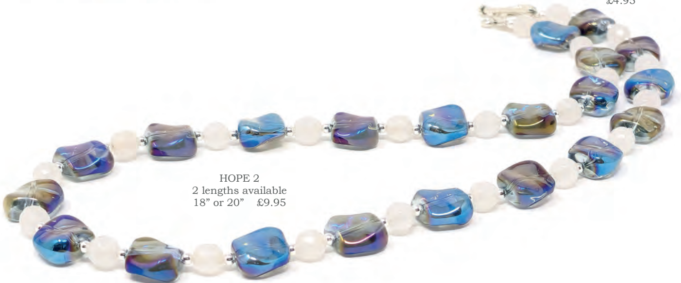
HOPE 2 2 lengths available 18" or 20" £9.95