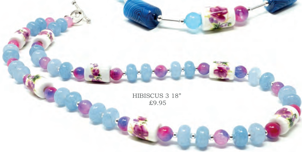
HIBISCUS 3 18" £9.95