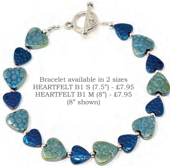
Bracelet available in 2 sizes HEARTFELT B1 S (7.5") - £7.95 HEARTFELT B1 M (8") - £7.95 (8" shown)