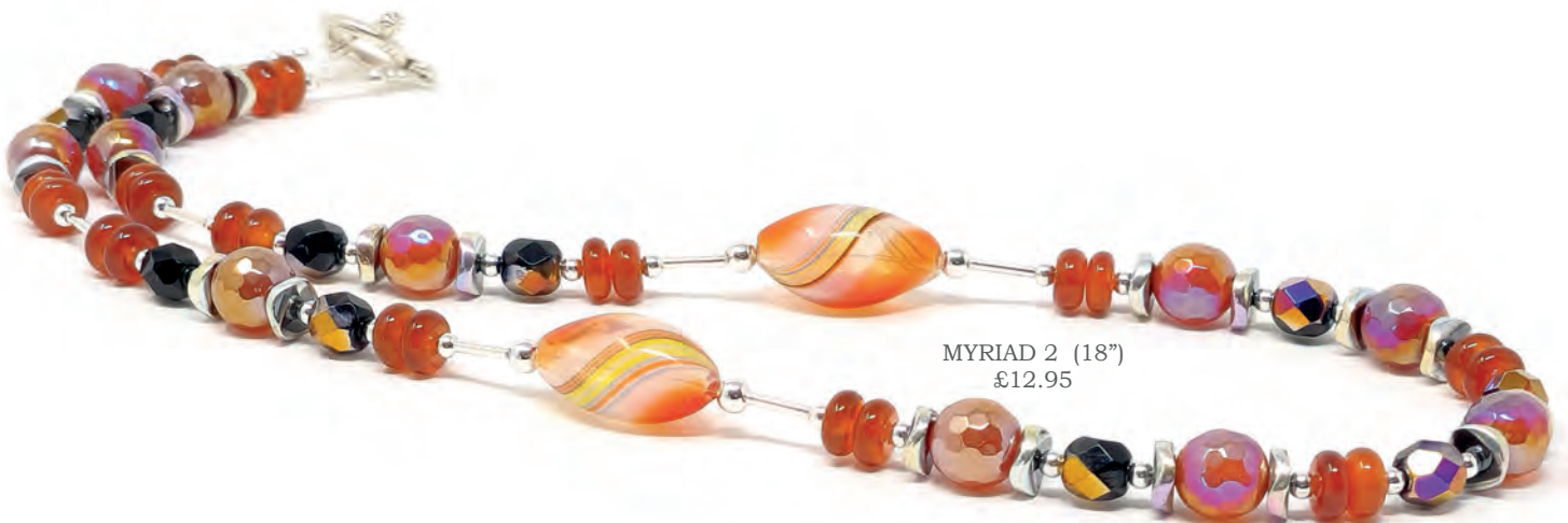
MYRIAD 2 (18") £12.95