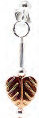
Earrings GATSBY E2 £4.95