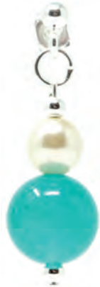
Earrings RAINDROPS E1 £4.95