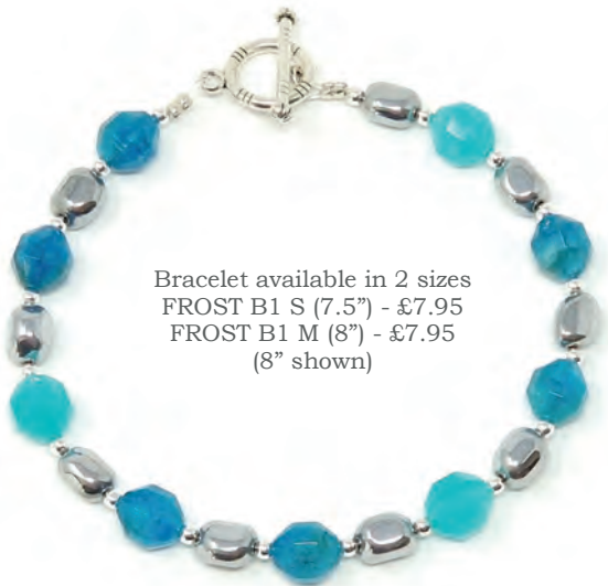
Bracelet available in 2 sizes FROST B1 S (7.5") - £7.95 FROST B1 M (8") - £7.95 (8" shown)