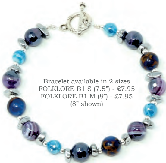
Bracelet available in 2 sizes FOLKLORE B1 S (7.5") - £7.95 FOLKLORE B1 M (8") - £7.95 (8" shown)