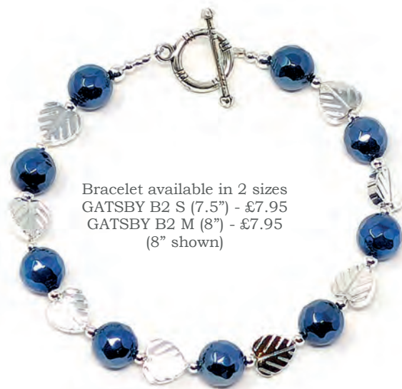
Bracelet available in 2 sizes GATSBY B2 S (7.5") - £7.95 GATSBY B2 M (8") - £7.95 (8" shown)