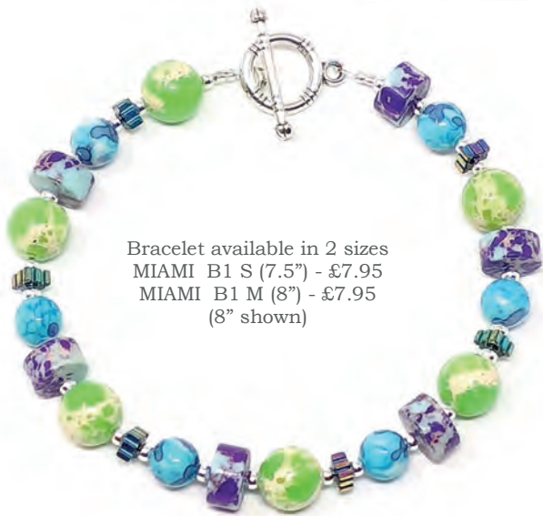
Bracelet available in 2 sizes MIAMI B1 S (7.5") - £7.95 MIAMI B1 M (8") - £7.95 (8" shown)