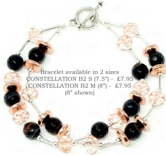
Bracelet available in 2 sizes CONSTELLATION B2 S (7.5") - £7.95 CONSTELLATION B2 M (8") - £7.95 (8" shown)