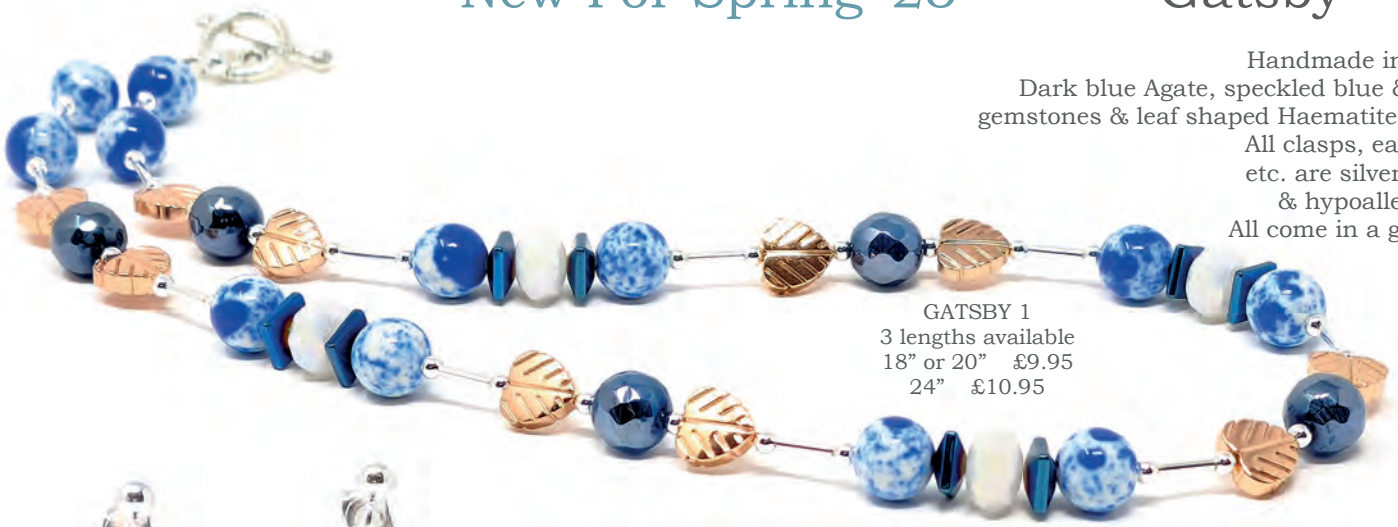
GATSBY 1 3 lengths available 18" or 20" £9.95 24" £10.95

Handmade in Wales Dark blue Agate, speckled blue & white gemstones & leaf shaped Haematite beads. All clasps, ear studs etc. are silver plated & hypoallergenic. All come in a gift box.