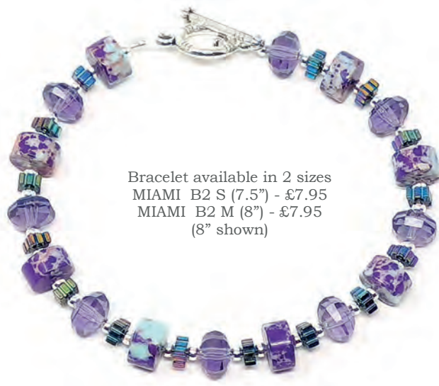
Bracelet available in 2 sizes MIAMI B2 S (7.5") - £7.95 MIAMI B2 M (8") - £7.95 (8" shown)