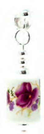
Earrings HIBISCUS E1 £4.95