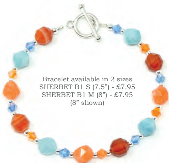
Bracelet available in 2 sizes SHERBET B1 S (7.5") - £7.95 SHERBET B1 M (8") - £7.95 (8" shown)