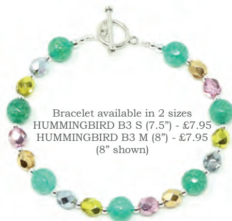
Bracelet available in 2 sizes HUMMINGBIRD B3 S (7.5") - £7.95 HUMMINGBIRD B3 M (8") - £7.95 (8" shown)