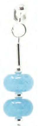
Earrings HIBISCUS E5 £4.95