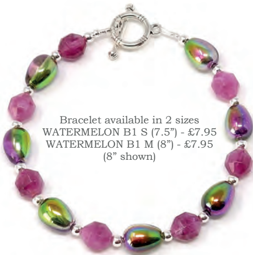
Bracelet available in 2 sizes WATERMELON B1 S (7.5") - £7.95 WATERMELON B1 M (8") - £7.95 (8" shown)