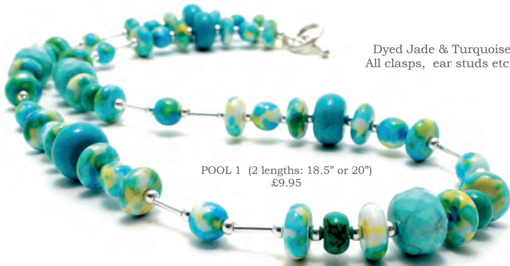
POOL 1 (2 lengths: 18.5" or 20") £9.95