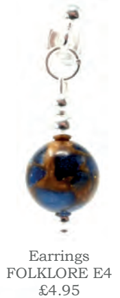
Earrings FOLKLORE E4 £4.95