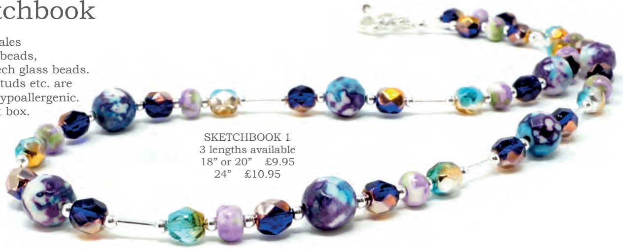
SKETCHBOOK 1 3 lengths available 18" or 20" £9.95 24" £10.95

Handmade in Wales Agate gemstone beads, dyed Jade & Czech glass beads. All clasps, ear studs etc. are silver plated & hypoallergenic. All come in a gift box.