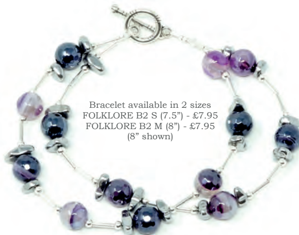
Bracelet available in 2 sizes FOLKLORE B2 S (7.5") - £7.95 FOLKLORE B2 M (8") - £7.95 (8" shown)