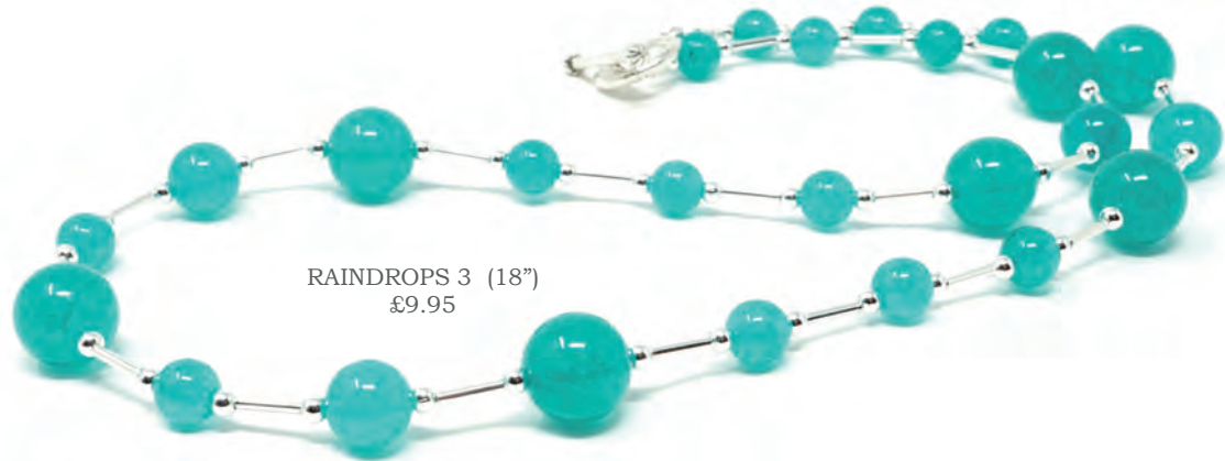
RAINDROPS 3 (18") £9.95