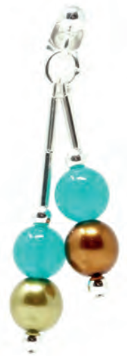
Earrings RAINDROPS E3 £4.95