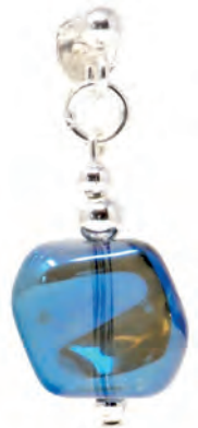
Earrings HOPE E3 £4.95