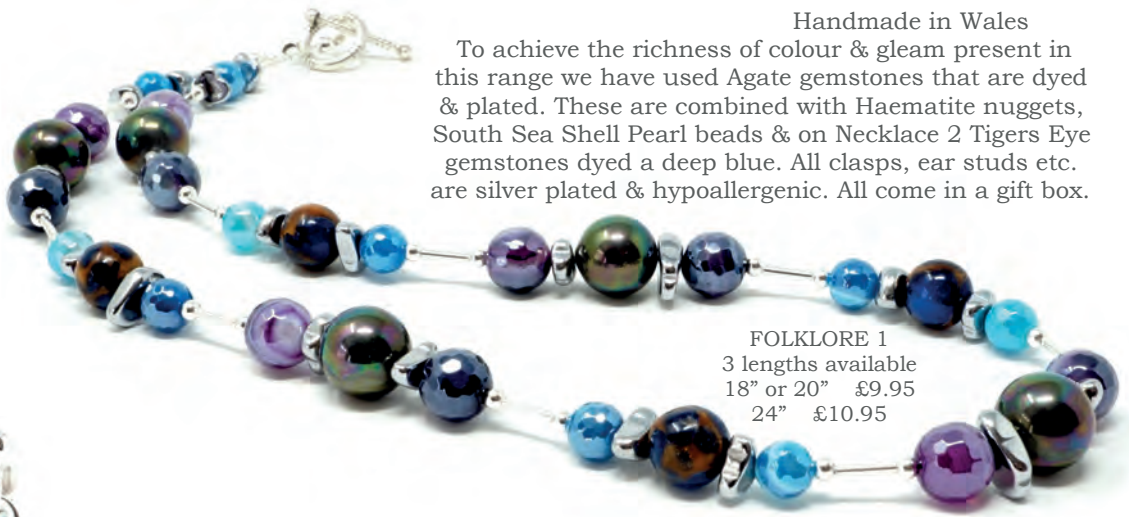
FOLKLORE 1 3 lengths available 18" or 20" £9.95 24" £10.95