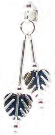
Earrings GATSBY E3 £4.95