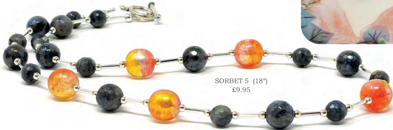
SORBET 5 (18") £9.95