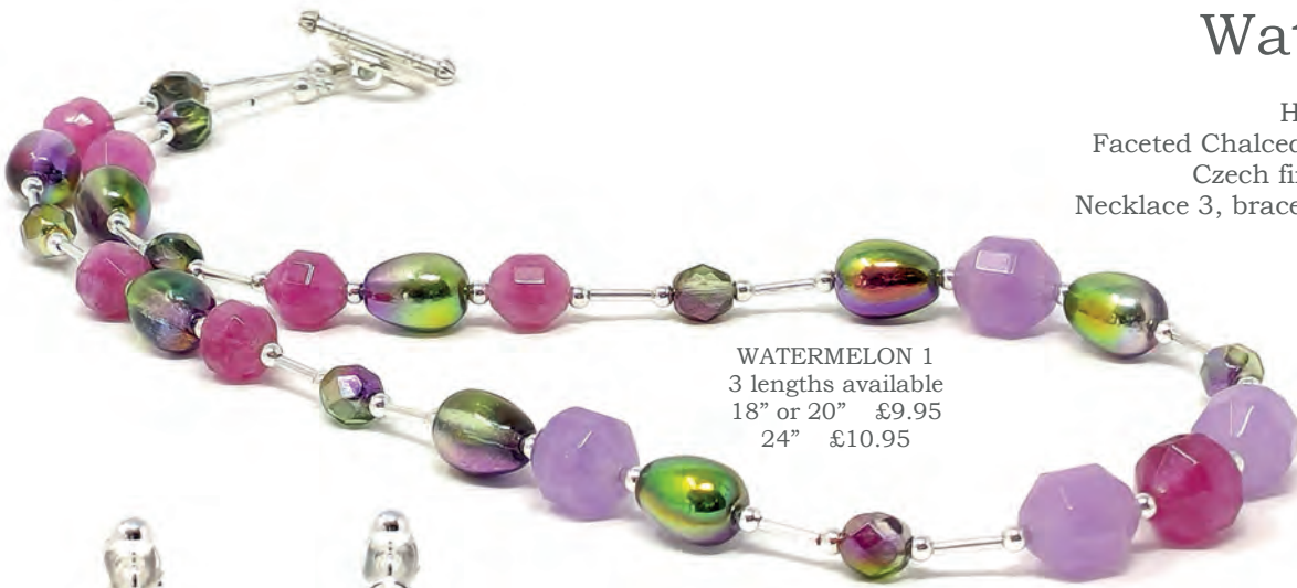
WATERMELON 1 3 lengths available 18" or 20" £9.95 24" £10.95

Faceted Chalcedony gemstones alongside Czech fire-polished crystal beads. Necklace 3, bracelet 2 & earrings 2 feature Freshwater Pearls. All clasps, ear studs etc. are silver plated & hypoallergenic. All come in a gift box.