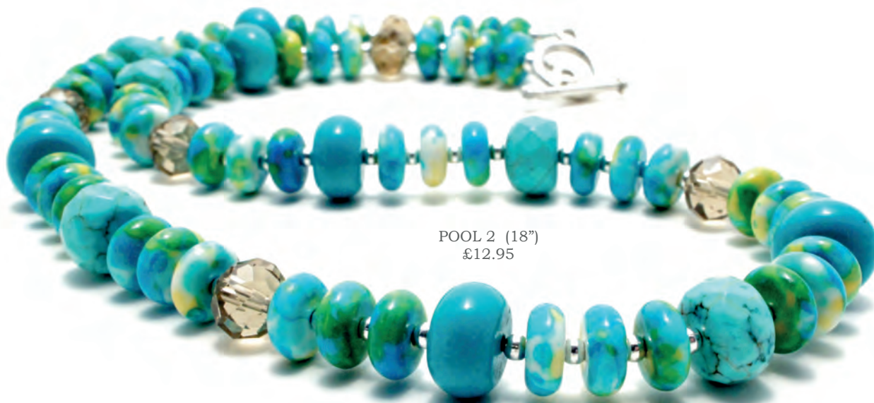
POOL 2 (18") £12.95