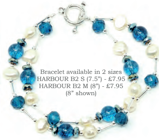
Bracelet available in 2 sizes HARBOUR B2 S (7.5") - £7.95 HARBOUR B2 M (8") - £7.95 (8" shown)