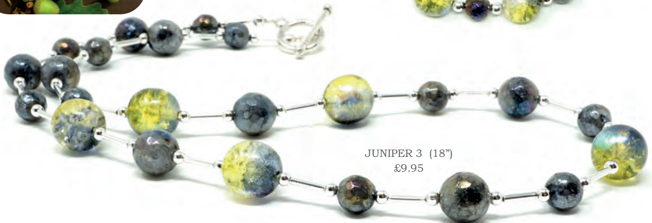
JUNIPER 3 (18") £9.95