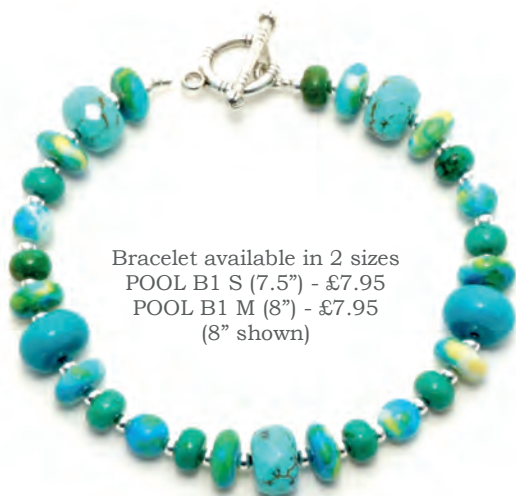
Bracelet available in 2 sizes POOL B1 S (7.5") - £7.95 POOL B1 M (8") - £7.95 (8" shown)