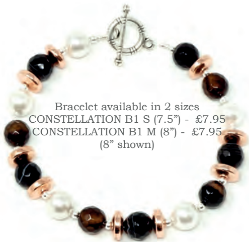
Bracelet available in 2 sizes CONSTELLATION B1 S (7.5") - £7.95 CONSTELLATION B1 M (8") - £7.95 (8" shown)