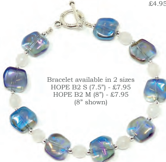
Bracelet available in 2 sizes HOPE B2 S (7.5") - £7.95 HOPE B2 M (8") - £7.95 (8" shown)