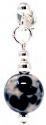
Earrings FROST E3 £4.95