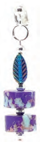
Earrings MIAMI E3 £4.95