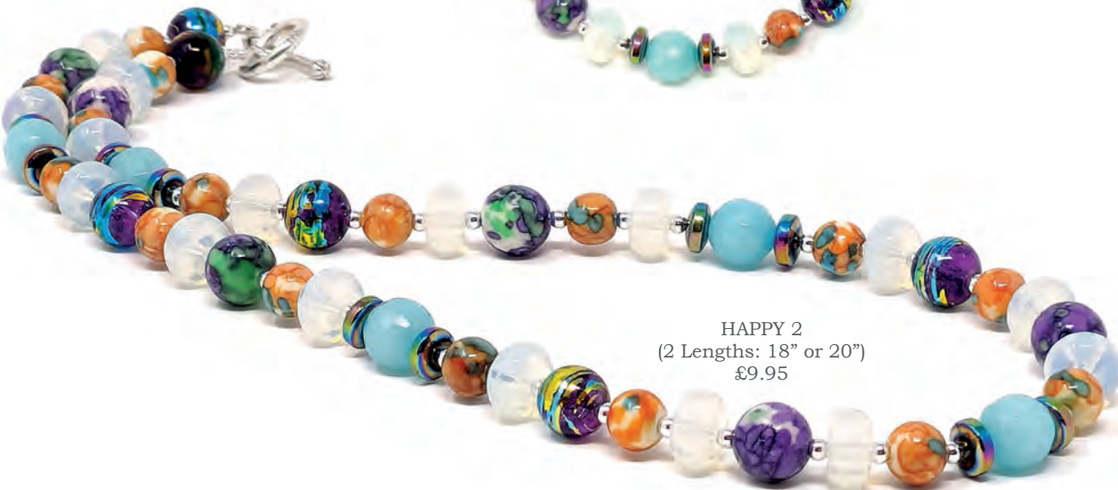
HAPPY 2 (2 Lengths: 18" or 20") £9.95