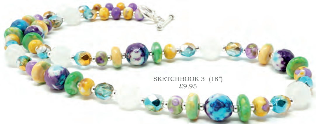
SKETCHBOOK 3 (18") £9.95