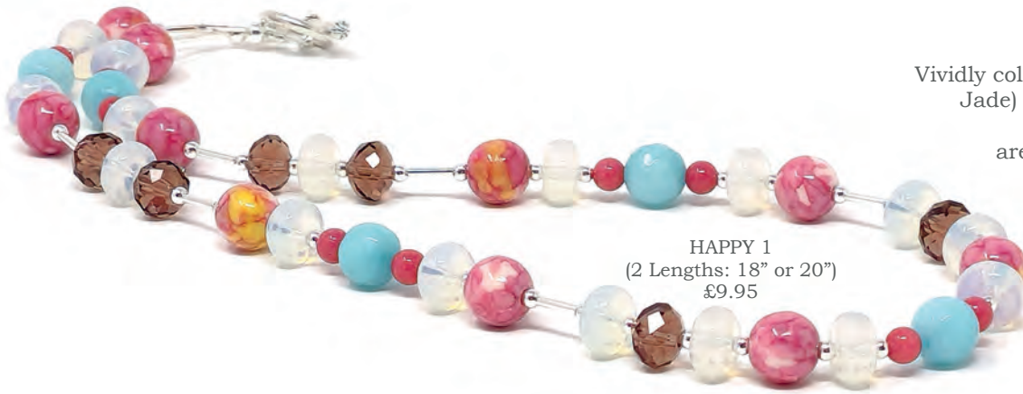
HAPPY 1 (2 Lengths: 18" or 20") £9.95

Handmade in Wales Vividly coloured gemstones (Agate & dyed Jade) are combined with glass beads. All clasps, ear studs etc. are silver plated & hypoallergenic. All come in a gift box.