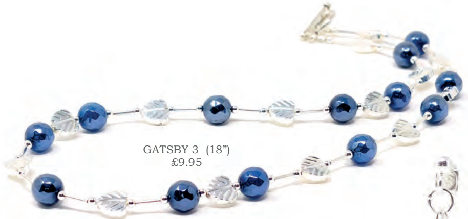
GATSBY 3 (18") £9.95