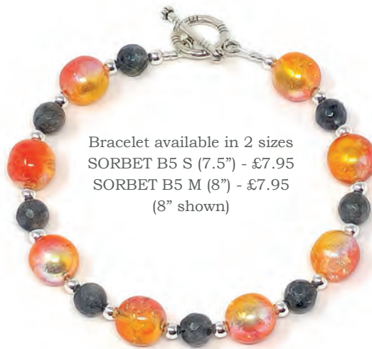
Bracelet available in 2 sizes SORBET B5 S (7.5") - £7.95 SORBET B5 M (8") - £7.95 (8" shown)