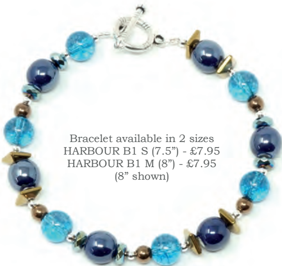
Bracelet available in 2 sizes HARBOUR B1 S (7.5") - £7.95 HARBOUR B1 M (8") - £7.95 (8" shown)