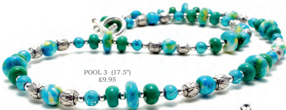
POOL 3 (17.5") £9.95