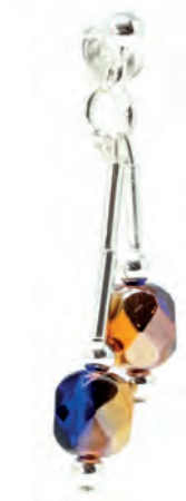
Earrings SKETCHBOOK E2 £4.95