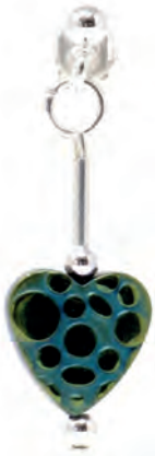
Earrings HEARTFELT E2 £4.95