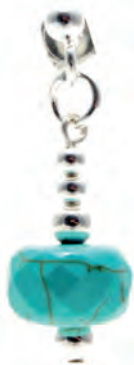
Earrings POOL E1 £4.95