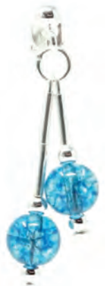
Earrings HARBOUR E3 £4.95