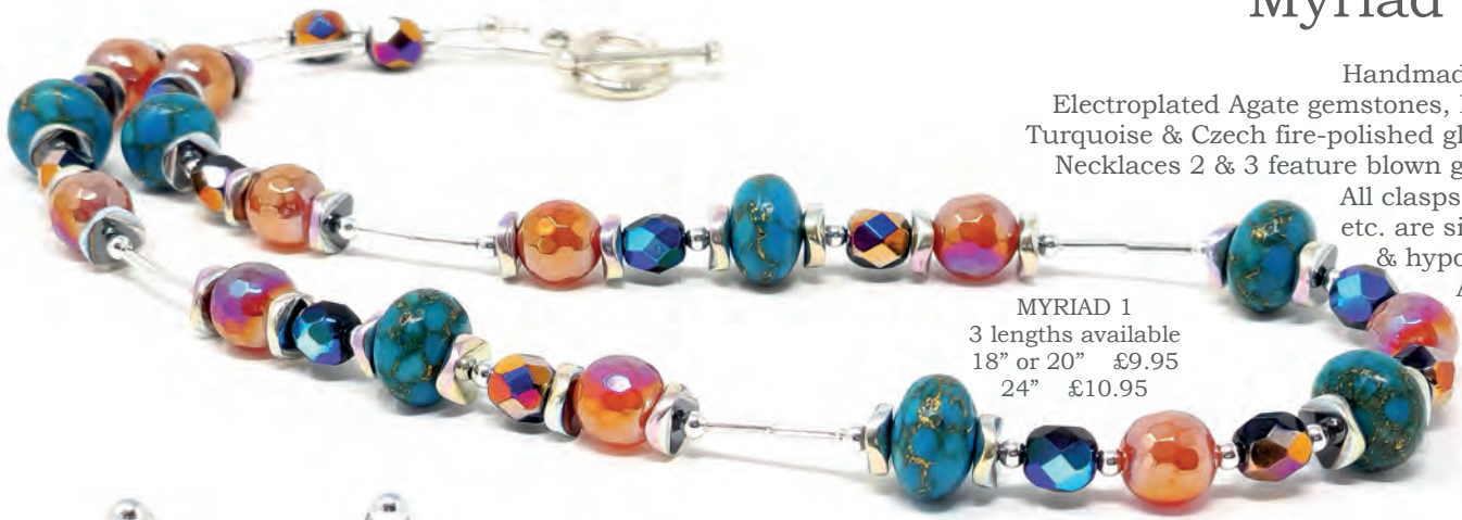
MYRIAD 1 3 lengths available 18" or 20" £9.95 24" £10.95

Handmade in Wales Electroplated Agate gemstones, Haematite, Turquoise & Czech fire-polished glass beads. Necklaces 2 & 3 feature blown glass beads All clasps, ear studs etc. are silver plated & hypoallergenic. All come in a gift box.