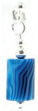
Earrings HIBISCUS E4 £4.95