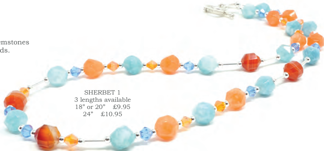
SHERBET 1 3 lengths available 18" or 20" £9.95 24" £10.95

Handmade in Wales Chalcedony & Carnelian gemstones & small faceted crystal beads. Necklace 2 features large freshwater pearls. All clasps, ear studs etc. are silver plated & hypoallergenic. All come in a gift box.