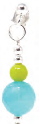
Earrings HAPPY E3 £4.95