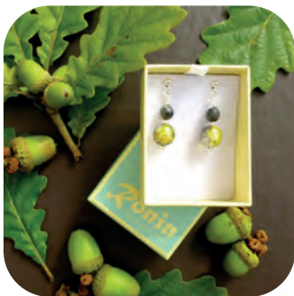
Earrings JUNIPER E1 £4.95

Handmade in Wales Labradorite gemstones & Czech glass beads. All clasps, ear studs etc. are silver plated & hypoallergenic. All come in a gift box.