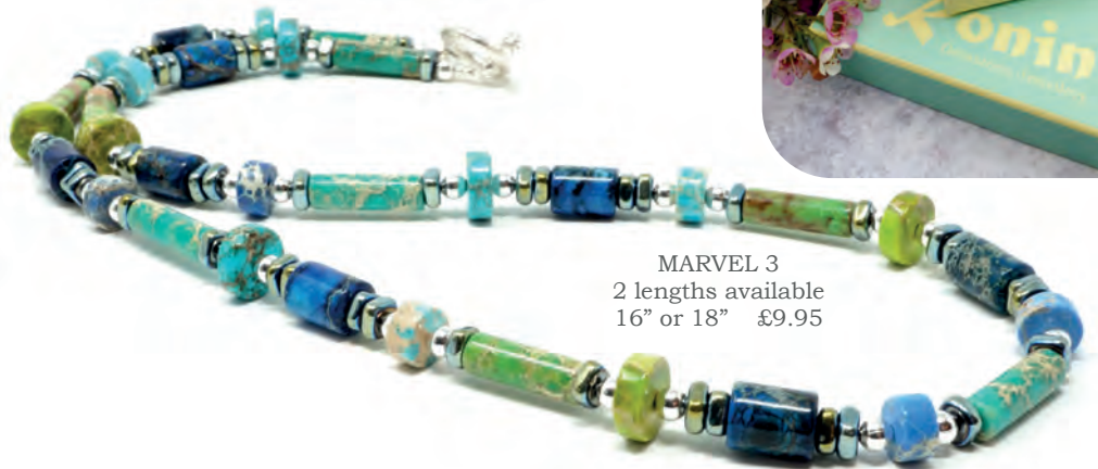
MARVEL 3 2 lengths available 16" or 18" £9.95