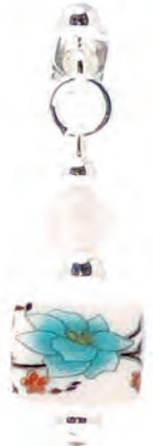
Earrings LILY E1 £4.95