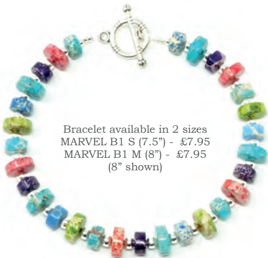
Bracelet available in 2 sizes MARVEL B1 S (7.5") - £7.95 MARVEL B1 M (8") - £7.95 (8" shown)