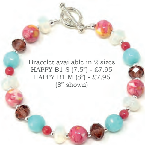
Bracelet available in 2 sizes HAPPY B1 S (7.5") - £7.95 HAPPY B1 M (8") - £7.95 (8" shown)