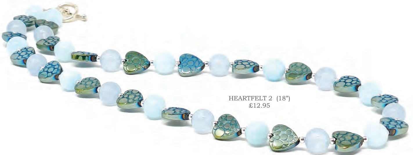
HEARTFELT 2 (18") £12.95