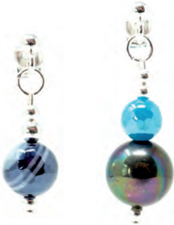
Earrings FOLKLORE E1 £4.95