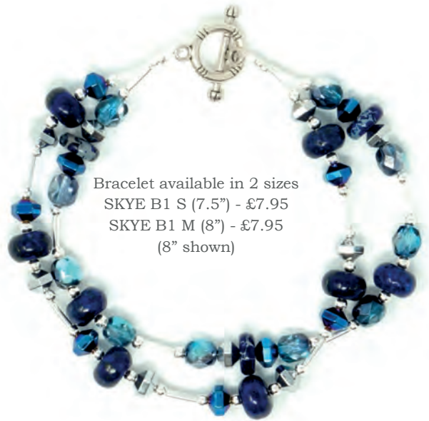
Bracelet available in 2 sizes SKYE B1 S (7.5") - £7.95 SKYE B1 M (8") - £7.95 (8" shown)