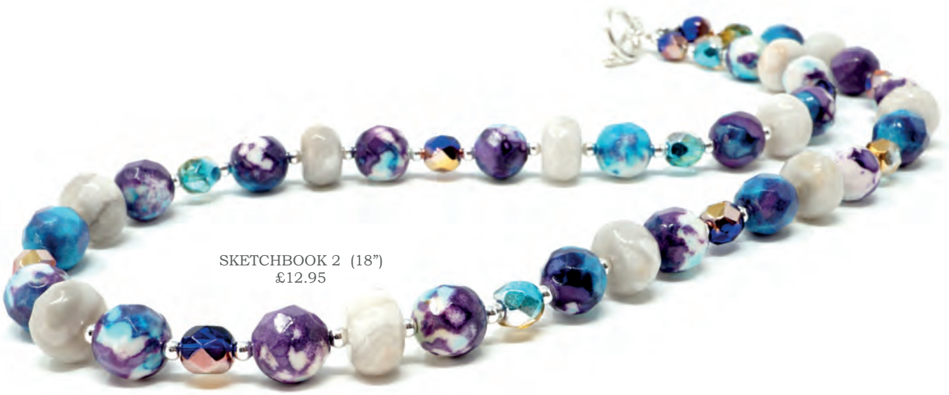
SKETCHBOOK 2 (18") £12.95