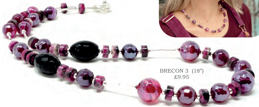
BRECON 3 (18") £9.95