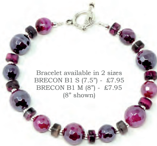
Bracelet available in 2 sizes BRECON B1 S (7.5") - £7.95 BRECON B1 M (8") - £7.95 (8" shown)