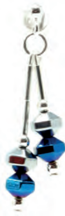
Earrings SKYE E3 £4.95

All clasps, ear studs etc. are silver plated & hypoallergenic. All come in a gift box.