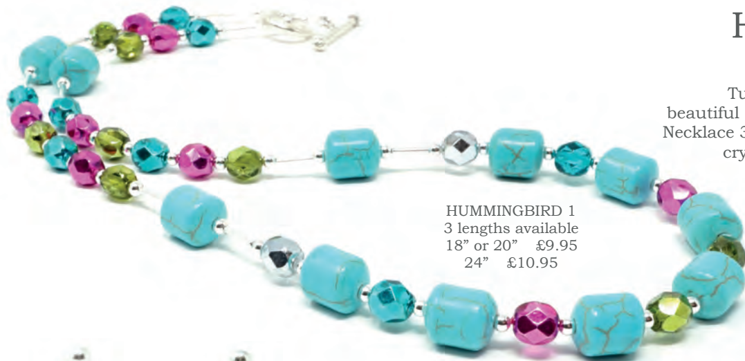
HUMMINGBIRD 1 3 lengths available 18" or 20" £9.95 24" £10.95