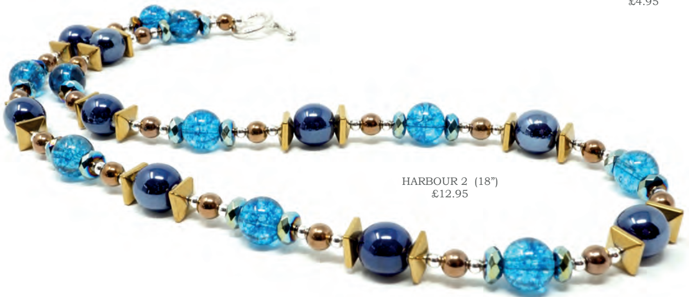
HARBOUR 2 (18") £12.95