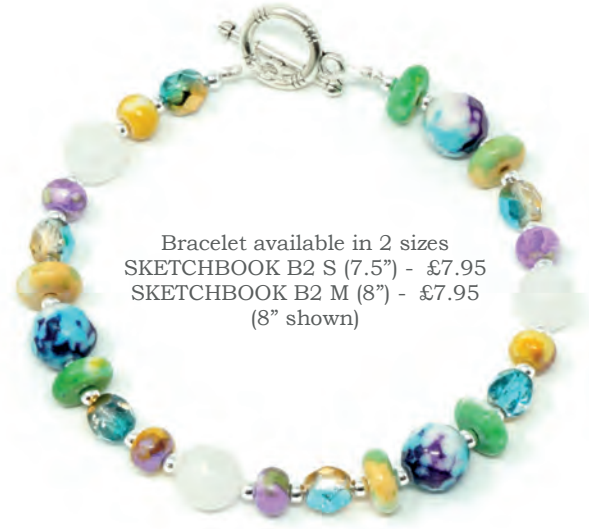
Bracelet available in 2 sizes SKETCHBOOK B2 S (7.5") - £7.95 SKETCHBOOK B2 M (8") - £7.95 (8" shown)