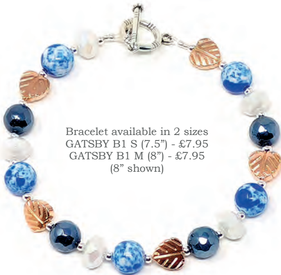
Bracelet available in 2 sizes GATSBY B1 S (7.5") - £7.95 GATSBY B1 M (8") - £7.95 (8" shown)