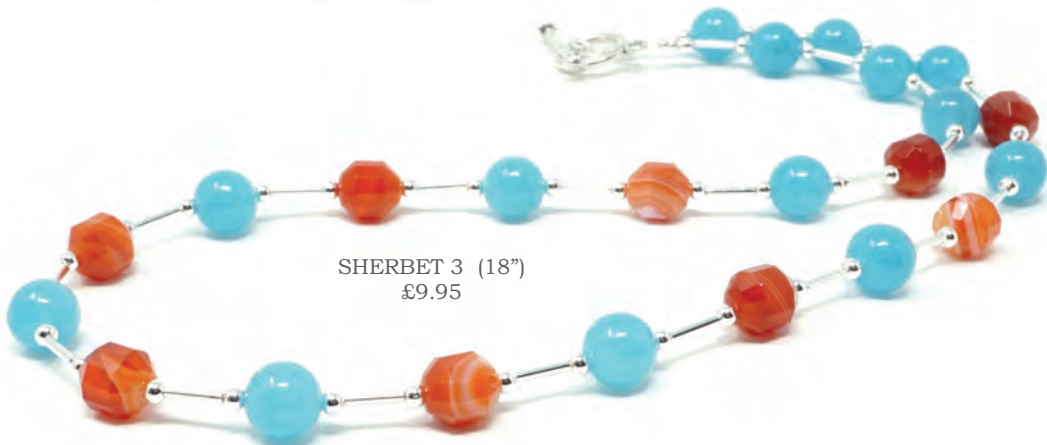
SHERBET 3 (18") £9.95