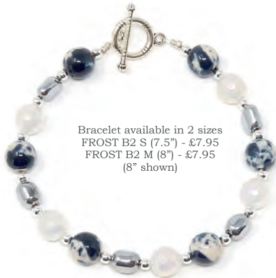
Bracelet available in 2 sizes FROST B2 S (7.5") - £7.95 FROST B2 M (8") - £7.95 (8" shown)