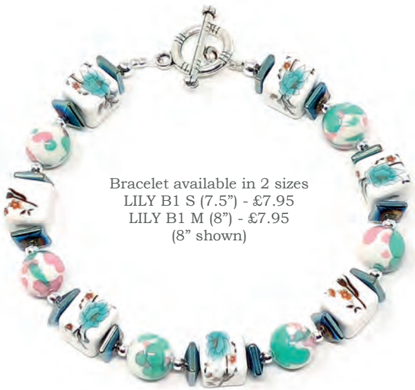
Bracelet available in 2 sizes LILY B1 S (7.5") - £7.95 LILY B1 M (8") - £7.95 (8" shown)