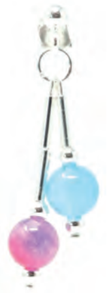
Earrings HIBISCUS E3 £4.95