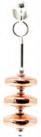
Earrings CONSTELLATION E3 £4.95