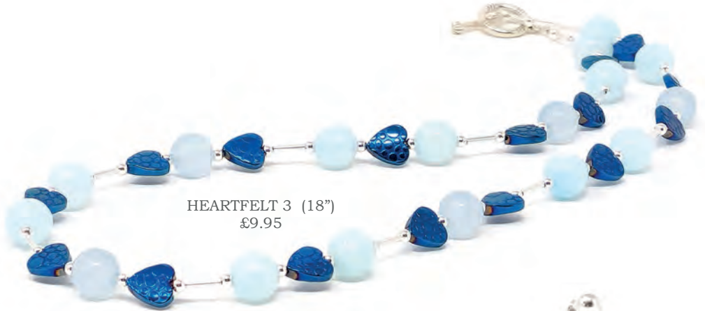
HEARTFELT 3 (18") £9.95