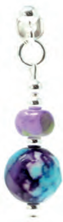
Earrings SKETCHBOOK E1 £4.95