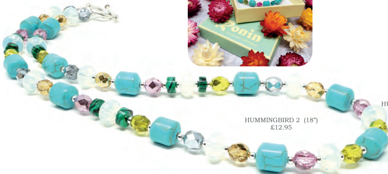
HUMMINGBIRD 2 (18") £12.95