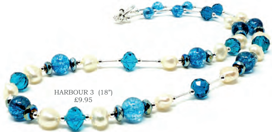
HARBOUR 3 (18") £9.95