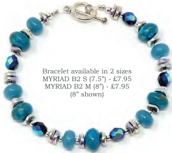
Bracelet available in 2 sizes MYRIAD B2 S (7.5") - £7.95 MYRIAD B2 M (8") - £7.95 (8" shown)