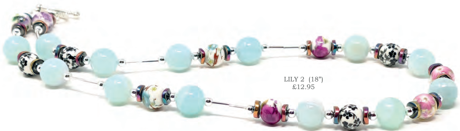
LILY 2 (18") £12.95