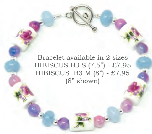
Bracelet available in 2 sizes HIBISCUS B3 S (7.5") - £7.95 HIBISCUS B3 M (8") - £7.95 (8" shown)