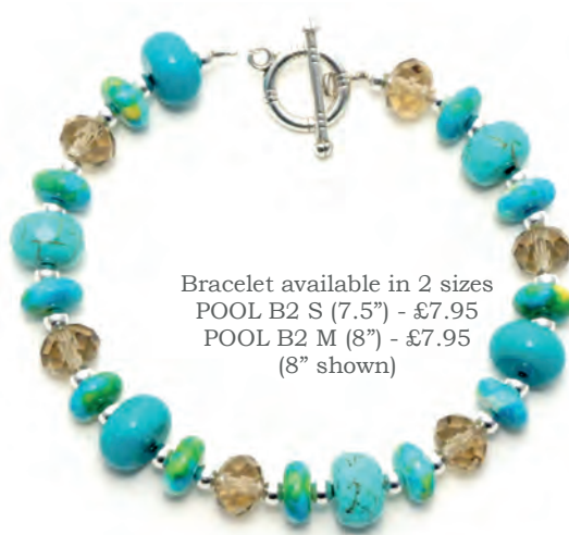
Bracelet available in 2 sizes POOL B2 S (7.5") - £7.95 POOL B2 M (8") - £7.95 (8" shown)