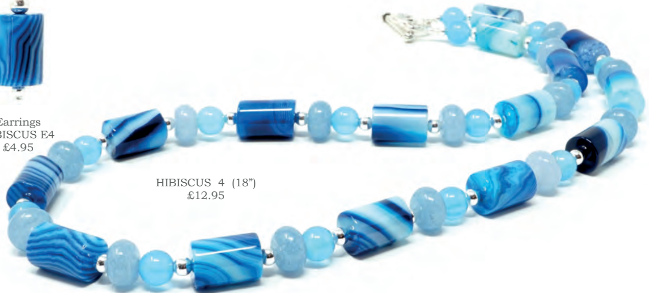
HIBISCUS 4 (18") £12.95