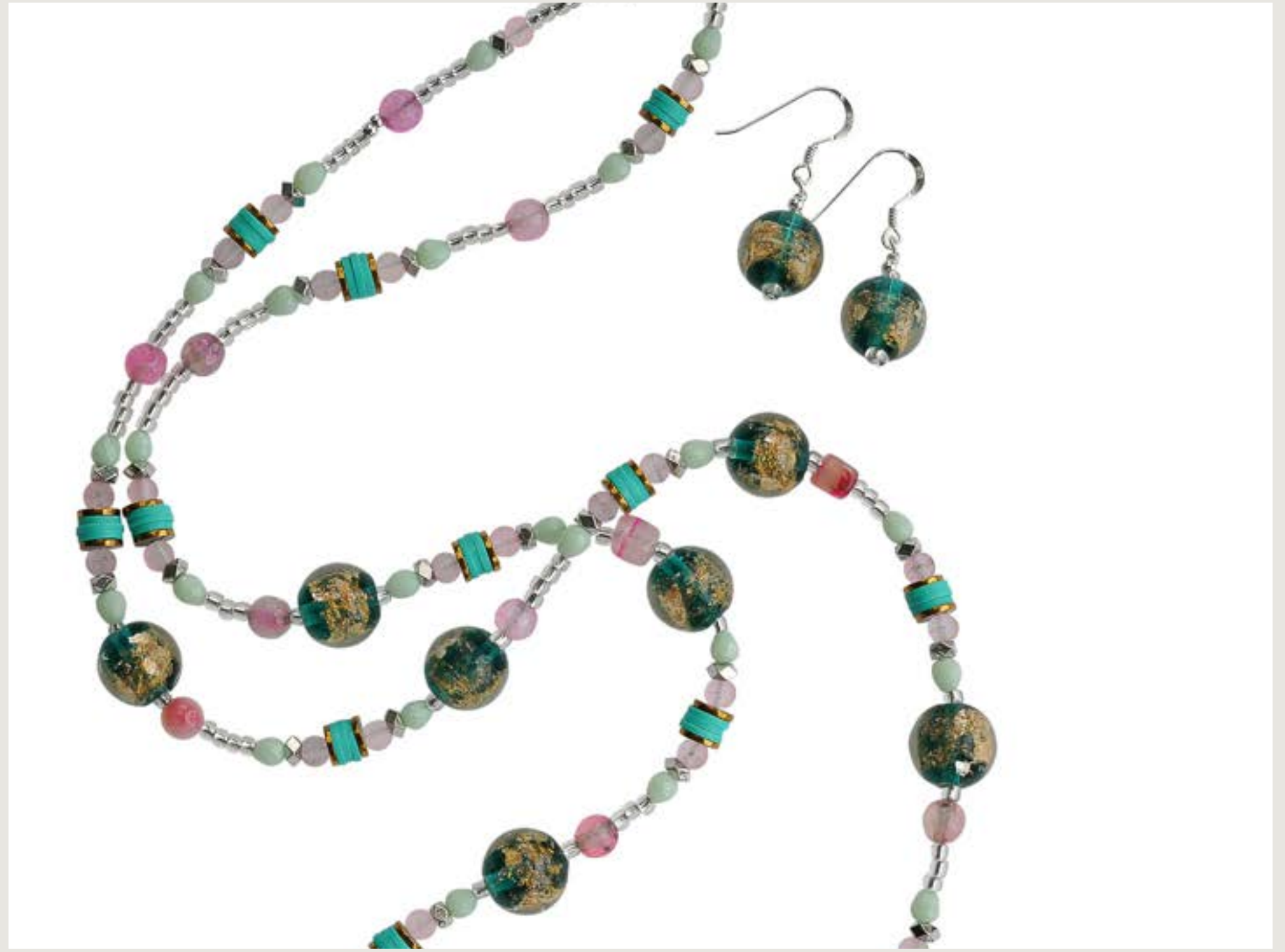
Long lampwork foil glass, jasper, frosted glass, hematite and agate necklace.