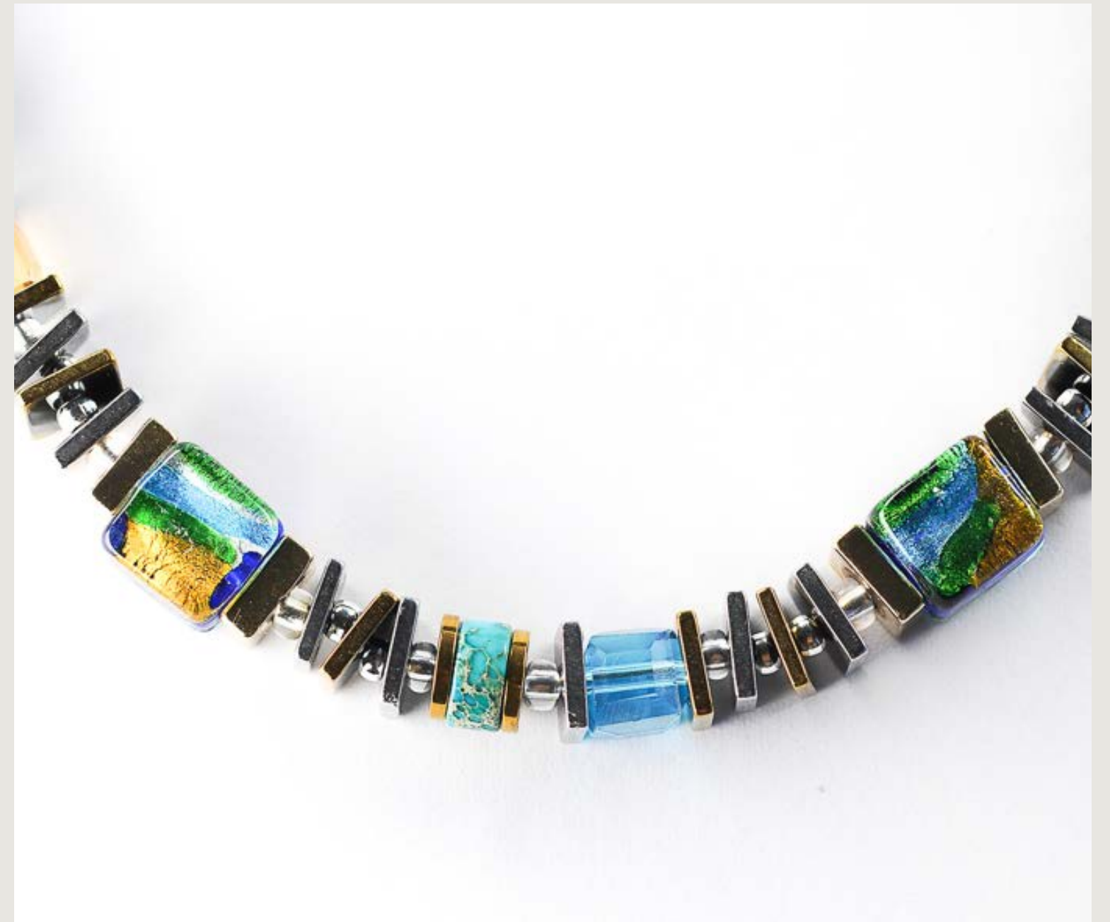
GTH8 : Half bead lampwork foil glass, hematite and jasper necklace, stainless steel magnetic clasp. Necklace 18" long, bracelet measures 7.5"-7.75"