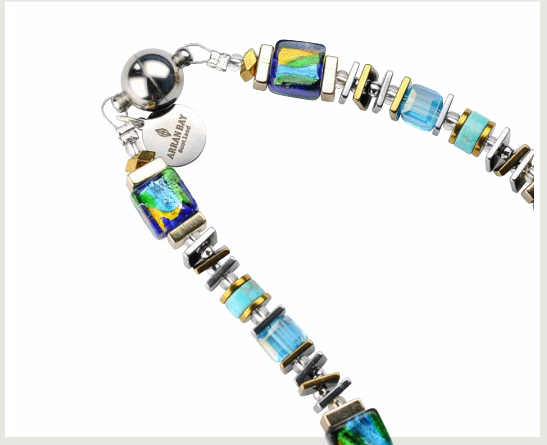
HL8 : Lampwork foil glass, hematite and jasper necklace, 925 silver magnetic clasp. Necklace 18" long, bracelet measures 7.5"-7.75"