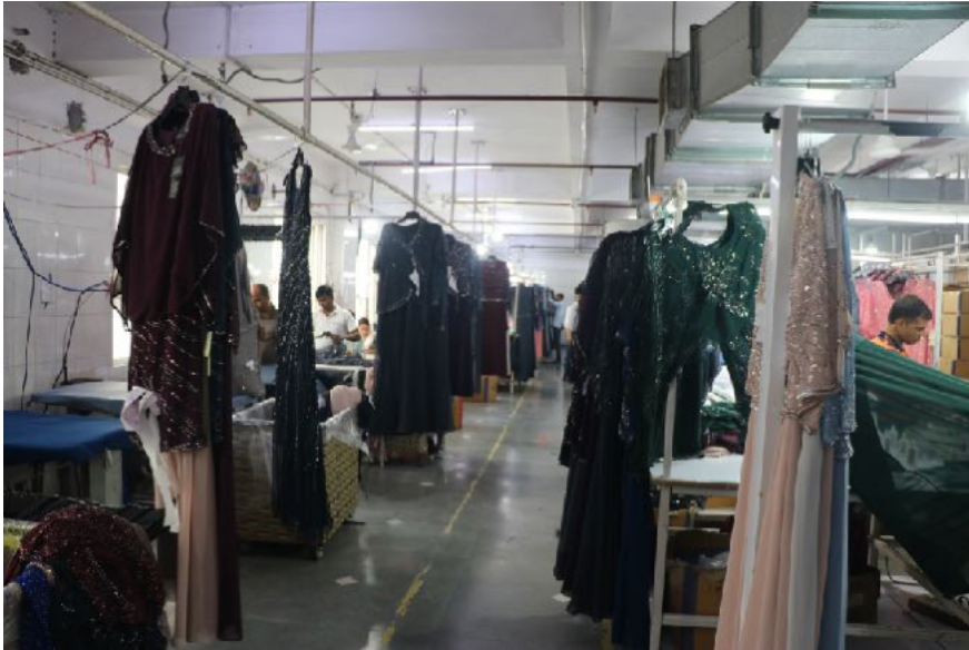
Hangar movement of Garments on the floor