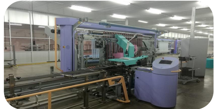
Staubli Auto Draw-in