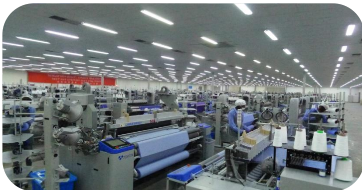
Toyota JAT 810 loom