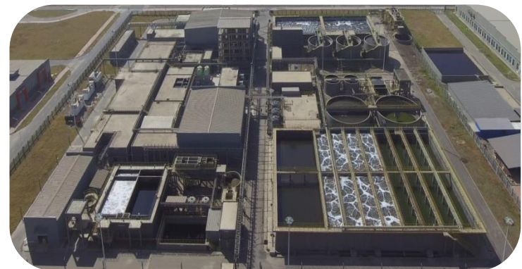
Zero Liquid Discharge