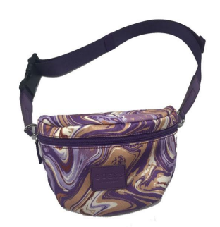
MODEL:WT-C108 SIZE:LWH-21X7X13.5 cm