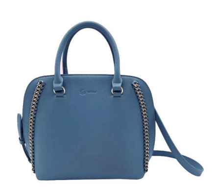
MODEL:SW-B543 SIZE:LWH-26X10.5X23 cm