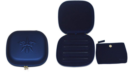
MODELIWT-9416R2-OT SIZE:LWH-20X16.5X5.5 cm