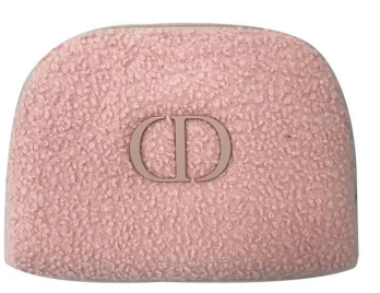
MODEL:WT-C323 SIZE:LH-21X3.5 cm