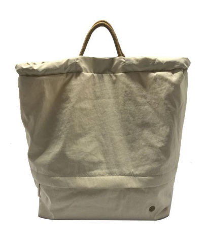
MODEL:SW-B675R2 SIZE:LWH-35X17X40 cm