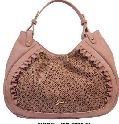
MODEL: SW-9725-CL SIZE: LWH-41.5X11.5X27CM