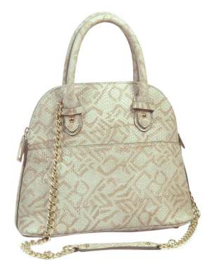
MODEL: SW-9759-TB SIZE: LWH-35X13X26CM