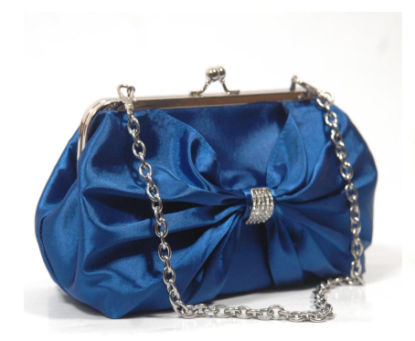
MODEL: WT-9269-CL SIZE: LWH-25X8X12cm