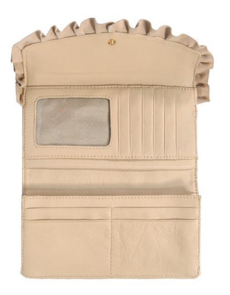
MODEL:SW-B983 SIZE:LWH-35X10.5X31 cm