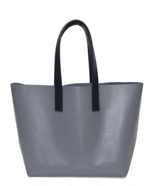
MODEL:SW-A310-TB SIZE:LWH-30X13X26 cm