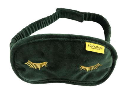
MODEL:WT-C518R2 SIZE:LH-19.5X8.5 cm