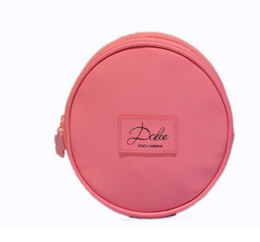
MODEL:WT-B238-OT SIZE:LWH-22X8X21 cm