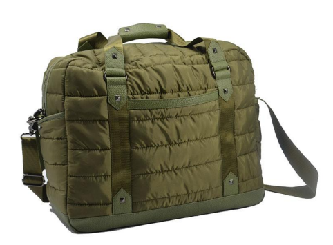
MODEL:SW-B577 SIZE:LWH-45X21X34 cm