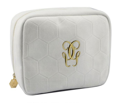
MODEL:WT-C013 SIZE:LWH-21X7X15 cm