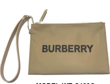
MODEL:WT-C139C SIZE:LH-22X13.3 cm