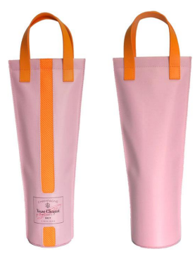
MODEL:WT--B239R3-OT SIZE:Dia-9.5X35 cm