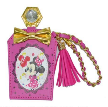
MODEL:WT-A164R1-OT SIZE:LH-7.7X9.8 cm