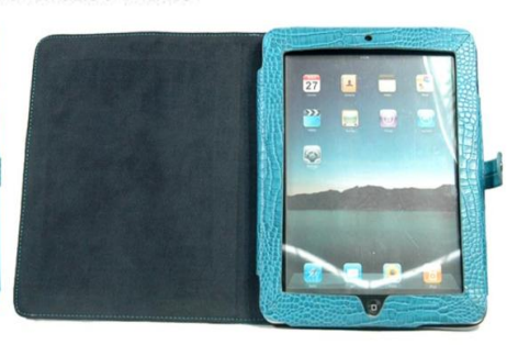
MODEL - SM-0833-OT