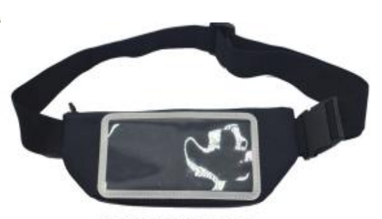
MODEL:WT-A506R3-OT SIZE:LH-23X9 cm