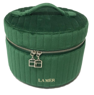
MODEL:WT-C620 SIZE:LH-20.8X12.4 cm