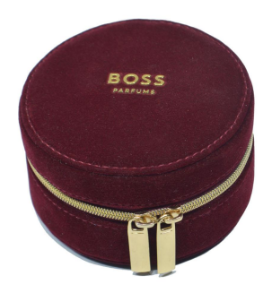
MODEL:WT-C596R4A SIZE:Dia-10x4.5 cm