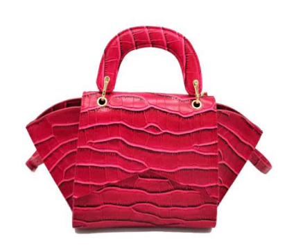
MODEL:SW-B535 SIZE:LWH-32X11X17 cm