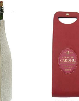
MODEL:WT-9500R1-OT SIZE:LWH-10.5X10.5X29 cm