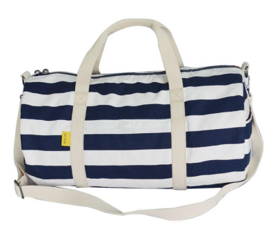
MODEL: SW-B182A SIZE:LWH-52X25X25 cm