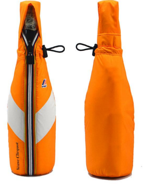
MODEL:WT-C008R3 SIZE:LH-9.5X32.5 cm