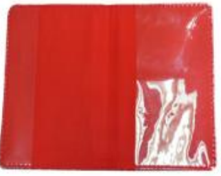
MODEL:WT-B256B-OT SIZE:LH-9.5X14 cm