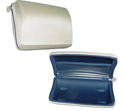
MODEL:WT-1479-OT SIZE:LWH16X6.5X11(CM) CAT:OTHER