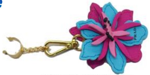
MODEL:WT-A949R4C-OT SIZE:LH-7.5X7 cm