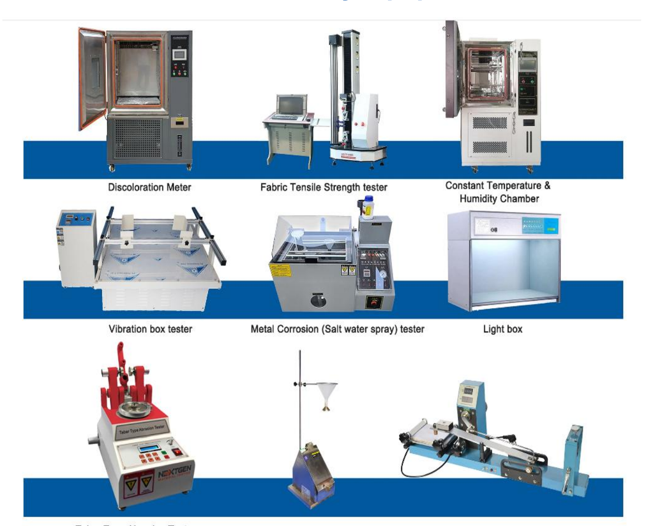
Taber Type Abrasion Tester