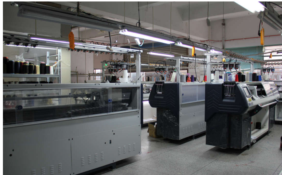
Flat knitting machine