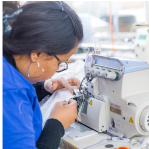
High-tech sewing machines with attachments