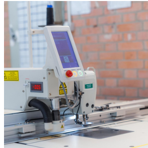
High accuracy automatic sewing machine with laser cutter