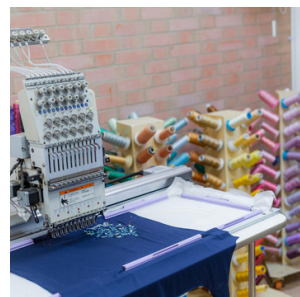
In-house computerized single and multi-head embroidery machines