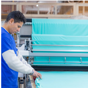
Automatic fabric spreading machine