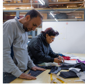
Sampling and fitting