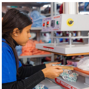
Heat pressing devices for fusing, heat transfer printing, and labeling