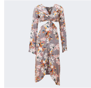
Product 3D mockup