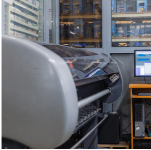
Computerized pattern, marker making, and design