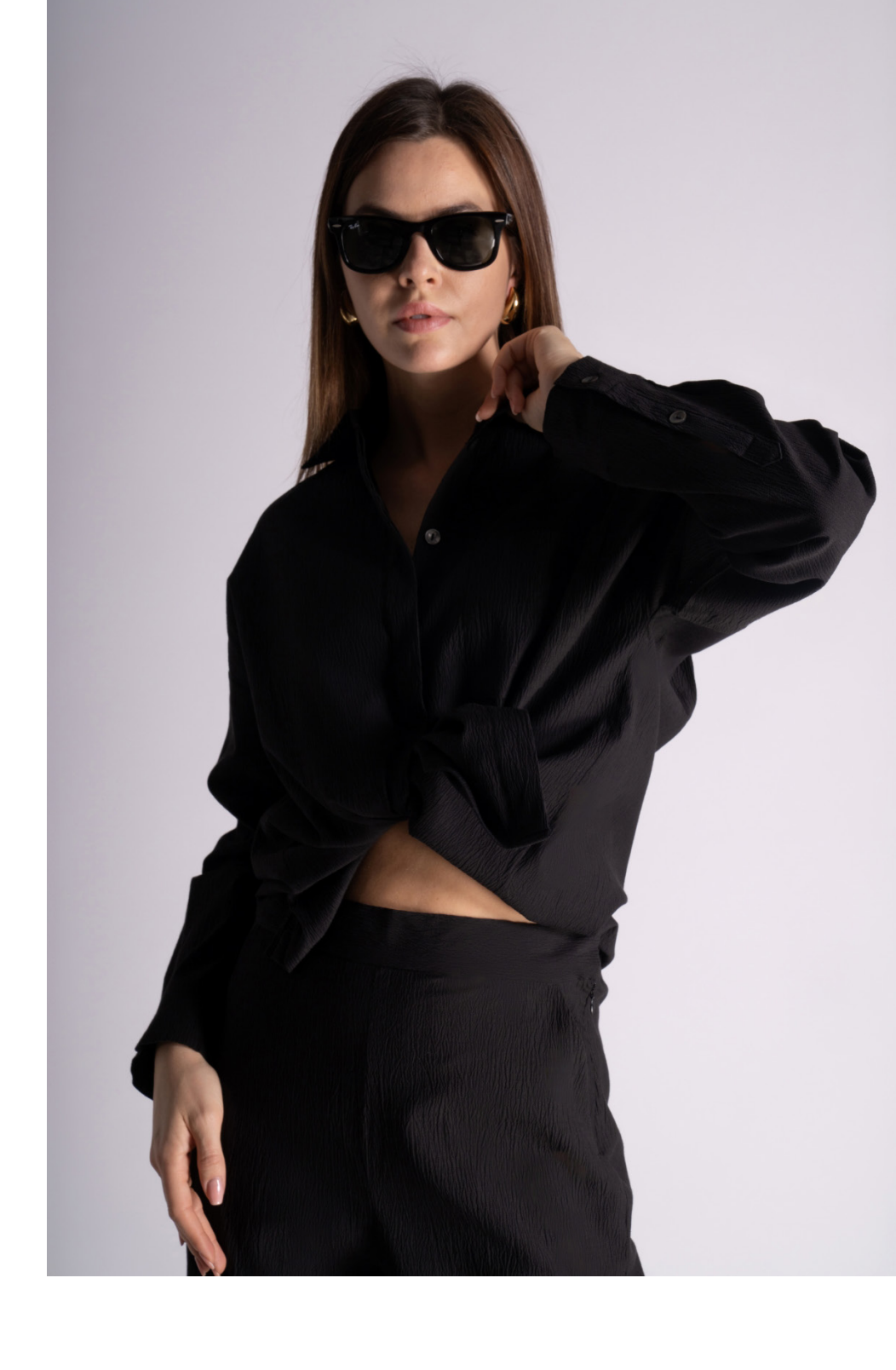
P/N: BR241160 Product Name: Darted Smart Trousers and Long Shirt Product Detail: Cotton -Elastane