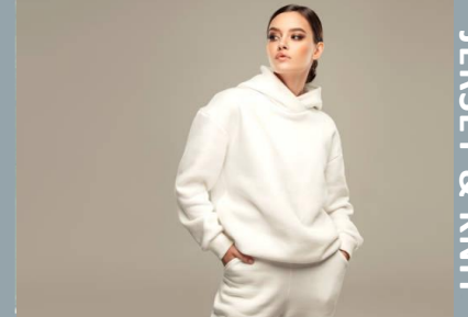
JERSEY & KNIT