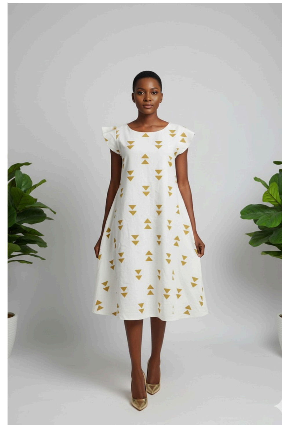
MADE FROM OUR FABRIC BY TUWE BORA.