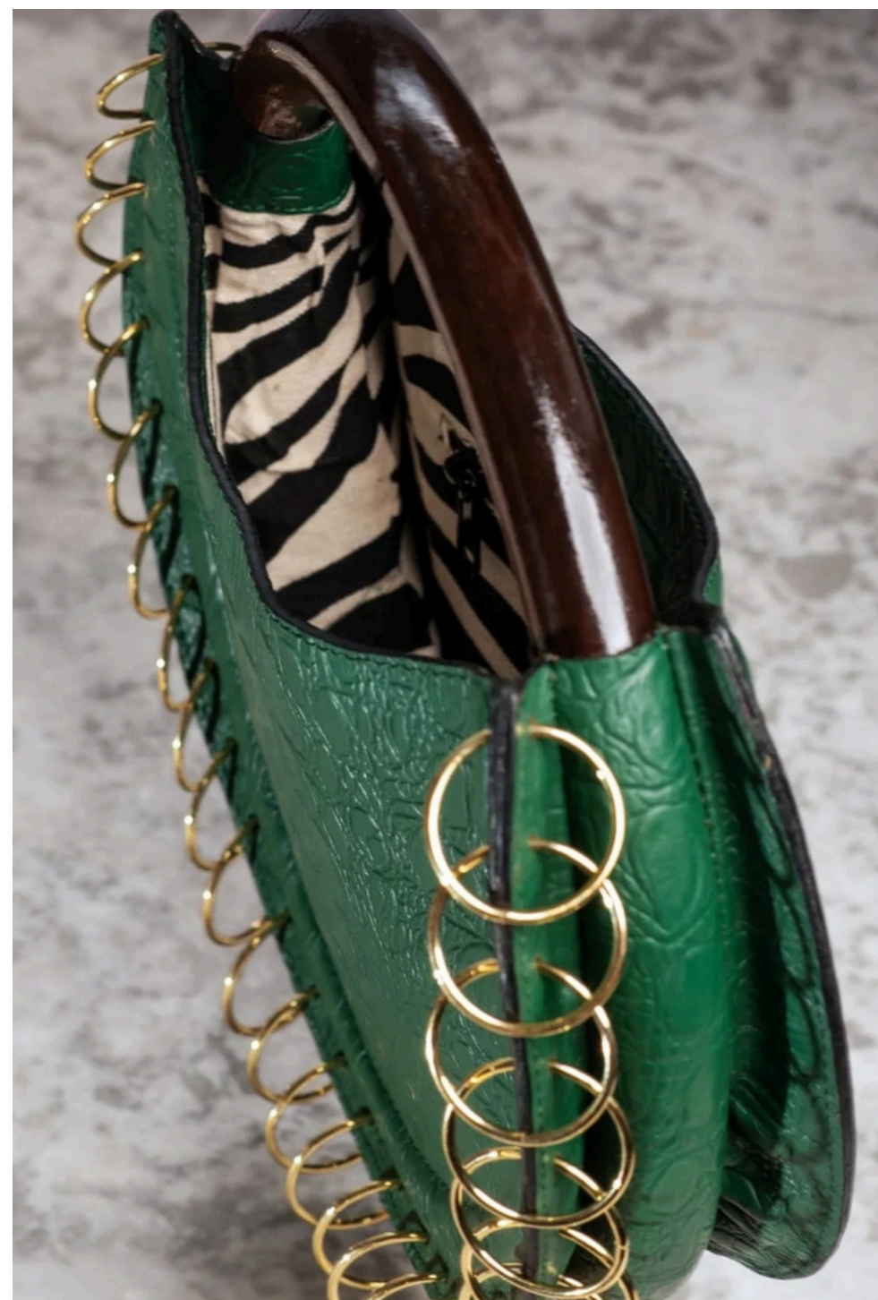
LINED WITH OUR FABRIC BY KISERO NAIROBI