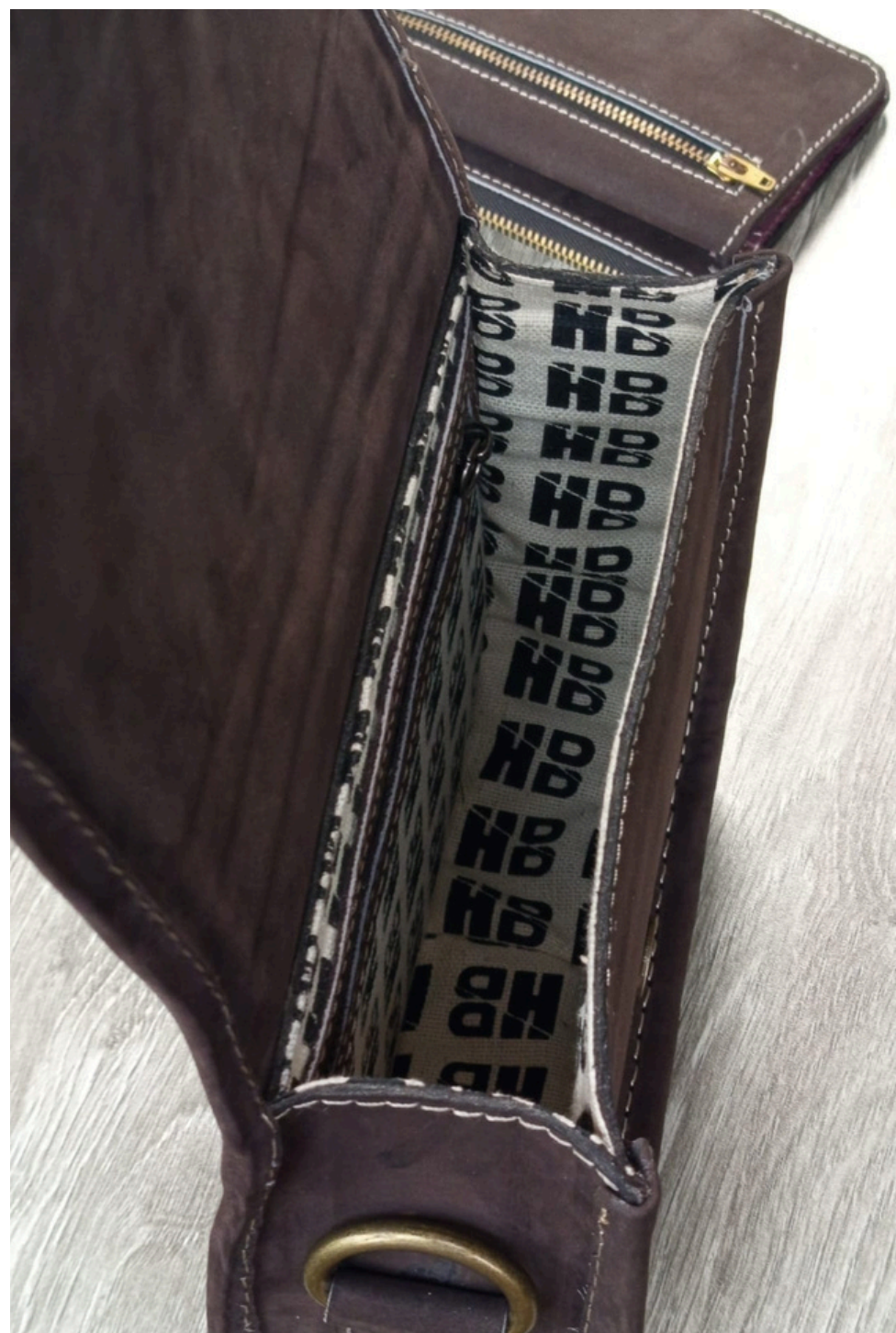
LINED WITH OUR FABRIC BY HB LEATHER.