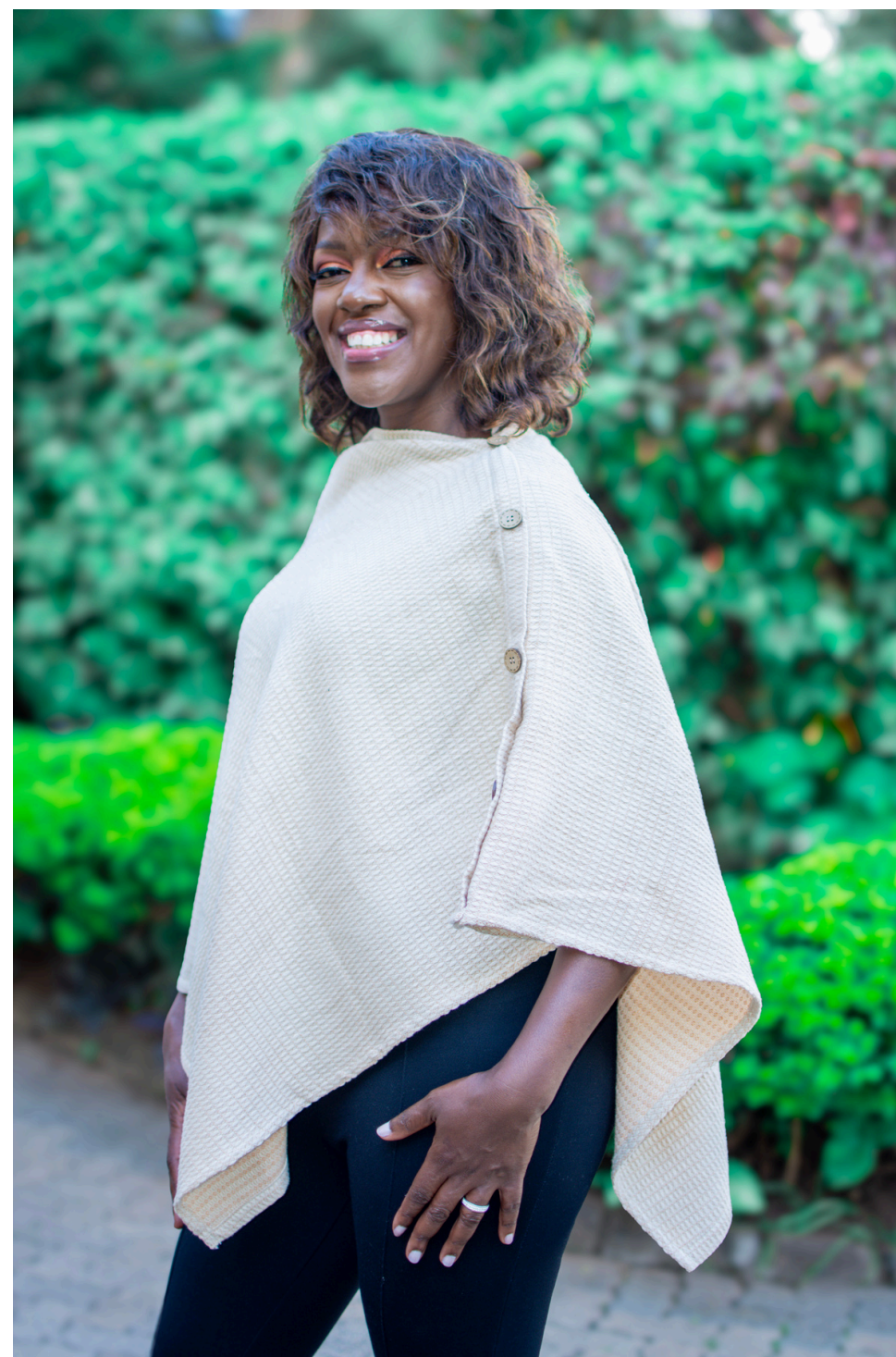
MADE FROM OUR FABRIC BY AFROCESSORIES CO,