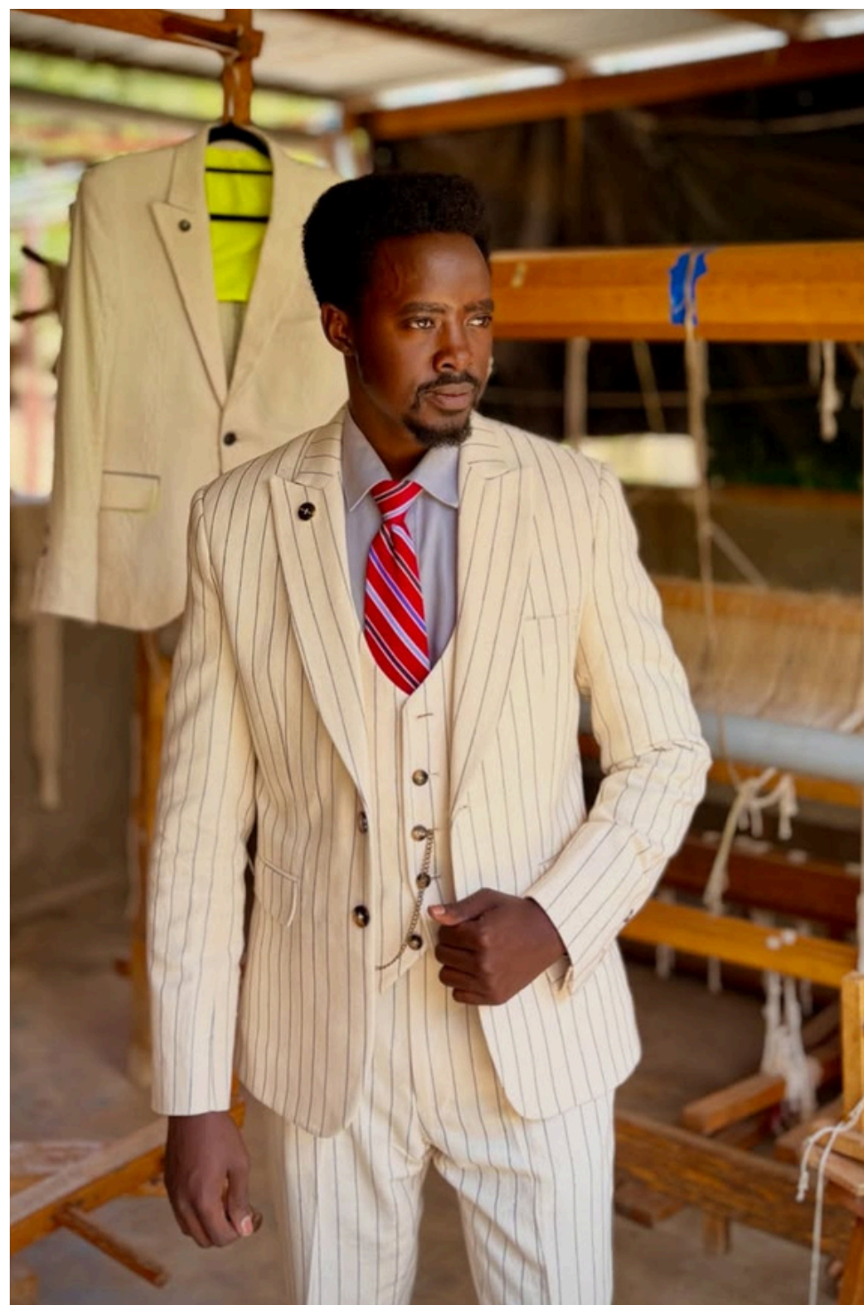
MADE FROM OUR FABRIC BY MIKEMWA CO.