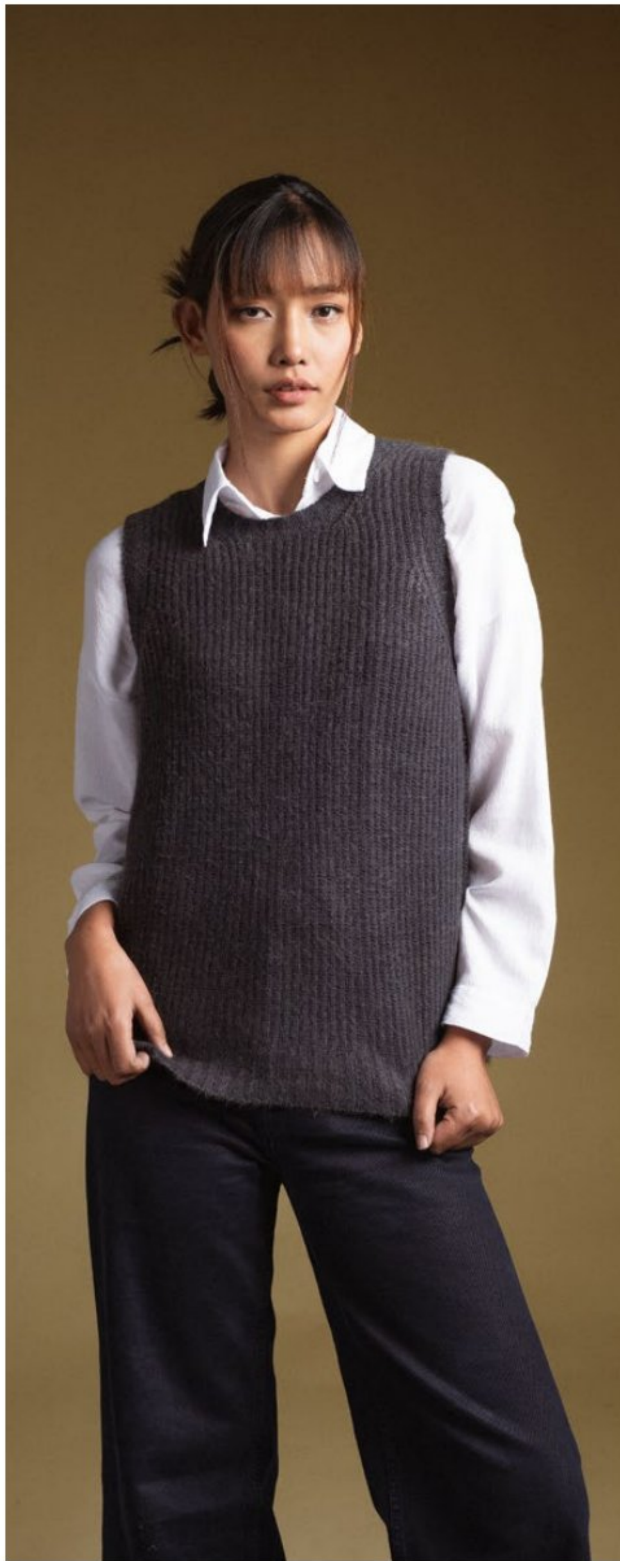
LAXMI Ribbed Sleeveless Top 100% Nepali Cashmere Indigo