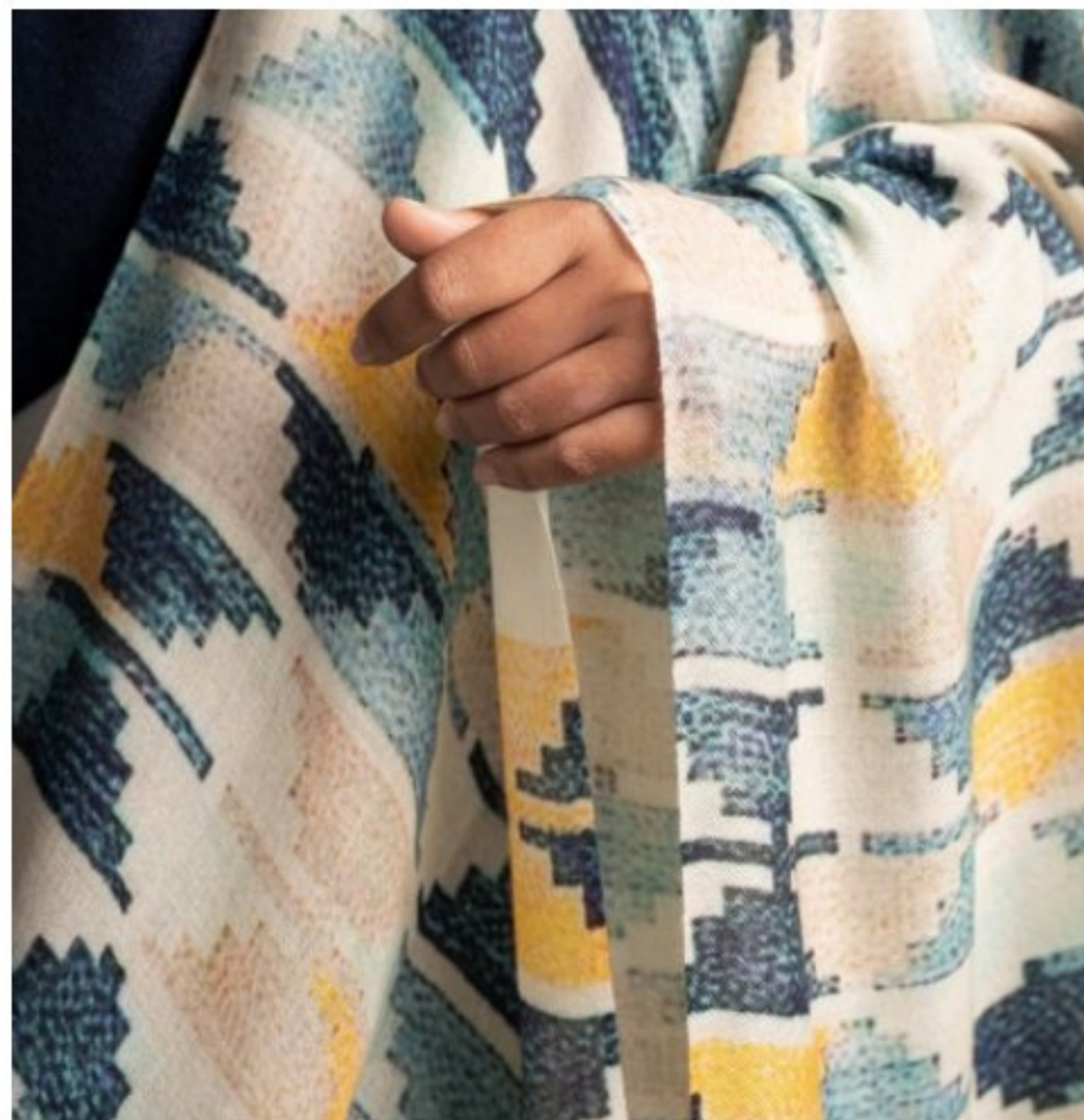
HIRA Lightweight Printed Scarf 100% Nepali Cashmere 70cm × 200cm