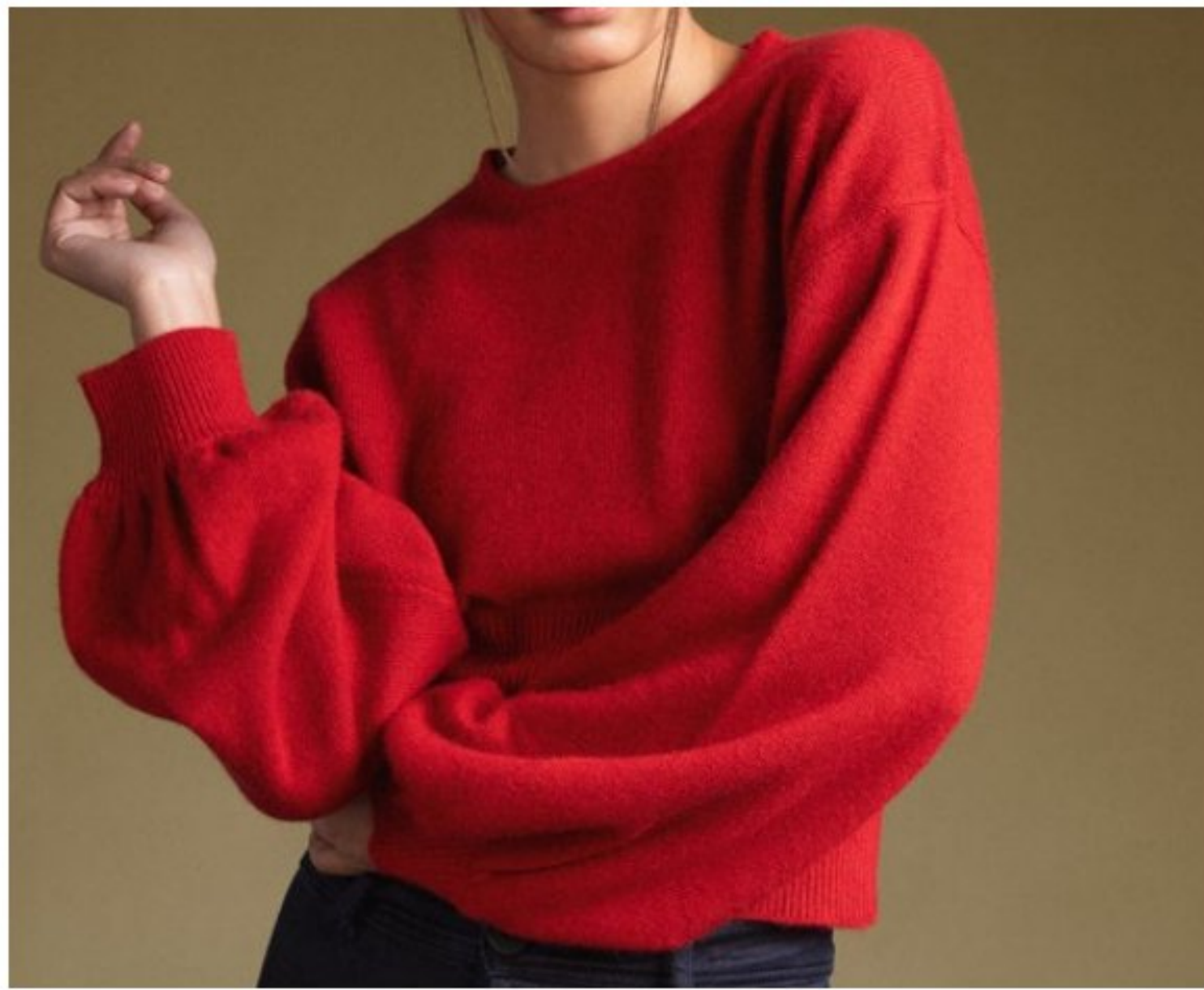
PL2606 Balloon Sleeved Sweater 100% Nepali Cashmere Red