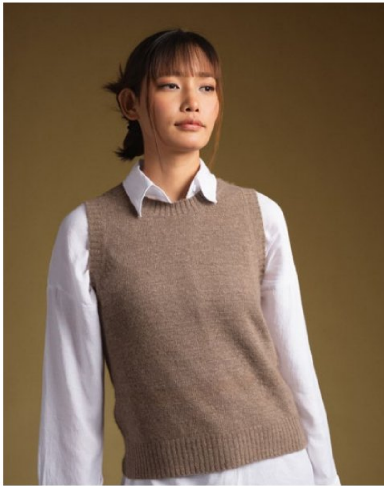
RICHA Sleeveless Top 100% Nepali Cashmere Natural Brown