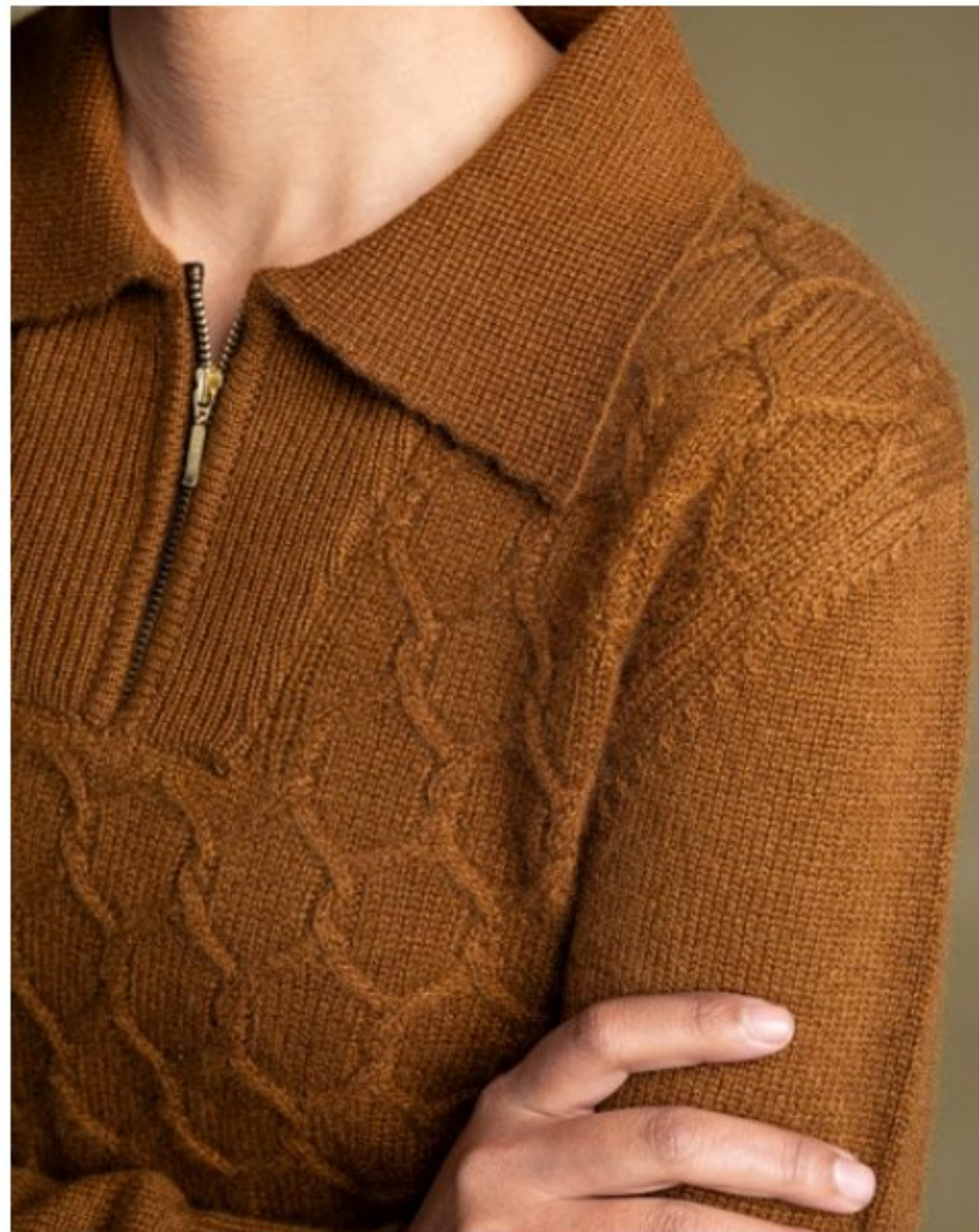
PL2607 Short Jacket 100% Nepali Cashmere Fondant