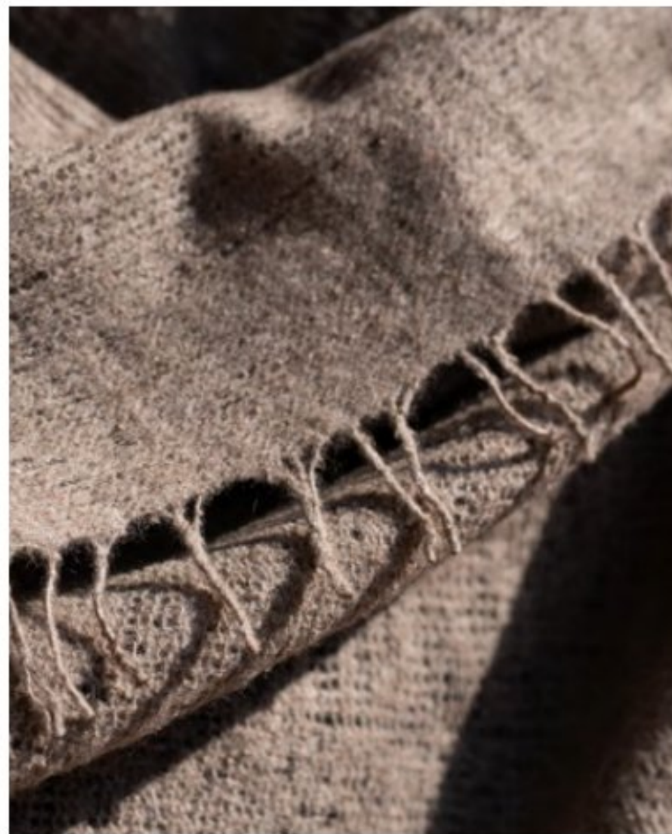
AIRA Rustic Northern Lights 100% Nepali Cashmere 90cm × 200cm