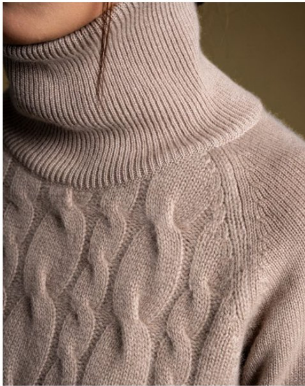
PL2603 Cable Turtleneck 100% Nepali Cashmere Beige