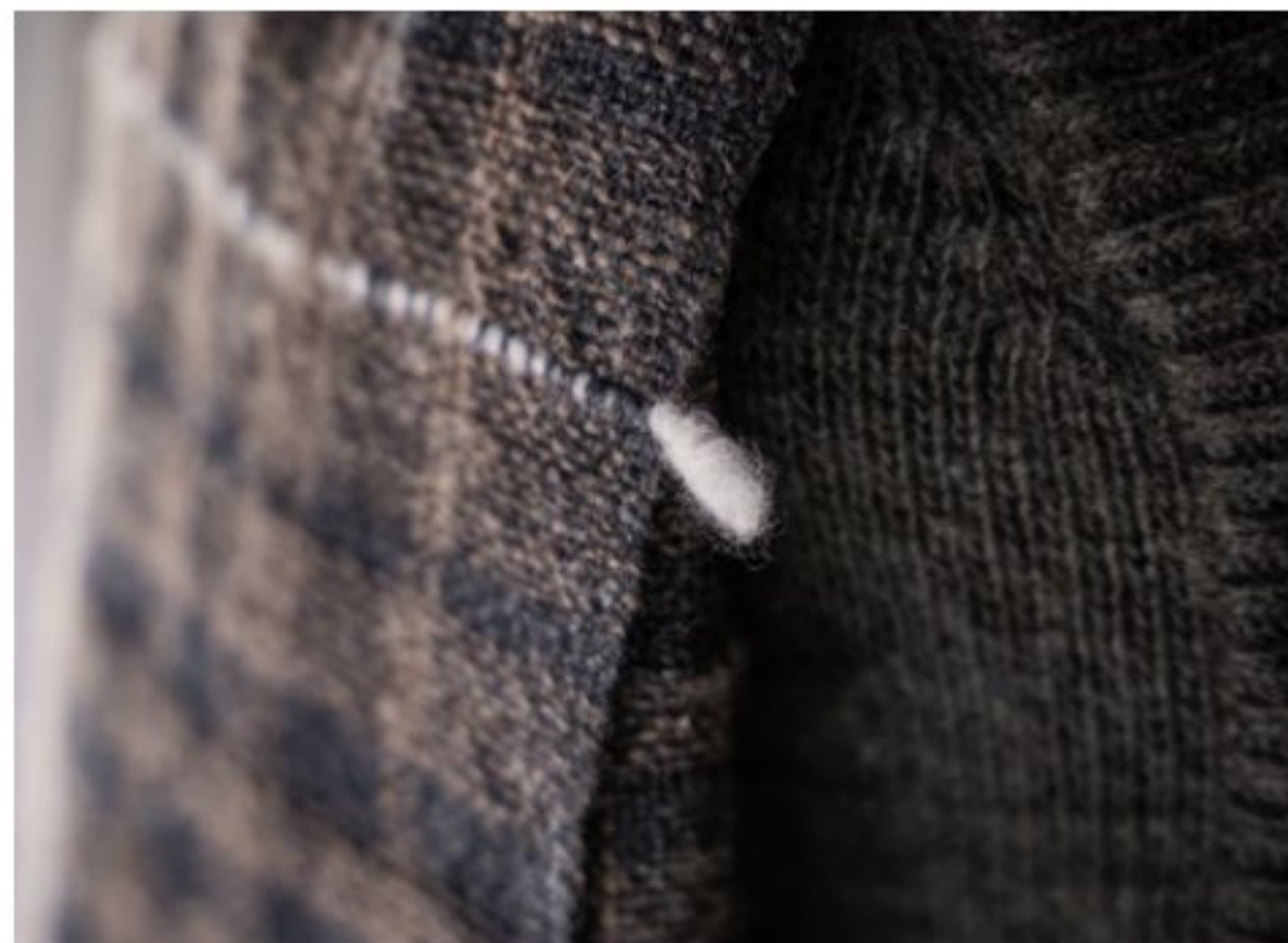
TYLA 100% Nepali Cashmere Ink Northern Lights 90cm × 200cm