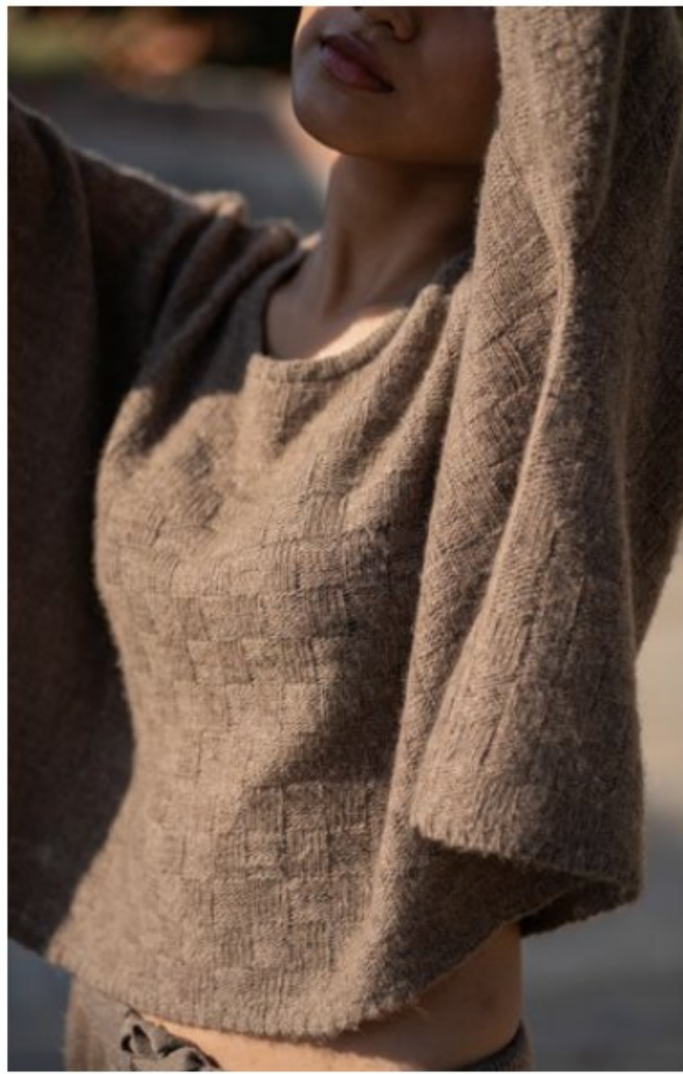
DIYA Boxy Pattern Boxy Sweater 100% Nepali Cashmere Natural Brown