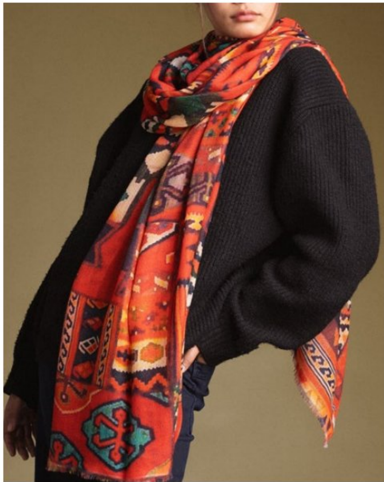
MUSTANG Lightweight Printed Scarf 100% Nepali Cashmere 70cm × 200cm