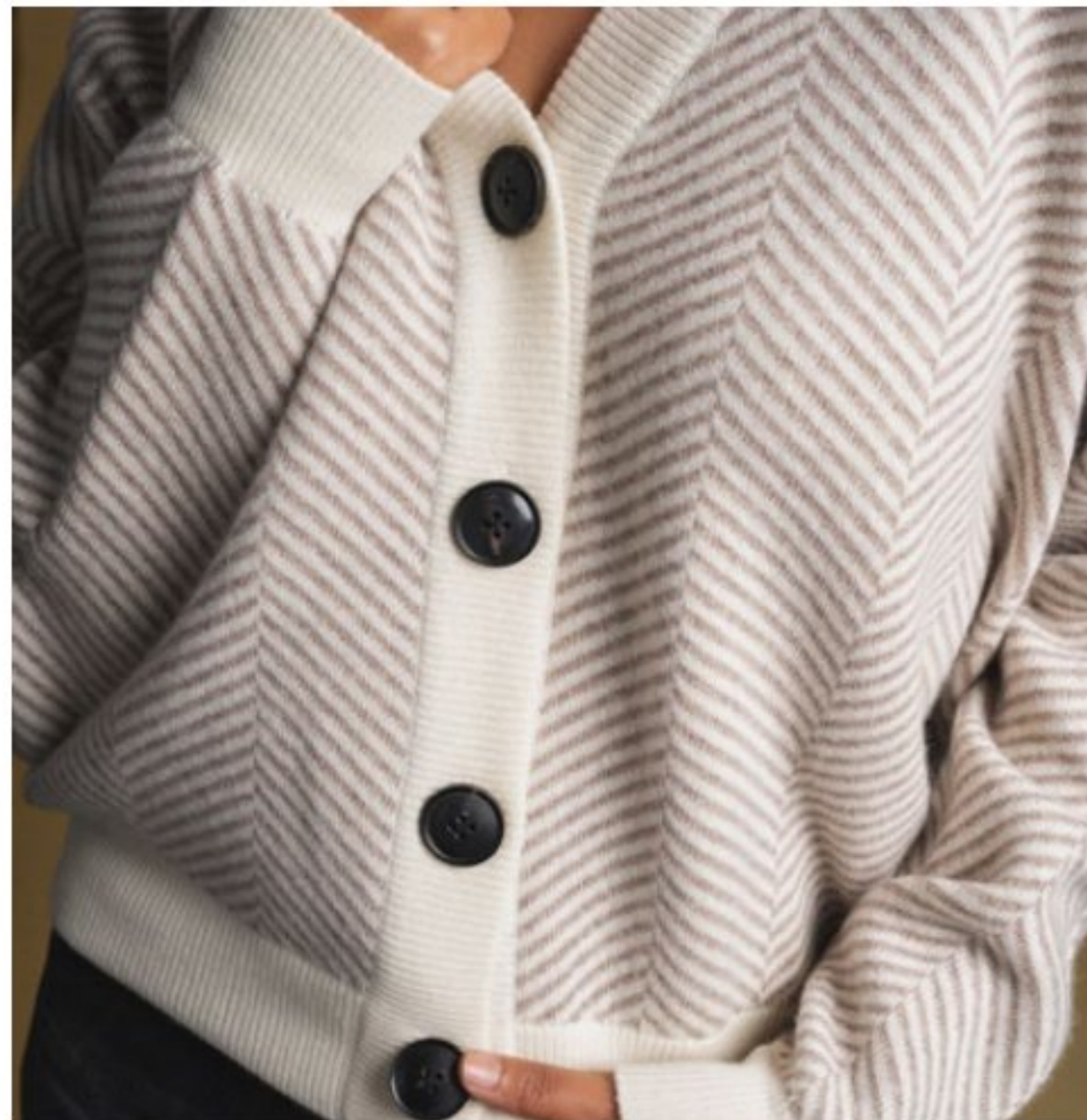
PL2605 Sweater with Colorblocks 100% Nepali Cashmere Cloud/Grey/Beige