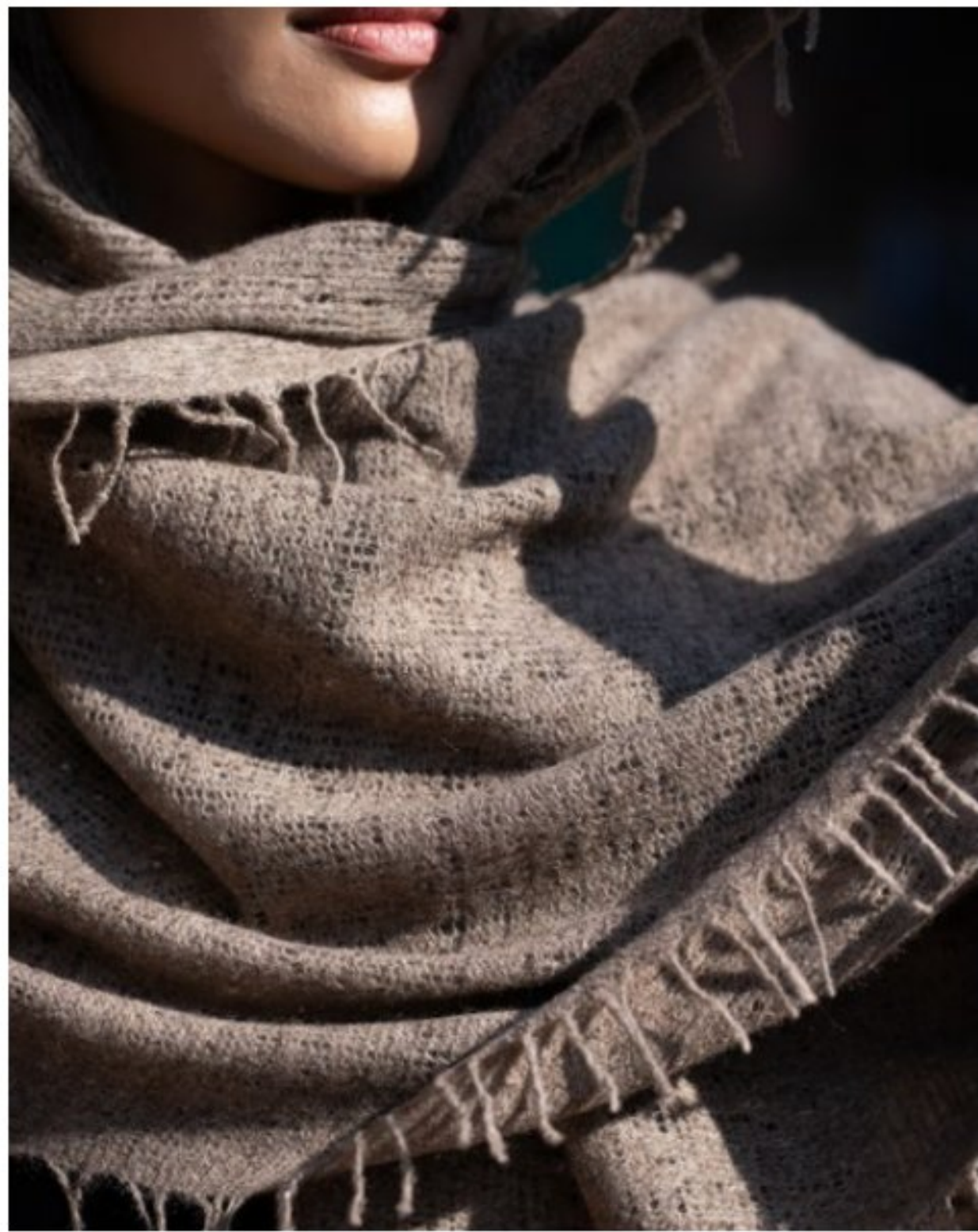
RANJITA Felted Scarf 100% Nepali Cashmere Natural Brown 70cm × 200cm