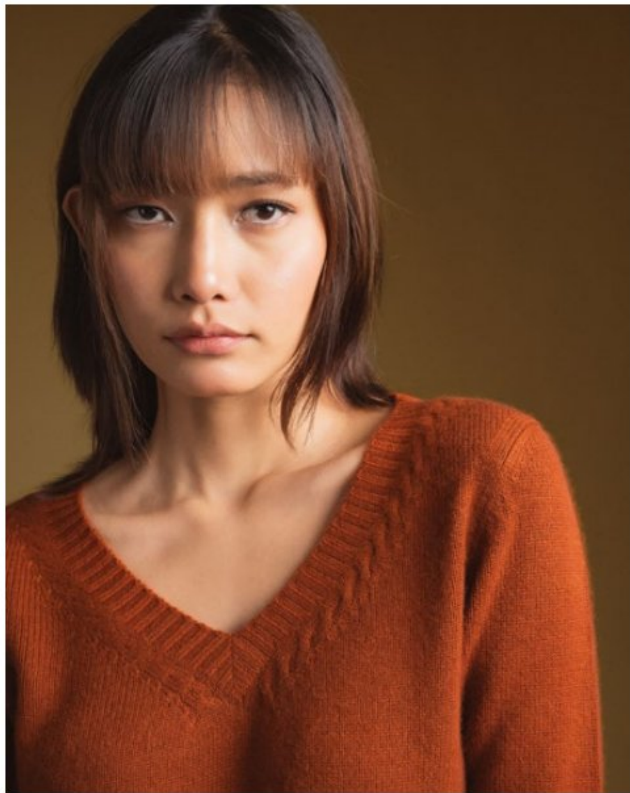
PL2601 Cable Trim V-neck Sweater 100% Nepali Cashmere Rust