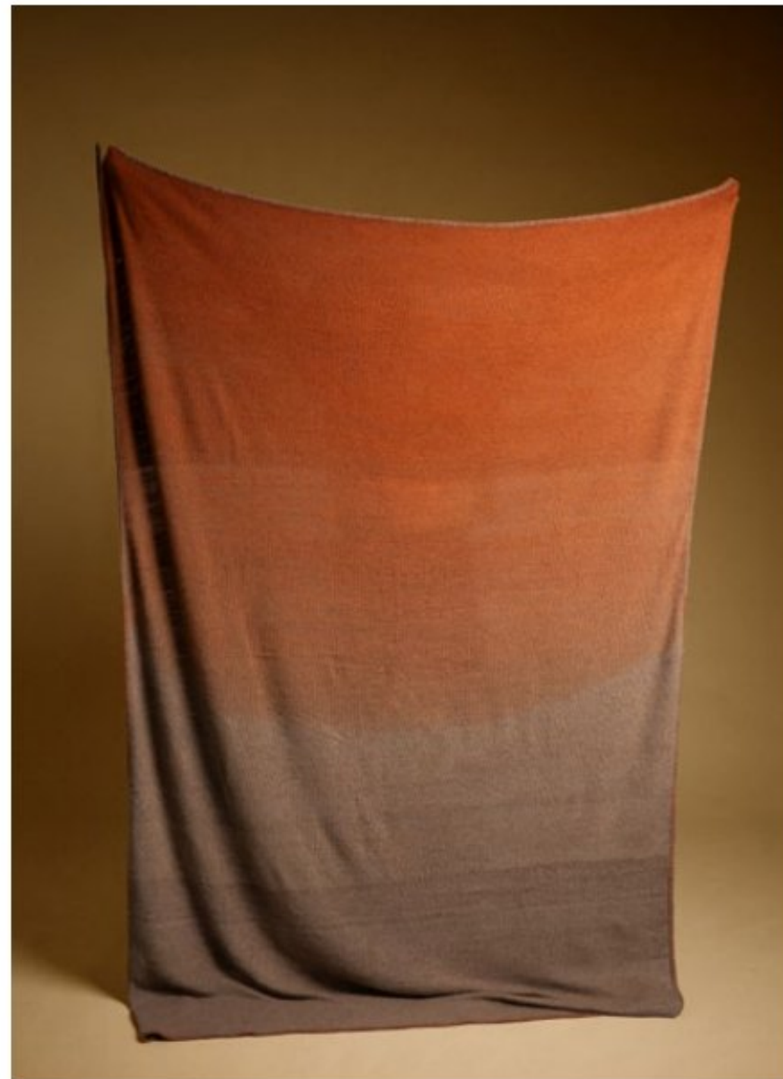
ARTI Striped Trim Throw 100% Nepali Cashmere Natural Brown/Fondant 90cm × 200cm