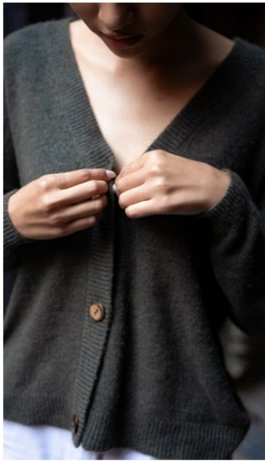
ANAYA Short Cardigan 100% Nepali Cashmere Olive, Vegetable Dye