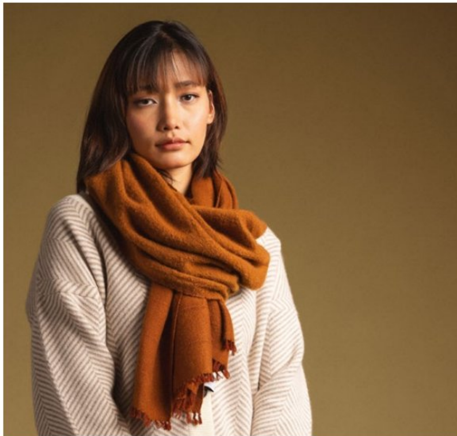
PUJA Scarf - Stripped Edges 100% Handspun Cashmere Mustard 55cm × 200cm