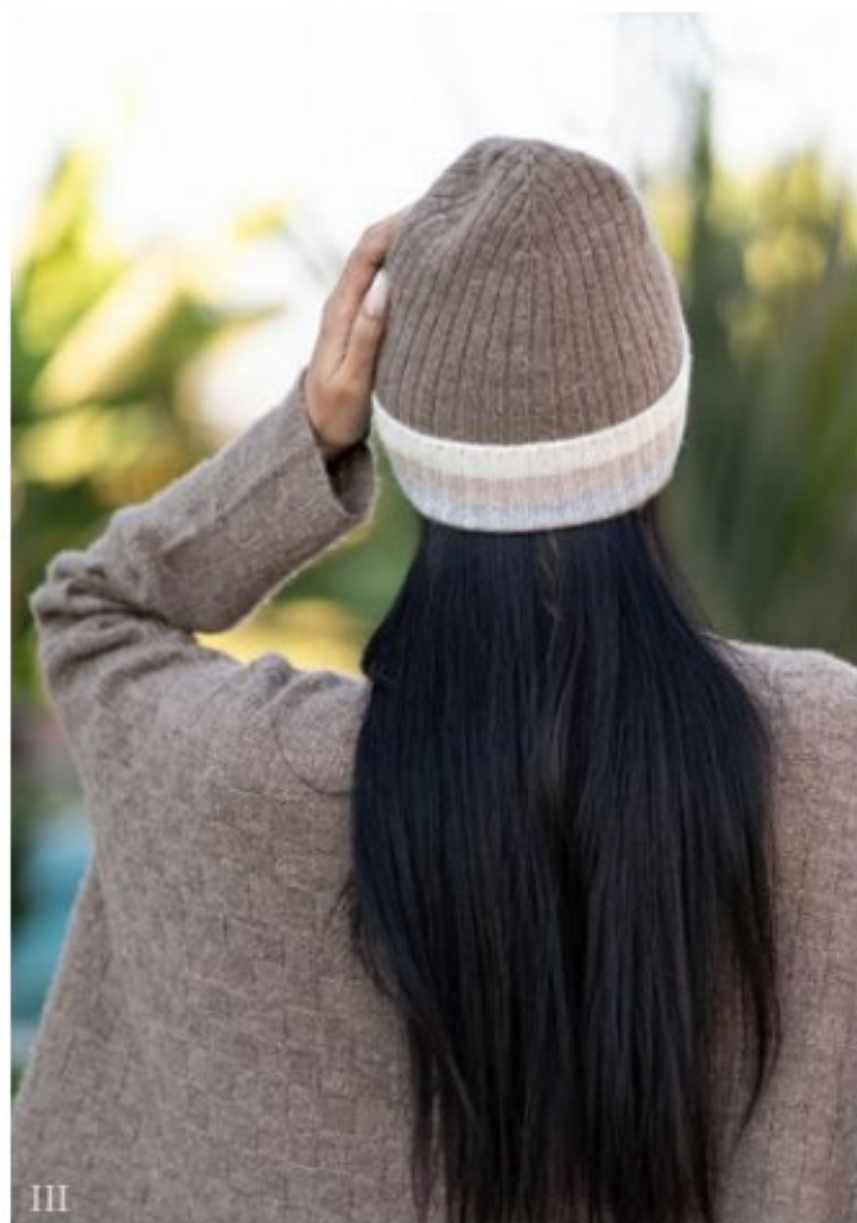
PARU Beanie I, II and III 100% Nepali Cashmere Natural Brown