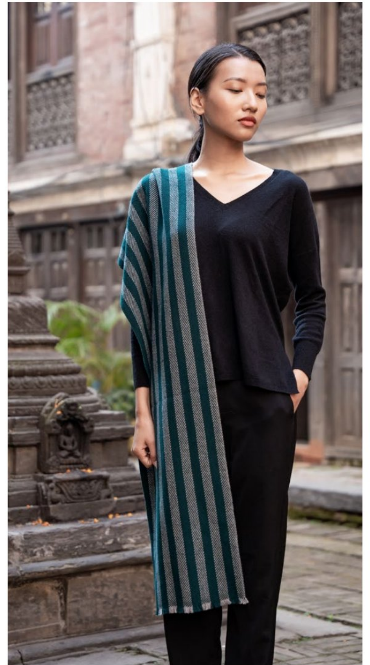
ANITA Herringbone Scarf 100% Nepali Cashmere Green/Grey 45cm × 180cm