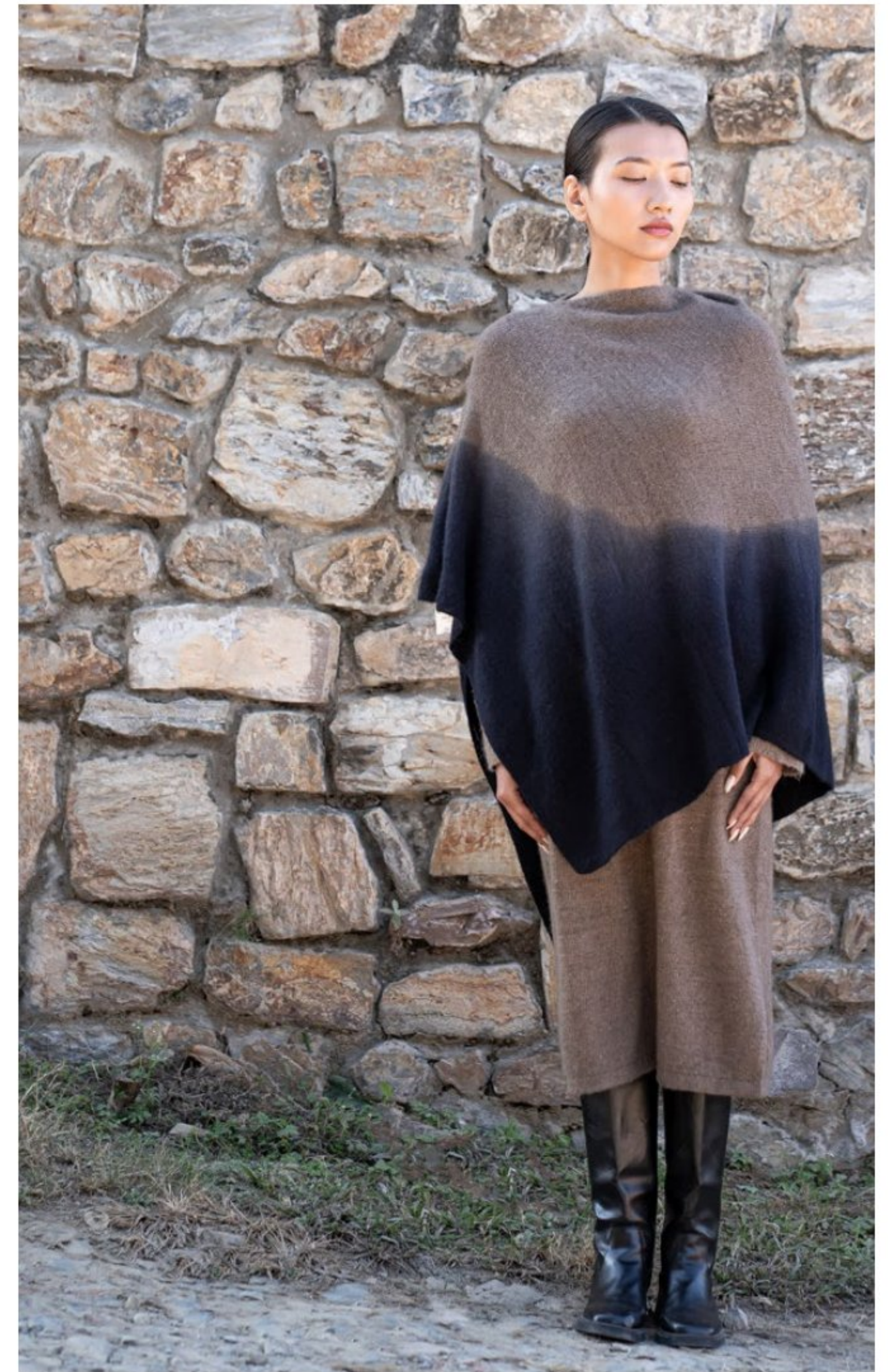
KAMALA Dip-dyed Poncho 100% Nepali Cashmere Natural Brown/Indigo