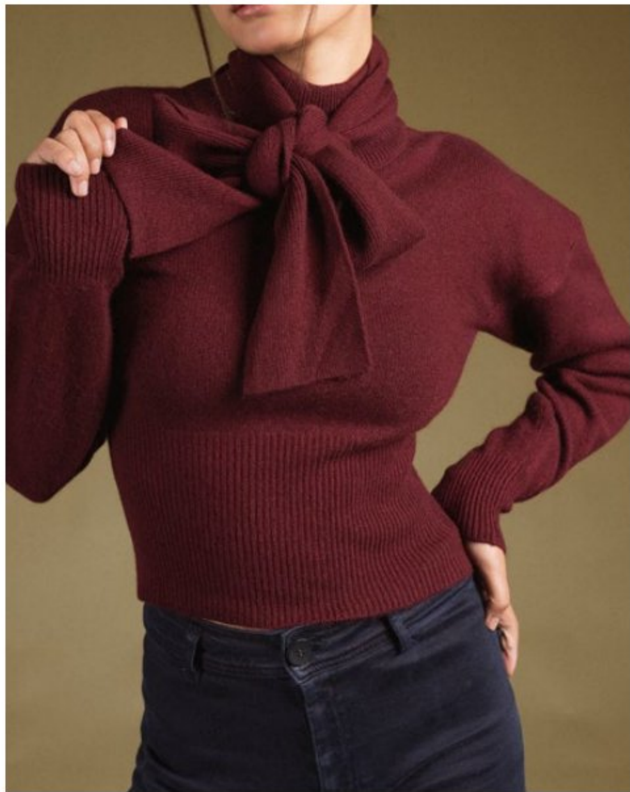
PL2609 Ribbon Detailed Turtleneck 100% Nepali Cashmere Port