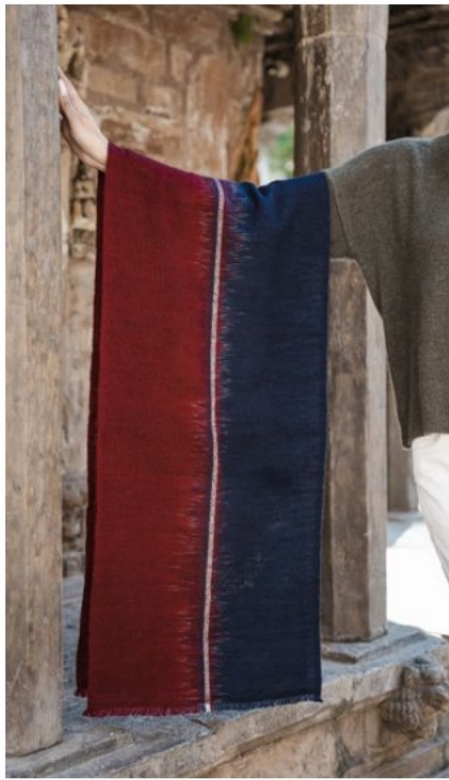
SONI Colorblock Scarf 100% Nepali Cashmere Port/Indigo, Vegetable Dye 40cm × 180cm