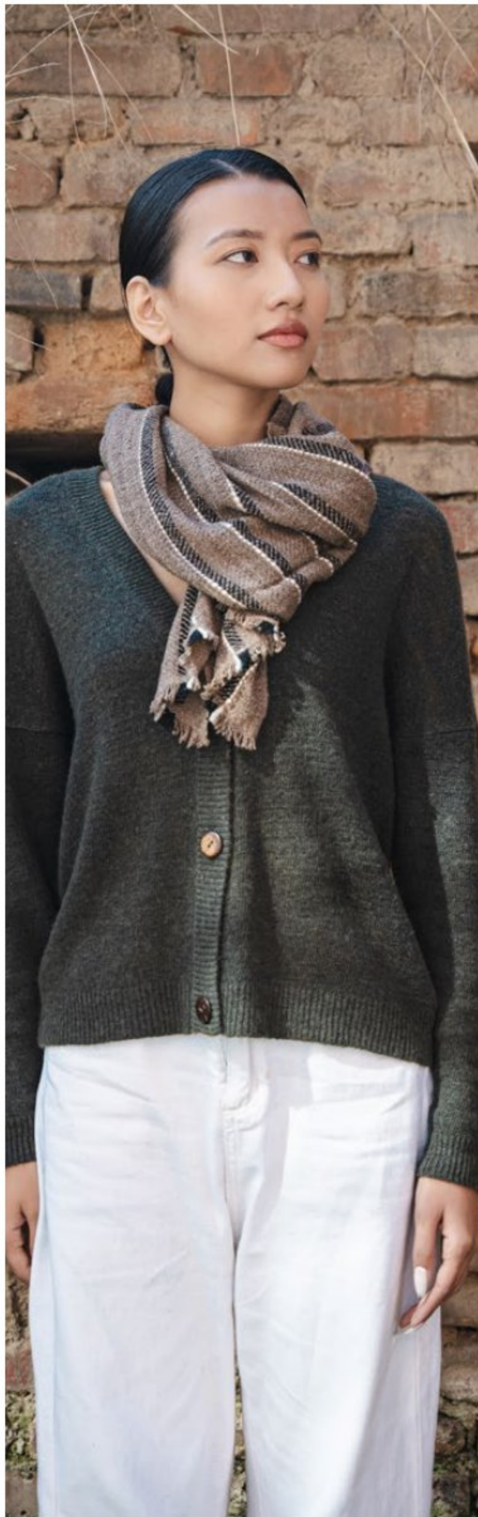
SURYA Vertical Striped Scarf 100% Nepali Cashmere Brown/Black 40cm × 180cm