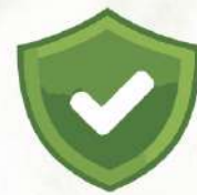
Certified & Traceable