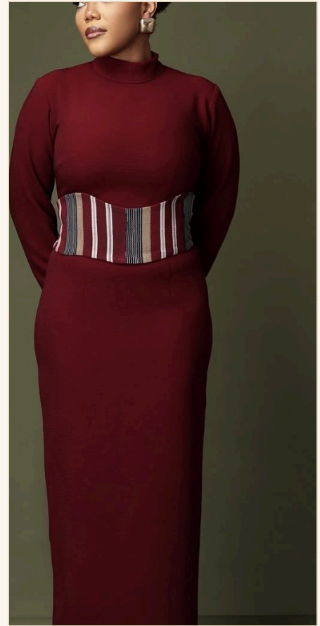
Contemporary tailoring met with indigenous Nigerian weaving – heritage craft, modern silhouette.

Home to aso-oke, Ankara, Adire and globally celebrated designers, with Lagos a rising fashion capital – skilled pattern-cutters and a fashion-literate workforce, not a blank slate.