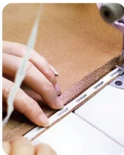
add special tape