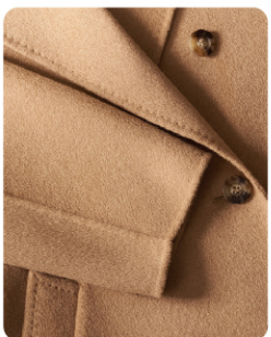
front and sleeve