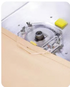
open the fabric by machine