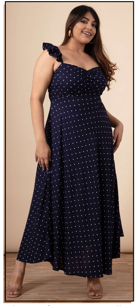
Fabric: 30's viscose in polka dot