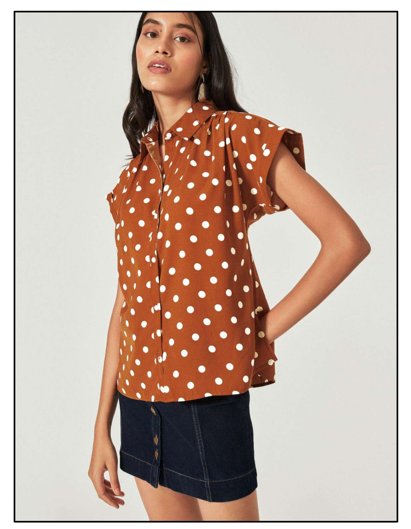
Fabric: BSY Fabric