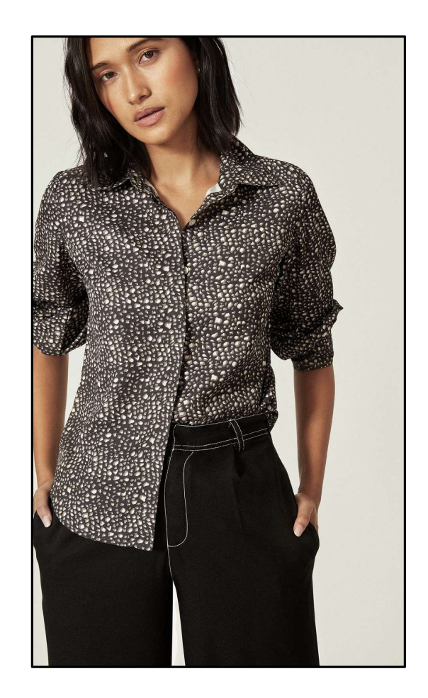
Style: Animal Printed Shirt