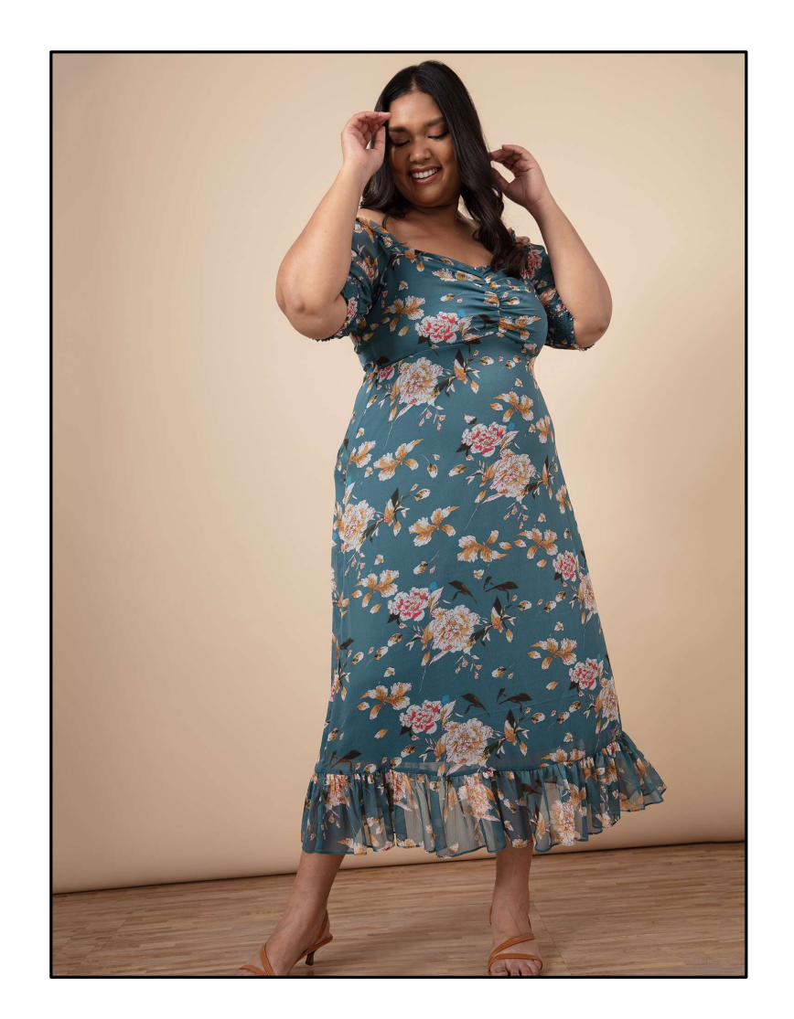
Fabric: Chiffon Maxi dress with Lining