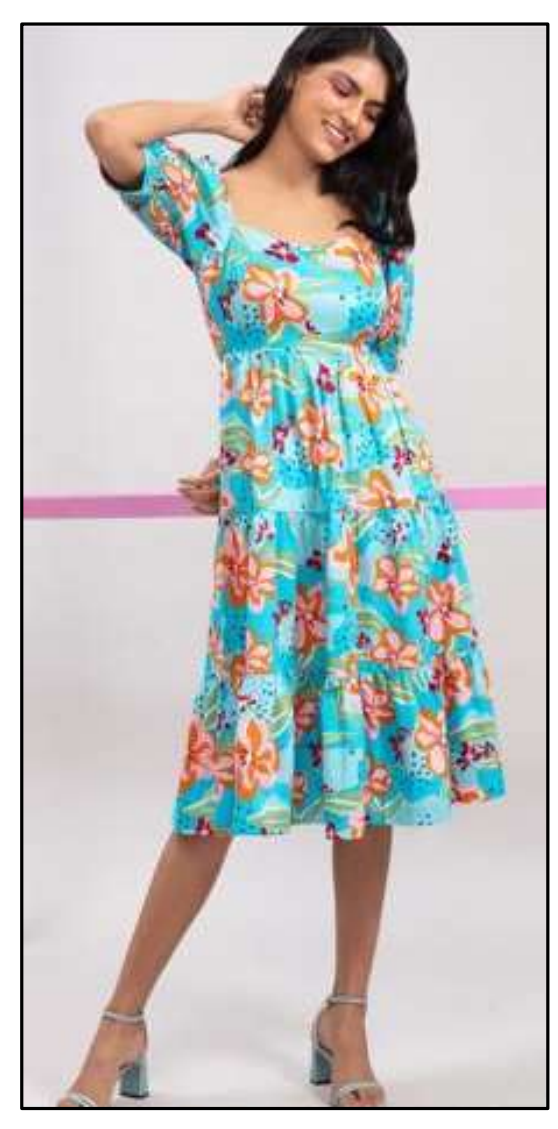
Fabric: Printed Cotton Satin