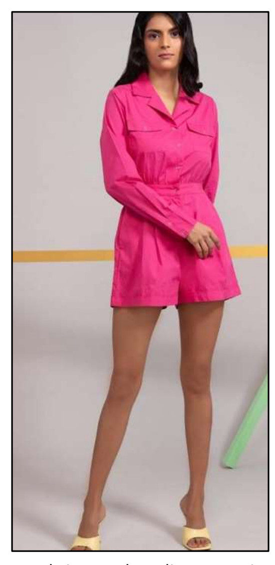
Fabric: Dyed Poplin Jumpsuit