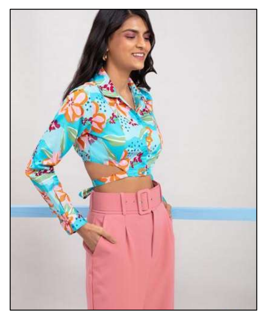
Fabric: Printed Cotton Satin Crop Shirt