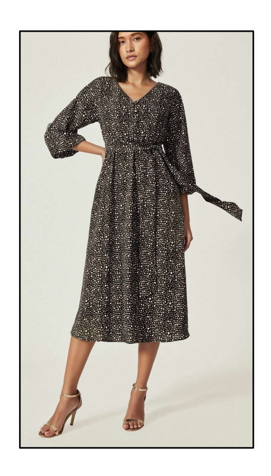
Style: Cinched Dress with Separate