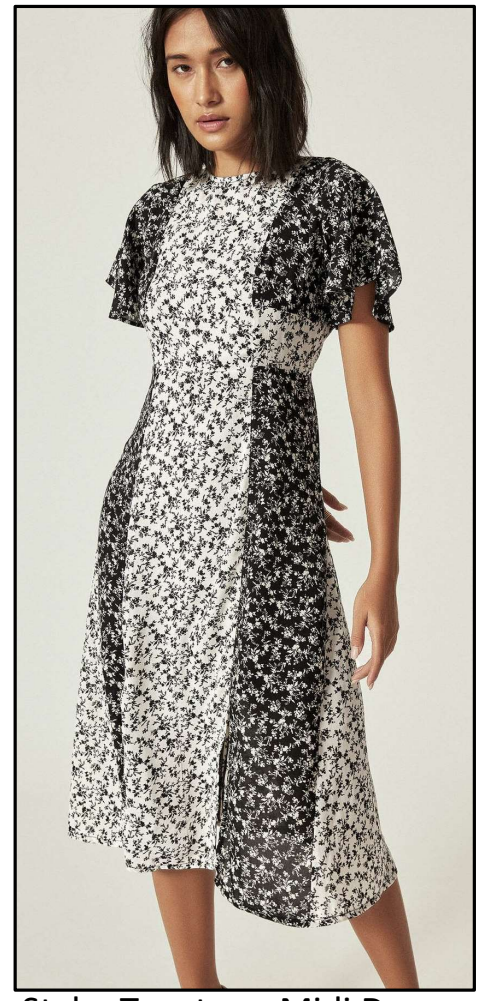
Style: Two tone Midi Dress with