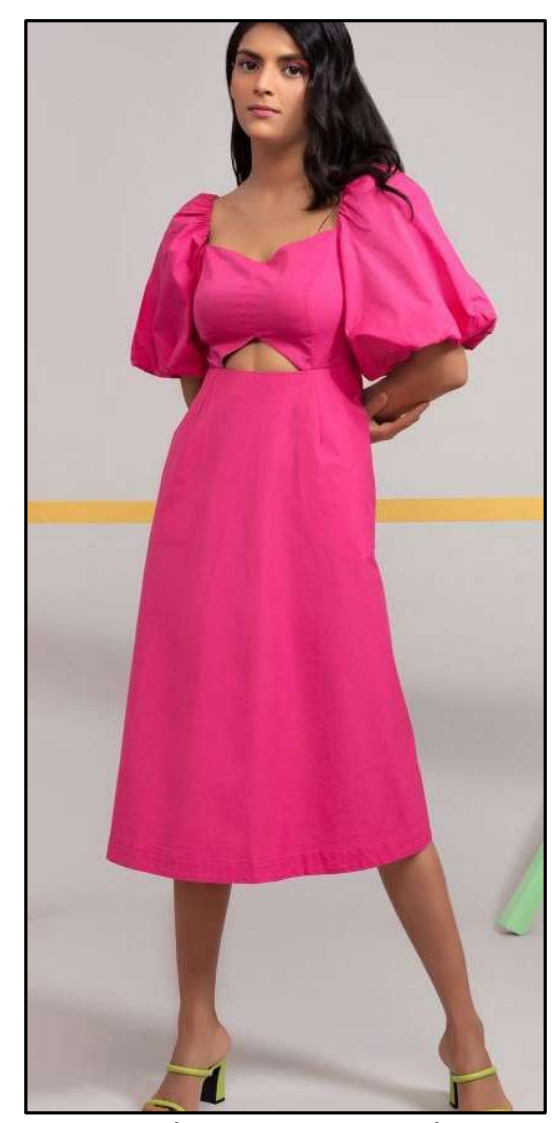
Fabric: Cotton Poplin