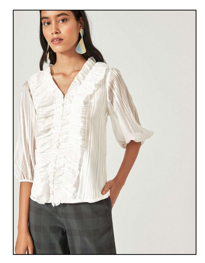
Fabric: Georgette Lurex