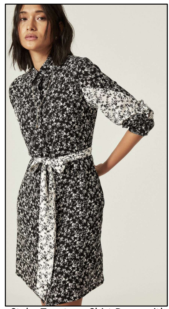
Style: Two tone Shirt Dress with