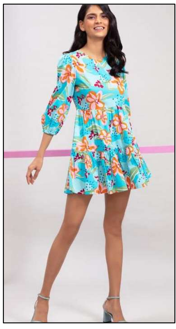
Fabric: Printed Cotton Satin