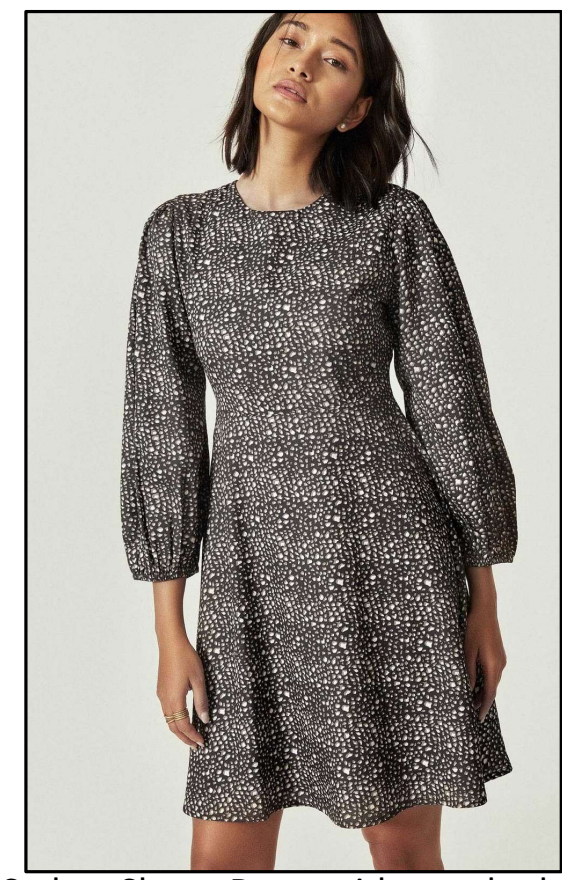
Style: : Skater Dress with attached