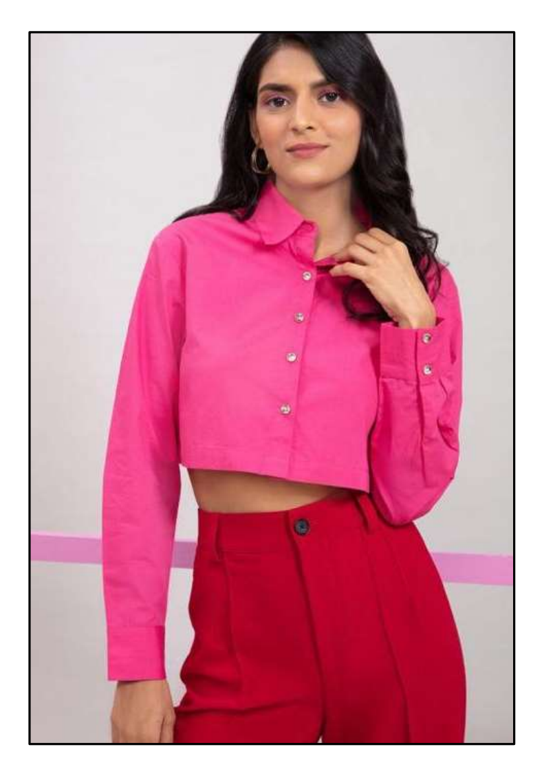
Fabric: Dyed Poplin Crop Shirt