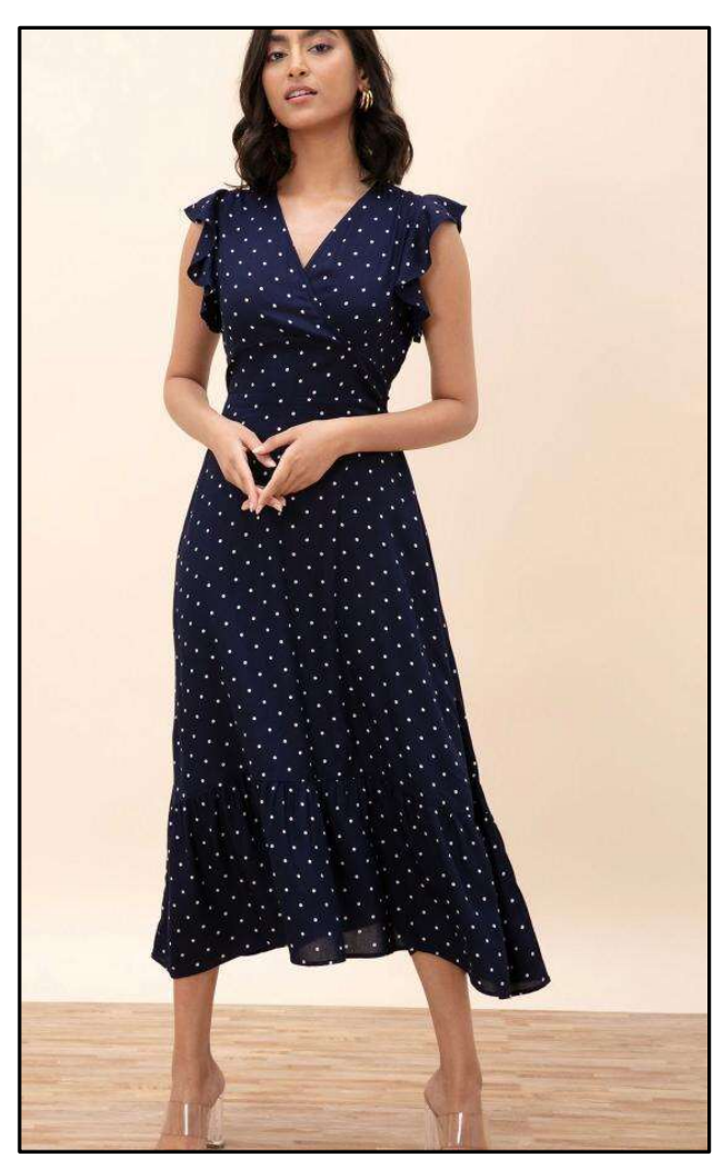
Fabric: 30's viscose in polka dot