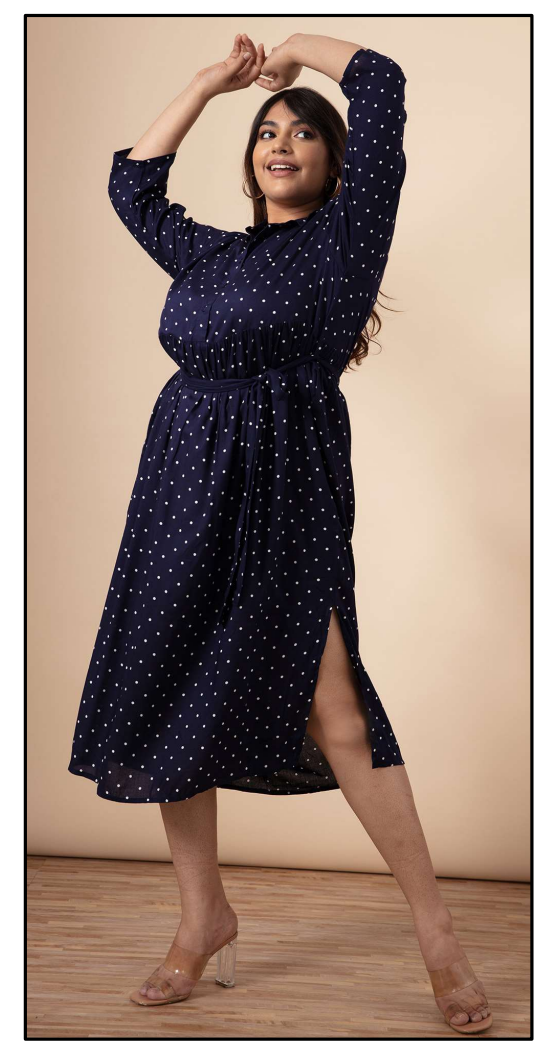
Fabric: 30's viscose in polka dot