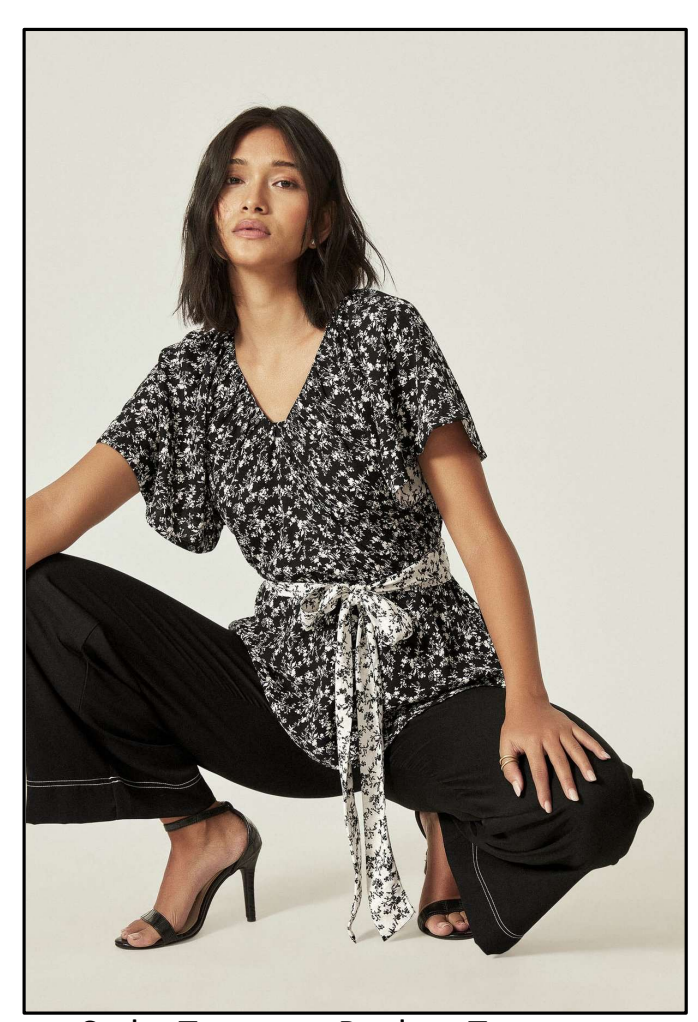
Style: Two tone Peplum Top Fabric: Summer Cool Georgette