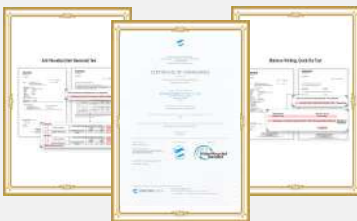
Anti-Bacterial Fabric Test Report GRS Dry Fit Fabric Test Report