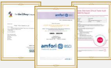
Disney FAMA BSCI SEDEX