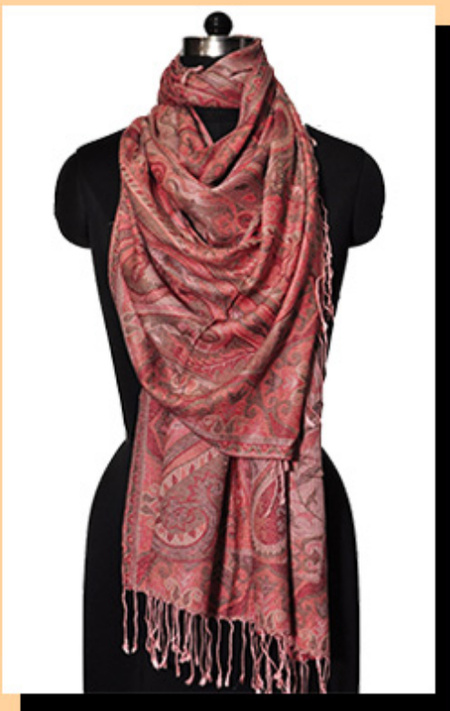
SLIK MODAL JACQUARD STOLE & SCARFS