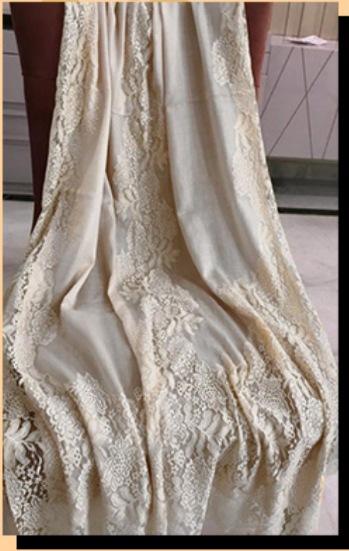
LACE SHAWLS & SCARFS