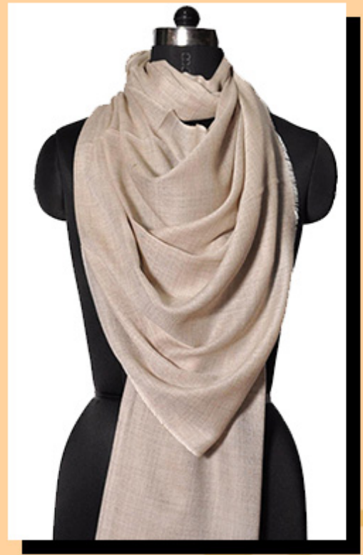
FINE WOOL PLAIN STOLES