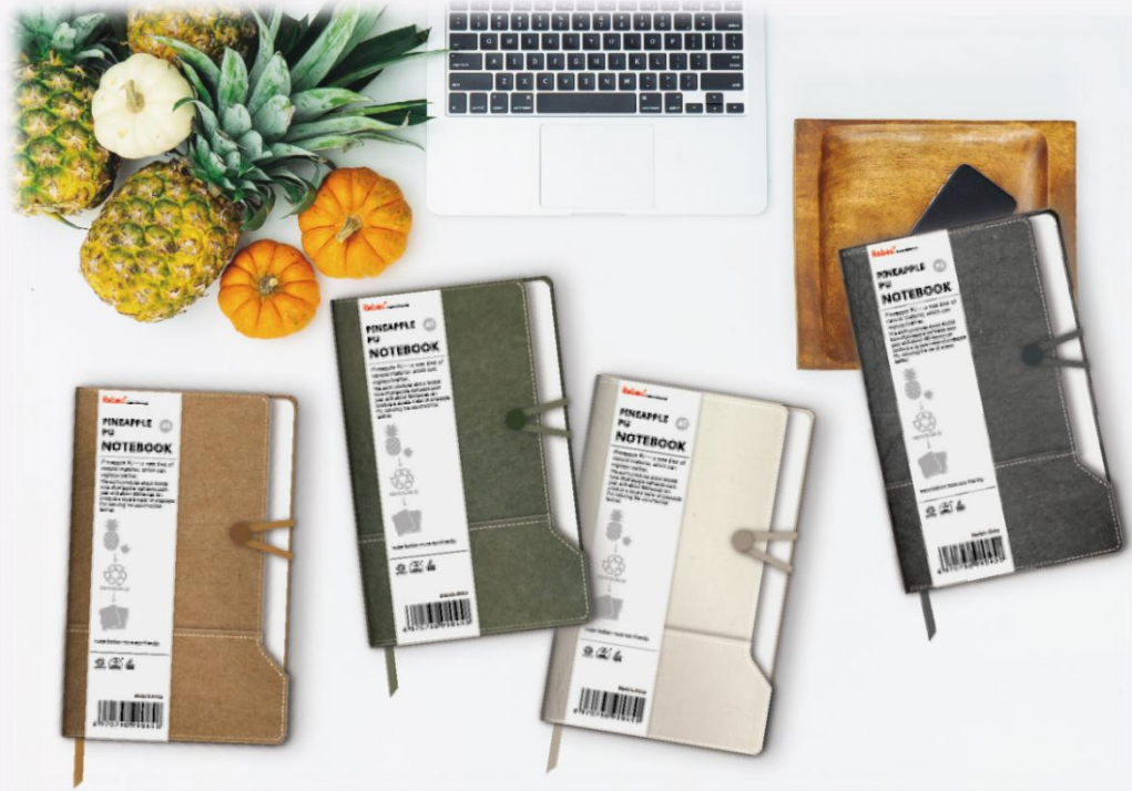
• Pineapple Bio-based leather •