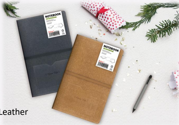
● Recycled Leather