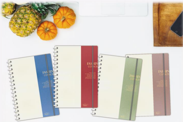
● Recycled Paper