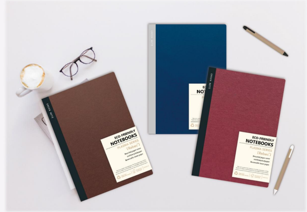
• Recycled Paper •