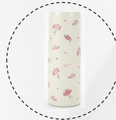
Heart Transfer Printing