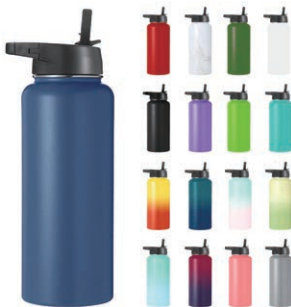
Model:RH-SB4 Capacity:12oz/18oz/22oz/25oz/32oz Size(cm):7.4*21/7.7*26.5/9*26/90*290