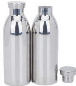
Model:SS5 Capacity:500ml Size(cm):7.0*21.0