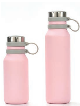
Model:RH-SB22 Capacity:500ml/750ml Size(cm):7*20/7.5*27