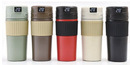
Model:RH-SS501/RH-SS502 Capacity:400ml /480ml Size(cm):6.8*7.8*19.0/6.8*7.8*21.0