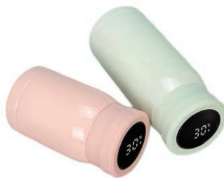
Model:RH-SS801/RH-SS802/RH-SS803 Capacity:220ml/350ml/420ml Size(cm):6.5*12.5/6.5*16.5/6.5*21.0