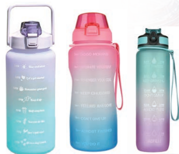
Model:RH-P601 Capacity:2L Size(cm):11*29