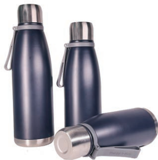
Model:SS7 Capacity:650ml/850ml/1100ml Size(cm):7.8*25/7.8*30.5/8.7*31.0