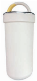
Model:RH-SB19 Capacity:420ml Size(cm):7*20.5