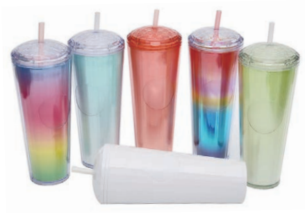
Model:RH-P301 Capacity:750ml/24oz Size(cm):10.3*6.5*23.5