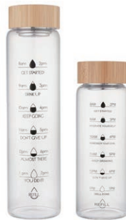
Model:RH-G501 Capacity:1000ml / 700ml Size(cm):7.8*29