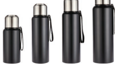
Model:SS8 Capacity:500ml/800ml/1000ml/1500ml Size(cm):7.8*20.7/7.8*28.0/8.8*30.5/9.5*34.5