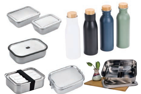
Model:SS9 We have more.....