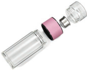
Model:RH-G101 Capacity:450ml Size(cm):23*6.5