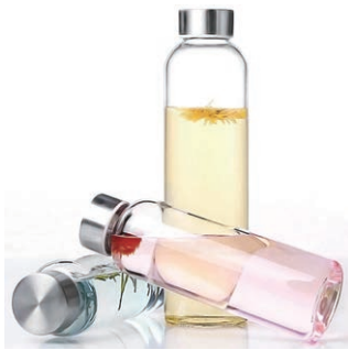
Model:RH-G401 Capacity:1000ml Size(cm):7.8*28.5