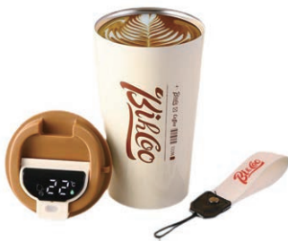
Model:RH-SS701 Capacity:510ml Size(cm):6.9*17.8