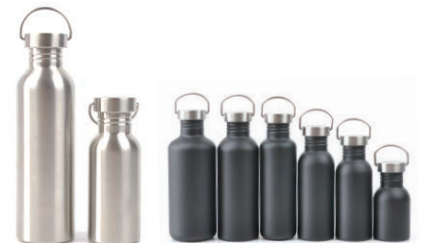
Model:RH-SB15 Capacity:1200ml/1000ml/800ml 650ml/500ml/350ml