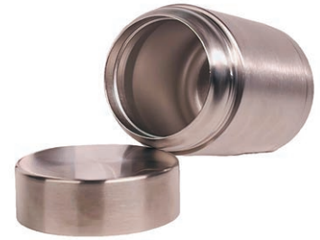
Model:SS3 Capacity:600ml Size(cm):9.5*15