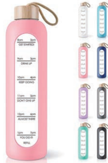
Model:RH-G201 Capacity:1L Size(cm):7.8*29.5