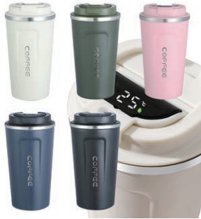
Model:RH-SS101/RH-SS102 Capacity:380ml/510ml Size(cm):6.9*14.8/6.9*16.8