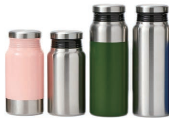
Model:RH-SB14 Capacity:400ml/600ml Size(cm):7.5*15.5/7.5*20.5