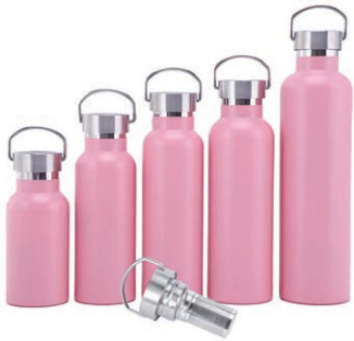
Model:SS1 Capacity:350ml/500ml/600ml/750ml/1000ml Size(cm):7.3*16.5/7.3*21/7.3*25/7.5*24/8.3*30.5