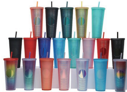
Model:RH-P201/RH-P202 Capacity:480ml/16oz/710ml/24oz Size(cm):10.3*7.0*16.5/10.6*6.9*22.8