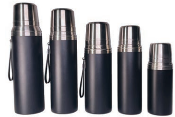
Model:SS6 Capacity:1100ml/900ml/700ml/500ml Size(cm):8.5*32.5/8.5*28.0/7.5*27.0/7.5*21.5