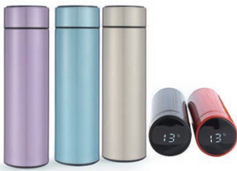
Model:RH-SS401 Capacity:500ml Size(cm):6.4*22.8