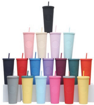
Model:RH-P101/RH-P102 Capacity:480ml/16oz/710ml/24oz Size(cm):10.3*6.9*15.9/10.3*6.9*20.5