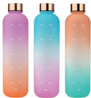
Model:RH-P501 Capacity:1L Size(cm):28.5*7.5