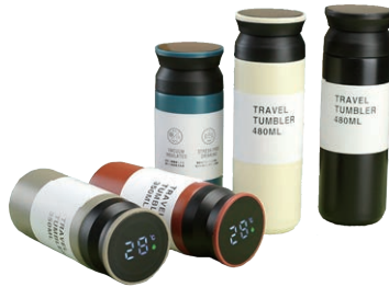
Model:RH-SS201/RH-SS202 Capacity:350ml/480ml Size(cm):6.8*20.0/6.8*24.3