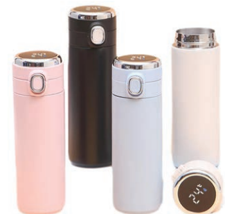
Model:RH-SS901/RH-SS902 Capacity:320ml/420ml Size(cm):6.5*16.0/6.5*19.0