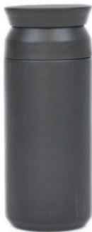
Model:RH-SB13 Capacity:350ml/500ml Size(cm):6.7*17.2/6.7*21