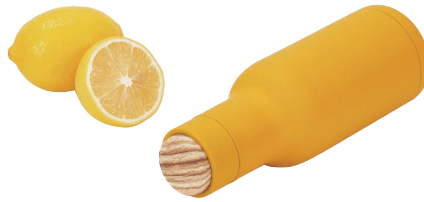
Model:RH-SB11 Capacity:350ml Size(cm):7*21