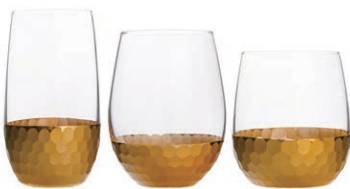
Model:RH-G701 Capacity:535ml/375ml/340ml Size(cm):7.3*4*12/6.3*4.5*13.2/7*5.5*9.5