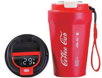
Model:RH-SS301 Capacity:390ml Size(cm):7.0*9.0*15.5