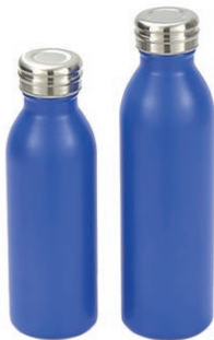
Model:RH-SB23 Capacity:450ml/600ml Size(cm):6.8*21.5/6.8*24.5