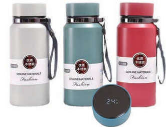
Model:RH-SS601/RH-SS602/RH-SS603 Capacity:600ml/800ml/1000ml Size(cm):8.4*21/8.4*26.0/8.4*32.0