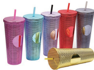
Model:RH-P401 Capacity:750ml/26oz Size(cm):10.3*6.5*22.8