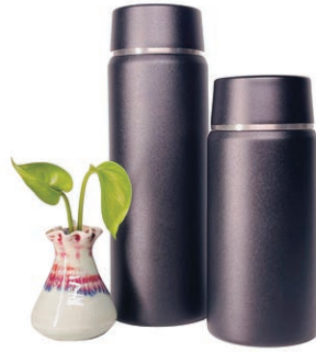
Model:SS2 Capacity:500ml/350ml Size(cm):9.8*23.5/9.5*15