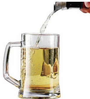
Model:RH-G801 Capacity:650ml Size(cm):9.2*9.2*15.4