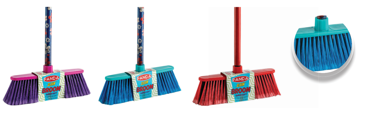
Packing: 12 pcs